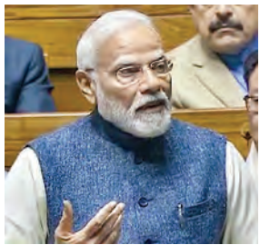
PM Modi speaks in the LS during the Budget session of Parliament, in New Delhi, Saturday.

Prime Minister Narendra Modi on Saturday said the five years of the 17th Lok Sabha was a period of reform, perform and transform with the country moving towards "big changes" at a fast pace. In his address in the Lok Sabha on the last day of the Budget session, Modi said that during the last five years, game-changing reforms were made in which a strong foundation of a 21st century India can be seen. "The country has moved towards big changes at a fast pace and all members of the House made an important contribution. Such works were completed for which people had waited for centuries," the prime minister said in the final session before the Lok