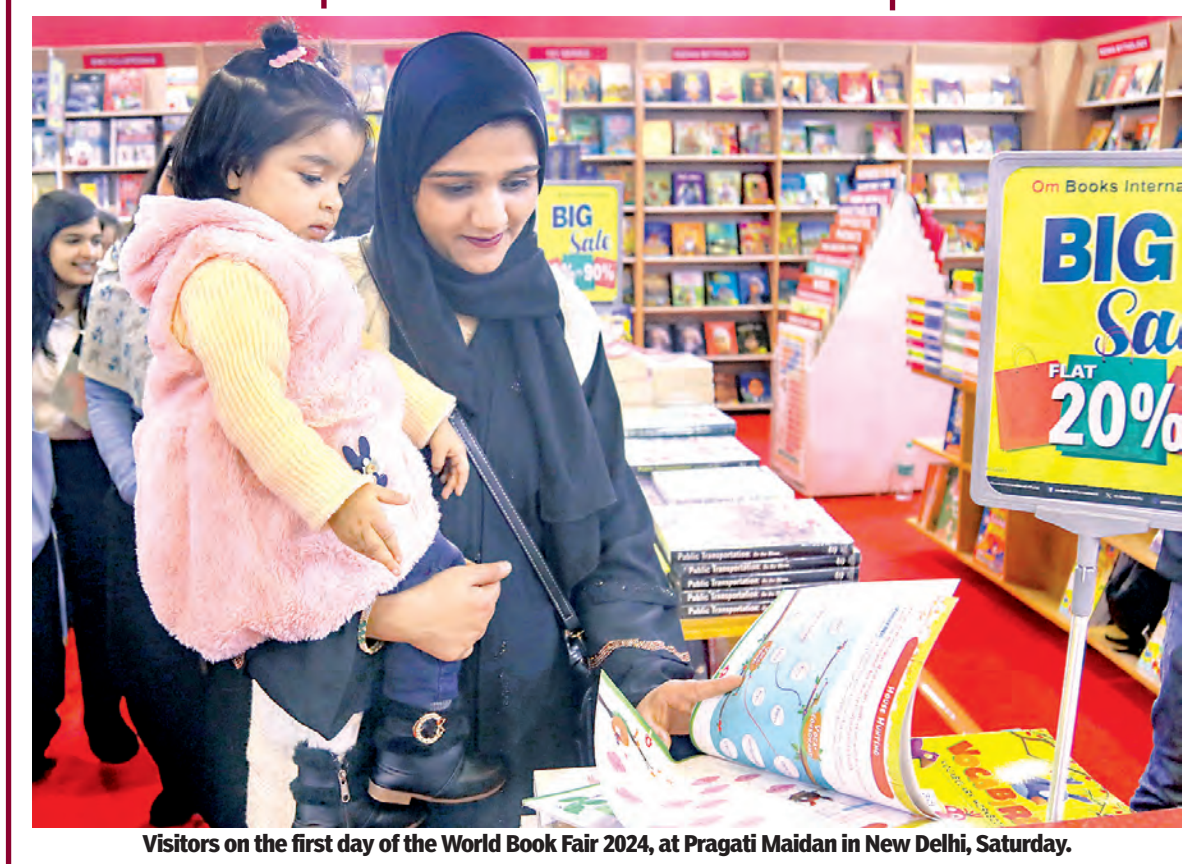
Visitors on the first day of the World Book Fair 2024, at Pragati Maidan in New Delhi, Saturday.