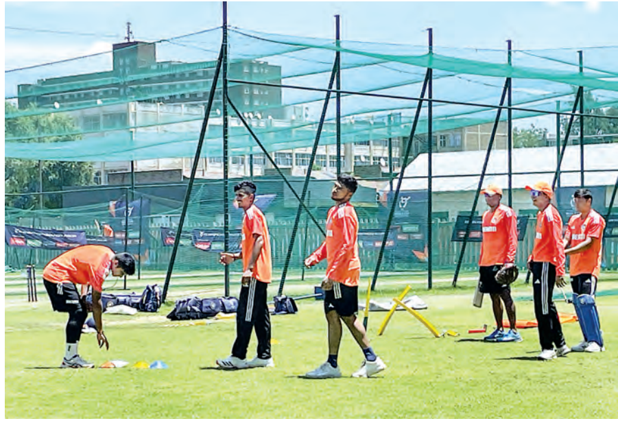
Indian team during a practice session ahead of the ICC Under-19 Cricket World Cup final, in Benoni, South Africa.