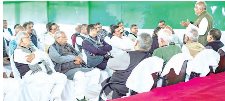
Bihar Minister Sharvan Kumar holds a meeting of JD(U) MLAs ahead of the floor test, in Patna, Saturday.