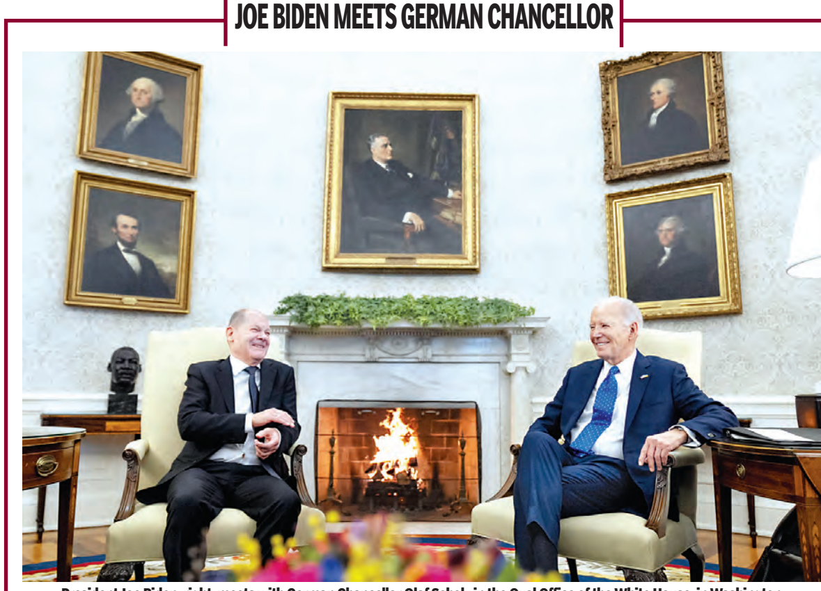
President Joe Biden, right, meets with German Chancellor Olaf Scholz in the Oval Office of the White House, in Washington.

He said PTI had emerged as a leading political force in the Centre, Khyber Pakhtunkhwa and Punjab, but efforts were underway to manipulate the results in the Centre and Punjab to establish governments of their choice.