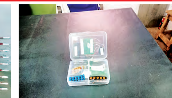
Central Chronicle News

Anwari, Feb 10: The Inspire Awards 2022-23 took place in Dhamtari district, drawing 377 participants from Balodabazar, Gariaband, and Dhamtari. Among the attendees, two standout models from Government Middle School Supela have