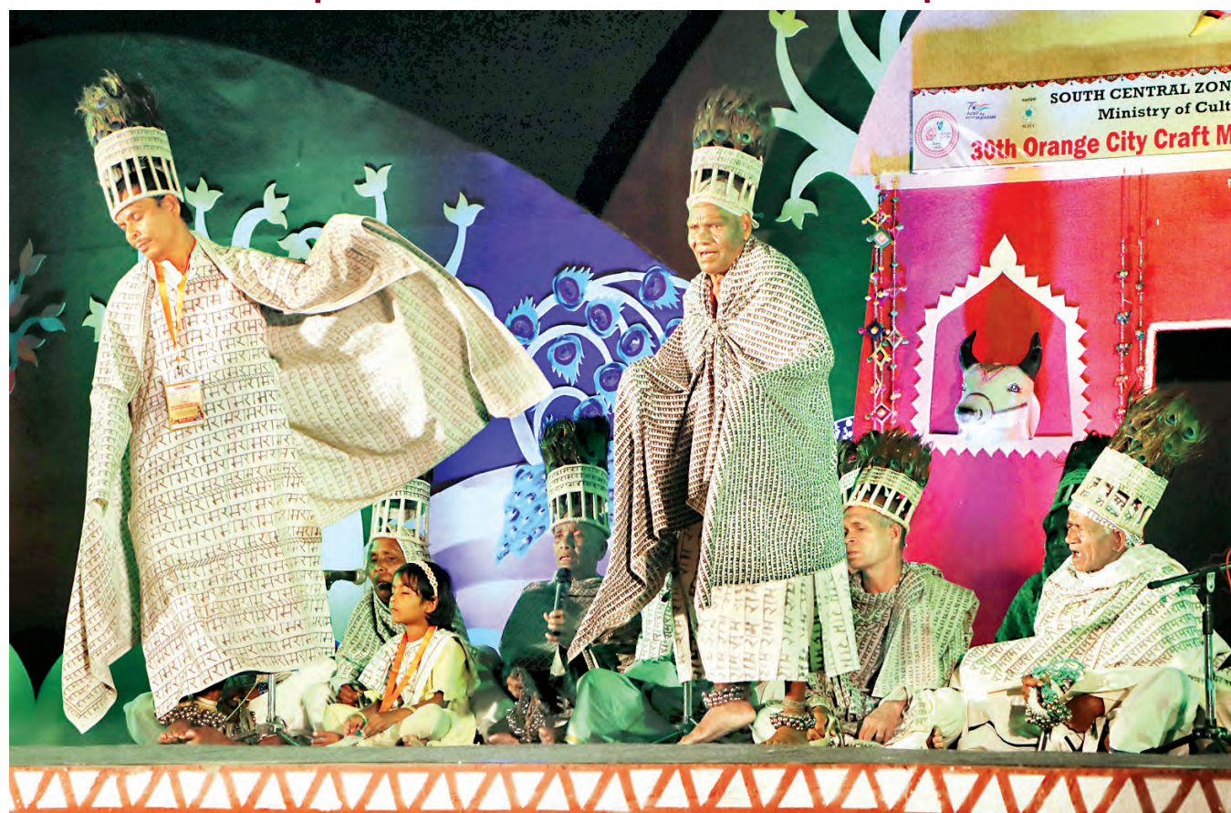
Artists from Chhattisgarh perform 'Ramnami Bhajan' during the Orange City Craft Mela and Folk Dance Festival 2024, in Nagpur.