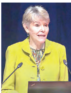
ICJ judge Hilary Charlesworth speaks during the Foundation Day lecture, in New Delhi, Saturday.

On April 10, 2017, Jadhav was sentenced to death by a Field General Court Martial in Pakistan. The ICJ stayed his execution pending final adju-