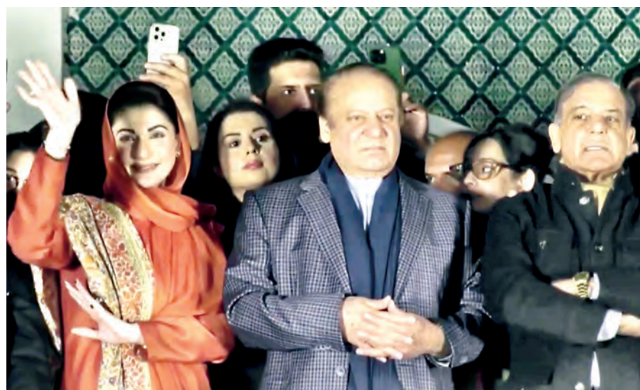
Former Pakistan prime minister Nawaz Sharif addresses Pakistan Muslim League-Nawaz (PML-N) supporters following the initial results of the country's general elections, in Lahore, Pakistan.