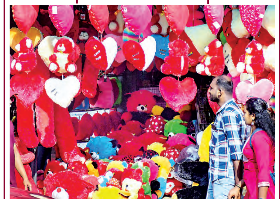
People shop at a gift shop ahead of Valentine's Day, in Thiruvananthapuram, Saturday.