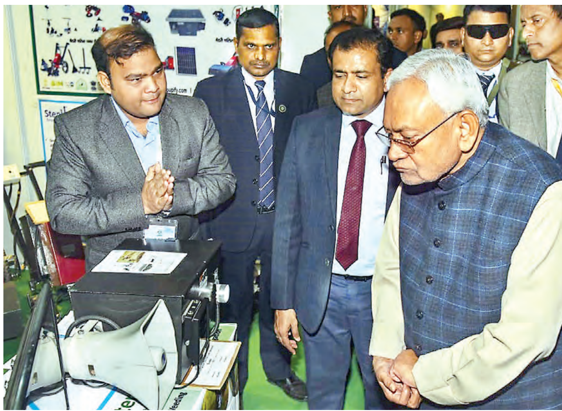
Chief Minister Nitish Kumar visits an exhibition during the 'Rajyastariya Krishi Yantrikaran Mela' (Agro Bihar 2024), in Patna, Saturday, Feb. 10.