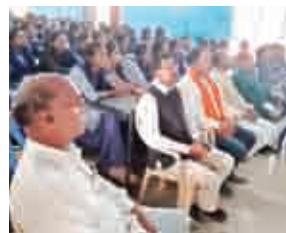
Pandariya, Jan 31:

The spirit of Prime Minister Narendra Modi's "Pariksha Pe Charcha" echoed through the corridors of Kanya Shala in the city, where a development block-level program brought together students, teachers, parents, and public representatives. This initiative was part of the Prime Minister's nationwide effort to engage with students from all walks of life.