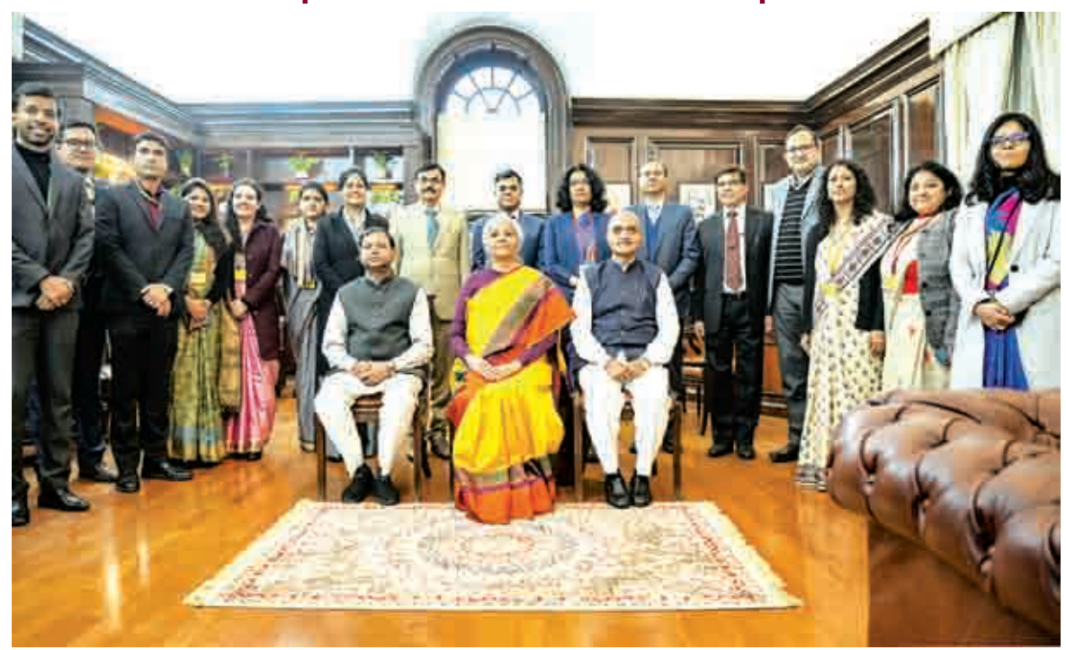
Union Finance Minister Nirmala Sitharaman with Ministers of State Pankaj Chaudhary and Bhagwat Karad and her team of officials a day before presentation of the Interim Budget 2024, at her North Block office in New Delhi, Wednesday, Jan. 31.