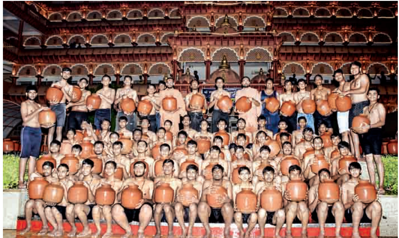
Students &amp; priests of Swaminarayan Gurukul during the 'Magh Snan' ritual, in Surat.