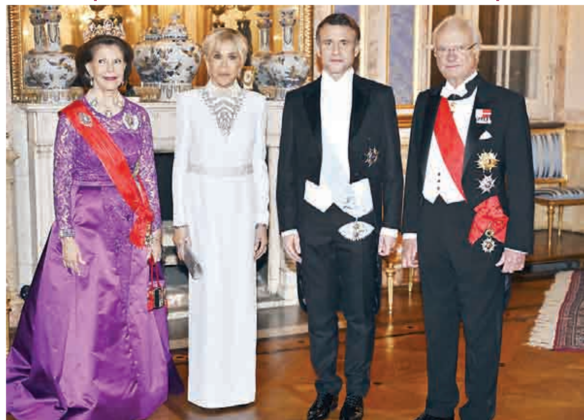
From left, Sweden's Queen Silvia, Brigitte Macron, French President Emmanuel Macron and King Carl Gustaf pose for a group photo after arriving at Stockholm Palace where the royal couple gives a gala dinner for the French presidential couple, in Stockholm. French President Emmanuel Macron and his wife Brigitte are on a two-day state visit to Sweden.