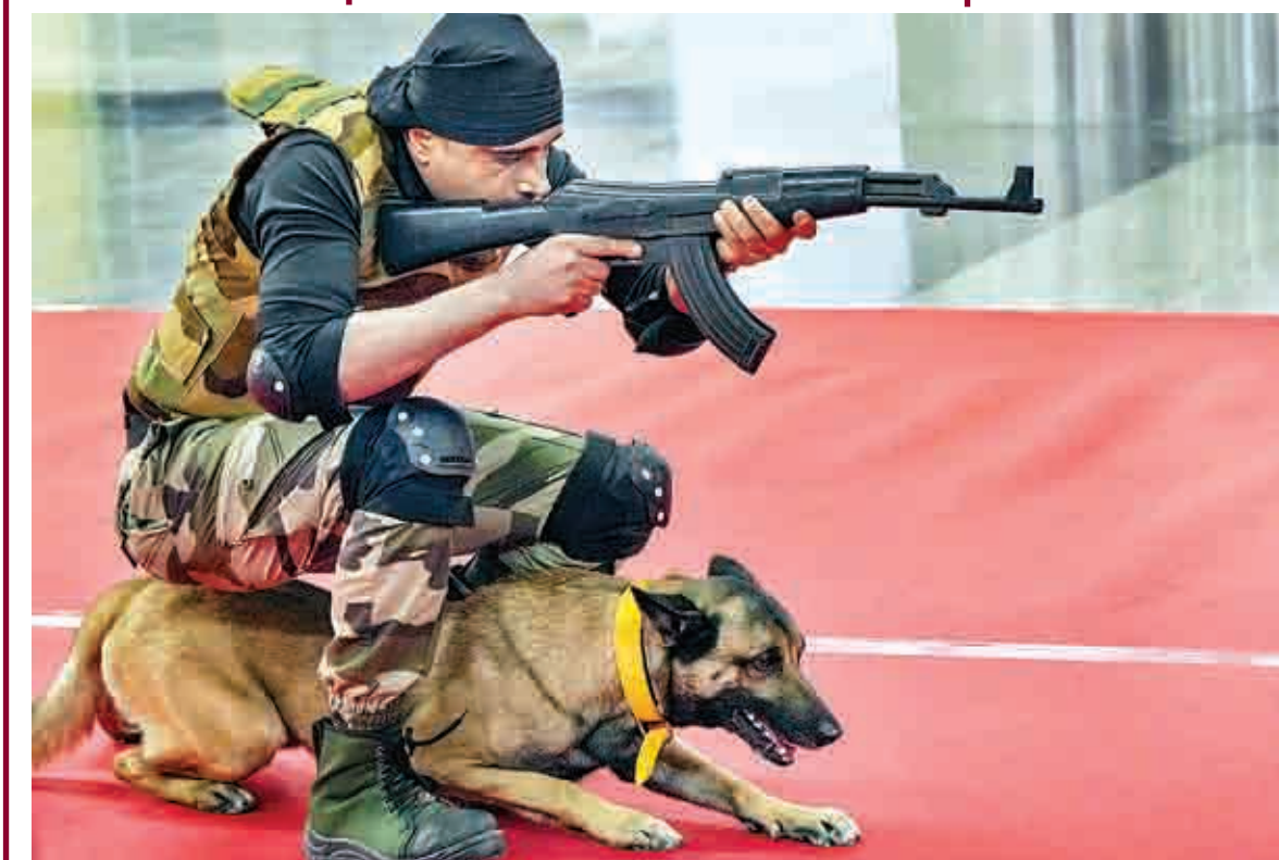
Dog squad of Central Industrial Security Force (CISF) display their skills during the inauguration of 'Interactive Museum Exhibits' at Shivaji Park Metro Station, in New Delhi, Wednesday.

On April 6, 2023, the Union government promulgated certain amendments to the Information Technology (Intermediary Guidelines and Digital Media Ethics Code) Rules, 2021.