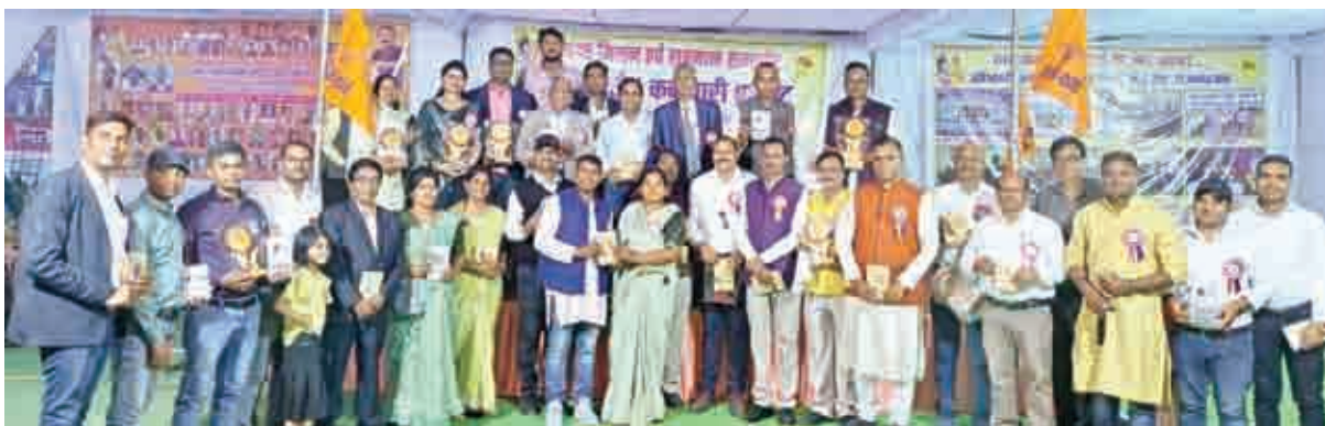
Dongargaon, Jan 31:

A New Year meeting and felicitation ceremony was organized by the Officer Employees Cell of the District Sahu Sangh Rajnandgaon at the Sahu Sadan in Sanskaardhani Rajnandgaon district. The event marked not only the beginning of a new year but also a celebration of unity and accomplishment within the community.