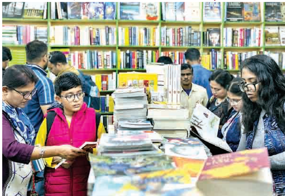
Visitors at a stall during the last day of the 47th International Kolkata Book Fair, in Kolkata, Wednesday.