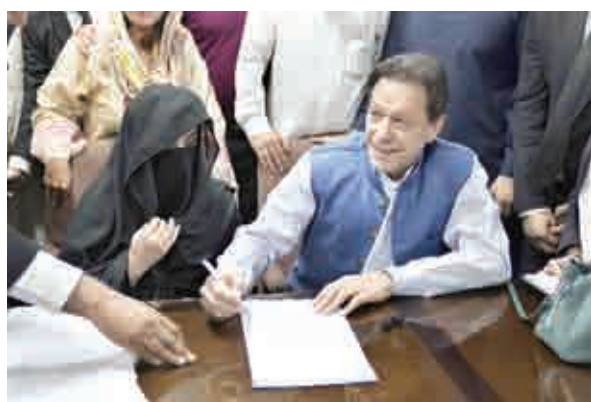
Pakistan's former Prime Minister Imran Khan along with his wife Bushra Bibi.

Khan's party, the Pakistan Tehreek-e-Insaf (PTI) faced numerous troubles before the election starting with the denial of its election symbol, the cricket bat, to the rejection of nomination papers