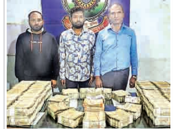
Cash seized by officials of Chhattisgarh Police and Anti-Crime and Cyber Unit (ACCU) during a joint search operation, early Wednesday.