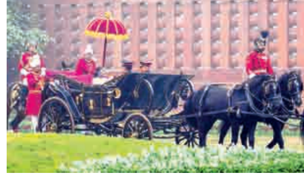
President Droupadi Murmu arrives at Parliament House complex on the first day of the Budget session, in New Delhi, Wednesday.