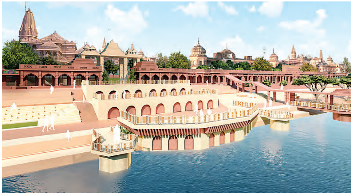
Projected image of Sarayu river ghats as per Ayodhya Master Plan.

"The city is envisaged to be developed as a mega centre for tourist, economic and religious activities. More than three lakh devotees are expected to visit Ayodhya daily within the next three-four years," Kukreja told PTI in an interview.