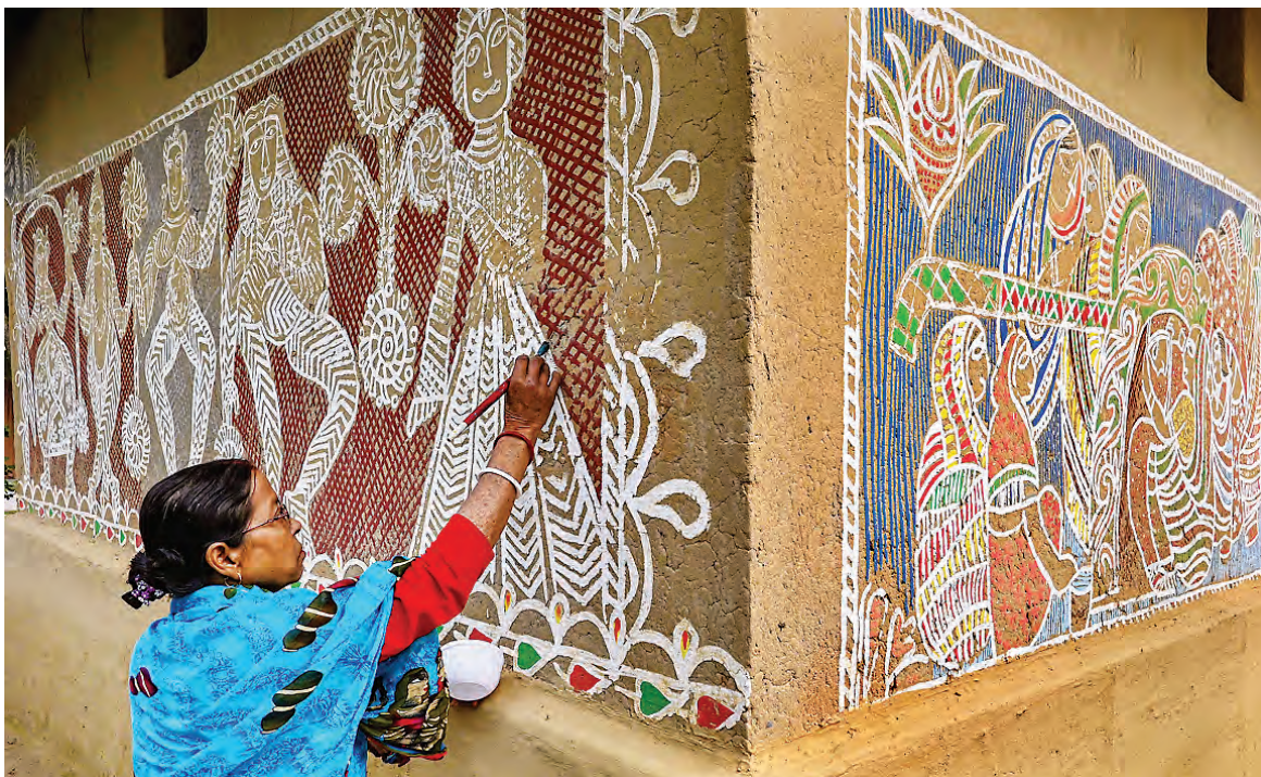
An artist paints a 'rangoli' on the wall of her house on the eve of the festival Makar Sankranti, in Lankamura village of Agartala, Tuesday.