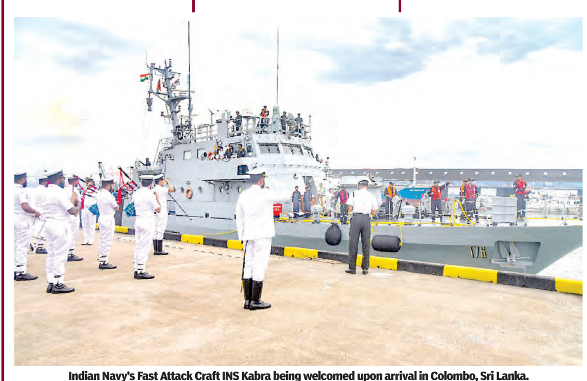
Indian Navy's Fast Attack Craft INS Kabra being welcomed upon arrival in Colombo, Sri Lanka.