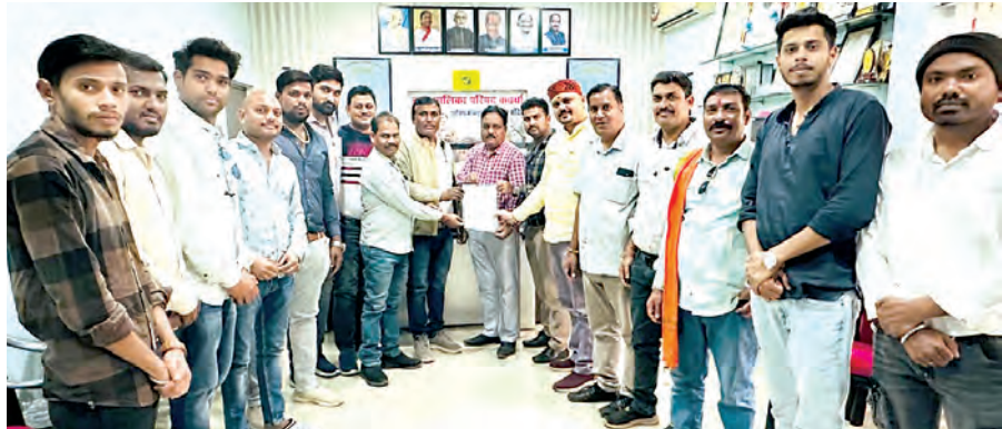
Kawardha, Jan 09:

BJP takes a stand to address employee salary issues