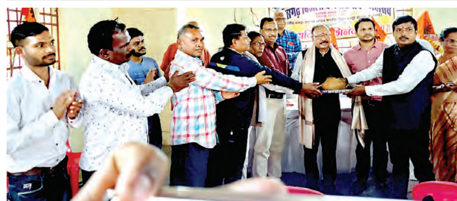
Kurud, Jan 09:

Bharatiya Mazdoor Sangh promotes unity and celebration