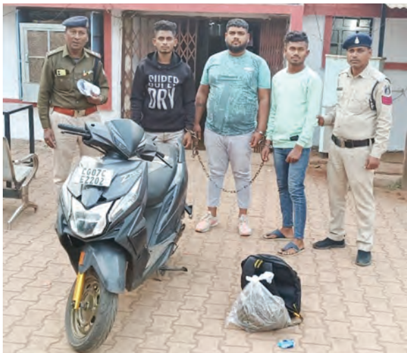
Bhilai, Jan 09:

Durg Police conducted a special campaign across the district and arrested eight ruffians involved in smuggling / peddling of cannabis. 19 kgs of weed worth Rs 78000.