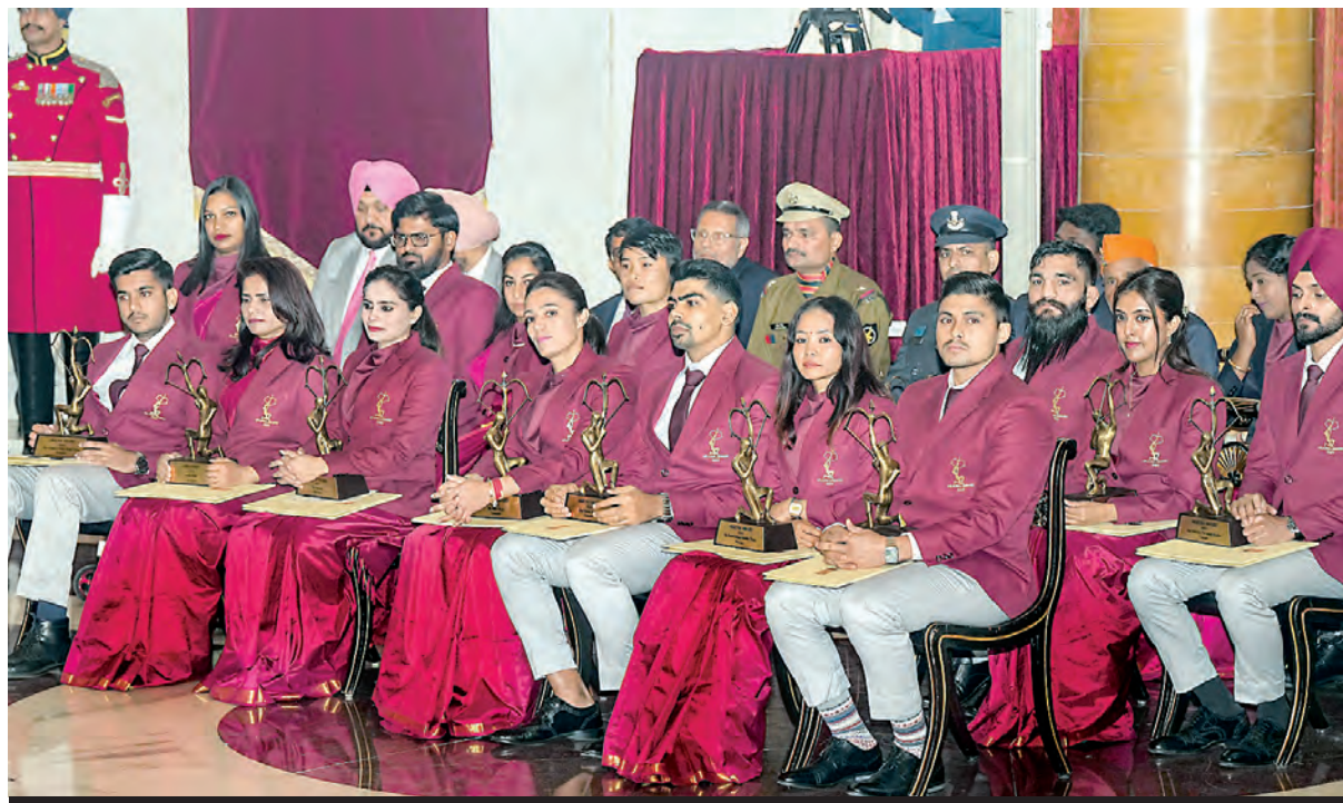
Awardees during the National Sports and Adventure Awards 2023 at the Rashtrapati Bhawan, in New Delhi, Tuesday, Jan. 9.

An atmosphere of gaiety pervaded the Rashtrapati Bhawan as 26 athletes and para-athletes were finalised for the Arjuna Awards this year, with teenager pistol ace