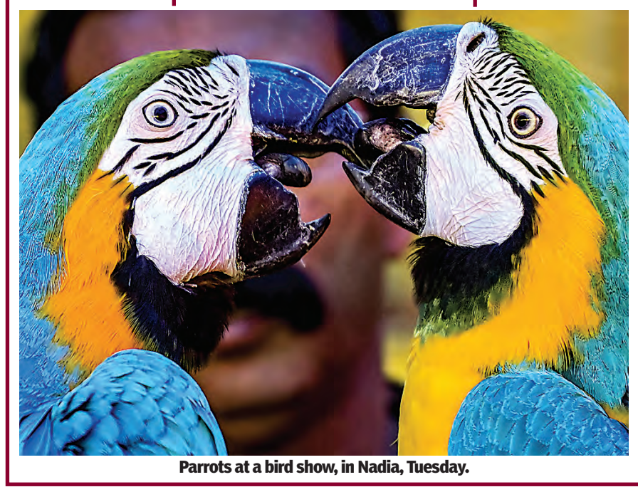
Parrots at a bird show, in Nadia, Tuesday.