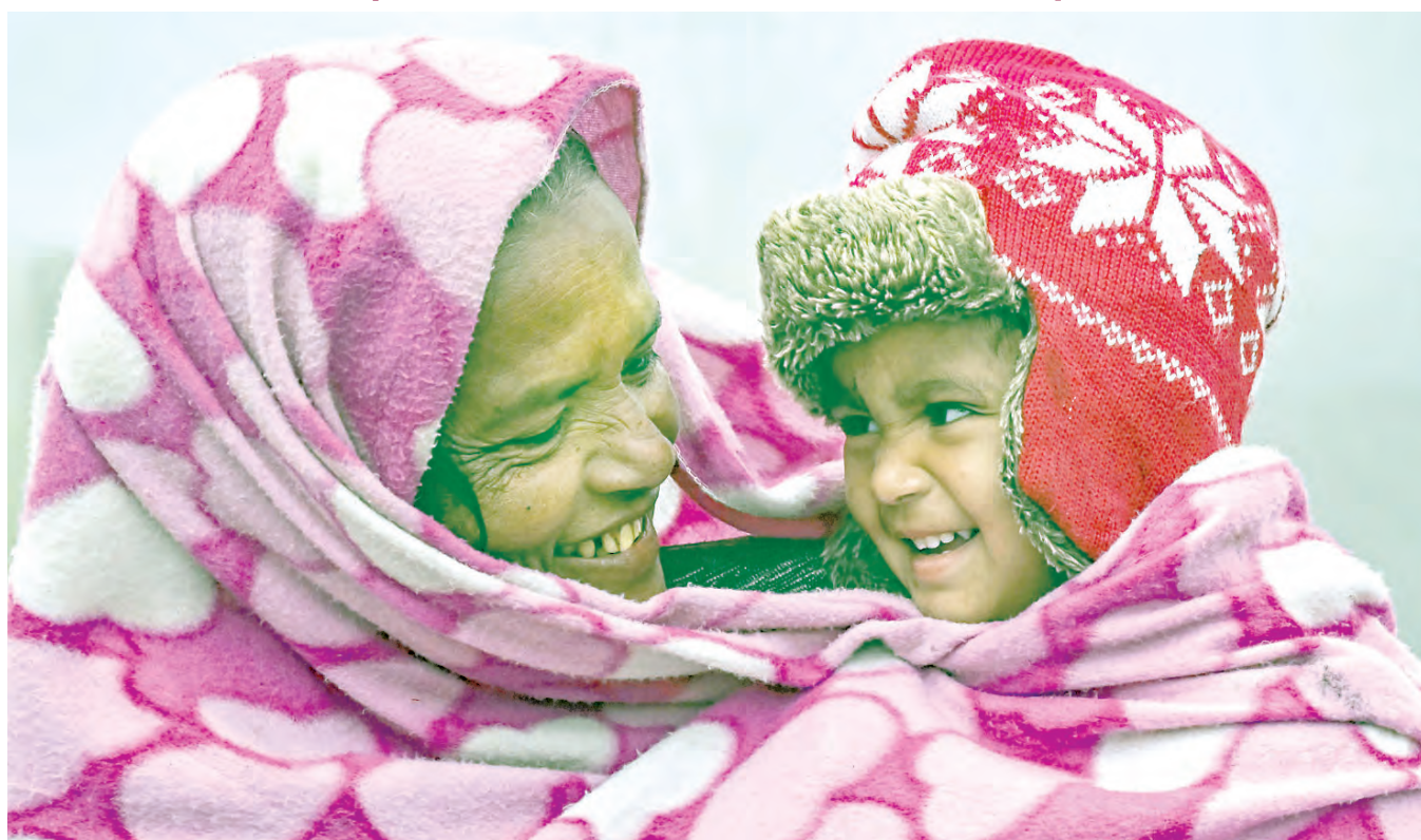
A woman with her child during a cold winter morning, in Nadia, Tuesday.