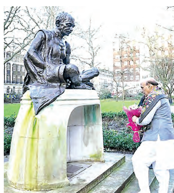
Defence Minister Rajnath Singh pays homage to Mahatma Gandhi, in Tavistock, London.

The minister then made his way to Whitehall to inspect a ceremonial Guard of Honour at the Horse Guards Parade before a bilateral meeting with his UK counterpart, Defence Secretary Grant Shapps. The two leaders are expected to cover a wide range of defence, security and industrial cooperation issues.