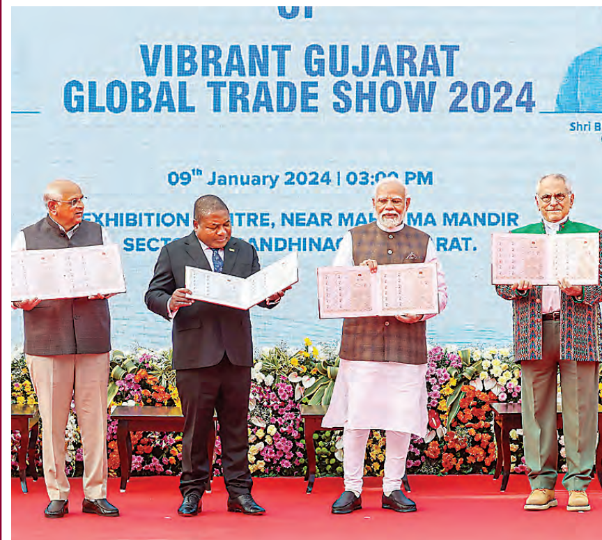
Prime Minister Narendra Modi with President of Timor-Leste Jose Ramos-Horta, Mozambique President Filipe Nyusi and Gujarat Chief Minister Bhupendra Patel during the inauguration of the Vibrant Gujarat Global Trade Show, in Gandhinagar, Tuesday, Jan. 9.