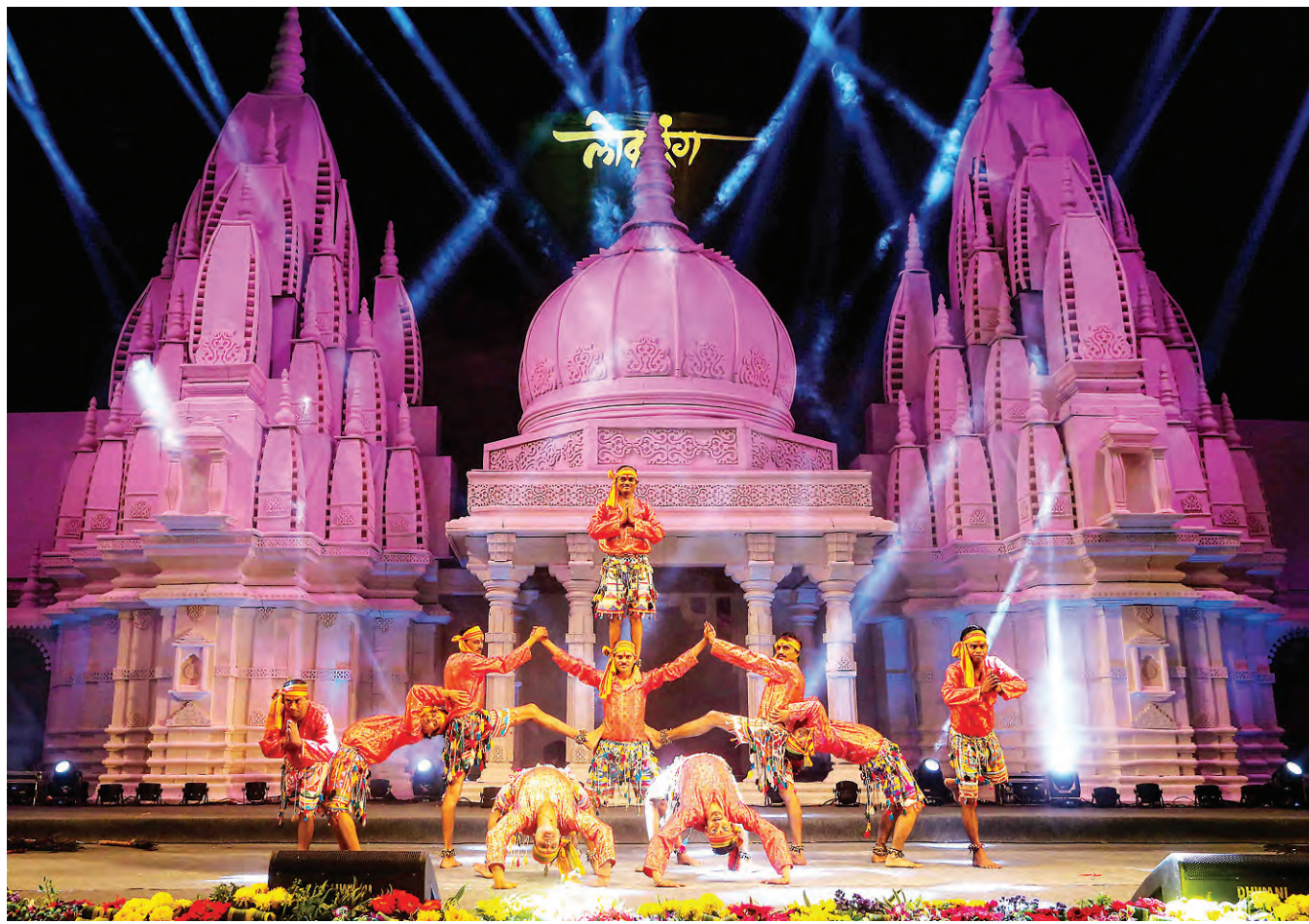
Artists from Madhya Pradesh perform during Lokrang Mahotsav at Ravindra Bhawan, in Bhopal.