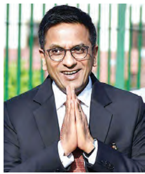
CJI DY Chandrachud

The CJI also highlighted the demographic changes undergoing in India and