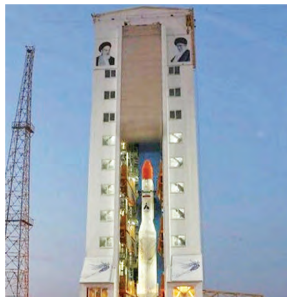
This photo released by the Iranian Defense Ministry on Sunday, Jan. 28 claims to show Simorgh, or 'Phoenix,' satellite carrier before being launched at the Imam Khomeini Spaceport in Iran's rural Semnan province.

Footage released by Iranian state television showed a nighttime launch for the Simorgh rocket. An Associated Press analysis of the footage showed that it took place at the Imam Khomeini Spaceport in Iran's rural Semnan province.