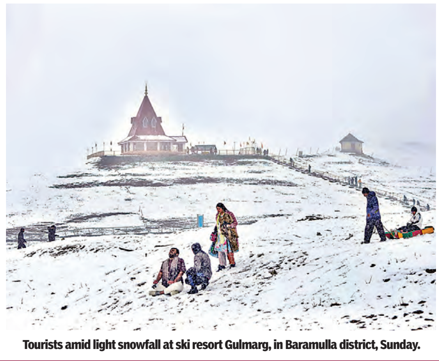
Tourists amid light snowfall at ski resort Gulmarg, in Baramulla district, Sunday.