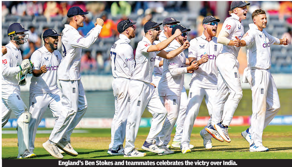
England's Ben Stokes and teammates celebrates the victory over India.

This is India's fourth defeat in home Tests since 2013 and India's approach during chase was in complete contrast to how Pope tackled Ravichandran Ashwin and Ravindra Jadeja with a lot of intent. The spin twins have never been lethal on surfaces which aren't exactly dustbowl and England's second innings batting