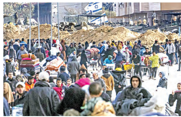
Palestinians flee Israeli ground offensive in Kahn Younis, Gaza Strip.

Israel's military is under increasing scrutiny now that the top United Nations court has asked