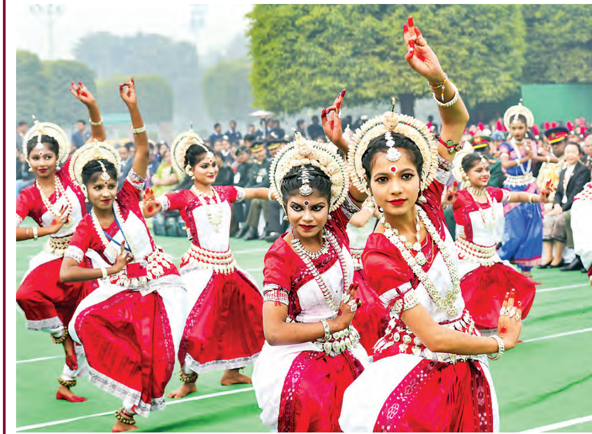
Artists who participated in the 75th Republic Day parade perform during a meeting with President Droupadi Murmu at the Rashtrapati Bhavan, in New Delhi, Sunday.