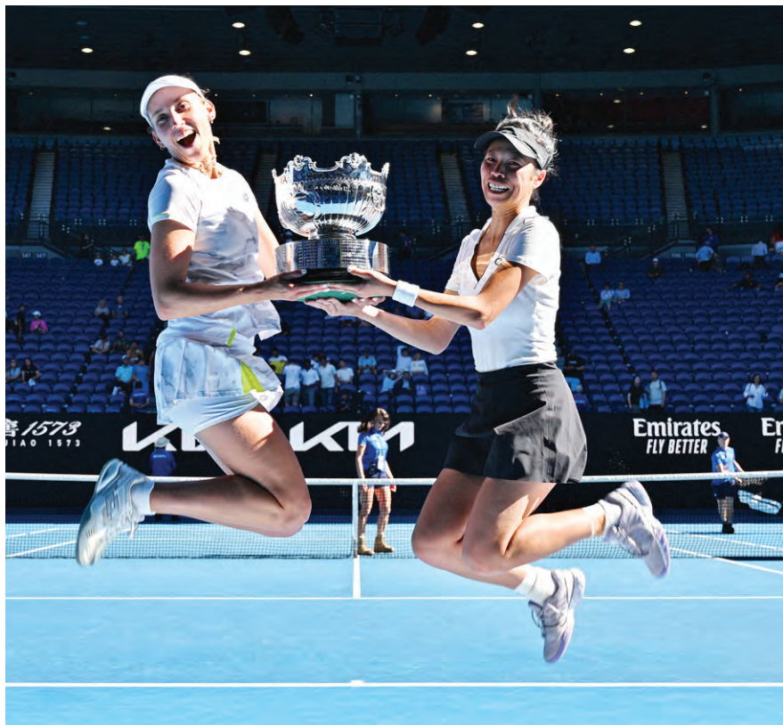
Taiwan's Su-wei Hsieh (R) and Belgium's Elise Mertens jump with the trophy after victory against Ukraine's Lyudmyla Kichenok and Latvia's Jelena Ostapenko during their women's doubles final match on day 15 of the Australian Open tennis tournament in Melbourne on January 28.

American Lisa Raymond was eight days older than Hsieh when she won the 2011 U.S. Open women's doubles. Martina Navratilova was