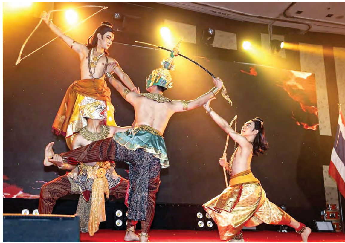
Artists perform during a recital of Ramayana in fusion style during India's 75th Republic Day celebration, in Bangkok.