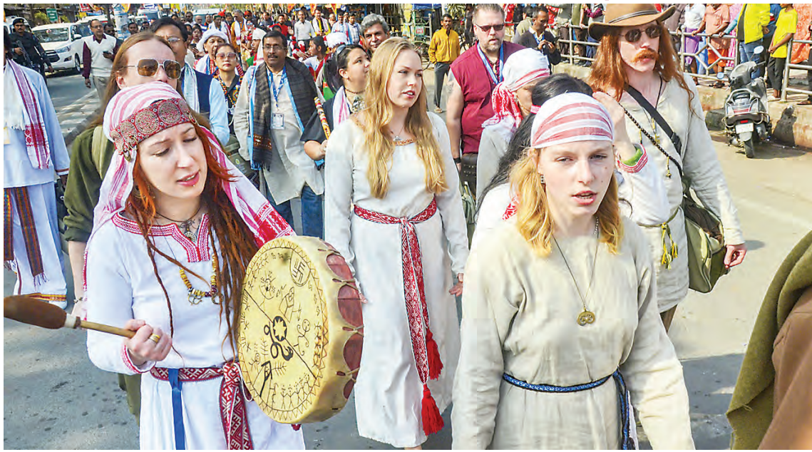
People from different countries take part in a procession on the occasion of the 8th International Conference and Gathering of Elders organised by International Centre for Cultural Studies (ICCS), in Dibrugarh, Sunday.