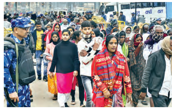
Devotees on their way to the Ram Temple, in Ayodhya, Sunday.

"After the 'Pran Pratistha' ceremony, there has been a