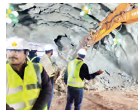
Engineers and workers during breakthrough ceremony of Naushera tunnel project, in Jammu & Kashmir, Sunday.