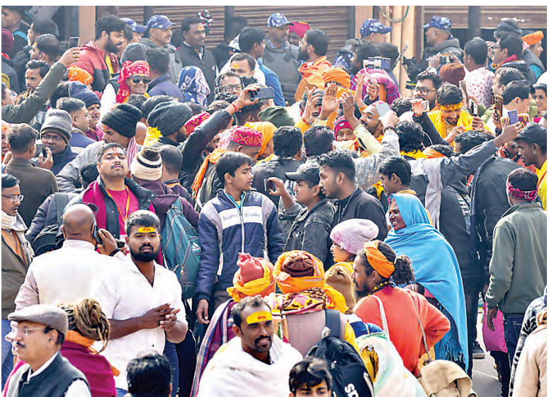
Devotees outside Hanuman Garhi, ahead of consecration ceremony of Ram Mandir, Ayodhya, Sunday.