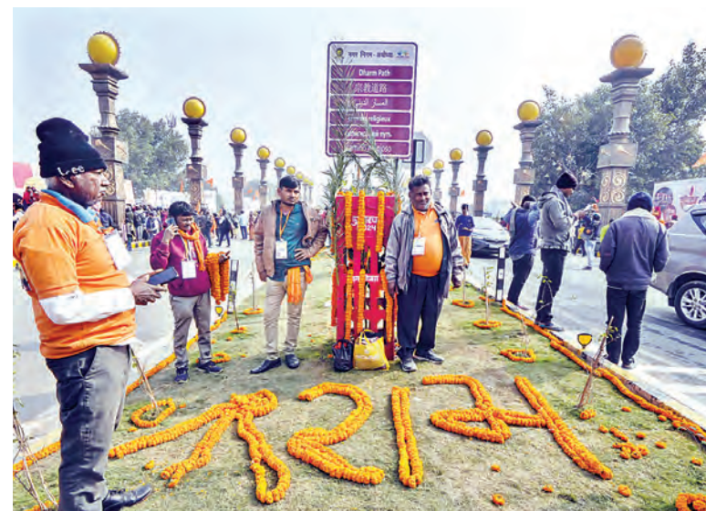
Preparations ahead of the consecration ceremony of Ram Mandir, in Ayodhya, Sunday.