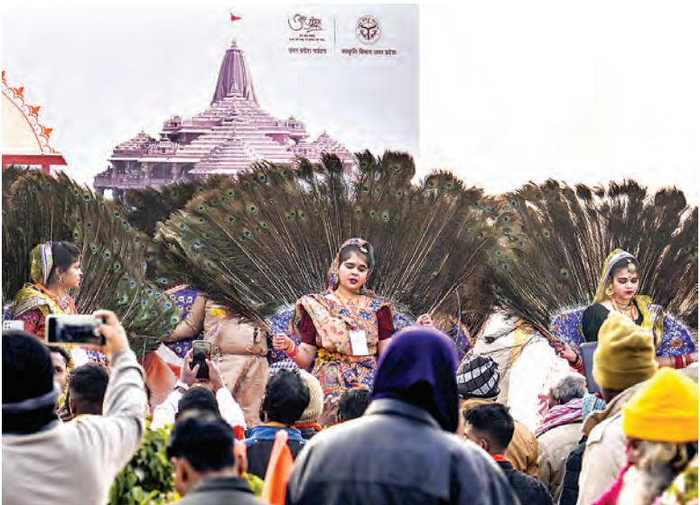
Artists perform ahead of the Ram temple consecration ceremony, in Ayodhya, Sunday.