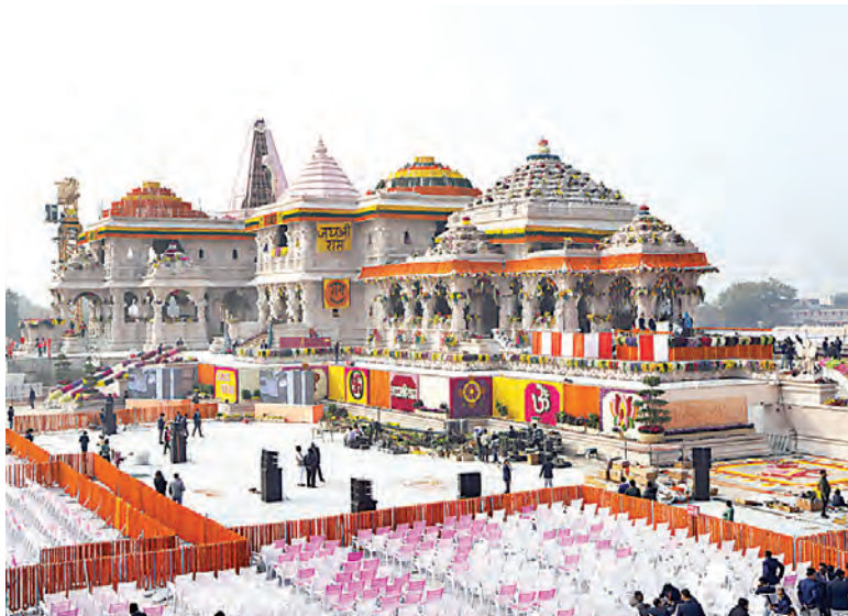
The compound and the building of a temple dedicated to Lord Ram are decorated with flowers the day before the temple's grand opening in Ayodhya, Sunday.