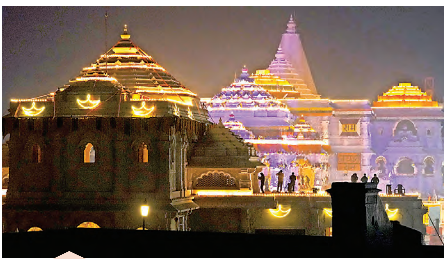
View of the Ram Mandir in the evening on the eve of its consecration ceremony, in Ayodhya, Sunday.