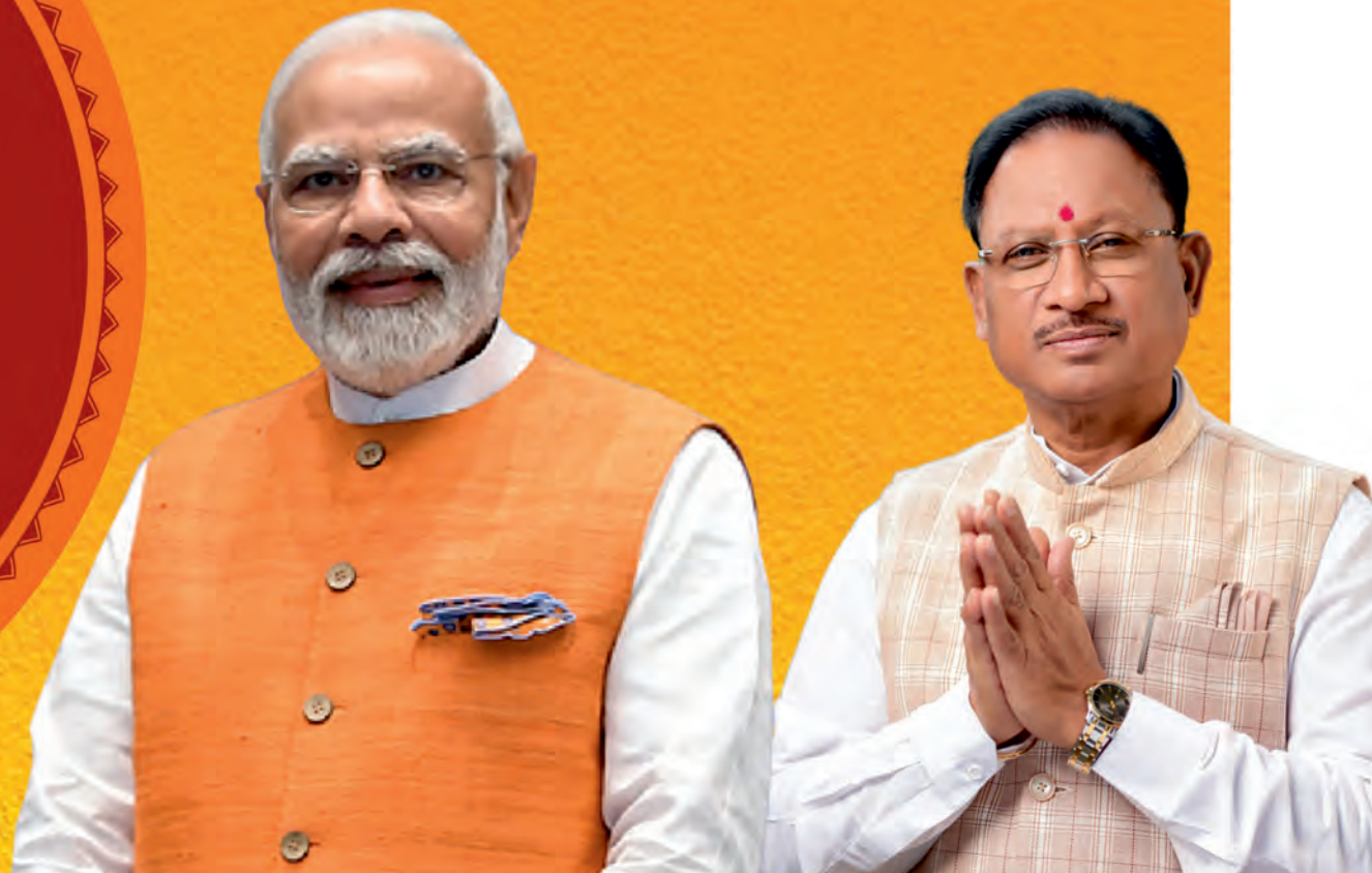
Shri Narendra Modi Hon'ble Prime Minister, India

Chhattisgarh Government, under the leadership of Shri Vishnu Deo Sai is committed to preserve and cherish the memories of Shri Ram's time in Chhattisgarh