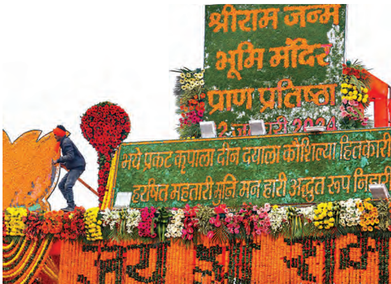
A worker decorates the entrance to the Ram temple ahead of the consecration ceremony, in Ayodhya, Sunday.