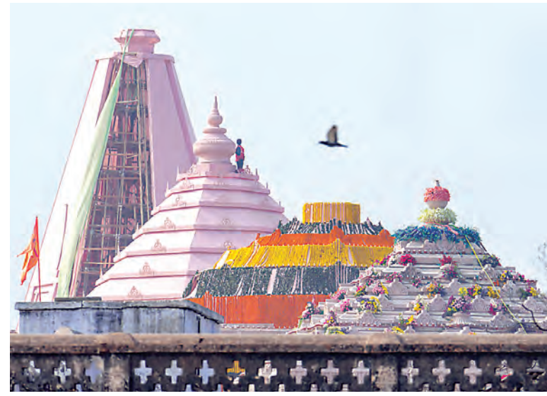
Shri Ram Janmabhoomi Temple decorated ahead of the consecration ceremony, in Ayodhya, Sunday.