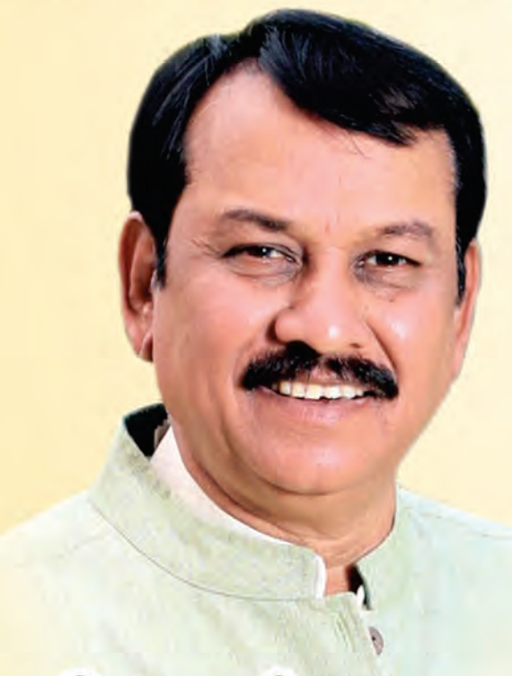
विजय बधेल दुर्ग लोकसभा सांसद