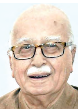
L K Advani

In the run-up to the January 22 consecration ceremony at the Ram temple in Ayodhya, Advani