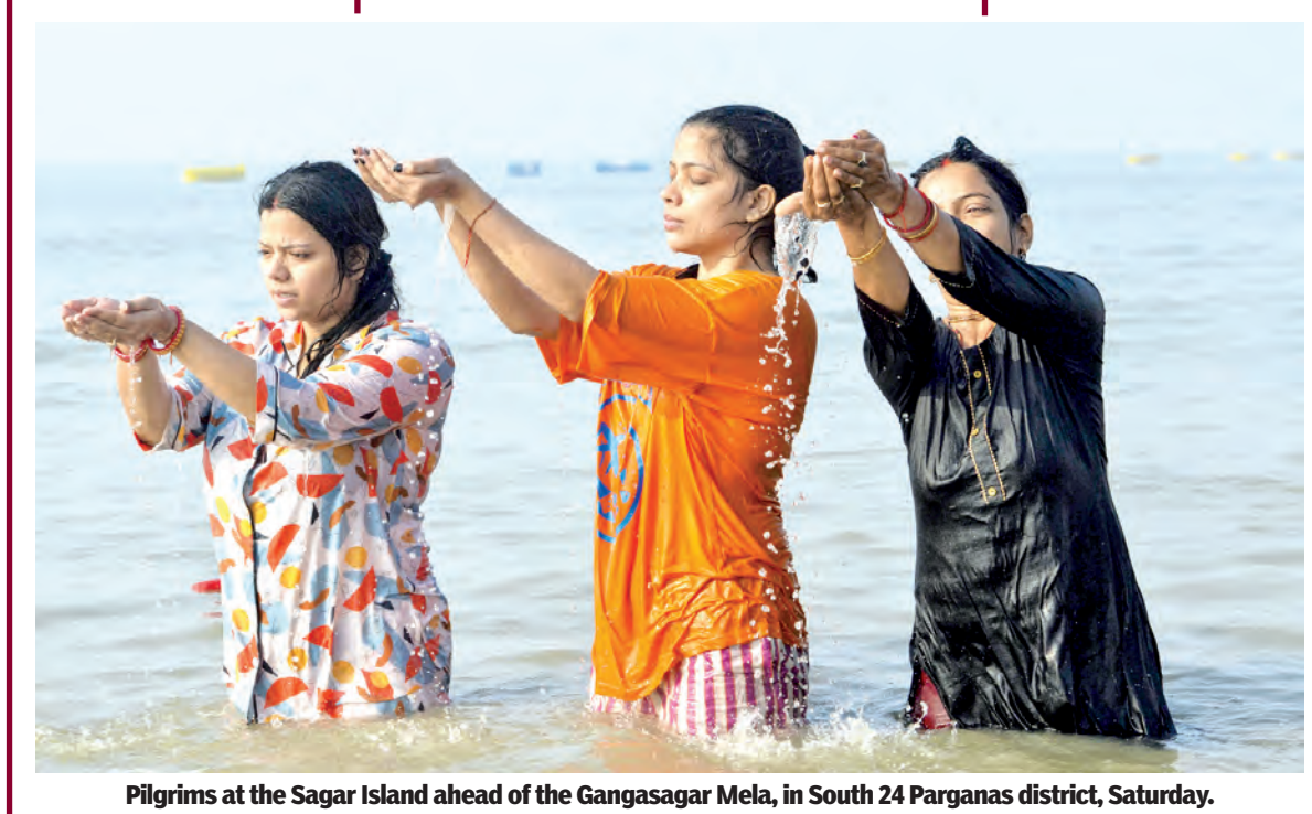
Pilgrims at the Sagar Island ahead of the Gangasagar Mela, in South 24 Parganas district, Saturday.