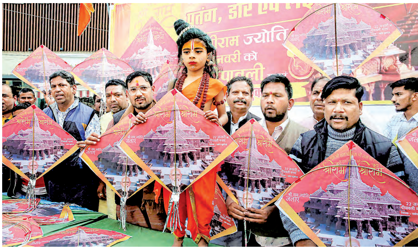
Sindhu Sena activists with a child dressed as Lord Ram show kites depicting pictures of Ayodhya's Ram Temple before their distribution ahead of the Makar Sankranti, in Bhopal, Saturday, Jan. 13.