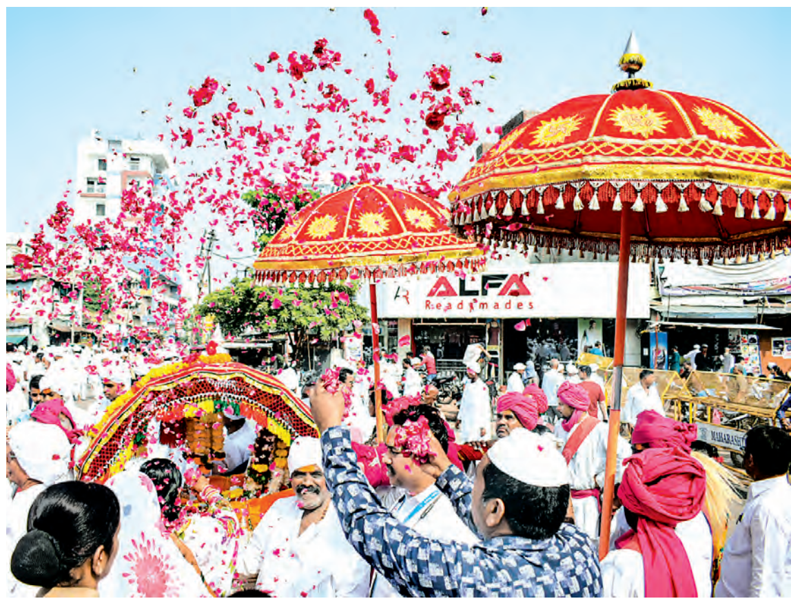
Devotees take part in a 'Nandi Dhwa' procession during the Siddheshwar Mandir Yatra, in Solapur, Saturday.