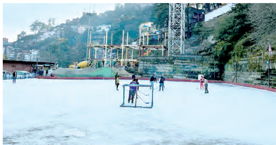
People at an Ice Skating rink, a major tourist attraction of queen of hills, in Shimla, Saturday.