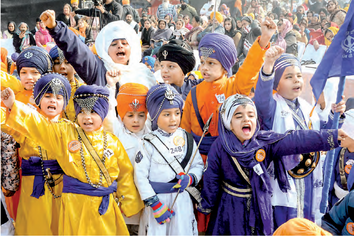
Sikh children wait for the judgement in a turban tying competition organised to mark martyrdom of the sons of Guru Gobind Singh, in Amritsar, Monday.