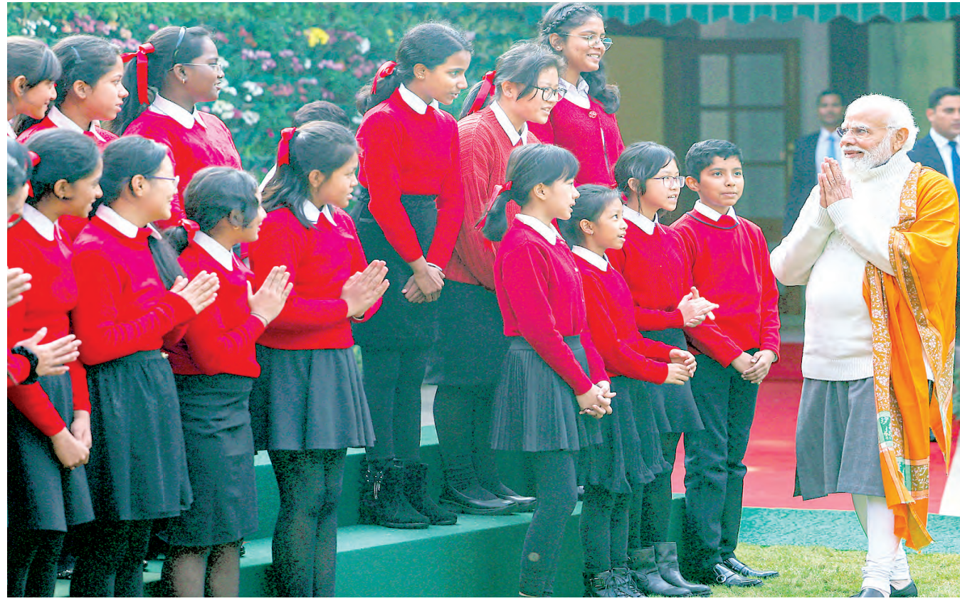
Prime Minister Narendra Modi with students during Christmas celebrations at 7, Lok Kalyan Marg, in New Delhi, Monday, Dec. 25.