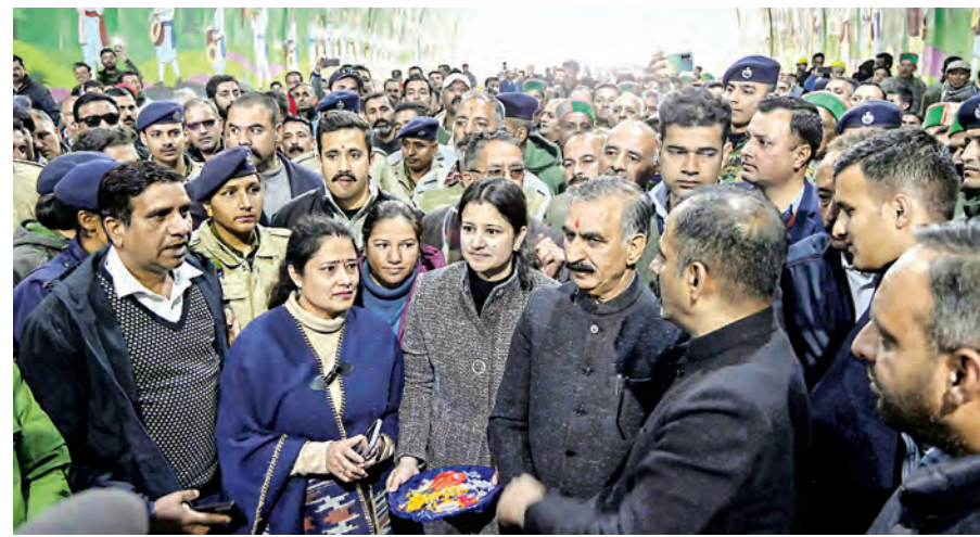
CM Thakur Sukhvinder Singh Sukhu at the inauguration of newly constructed Rs. 47.36 crore Sanjauli-Dhalli tunnel spanning 154.22 meters, in Shimla, Monday.

The existing Dhalli tunnel, which was constructed in 1852, served as a single-lane passage and had