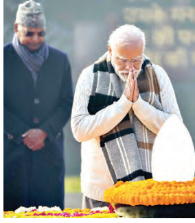
PM Modi and former president Ram Nath Kovind pay tribute to former prime minister Atal Bihari Vajpayee on his birth anniversary, at Sadaiv Atal, in New Delhi, Monday.

Releasing the first series of 11 volumes of collected works of Pandit Madan Mohan Malaviya at a function here, Modi said his government is setting up several institutions committed towards nation-building, just like 'nation first' was supreme for Mahamana, a title often used for the Banaras Hindu University founder. The prime minister said