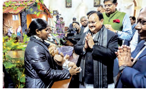
BJP National President JP Nadda visits the Sacred Heart Cathedral Church on the occasion of Christmas, in New Delhi, Monday.

"I was fortunate to visit this church on the pious occasion of Christmas.