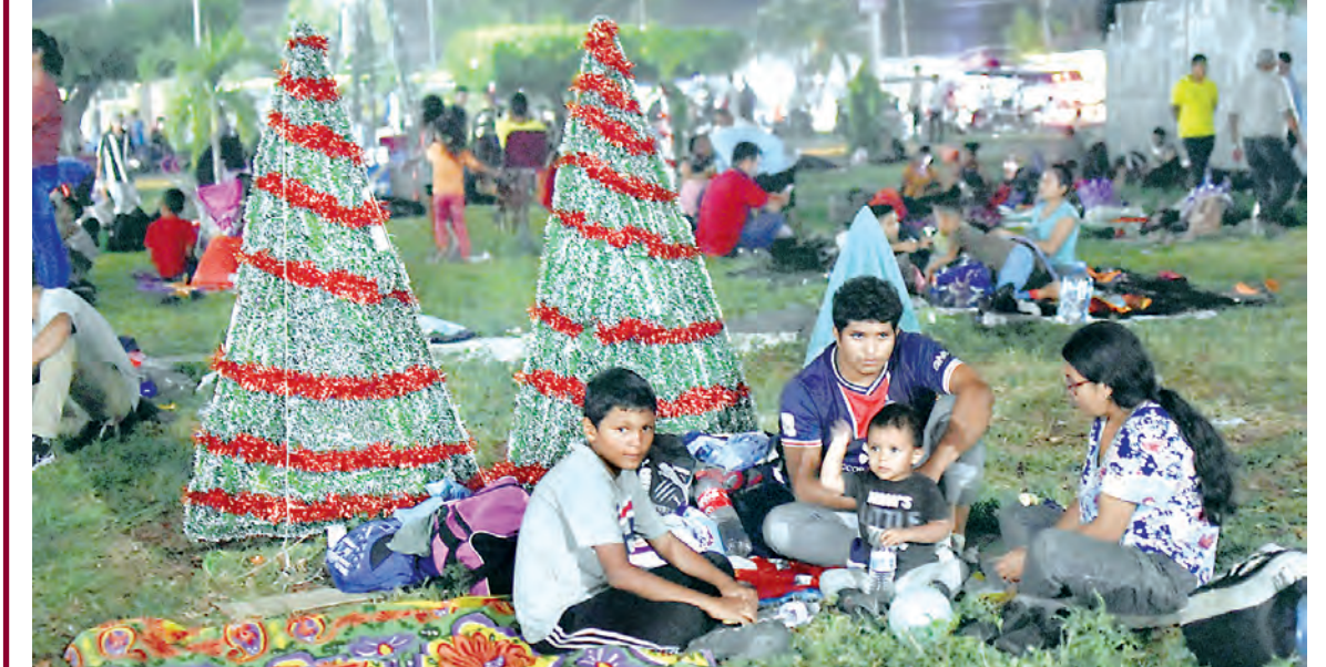
Migrants camp in Alvaro Obregon, Mexico. A caravan of migrants started the trek north from Tapachula on Sunday, just days before U.S. Secretary of State Antony Blinken arrives in Mexico City to discuss new agreements to control the surge of migrants seeking entry into the United States.