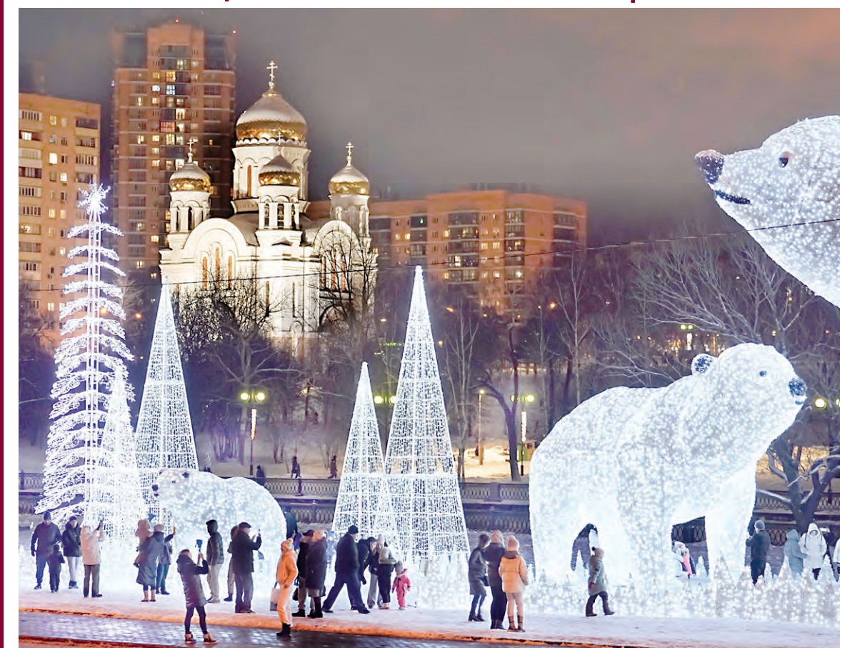
People walk and play at a park decorated for the New Year and Christmas festivities with an Orthodox Church in the background in Moscow, Russia.