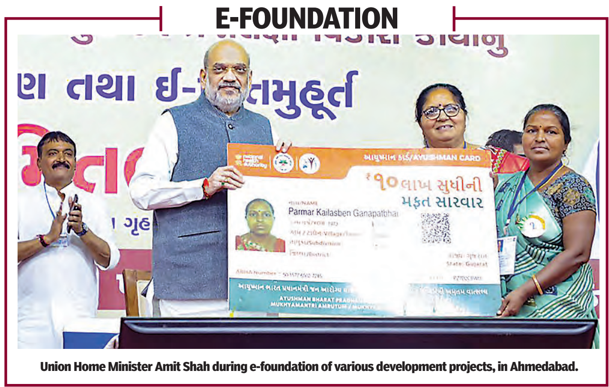
Union Home Minister Amit Shah during e-foundation of various development projects, in Ahmedabad.

the 2023 Global Risk Survey shows that Indian business leaders are not only demonstrating an increased appetite for taking risks but are also doing a reasonable job of identifying opportunities presented by risks. "This mindset shift is critical for an organisation's progress- it will not only help businesses be better prepared to manage risks, but also grow, build resilience, deliver outcomes and create value for all stakeholders," Krishnan added. The survey also showed that 99 per cent of Indian business leaders are confident their organisation can balance growth with managing risk effectively, of which 66 per cent are very confident of the same. Globally these figures stand at 91 per cent and 40 per cent, respectively.