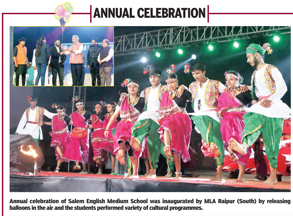
Annual celebration of Salem English Medium School was inaugurated by MLA Raipur (South) by releasing balloons in the air and the students performed variety of cultural programmes.

Assembly also approved budgetary provision for the construction of residential quarters for the weaker section of society under PM Housing Scheme. Govt also announced the much-talked Mahtari Vandan Scheme implementation as budgetary provisions too have been made in the 2nd Supplementary Budget here.