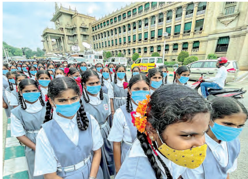
School students wearing masks in precaution against COVID visit the Vidhana Soudha, in Bengaluru, Thursday.