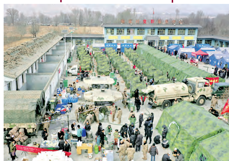
Volunteers preparing foods to quake victims at a temporary settlement in Chenjiacun village in Jishishan county in northwest China's Gansu province. Hundreds of temporary housing units were being set up in northwest China on Thursday for survivors of an earthquake, according to state media reports.