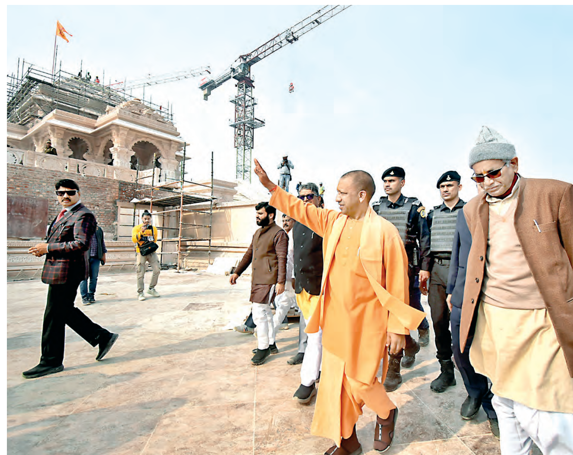
CM Yogi Adityanath inspects the construction work of Sri Ram temple, in Ayodhya district, Thursday.