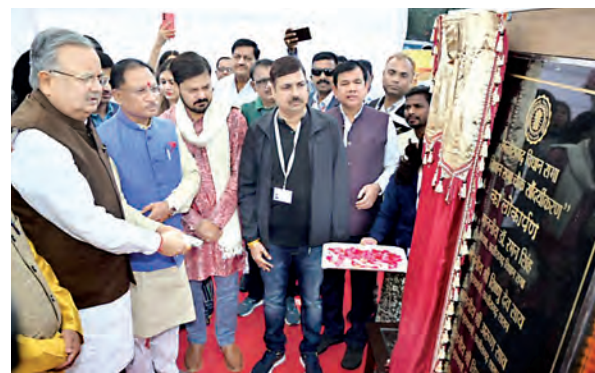
Raipur, Dec 21:

Beautification of the main square and the gardens done at a cost of Rs 37.95 lakh