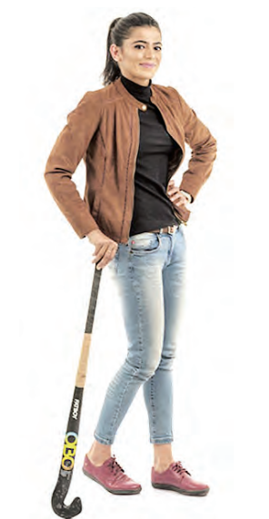
Hockey Olympic Qualifiers in Ranchi next month," she added.

"While the team has maintained good form this year, as we approach 2024, my goal is to sustain peak performance and provide the team with the best opportunity to qualify for the Olympics at the FIH