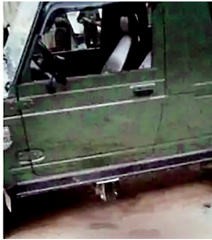
Ill fated army vehicle attacked by terrorists.

the Army vehicles -- a truck and a Gypsy.