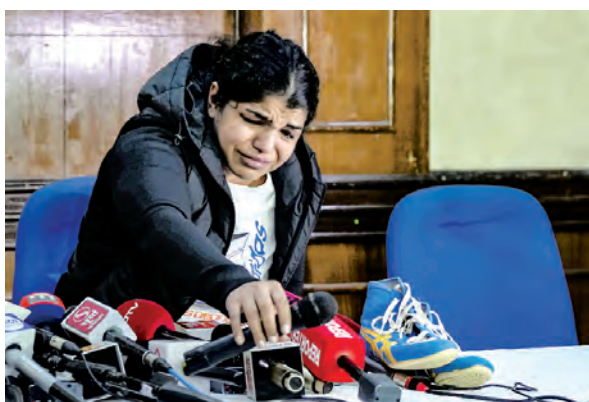
Wrestler Sakshi Malik during a press conference after Sanjay Singh, an associate of BJP MP and former chief of Wrestling Federation of India (WFI) Brij Bhushan Sharan Singh, became the new President of WFI, in New Delhi, Thursday, Dec. 21. Malik on Thursday announced retirement from wrestling; said she won't compete under presidency of Brij Bhushan's aide.

"We fought for our heart but if a man like Brij Bhushan, his business partner and a close aide is elected as the president of WFI, I quit wrestling," said a teary-