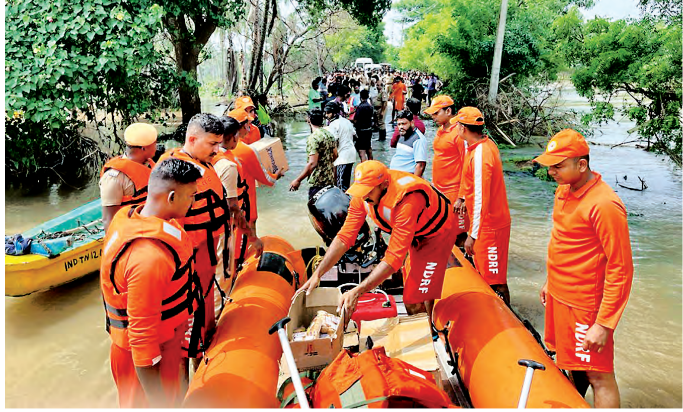
NDRF personnel distribute food and other essential materials to stranded people amid floods after heavy rainfall, in Tuticorin district, Tamil Nadu.