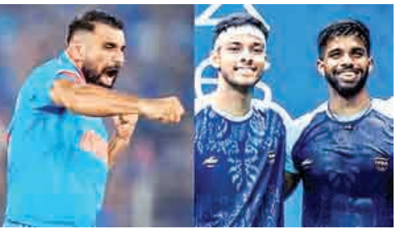
New Delhi, Dec 20 (PTI):

The Sports Ministry on Wednesday put its stamp on the nominations for the annual sports awards, confirming the prestigious Khel Ratna honour for badminton players Satwik Sairaj Rankireddy and Chirag Shetty and the Arjuna award for 26 sports persons, including pacer Mohammed Shami. The awards will be conferred on the athletes by President Droupadi Murmu at the Rashtrapati Bhavan on January 9. Chirag and Satwik are