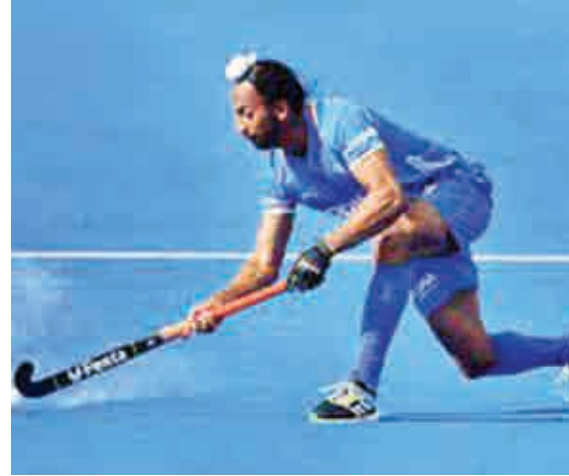
New Delhi, Dec 20 (PTI):

Indian men's hockey team vice-captain Hardik Singh on Wednesday said the FIH Player of the Year award is a recognition of his "hard work and perseverance" that he has put in over the years to excel in the sport he loves.