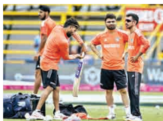
Match starts at 4:30 PM IST.

With a similar storyline of faltering opening combination running through the first two matches, India's hopes of registering their second ODI series triumph in South Africa will revolve around a sturdy start from the openers in the third and final match here on Thursday.