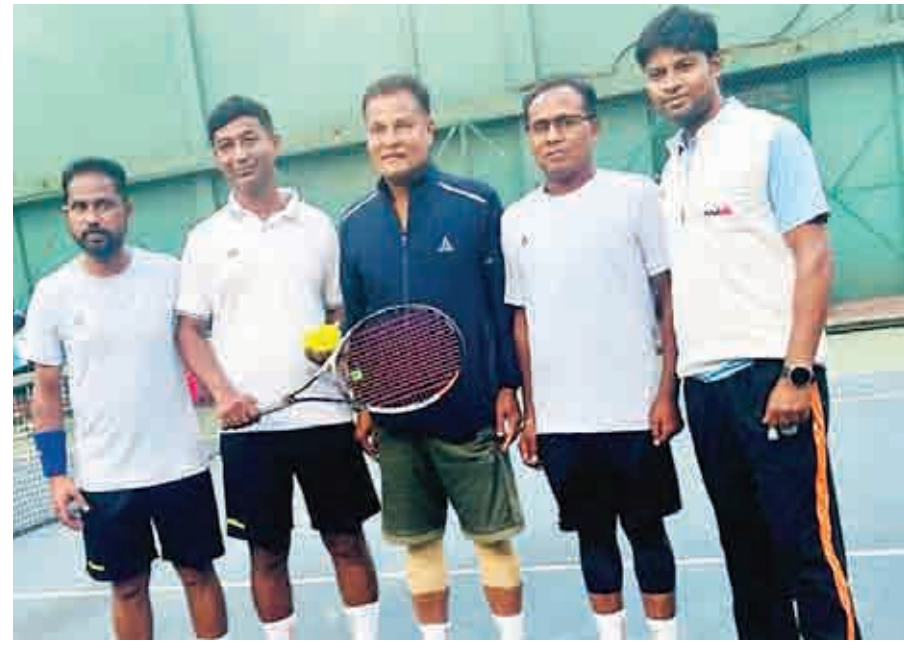
Matches for doubles were played, further intensifying the competition.

The tournament, which featured a display of remarkable sportsmanship and extraordinary skills, also included open singles and doubles matches that kept spectators on the edge of their seats. On the second day of the competition, quarter-final matches for open singles and semi-final