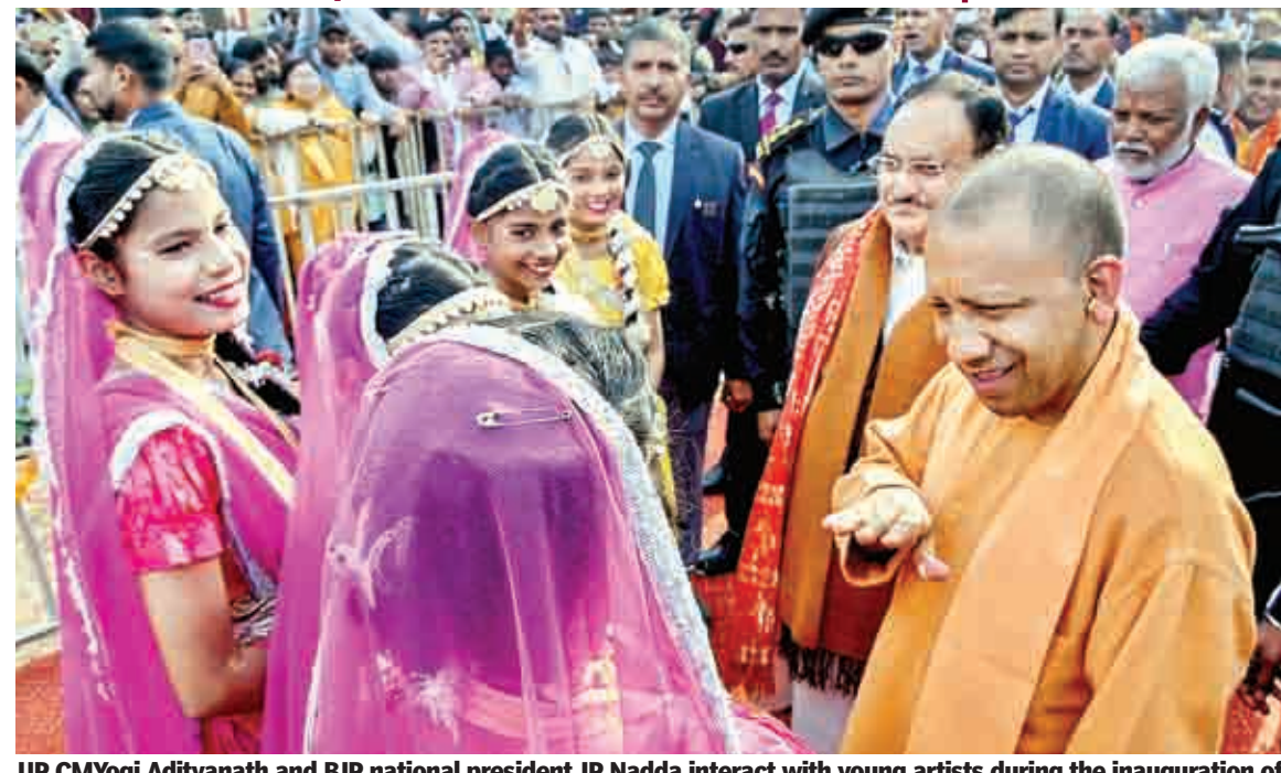
UP CM Yogi Adityanath and BJP national president JP Nadda interact with young artists during the inauguration of MP KHEL Mahakumbh, in Basti district, Wednesday.