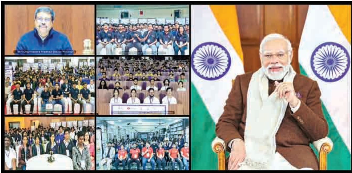
Prime Minister Narendra Modi interacts with students during the Grand Finale of Smart India Hackathon 2023 via video conferencing, in New Delhi.