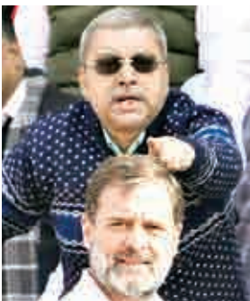
TMC's Kalyan Banerjee mimics Raja Sabha Chairman Jagdeep Dhankhar while staging a protest along with other suspended MPs during the Winter session of Parliament, in New Delhi.

As Dhankhar, also the Raja Sabha chairperson, said in the House that he would not tolerate any insult to Parliament or the constitutional post of vice president, TMC MP Kalyan Banerjee said he did not in-