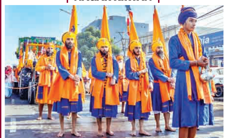
Sikh devotees during a 'Nagar Kirtan' procession ahead of the martyrdom day of the sons of Guru Gobind Singh, 'Sahibzade', in Amritsar, Wednesday.