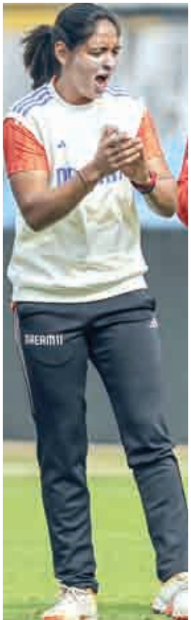
Mumbai, Dec 20 (PTI):

India captain Harmanpreet Kaur wants the hosts to play with the same energy and intensity which they displayed against England, when they take the field in the one-off women's Test versus Australia starting here on Thursday. India thrashed England by a record 347-run margin in the lone Test at the DY Patil Stadium to record the biggest win for any side in terms of runs and will now look to register their maiden Test win over Australia.