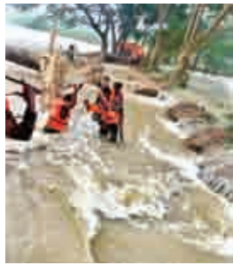
Indian Army personnel rescue flood-affected people at an area inundated with floodwaters, in Thoothukudi district, Wednesday.