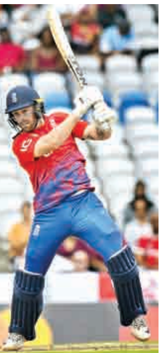
San Fernando, Dec 20 (AP):

World champion England set up a Twenty20 series-deciding match with the West Indies after crushing the fourth game by 75 runs. A second consecutive century by opener Phil Salt from a flying start with captain Jos Buttler set up England's highest T20 score of 267-3 on Tuesday.