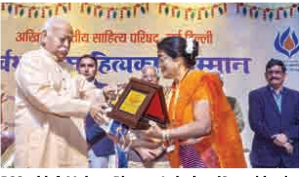
RSS chief Mohan Bhagwat during 'Sarvabhasha Sahityakar Samman' award ceremony organised by Akhil Bharatiya Sahitya Parishad, in Bhubaneswar, Wednesday.

Rashtriya Swayamsevak Sangh (RSS) chief Mohan Bhagwat on Wednesday urged people to converse in their mother tongue and respect it, instead of promoting foreign languages like English.