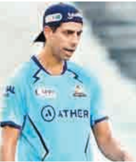
New Delhi, Dec 20 (PTI):

Gujarat Titans head coach Ashish Nehra admitted that it will be tough to replace a multi-faceted player like Hardik Pandya but banked on Shubman Gill to shoulder the responsibility of leading the side in next year's IPL.