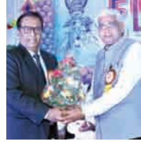
Central Chronicle News

Raipur, Dec 20: Cultural Excellence marks the annual function Euphoria 2023 at Shri Gujrati English Medium Higher Secondary School, Devendra Nagar here. It was a day when the students exhibited their artistic talent in the form of dance, music, song and skits. One after the other breath taking performances which was a mixed bag of dance from the west, north and east apart from raising cultural issues like Save Girl Child, Ruining Childhood and skit based on the teacher and students