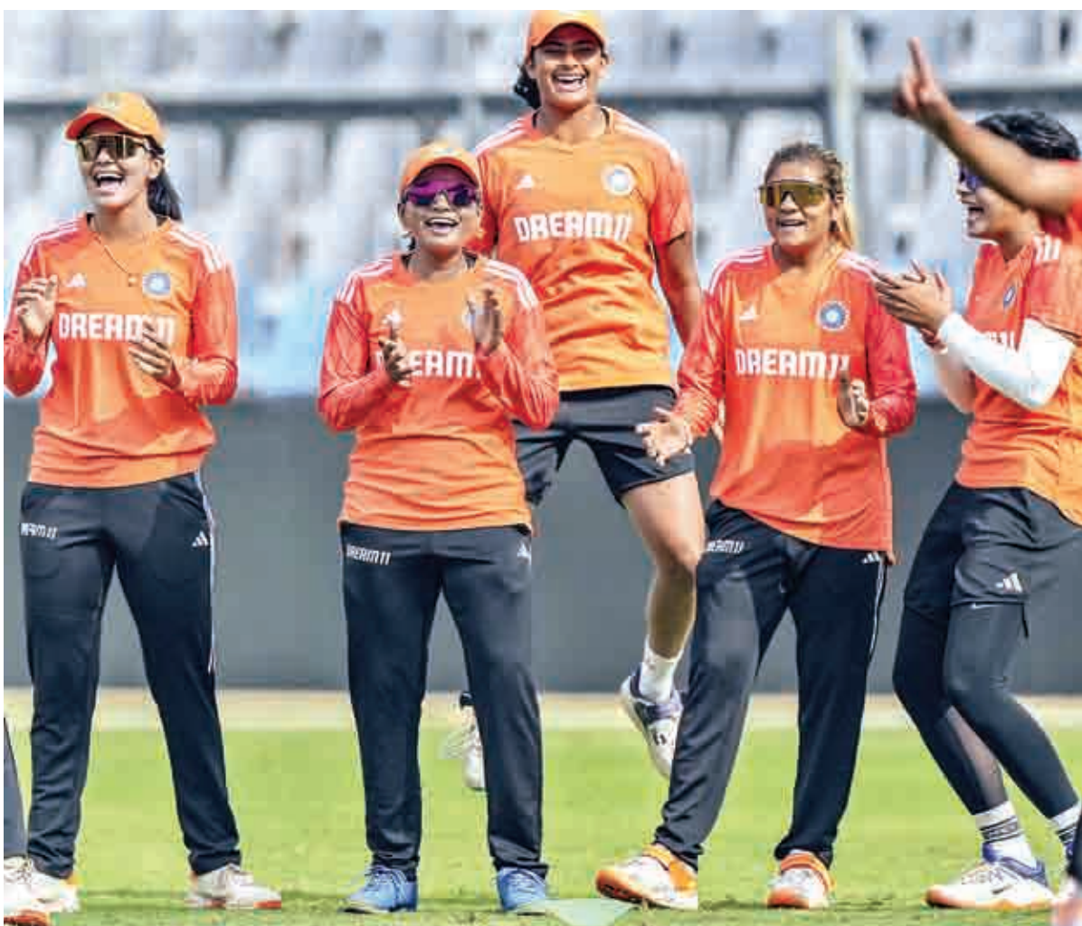
Mumbai, Dec 20 (PTI):

"When you are playing back-to-back Tests, it is important to recover and feel fresh. When you bat and bowl for three days the likes of Deepti (Sharma), Pooja (Vastrakar) who didn't get enough rest we try to take care of their loads," Kaur said.