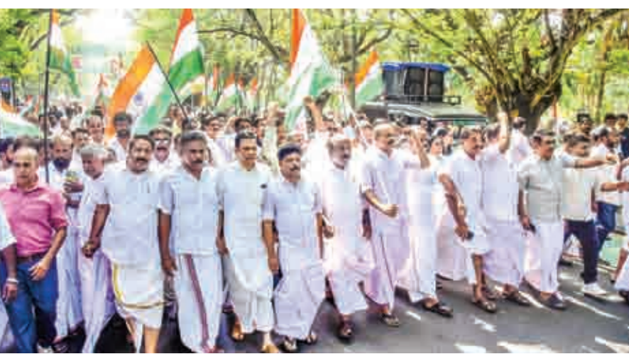
Congress workers march during a protest, in Kochi, Wednesday.

Thiruvananthapuram, Dec 20 (PTI): As the Nava Kerala Sadas of the Left government entered the southernmost district of Kerala, the heart of its capital turned into a battlefield between the police and activists of the Youth Congress (YC) on Wednesday.