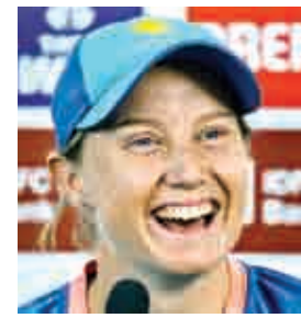
Mumbai, Dec 20 (PTI):

India are going to be an "incredibly" dominant side for a long period of time and her visiting side can only underestimate the hosts at their own peril, Australia captain Alyssa Healy said on Wednesday, ahead of the one-off women's Test here. It was here at the Wankhede that India and Australia played their last women's Test on these shores in February 1984.