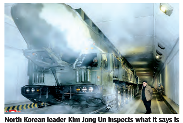
an intercontinental ballistic missile being prepared to launch from an undisclosed location in North Korea.