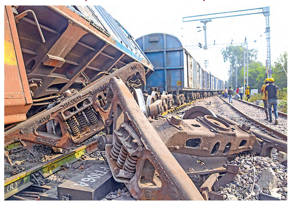
A derailed goods train near Shyam Nagar Chandari railway station, in Kanpur, Tuesday.