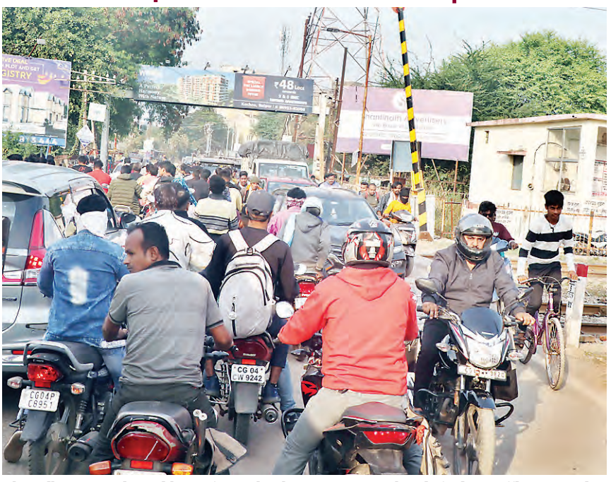
The railway crossing mid-way from Shankar nagar to Kachan is facing traffic congestion daily and there are no sign of proposed over-bridge to be constructed here.