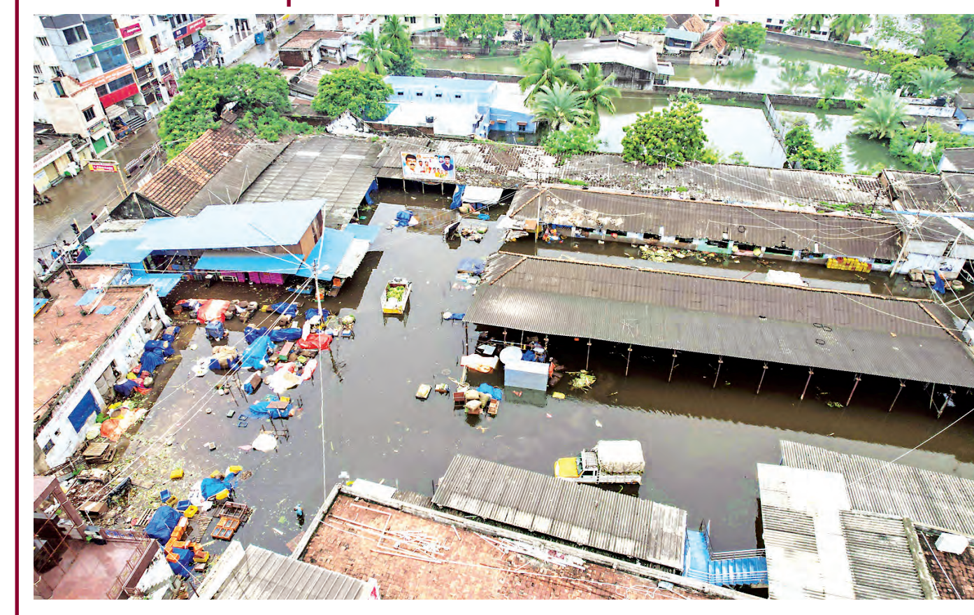
A flooded locality following rains in Thoothukudi, Tuesday, Dec. 19.