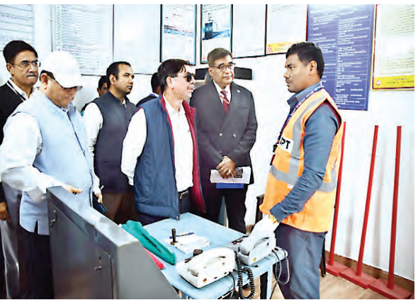
Central Chronicle News

Raipur/Bilaspur, Dec 19: General Manager of South East Central Railway, Alok Kumar, conducted a comprehensive inspection of railway development and safety-related projects Raipur within the Railway Division under the Amrit Bharat Station Scheme on December 18.