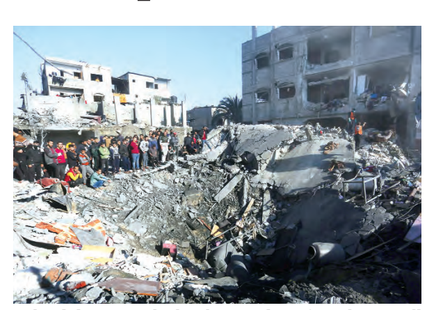
Palestinians watch the destruction after the Israeli bombardment of the Gaza Strip outside a morgue in Rafah, Tuesday, Dec. 19.

Assaults on ships in the Red Sea by Yemen's Iranbacked Houthi rebels have led major shipping companies as well as the oil and gas giant BP to suspend