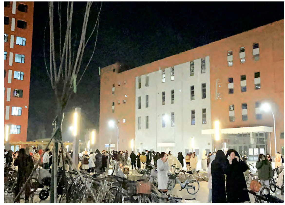
students gather outdoor after evacuating from their dormitories at the Lanzhou University Yuzhong campus in Lanzhou in northwestern China's Gansu province Tuesday, Dec. 19, after an earthquake hit the area. At least 100 were killed in a magnitude 6.2 earthquake in northwestern China, the country's state media reported on Tuesday.