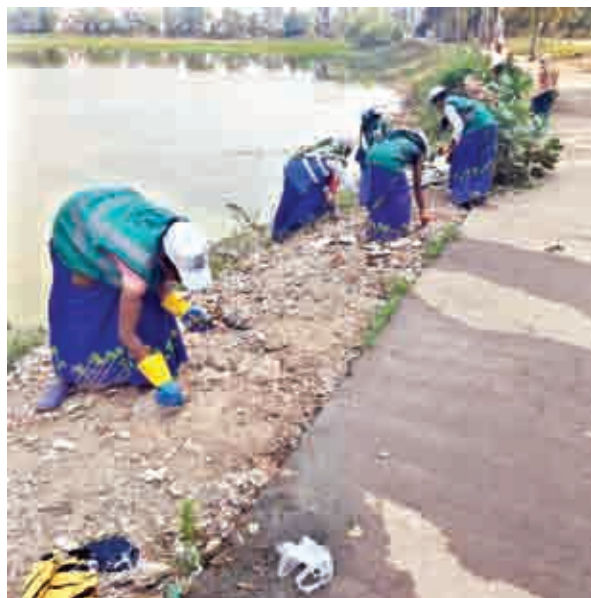
Headquarters Dhamtari, Navagaon Ward, Makeshwar Ward, Hatkeshwar Ward, Vivekananda Ward, Ambedkar Ward, Ward, Ward, Ward,

After the instructions of the Collector Municipal Corporation Commissioner Vinay Poyam, in various wards including Aama Pond, Baniya Pond, Corn Pond of District