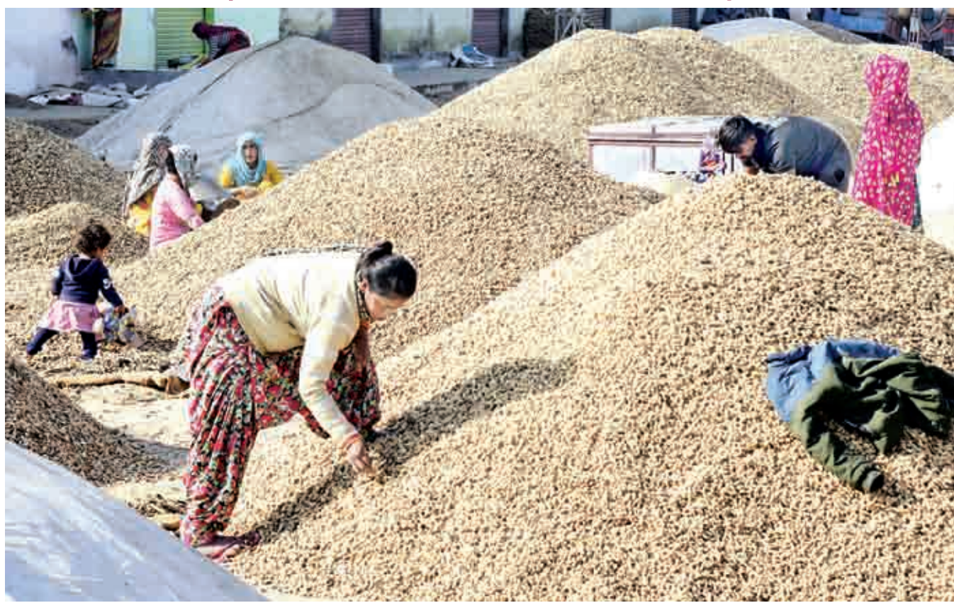
Workers sort groundnuts, at Anaj Mandi in Bikaner, Wednesday, Dec. 13.