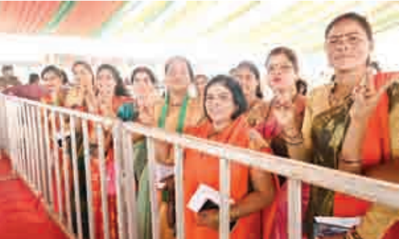
Raipur, Dec 13:

new era of all-round development in the geographically backward Surguja division.