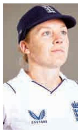
Navi Mumbai, Dec 13 (PTI):

England Women's captain Heather Knight said the one-off Test against India starting here on Thursday will be a huge unknown for both the teams and approaching the game with the right mindset will be crucial.