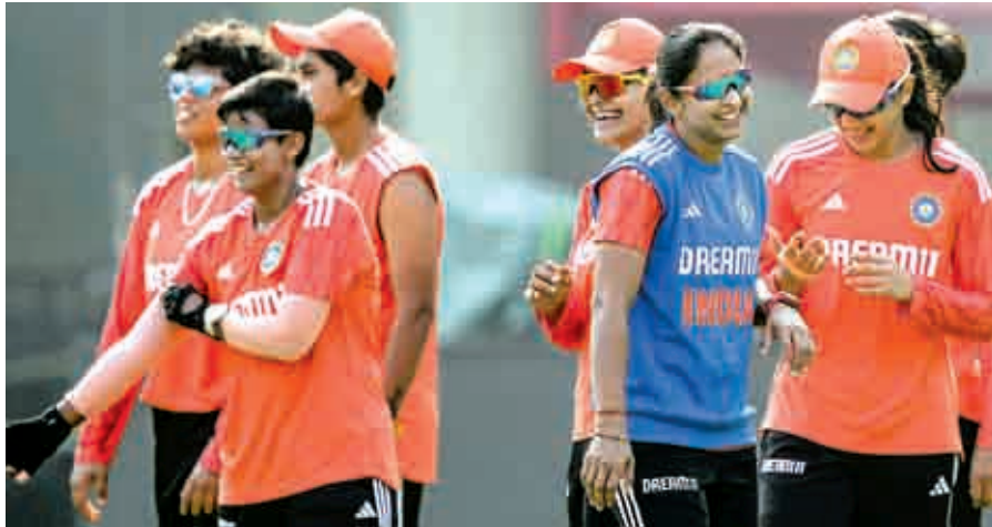
Time: 9:30am IST.

This Test holds special significance as it marks a double treat for Indian women's cricket. Given the scarcity of women's Test cricket, India has a reason to celebrate, with two Tests scheduled within a ten-day span. After facing England