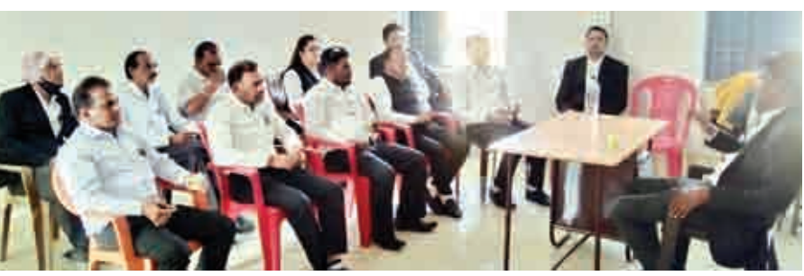
Bagbahra, Dec 13:

As per instructions from National Legal Service Authority (NLSA) New Delhi, Lok Adalat is being organised in all the Courts in the country. In this the cases which can be resolved through mutual consent are to be taken for prompt hearing and under this procedure for