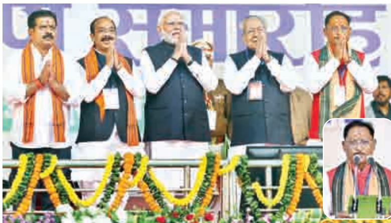
PM Modi, Governor Biswabhusan Harichandan, Chief Minister-designate Vishnu Deo Sai and Deputy CM-designate Arun Sao and Vijay Sharma during the latter's swearing-in ceremony, in Raipur (inset) CM Sai taking oath.

Governor Biswabhusan Harichandan administered the oath of office and secrecy to Sai, 59, and his two deputies during a grand swearing-in ceremony held at the Science College ground here attended by Prime Minister Narendra Modi, Union ministers Amit Shah, Nitin Gadkari and Ramdas Athawale, and BJP president JP Nadda. Uttar Pradesh Chief Minister Yogi Adityanath, his Assam counterpart Himanta Biswa Sarma, former Chhattisgarh chief minister Raman Singh and party leaders from other states attended the event which saw a gathering of around 50,000 people amid tight se-