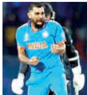
New Delhi, Dec 13 (PTI):

One of India's ODI World Cup heroes, pacer Mohammed Shami has been recommended for this year's Arjuna Award by the country's cricket board (BCCI), sources said on Wednesday. The 33-year-old had a spectacular run in the ODI World Cup, where India finished second best losing to Australia in the final. As per ministry sources, a special request was made by the BCCI to the Sports Ministry to include Shami's name as originally he didn't feature in the list of the country's second-highest sporting honour. Shami was the leading wicket-taker in the World Cup, with 24 wickets to his name from merely seven outings. After sitting out of the first four games, Shami shone bright when given the opportunity, claiming 24 wickets at an average of just 5.26.