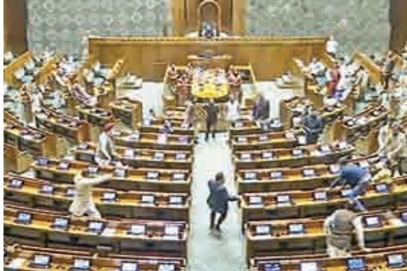
A visitor jumps in the Lok Sabha chamber from the public gallery during the Winter session of Parliament, in New Delhi, Wednesday.

In a major security breach on the anniversary of the 2001 Parliament terror attack, two persons on Wednesday jumped into the Lok Sabha chamber from the public gallery during Zero Hour and released yellow gas from canisters and shouted slogans before being overpowered by MPs.