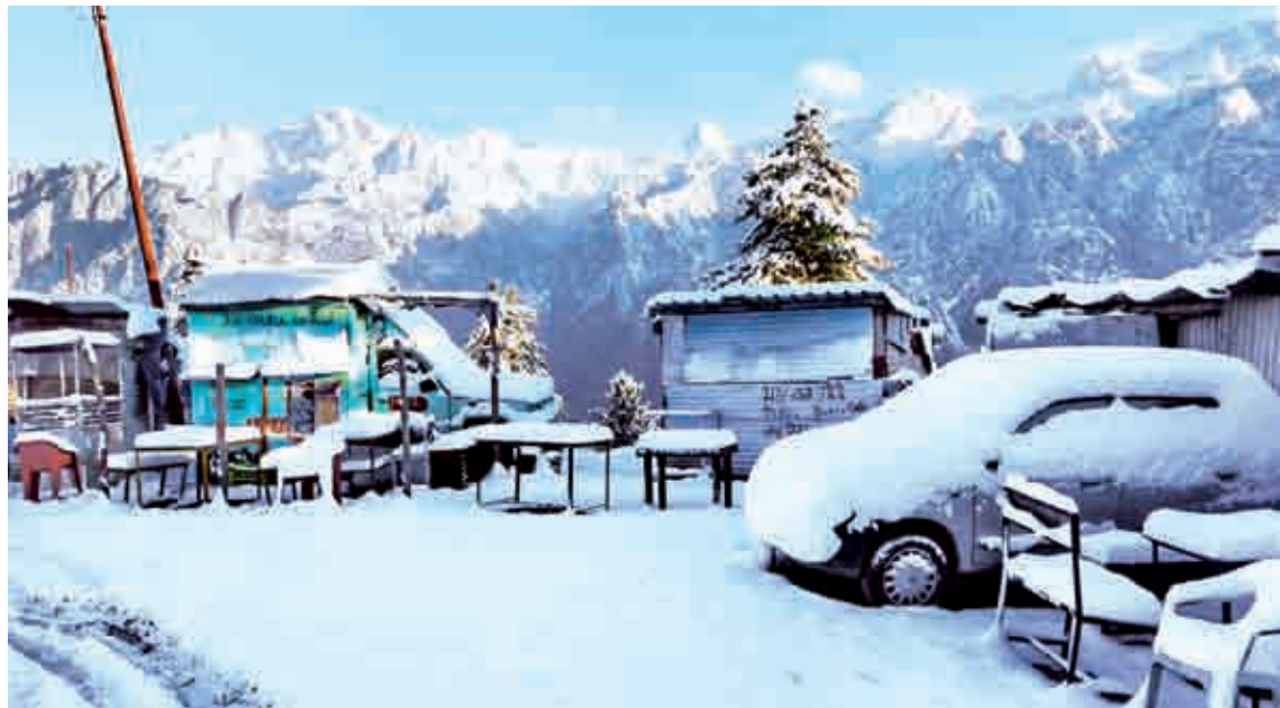
Roadside stalls and vehicles covered in snow after fresh snowfall at Auli, in Chamoli district, Wednesday.