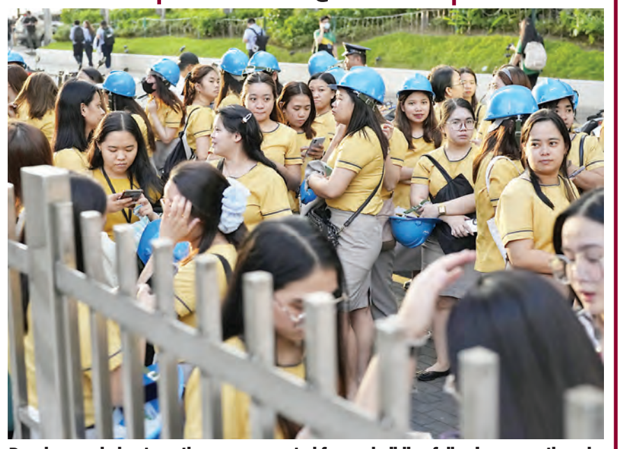
People wear helmets as they are evacuated from a building following an earthquake in Manila, Philippines on Tuesday, Dec. 5. A magnitude 5.9 earthquake occurred at Lubang municipality, about 150 kilometers (93 miles) southwest of Manila, in Occidental Mindoro province on Tuesday, the Philippine Institute of Volcanology and Seismology said.