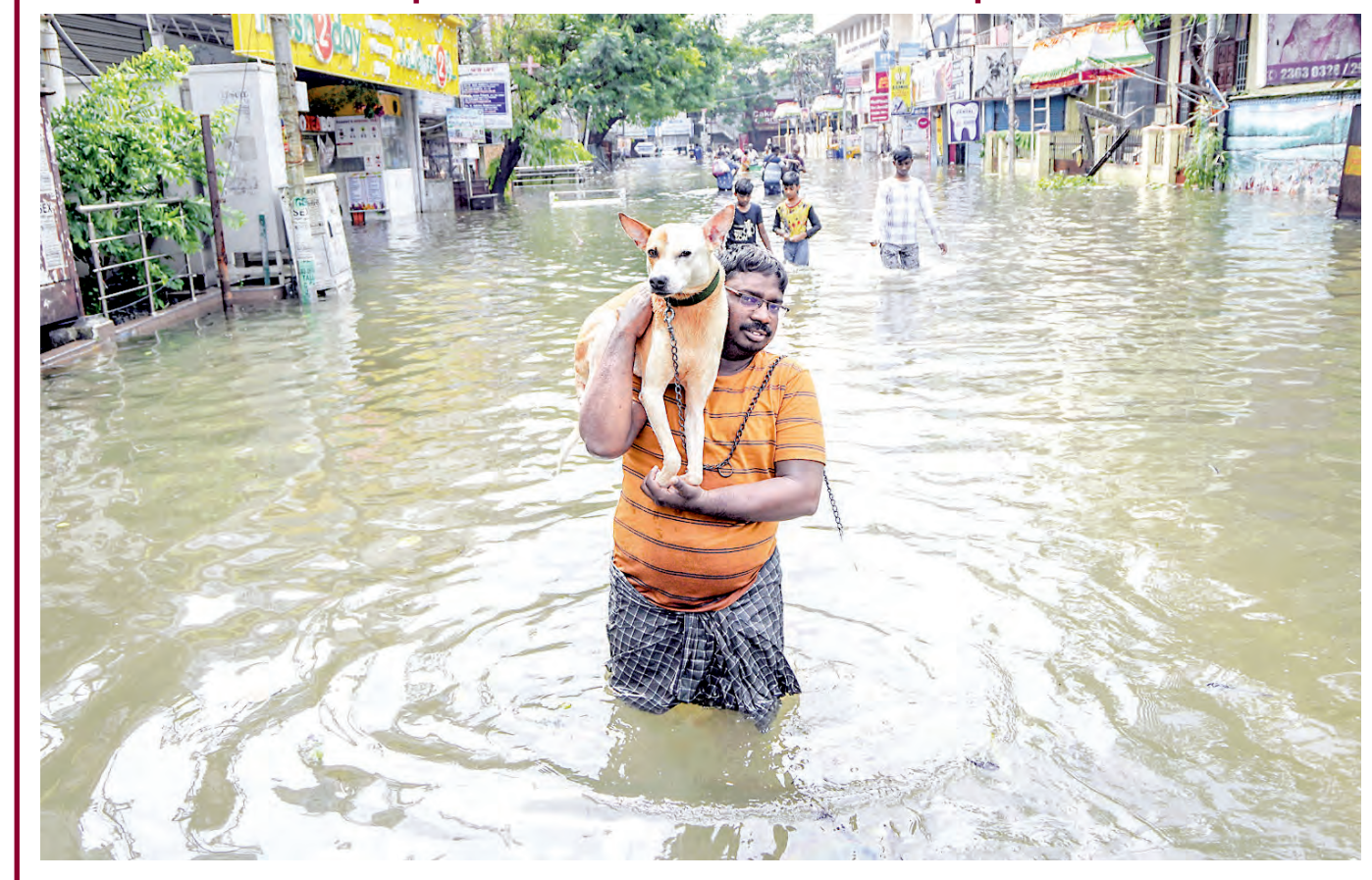
People wade through a flooded road after heavy rainfall owing to Cyclone Michaung, in Chennai, Tuesday, Dec. 5.