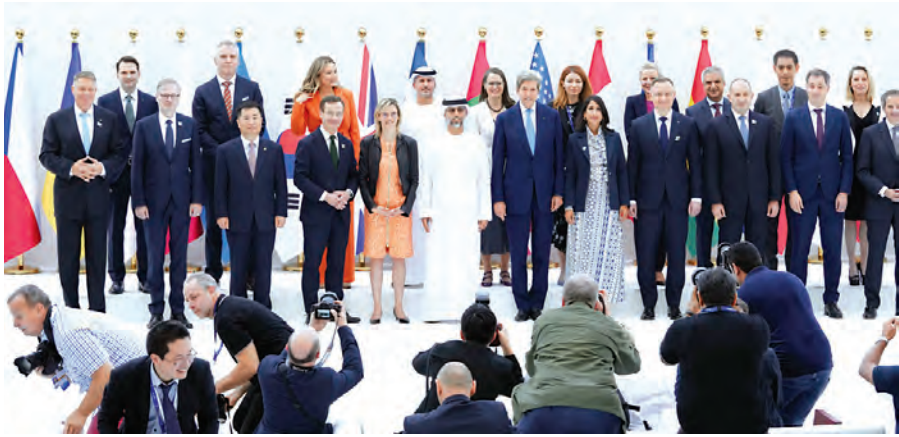
World leaders attend an event in support of tripling global nuclear capacity by 2050 at the COP28 U.N. Climate Summit, Saturday, Dec. 2 in Dubai, United Arab Emirates.