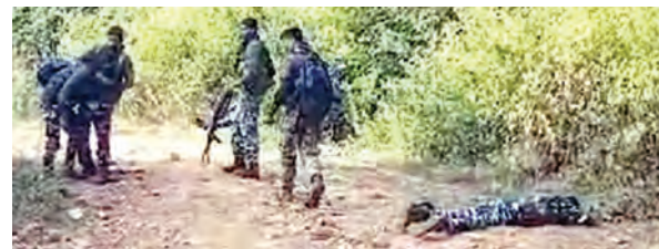
Injured jawan lying on the ground.

Dantewada, Dec 02: Two Central Reserve Police Force (CRPF) personnel were injured after an Improvised Explosive Device (IED) planted by Naxalites exploded in Dantewada district on Saturday, officials said.