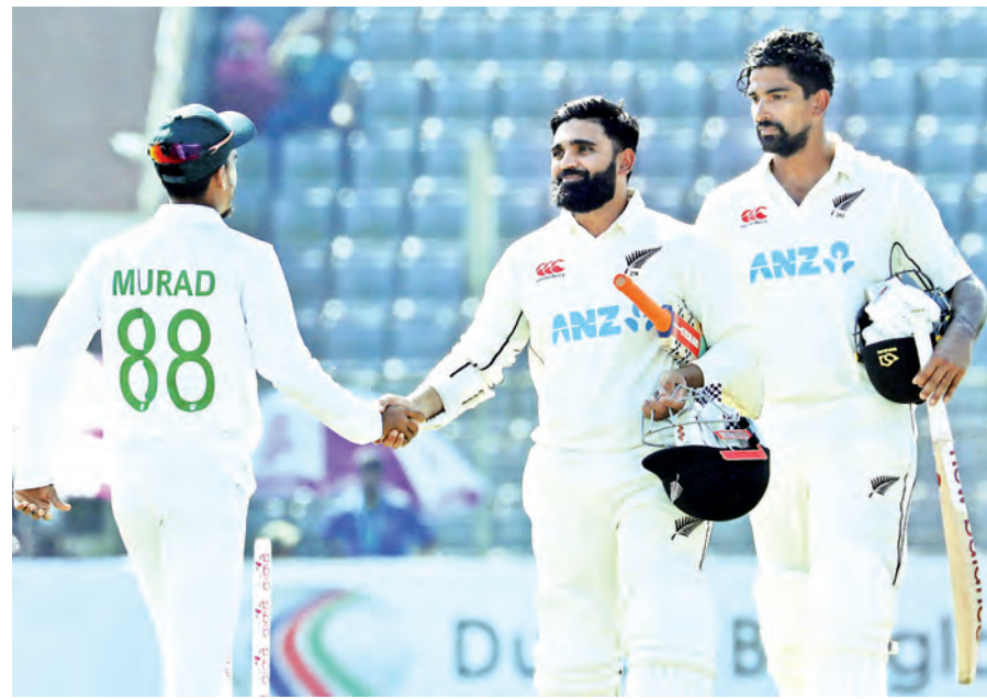
New Zealand cricketer Ajaz Patel, center, and Bangladeshi cricketer Hasan Murad shake hands at the end of the fifth day of the first test cricket match at Sylhet, Bangladesh, Saturday.

Daryl Mitchell battled to top-score for the visitors with a patient 58 from 120 balls.