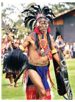
A member of a Naga tribe performs during the second day of Hornbill Festival, in Kohima, Nagaland, Saturday.