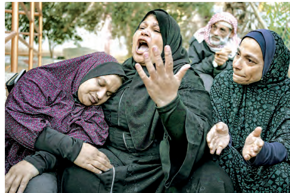
Palestinians mourn their relatives killed in the Israeli bombardment of the Gaza Strip, in the hospital in Khan Younis, Saturday, Dec. 2.

were focused on the Khan Younis area in southern Gaza, where the military dropped leaflets the day before warning residents to leave.