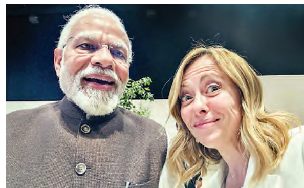
PM Modi with Prime Minister of Italy Giorgia Meloni at the COP28 UAE, in Dubai.

and attended the Presidency's session on Transforming Climate Finance, another high-level event on Green Credits Programme, and a Leadership Group for Industry Transition (LeadIT) event in Dubai. He met a slew of world leaders including Meloni,