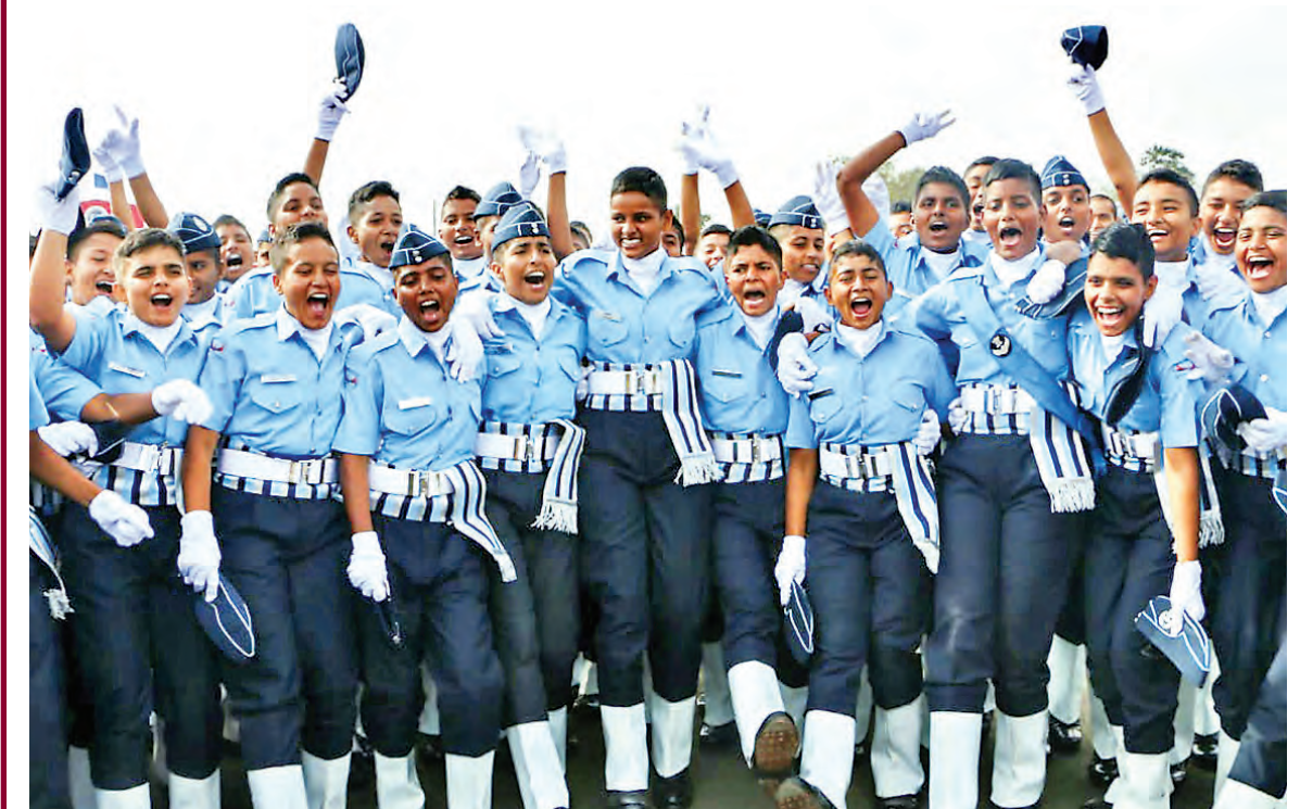
Agniveer Vayu trainees during their Passing Out Parade at Airmen Training School, in Belagavi district, Saturday.