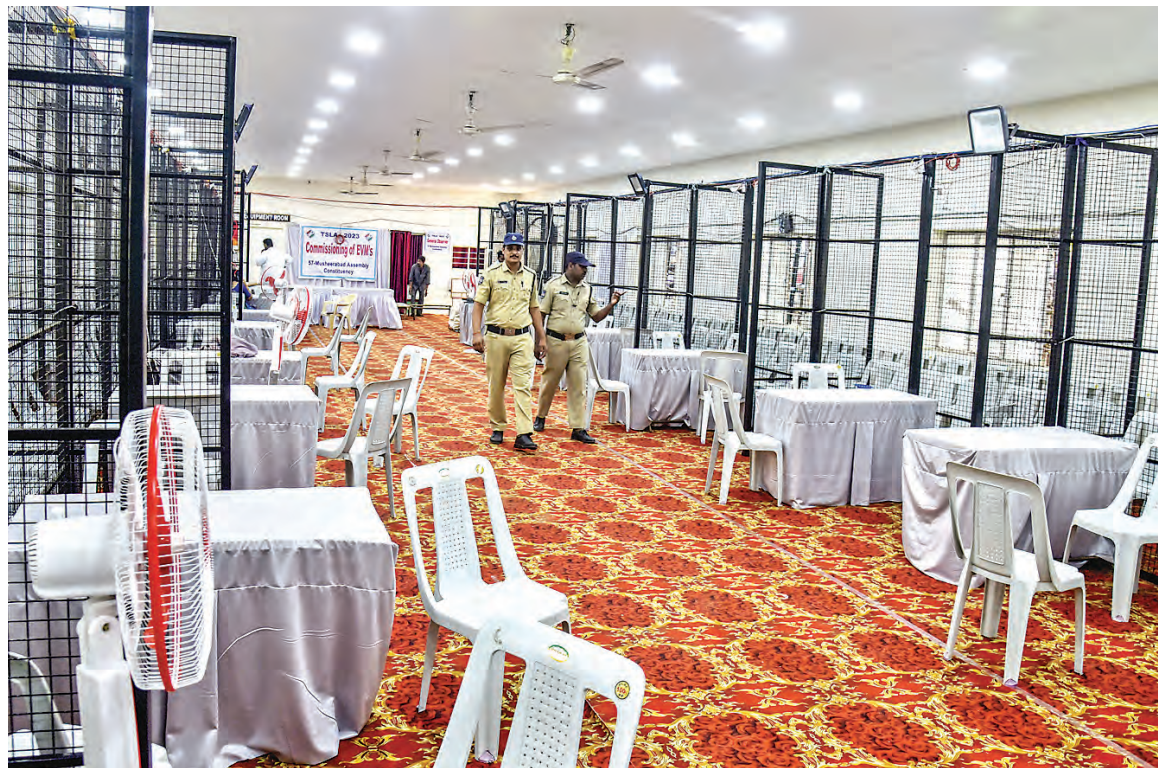
Policemen review arrangements for counting of votes for the Telanagna Assembly election, in Hyderabad, Saturday.