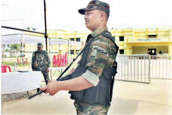
Security personnel outside a strong room where Electronic Voting Machines (EVMs) are kept, a day before the Chhattisgarh Assembly election results, in Jagdalpur, Saturday.

In every counting hall, there will be 14 tables arranged in rows of seven, except for Pandaria, Kawardha, Sarangarh, Bilaiagarh, Kasdol and Bharatpur-Sonhat Assembly seats where 21 tables will be arranged. While Kawardha and Kasdol constituencies will see 20 rounds of counting, the lowest, at 12, will be held in Manendragarh and Bhilai Nagar constituencies.