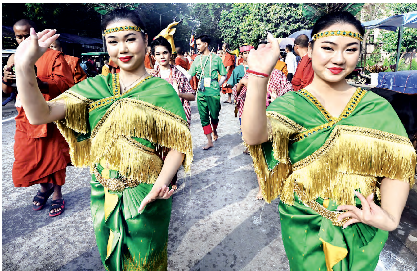
Artists during a holy procession of the 18th International Tipitaka Chanting ceremony at Bodh Gaya, in Gaya district, Saturday.