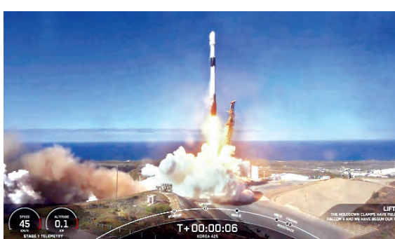
South Korea launches its first military spy satellite from Vandenberg Space Force Base, Calif., using SpaceX's Falcon 9 rocket, it was the first of five spy satellites South Korea plans to send into space by 2025 under a contract with SpaceX.

A ministry statement said the launch allowed the South Korean military to acquire an independent spaced-based surveillance system. It said the satellite would also help bolster the military's preemptive mis-