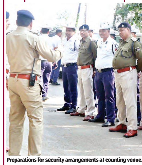
Preparations for security arrangements at counting venue.