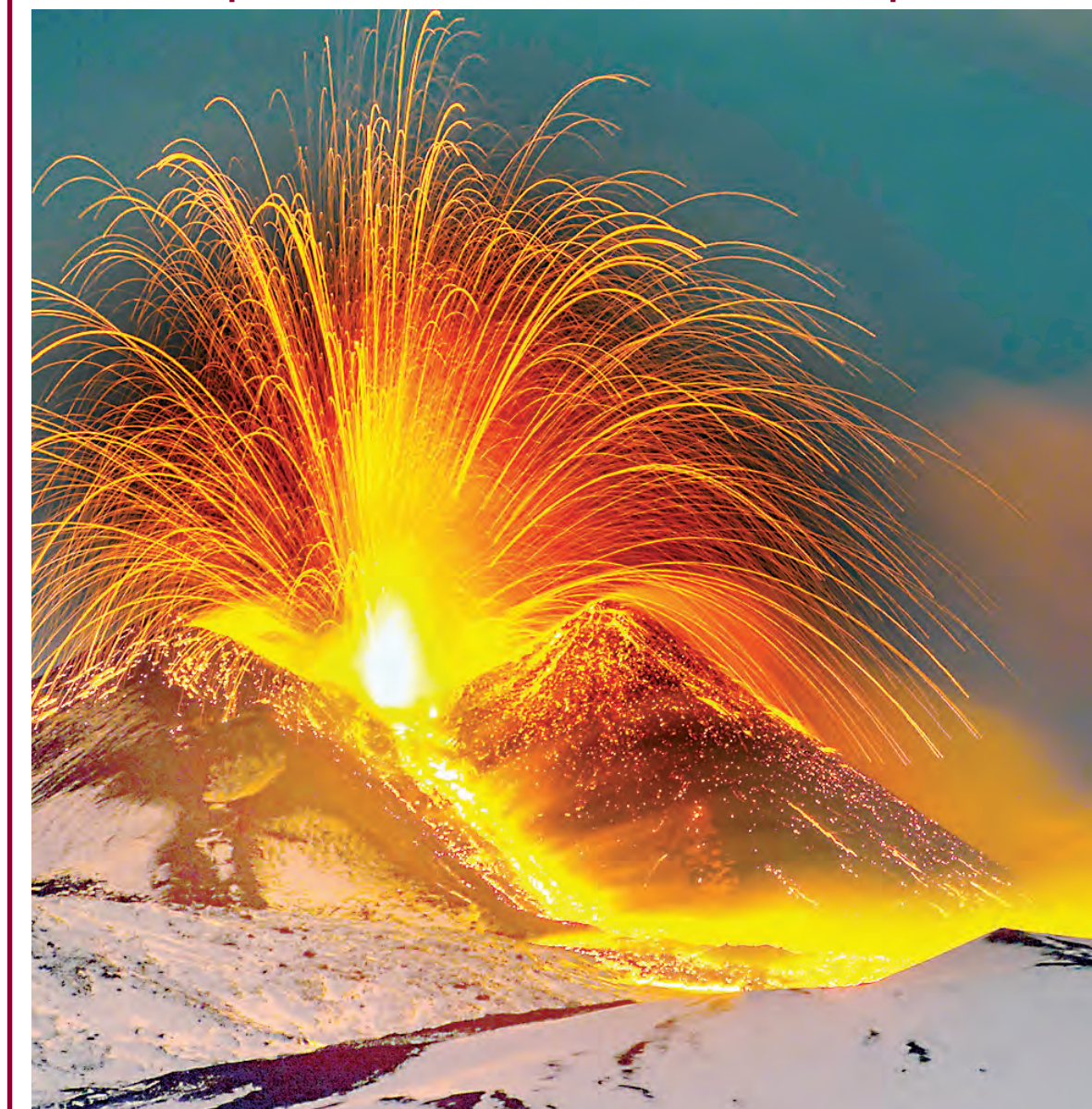
Lava erupts from Southeast crater on Mount Etna seen from Nicolosi near Catania, late evening Friday.