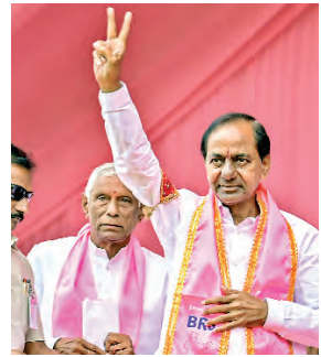
Telangana Chief Minister and BRS President K. Chandrashekar Rao at a public meeting during the 'Praja Ashirvada Sabha' election campaign ahead of Telangana Assembly elections, in Mancherla, Friday. to be held on November 30.

The Bharat Rashtra Samiti will smash a century, said Kavitha, daughter of Chief Minister K Chandrasekhar Rao, indicating that the party will cross the 100-seat mark in the 119-member State Assembly. Assembly polls in Telangana are scheduled