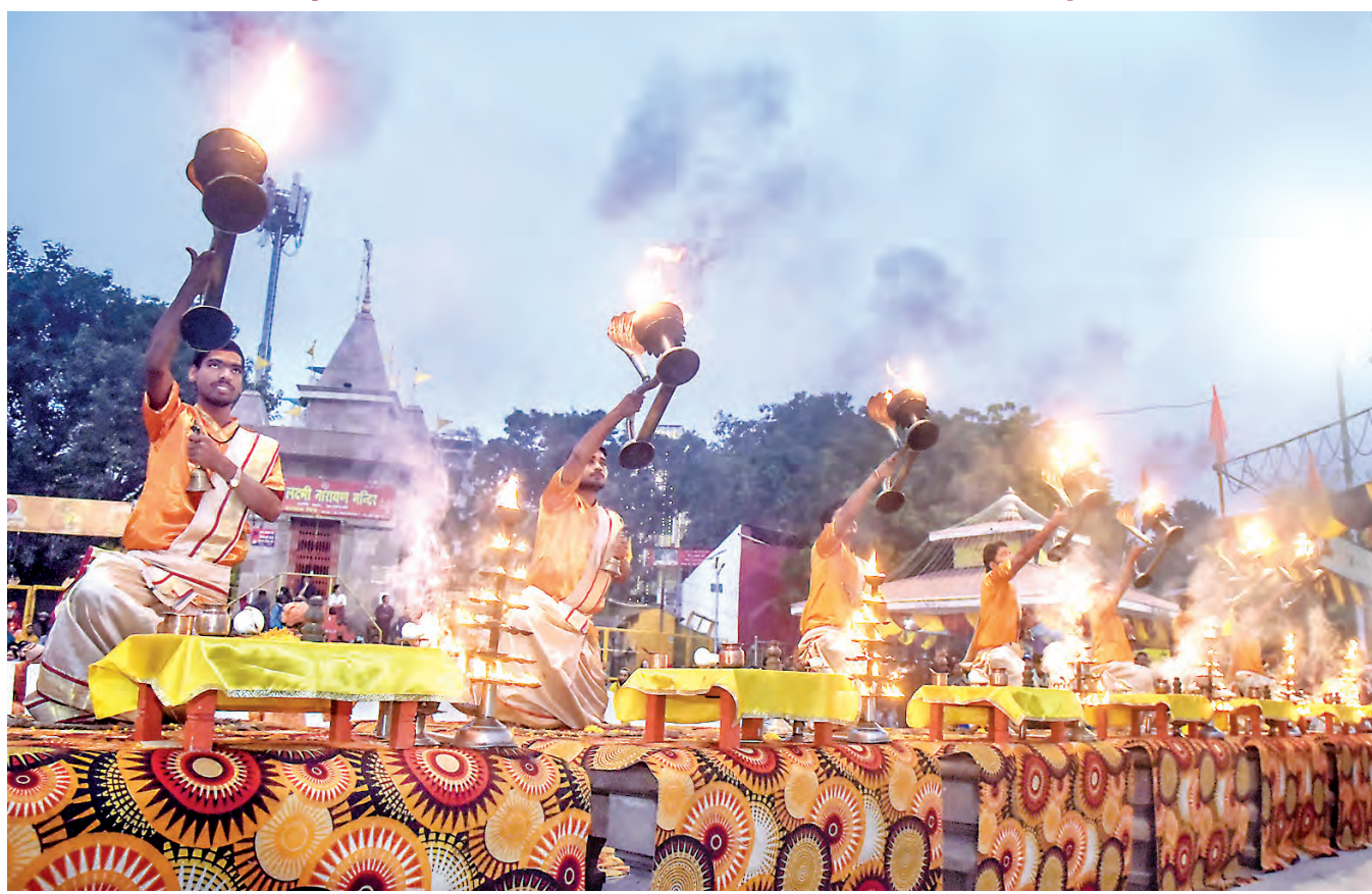
Priests offer prayers during 'Sapta Archak Maha Aarti', in Varanasi, Friday morning, Nov. 24.