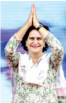
Congress general secretary Priyanka Gandhi during a public meeting ahead of the Telangana Assembly election, in Palakurthy, Friday.

She also charged the state government with corruption and not living