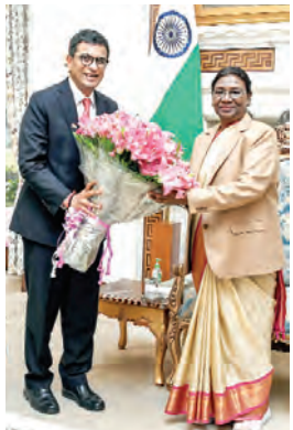
President Droupadi Murmu with Chief Justice of India (CJI) Justice D.Y. Chandrachud at Rashtrapati Bhavan, in New Delhi, Friday.