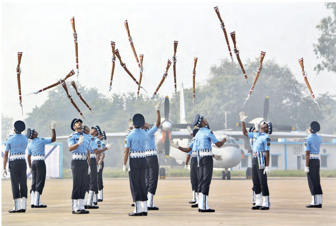
Air Force personnel during the 75th Foundation Day celebration of the Chakeri Air Force Station, in Kanpur, Friday.