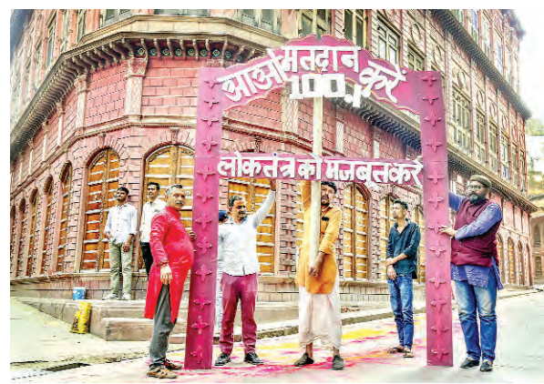
Artists take part in a demonstration to create voter awareness on the eve of Rajasthan Assembly elections, in Bikaner, Friday.