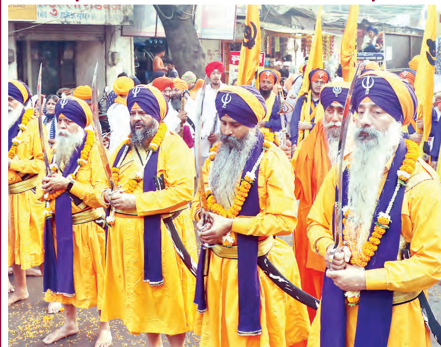
'Nagar Kirtan' procession was taken out on the occasion of Shri Guru Nanak Dev Ji Prakash Parv.