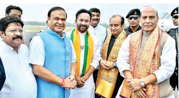
Defence Minister Rajnath Singh being received by Union Minister and Telangana BJP president G Kishan Reddy upon his arrival at Begumpet airport, in Hyderabad, Friday. Assam Chief Minister Himanta Biswa Sarma is also seen.