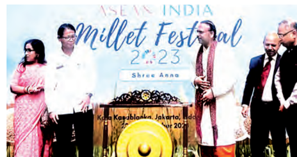
Officials during the launch of a five-day Millets Festival 2023 by India and ASEAN, a move aimed at raising awareness and creating a market for millets and millets-based products among the 10-member bloc, in Jakarta, Indonesia.

The Indian Mission to ASEAN (Association of Southeast Asian Nations) and the Ministry of Agriculture and Farmers' Welfare have jointly organised the ASEAN-India