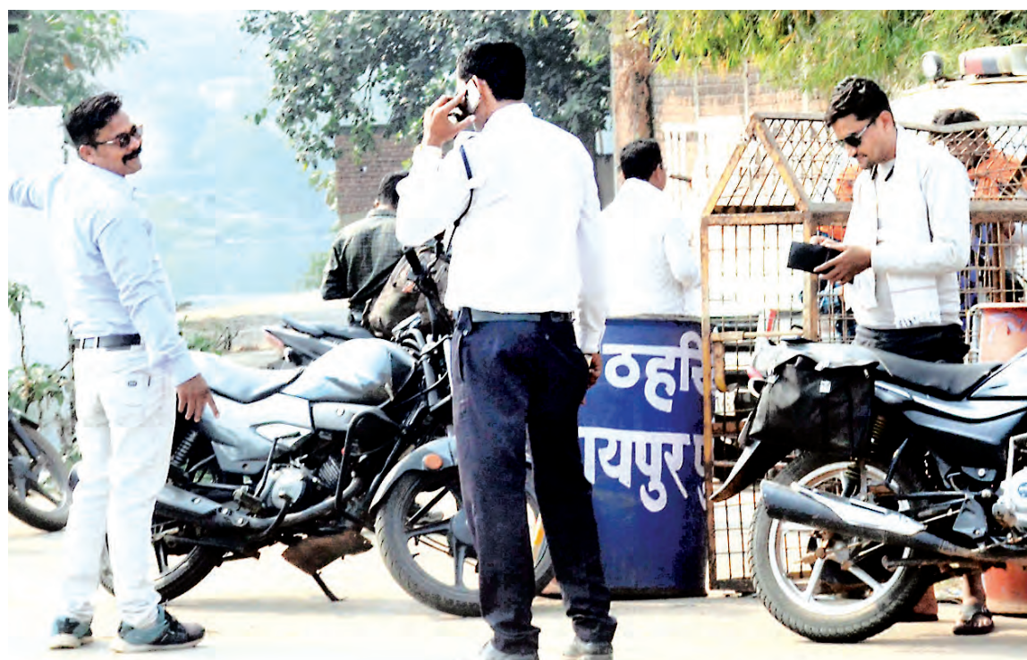
The Traffic police is conducting surprise checking at chowks and random places to ensure that all riders carry valid documents and have necessary driving licence.