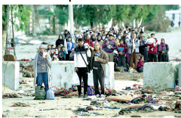
Palestinians flee to the southern Gaza Strip, on the outskirts of Gaza City, during the ongoing Israeli bombardment.

The diplomatic breakthrough promised some relief for the 2.3 million Palestinians in Gaza who have endured weeks of Israeli bombardment, as well as families in Israel fearful for the fate of their loved ones taken captive during Hamas' October 7 attack that triggered the war. Israel's national security adviser, Tzachi Hanegbi, announced the delay late Wednesday,