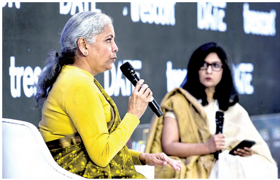
Finance Minister Nirmala Sitharaman speaks during an interaction at the inauguration of the Digital Acceleration and Transformation Expo (DATE), in New Delhi, Thursday, Nov. 23.

Allaying concerns about data security, she said, "Initially, there were some apprehensions that possi-