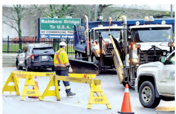
Trucks are positioned to block the entrance to the Rainbow Bridge border crossing between the U.S. and Canada, in Niagara Falls, Ontario, after a vehicle exploded at a checkpoint on the American side of the bridge.

The Niagara Frontier Transportation Authority posted on X, formerly Twitter, that all cars arriving at the Buffalo Airport