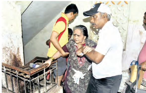
A senior citizen being evacuated from a 24-storey residential building where a fire broke out on the third floor, at Byculla area, in Mumbai, Thursday.

The blaze started around 3.40 am on the third floor of the building located inside New Hind Mill Compound at MHADA Colony in Ghodapdeo area. The flats in the building -- 12 on each floor -- have been allotted to former textile mill workers under a government scheme. Flames spread to the