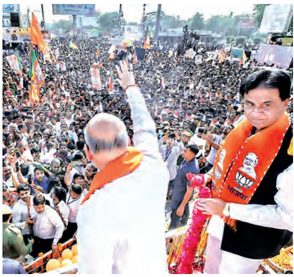
Union Home Minister Amit Shah acknowledges the crowd during a public rally at Nimbahera ahead of Rajasthan Assembly elections, in Chittorgarh district, Thursday.

Congress president Mallikarjun Kharge, party leaders Rahul Gandhi,