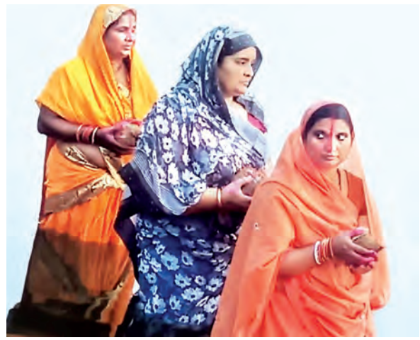
Dongargaon, Nov 23:

Various festivals of Hindu religion and India are celebrated with great enthusiasm on different dates. One of these is Chhath Puja, in which Chhathi Maiya is worshiped and Arghya is offered to the Sun God. This great festival is celebrated as a big festival in states like Bihar and Uttar Pradesh, and here in the region women of Dongargaon city also completed their puja by offering Arghya to the Sun God in the big pond of