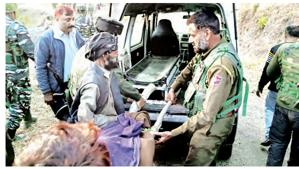
Army and police personnel shift bodies of two terrorists killed during an encounter at Bajimaal area, in Rajouri district, Thursday.