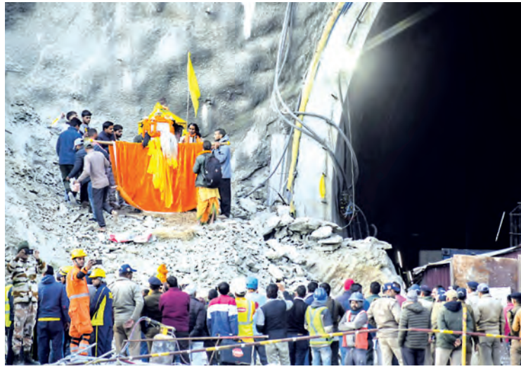
Locals carrying a deity on a palanquin offer prayers at the Silkyara Tunnel's entrance during the rescue operation of 41 workers trapped inside the tunnel, in Uttarkashi, Thursday.