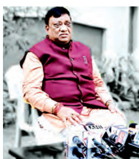
Raipur, Nov 23: