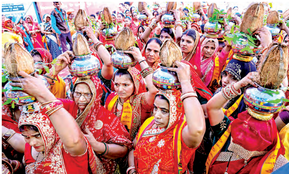
Devotees take part in a religious procession on the occasion of birth anniversary of Hindu deity 'Khatu Shyam', in Beawar, Thursday, Nov. 23.