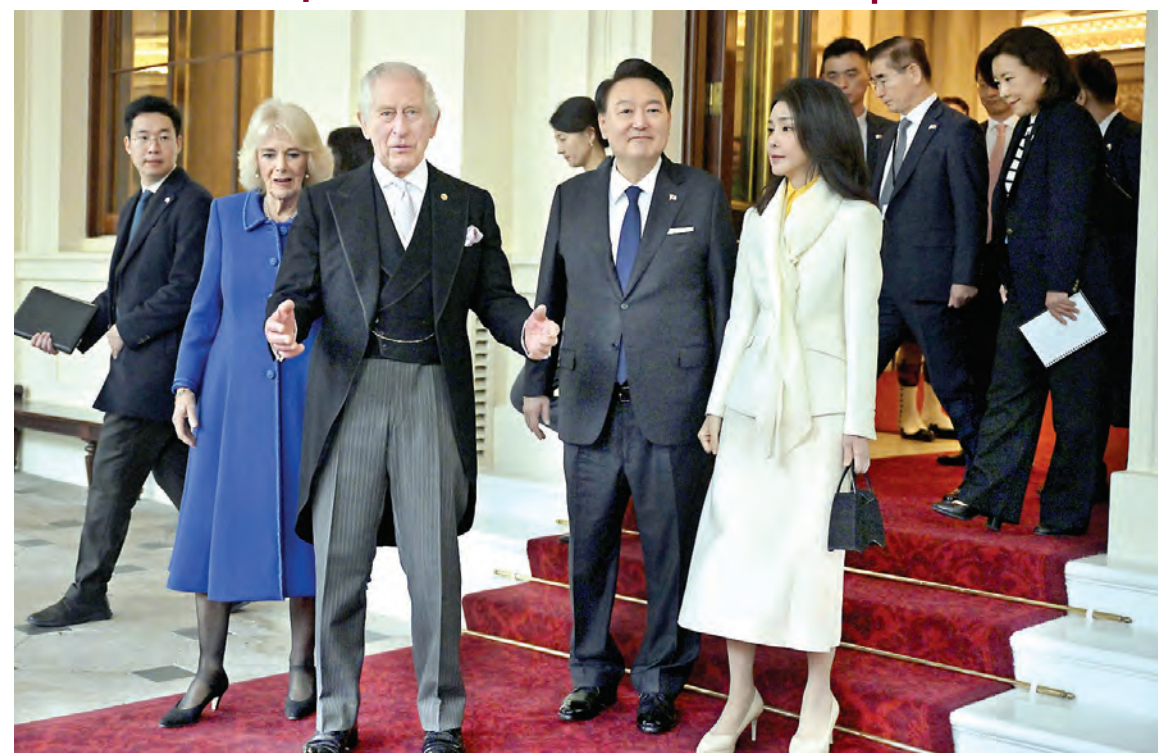
Britain's King Charles III reacts as he Britain's Queen Camilla give a formal farewell to South Korean President Yoon Suk Yeol and South Korea's First lady Kim Keon Hee at Buckingham Palace, in London on Thursday, Nov. 23, on their last day of a three-day state visit to the UK.