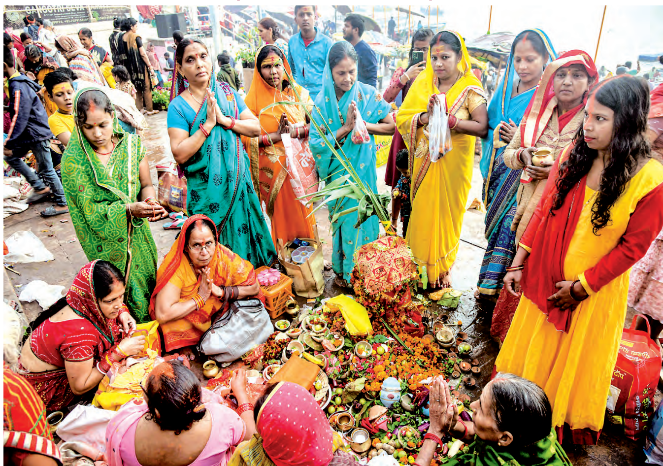
Devotees perform rituals during 'Tulsi Vivah' celebrations on the occasion of 'Devuthani Ekadashi', in Varanasi, Thursday, Nov. 23.