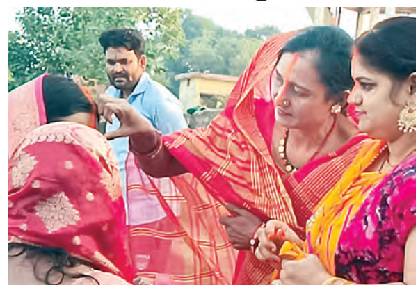
Kharora, Nov 23:

End of Chhath Puja, was marked by the end in which 36 hour long fast was concluded. On Monday morning, fasting women offered Arghya to the rising sun on Chhath, the festival of worship of Lord Surya, with this the four-day festival of Chhath came to an end.