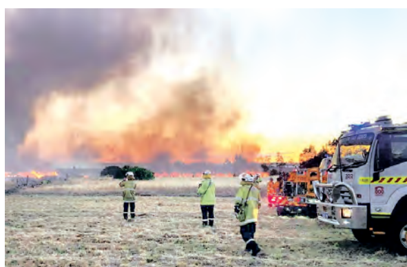
West Australian firefighters watch as grassland burns near the West Australian city of Wannaroo, north of Perth in the early hours of Thursday, Nov. 23.