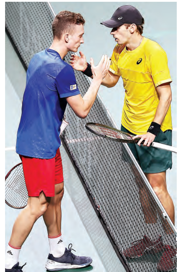
Australia's Alex De Minaur (R) shakes hands with Czech Republic's Jiri Lehecka water winning the second men's single quarter-final tennis match between Czech Republic and Australia of the Davis Cup tennis tournament at the Martin Carpena sportshall, in Malaga.

and put the boys on his back again, we're so proud of him. He had to dig really deep and yet again he saved us."