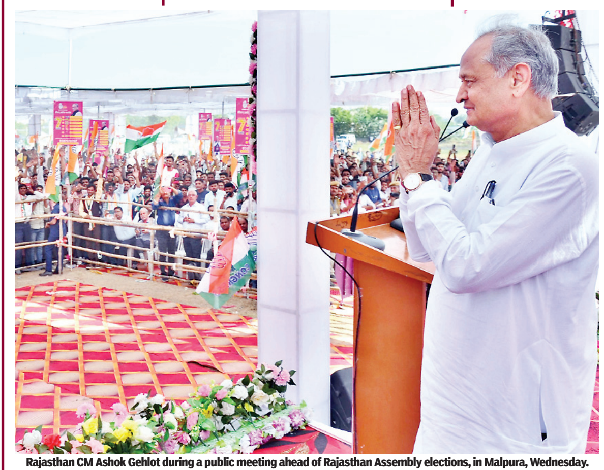
Rajasthan CM Ashok Gehlot during a public meeting ahead of Rajasthan Assembly elections, in Malpura, Wednesday.