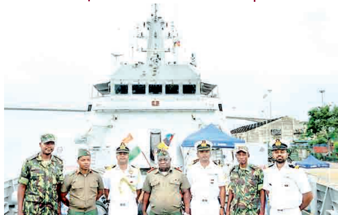
Personnel of India's and Mozambique's Navy pose for a photo after Indian Naval Ship Sumedha as part of its ongoing extended operational deployment to Africa, arrived in Maputo, Mozambique.