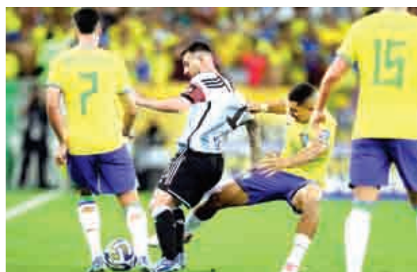
Brazil's Andre pulls the jersey of Argentina's Lionel Messi during a qualifying soccer match for the FIFA World Cup 2026 at Maracana stadium in Rio de Janeiro.

Messi left the pitch in the 78th minute amid a