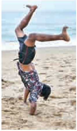
A young man does handstand at Ramakrishna beach in Visakhapatnam, Wednesday.