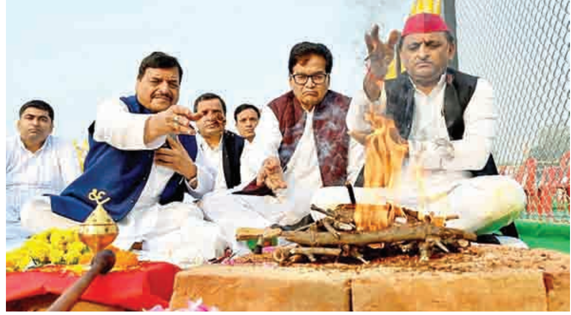
Samajwadi Party President Akhilesh Yadav with party leaders Ram Gopal Yadav and Shivpal Singh Yadav performs a 'havan' on the birth anniversary of his father and party founder Mulayam Singh Yadav, in Etawah, Wednesday.