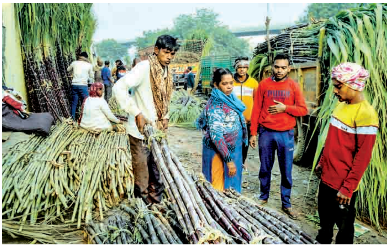
Retailers purchase sugarcane at a wholesale market ahead of 'Dev Uthani Ekadashi', in Agra, Wednesday, Nov. 22.