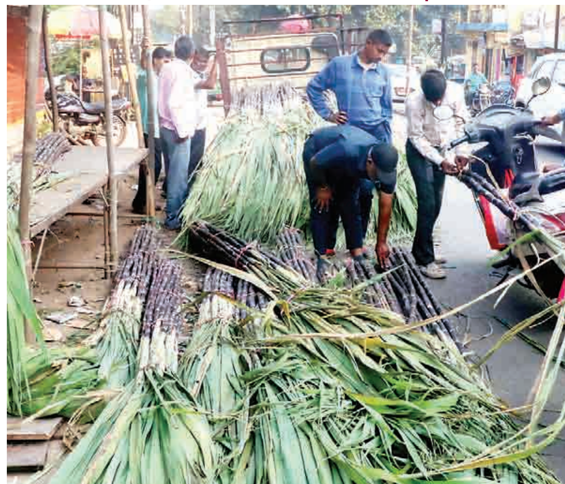
With the festival of 'Devuthani Ekadashi' tomorrow, the people were found taking pair of sugarcane for the rituals to be performed.