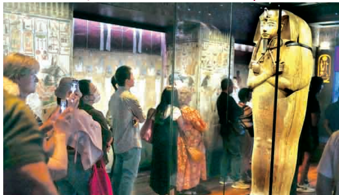
Visitors walk past the coffin of Ramses II, as part of the exhibition titled "Ramses & the Gold of the Pharaohs", at the Australian Museum in Sydney, Australia. The exhibition features a collection of artifacts including sarcophagi, animal mummies, jewelry, royal masks, amulets, and golden treasures showcasing the workmanship of Egyptian artisans.