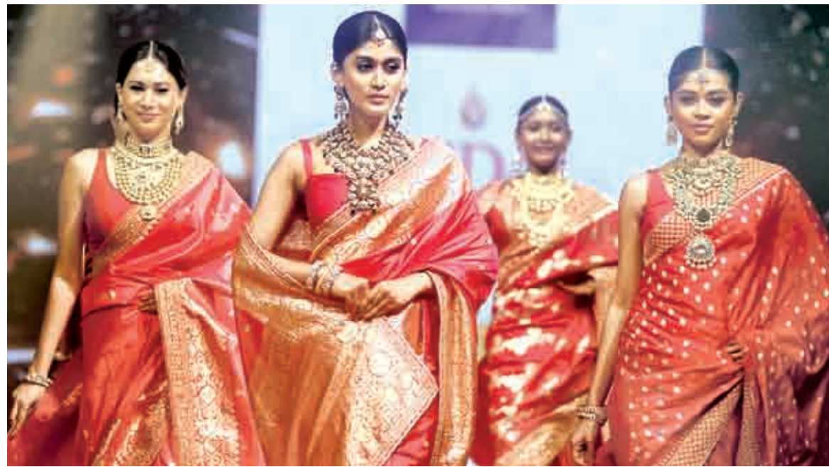
Models walk the ramp showcasing a collection of bridal jewellery during a fashion show, in Kolkata.