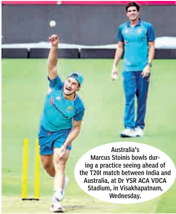
Australia's Marcus Stoinis bowls during a practice seeing ahead of the T20I match between India and Australia, at Dr YSR ACA VDCA Stadium, in Visakhapatnam, Wednesday.

Then there are IPL performers like Marcus Stoinis, Nathan Ellis, Tim David to name a few and