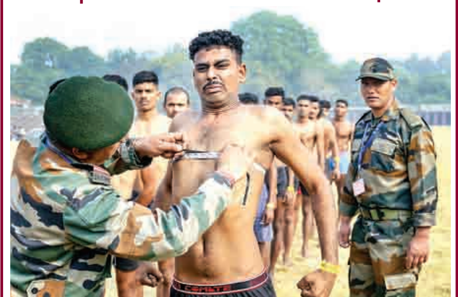
Candidates participate in physical examination for recruitment in the Indian Armed Forces under the Agniveer scheme, in Lucknow, Wednesday.