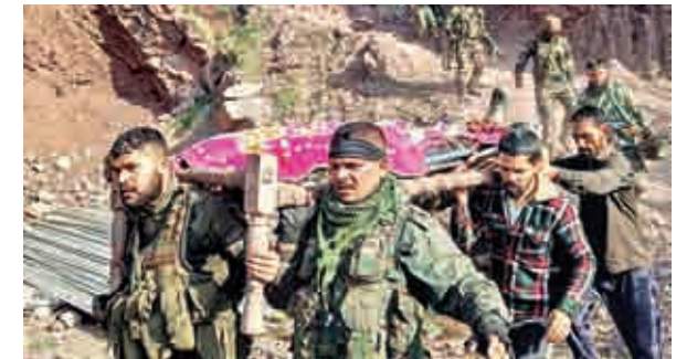
Army personnel and locals carry the body of an army officer near the site of an encounter with terrorists at Kalakote area, in Rajouri district, Wednesday.

suffered injuries, they said, adding the injured have been shifted to the Army's Command Hospital in Udhampur.