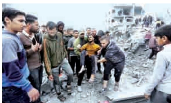
Palestinians evacuate survivors of the Israeli bombing in Rafah, Gaza Strip, Wednesday.