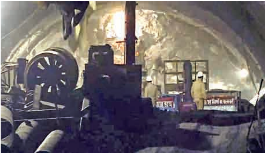
Drilling work underway at the Silkyara tunnel site during the rescue operation of 41 workers trapped inside the tunnel for 10 days, in Uttarkashi district, Wednesday.

In Delhi, a press release reporting the progress till 2 pm said the steel pipe