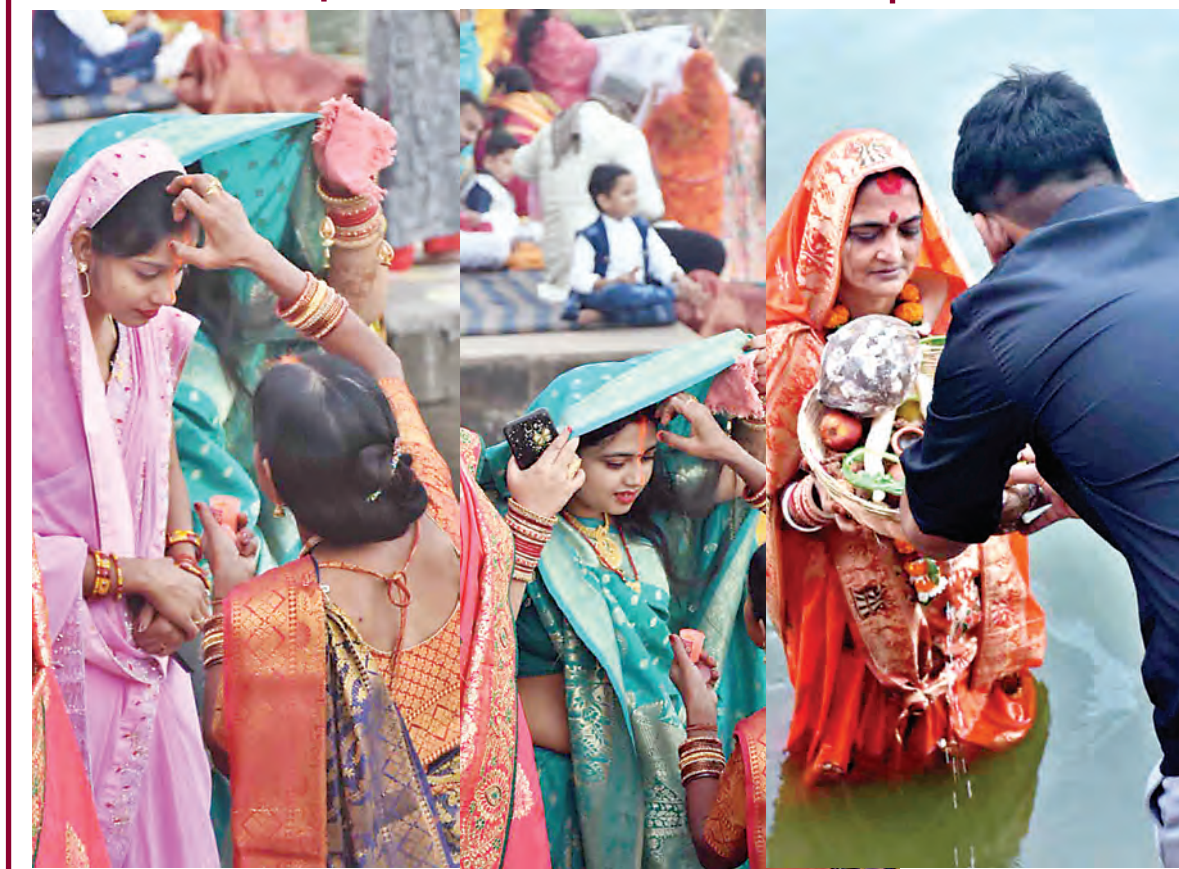
The devotees performed rituals on the last day of the 'Chhathi' festival on the banks of Kharun River here on Monday.