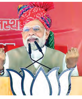
Jaipur, Nov 20 (PTI):

Prime Minister Narendra Modi on Monday said the Congress government in Rajasthan cannot think of anything except appeasement politics and wants to eradicate sanatana dharma. Ahead of the November 25 assembly polls in Rajasthan, the prime minister addressed rallies in Pali district and in Pilibanga in Hanumangarh district on Monday. At the election rally in