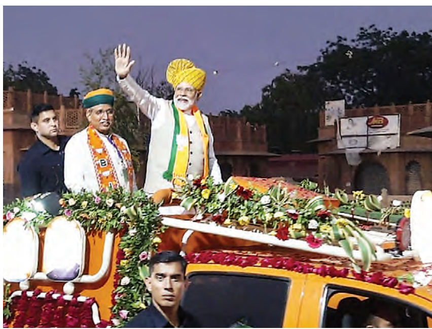
PM Modi during a road show ahead of Rajasthan Assembly elections 2023, in Bikaner, Monday.