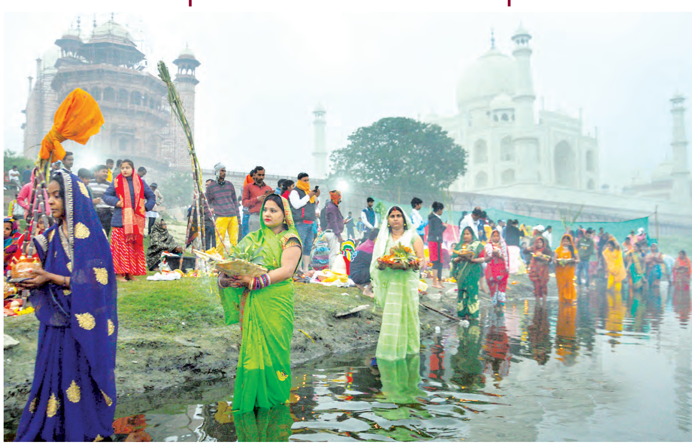
Devotees perform rituals of 'Chhath Puja' on the bank of Yamuna river, near Taj Mahal in Agra, Monday, Nov. 20.