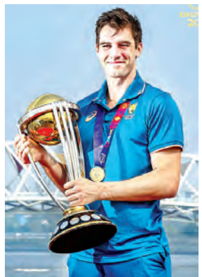
Australian captain Pat Cummins poses with the ICC Men's Cricket World Cup trophy during a photo shoot at the Atal Pedestrian Bridge, Sabarmati Riverfront, in Ahmedabad, Monday.

Cummins, along with International Cricket Council (ICC) officials, reached the iconic Sabarmati Riverfront in the morning and boarded a floating restaurant named