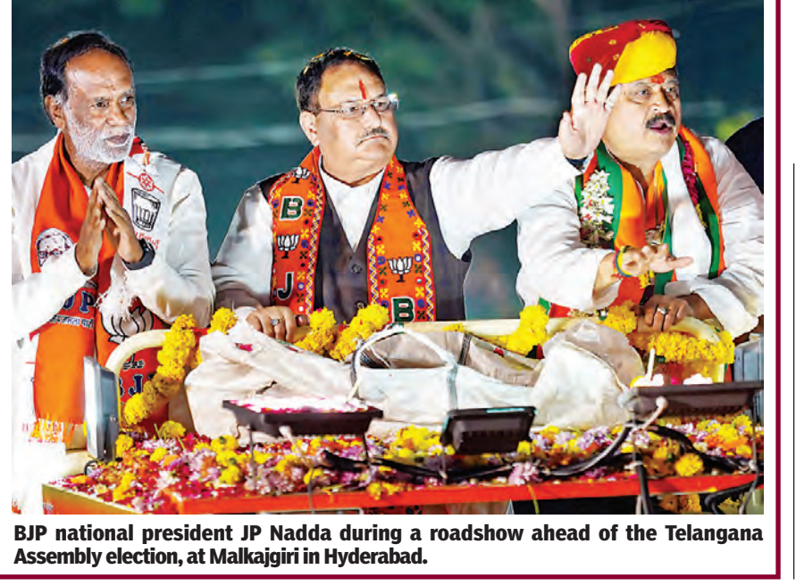
BJP national president JP Nadra during a roadshow ahead of the Telangana Assembly election, at Malkajgiri in Hyderabad.