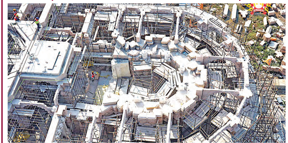
Aerial view of under construction Shri Ram Janmabhoomi Mandir, in Ayodhya.