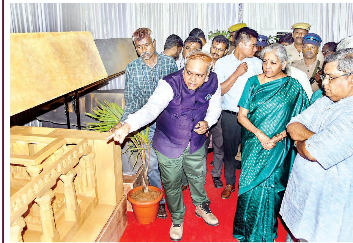
Finance Minister Nirmala Sitharaman during the inauguration of a photo exhibition on the occasion of World Heritage Week at Thiagarajar College, in Madurai, Tamil Nadu, Monday, Nov. 20.