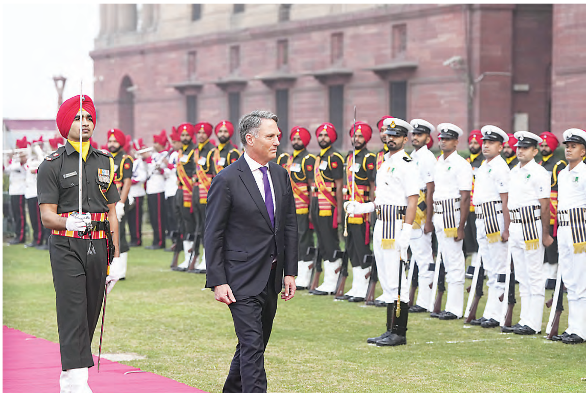
Australian Deputy Prime Minister and Defence Minister Richard Marles inspects tri-service Guard of Honour at South Block, in New Delhi, Monday,