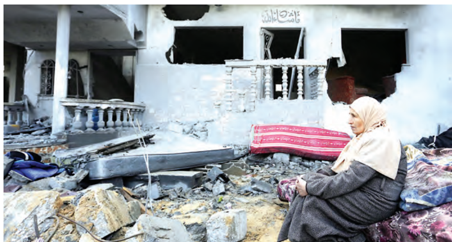
A Palestinian woman sits by houses destroyed in the Israeli bombardment of the Gaza Strip in Rafah on Monday.

The fighting came a day after the World Health Organization evacuated 31 premature babies from Shifa Hospital in Gaza City, the territory's largest, where they were among