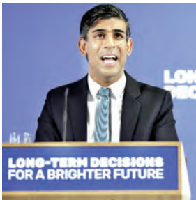
Britain's Prime Minister Rishi Sunak delivers a speech at a college in north London, Monday.

Sunak was joined by ministers, diplomats and philanthropists from about 20 countries at a one-day Global Food Security Summit in London, where he urged world leaders to harness artificial intelligence and other cutting-edge technology to end malnutrition around the globe.