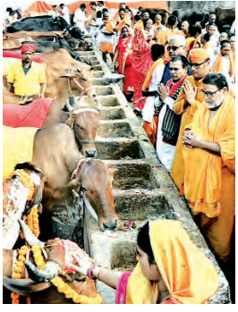
Devotees worship cows on the occasion of 'Gopashtami', in Varanasi, Monday.