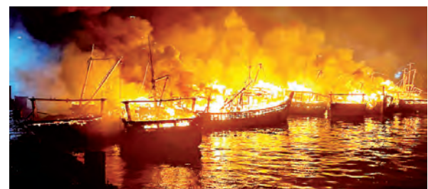
Flames and smoke rise after a fire broke out in a jetty area, in Visakhapatnam, early Monday.