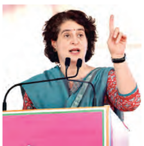
poll rally at Sagwara in Durgapur district.

"The BJP is a scattered party in Rajasthan and it does not have a face for the chief minister's post. The prime minister is roaming every corner of the state. Sometimes, it seems that he is out to find his chief ministerial face," Gandhi said while addressing a