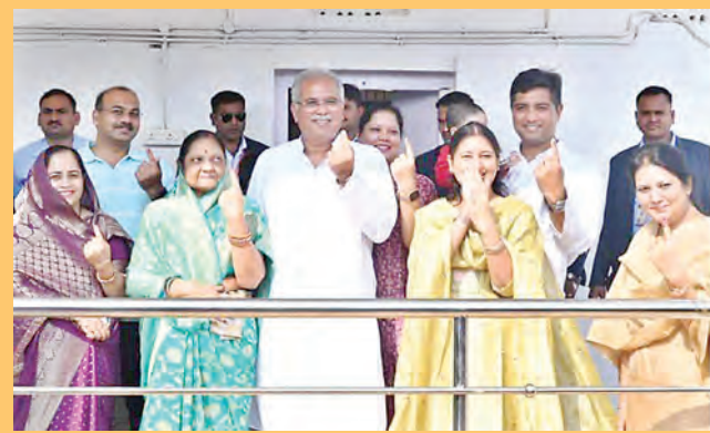
CM Bhupesh Baghel with his family