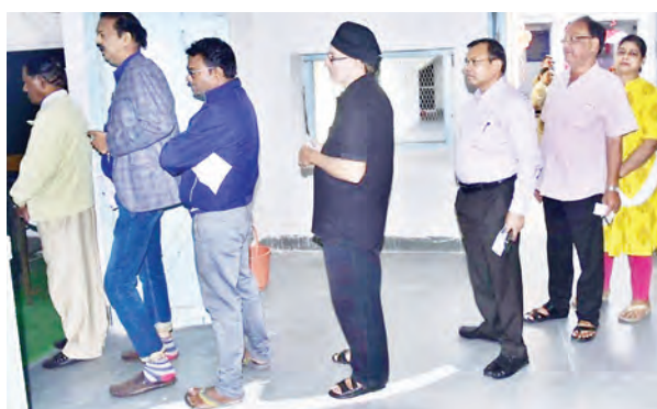
Central Chronicle News

Till 5:00 pm; Divisional Comm, Collector, SP cast their votes, took selfie