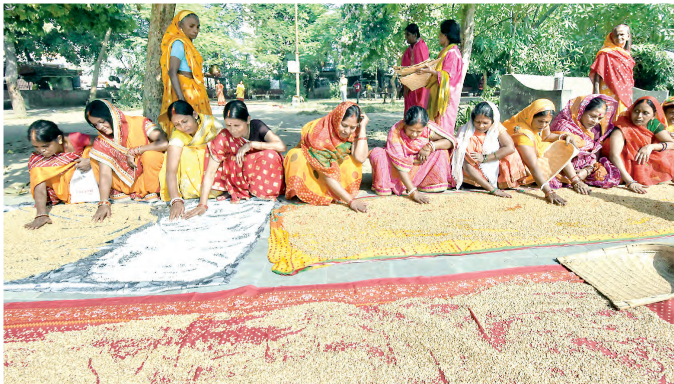
Devotees dry wheat for preparing food during the celebration of 'Chhath Puja' festival, in Patna, Friday, Nov. 17.