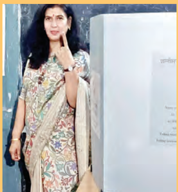
Rajya Sabha member Saroj Pandey