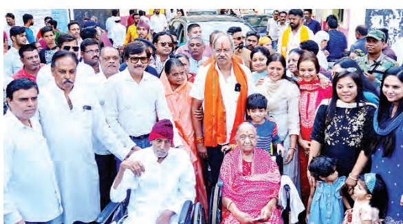
Dharshiwa registered highest nearly 72% voting