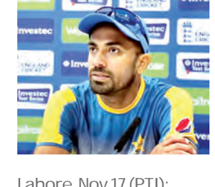
Lahore, Nov 17 (PTI):

The Pakistan Cricket Board on Friday named the country's former fast bowler Wahab Riaz as their new chief selector, a week after accepting the resignation of legendary batter and ex-captain Inzamam ul Haq. Inzamam had on October 30 resigned as the chairman of the national selection committee after the PCB initiated an inquiry to probe if his association with a company that manages a number of national team players amounted to conflict of interest.