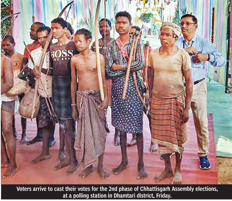
Voters arrive to cast their votes for the 2nd phase of Chhattisgarh Assembly elections, at a polling station in Dhamtari district, Friday.

lowed to exercise their franchise, the EC noted,