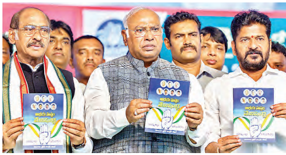
Congress President Mallikarjun Kharge with Telangana Congress president A Revanth Reddy and AICC Telangana in-charge Manikrao Thakare releases the party's manifesto ahead of Telangana Assembly elections, in Hyderabad, Friday.

The six guarantees of the Congress include the promise of Rs 2,500 per month and gas cylinders at Rs 500 for women, as well as 200 units of free electricity for all households, if the party comes to power in the state after the November 30 polls.