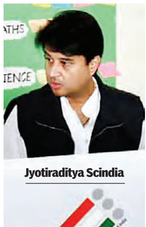
Congress government under state party chief Kamal Nath, which came to power after the assembly polls in 2018, collapsed in March 2020 following a revolt by several MLAs loyal to Scindia. It paved the way for the return of Shivraj Singh Chouhan as the chief minister, while the rebel MLAs and Scindia joined the BJP.

The civil aviation minister also said that the people of the state would make Bharatiya Janata Party (BJP) win this election with full majority in order to secure their future, and for development and progress. The BJP has not projected any chief ministerial face in the state, where polling for the 230-member assembly is currently underway. The