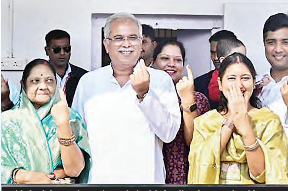
Chief Minister Bhupesh Baghel with family after casting his vote.

Chief Minister Bhupesh Baghel cast his vote in Kurruddih village in his constituency Patan Durg district. Talking to reporters ahead of voting, Baghel said his party will win 75-plus seats (in the 90-member assembly) and there is a one-sided contest in Patan Segment. In Baghel's turf Patan the BJP has fielded his distant nephew and party MP Vijay Baghel. The candidature of Janata Congress Chhattisgarh (J) state president and son of former chief minister Ajit Jogi, Amit Jogi, in Patan has added a new dimension to