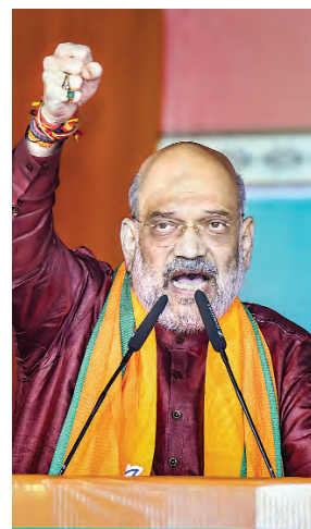
from Delhi swiped the card to withdraw money. Such a government should be ousted," Shah said.

"The Gehlot government ran an ATM to swipe card and withdraw money. The Congress party turned Rajasthan into an ATM where its leaders