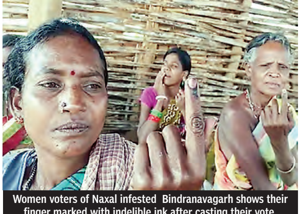
Women voters of Naxal infested Bindranavagarh shows their finger marked with indelible ink after casting their vote.