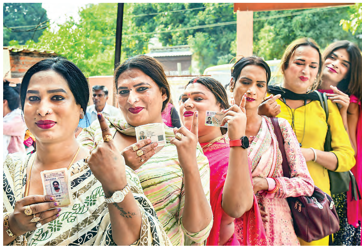
Voters from the transgender community show their fingers marked with indelible ink after casting their votes during Madhya Pradesh Assembly elections, in Jabalpur, Friday.