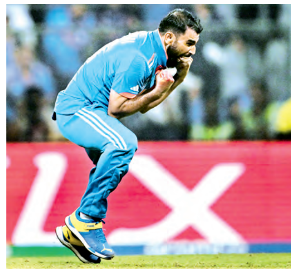
Ahmedabad, Nov 17 (PTI):