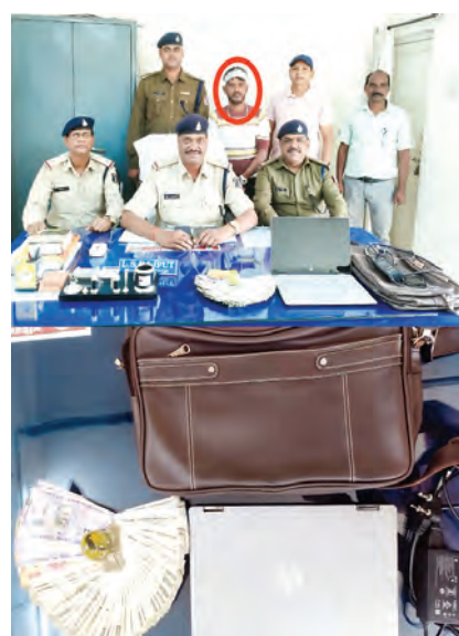
AC coach A/1 of Train No. 13426 Surat Malda Town

and was caught red-handed with a coffee-colored leather laptop bag containing an HP laptop, charger, and a significant sum of Rs 47,000 in cash. The total value of the recovered items amounted to a whopping Rs 1,27,000. Further investigations revealed that Verma had stolen the laptop, cash, and bag from a female passenger who was sleeping in berth No. 07 of