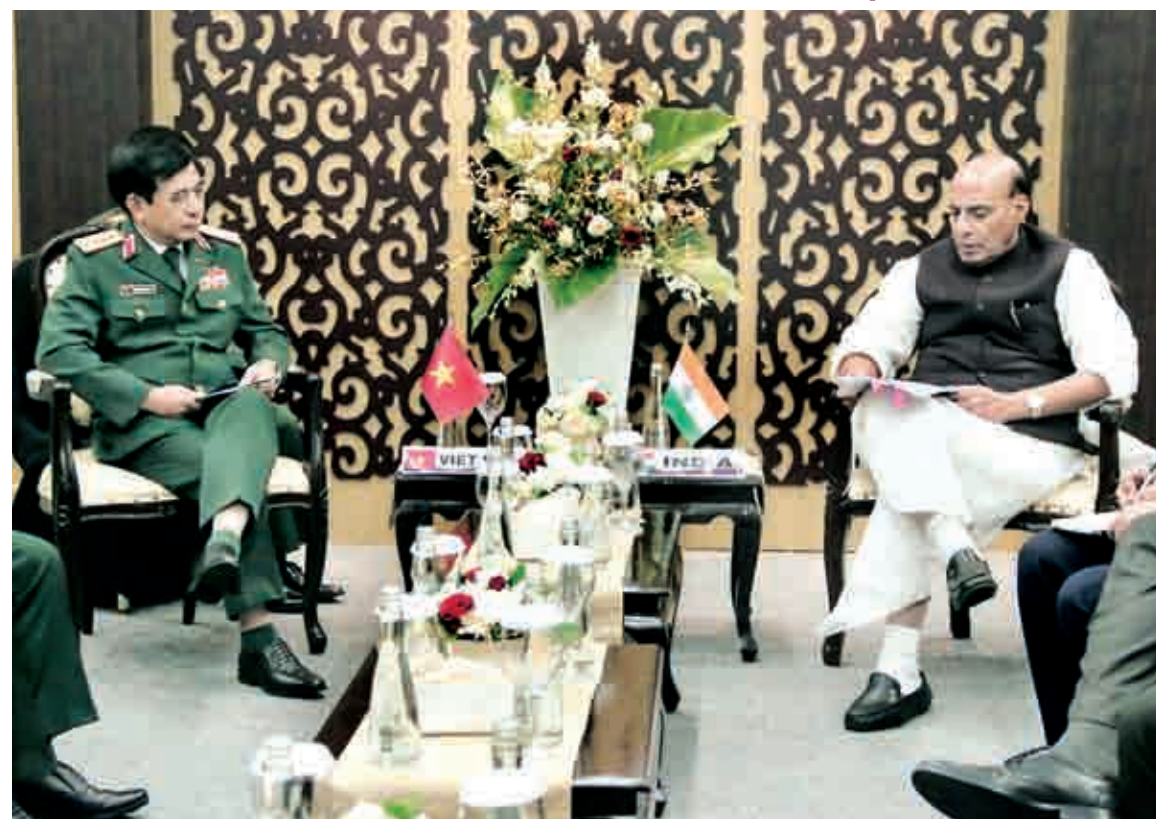
Defence Minister Rajnath Singh and Vietnam counterpart Phan Van Giang during a meeting on the sidelines of the 10th ASEAN Defence Ministers' Meeting - Plus, in Jakarta, Thursday, Nov. 16.