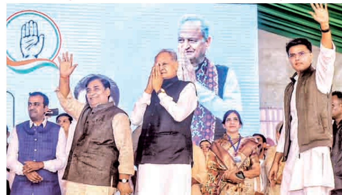
Rajasthan CM Ashok Gehlot with party leaders Sachin Pilot and Govind Singh Dotasra during 'Congress Guarantee Rally' ahead of the State Assembly elections, at Nohar in Hanumangarh district, Thursday.