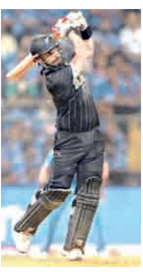
Mumbai, Nov 16 (PTI):

New Zealand batter Daryl Mitchell was not surprised by India's aggressive brand of cricket