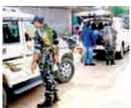
Security force personnel check vehicles on the eve of the 2nd phase of Chhattisgarh Assembly polls, in Jashpur, Thursday.