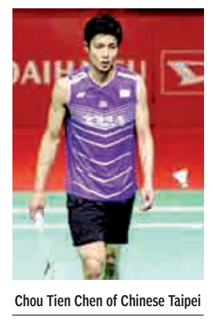
Chou Tien Chen of Chinese Taipei

Kumamoto, Nov 16 (PTI): Indian shuttler HS Prannoy lost a closely-fought second round match against Chou Tien Chen of Chinese Taipei to bow out of the Japan Masters Super 500 bad-