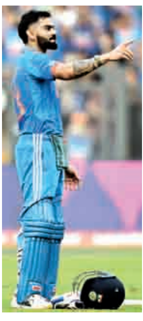
Mumbai, Nov 16 (PTI):

Star batsman Virat Kohli might now be holding the record for most ODI hundreds, but former India head coach Ravi Shastri firmly believed that the 35-year-old is well on his way to break another big landmark - Sachin Tendulkar's 100 international hundreds. Along with his 50 ODI centuries, Kohli also has 29 hundreds in Tests and one in T20s for a total of 80 scores above 100. Kohli had broken Tendulkar's mark of 49 one-day hundreds against New Zealand in the World Cup semifinals here on Wednesday.