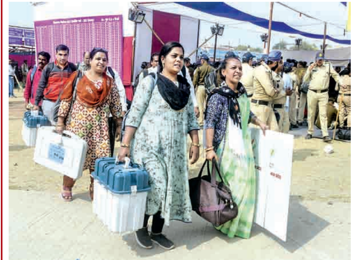
Poll officials carrying voting material leave for election duty on the eve of Assembly polls, in Indore, Thursday.