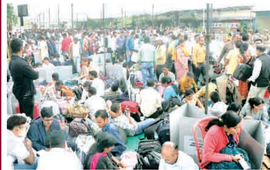
The polling teams were distributed polling material on the eve of polling day in the Collectorate and other centres for respective polling centres of Raipur district.