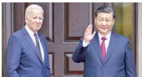
President Joe Biden greets China's President Xi Jinping at the Filoli Estate in Woodside, Calif. on the sidelines of the Asia-Pacific Economic Cooperative conference.

Woodside (California), Nov 16 (PTI): US President Joe Biden and his Chinese counterpart Xi Jinping have agreed to resume high-level military communication, counter-narcotics cooperation and discussion on artificial intelligence as they met for four hours in a bid to establish a working relationship following a period of strained ties.