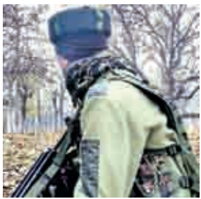
the Line of Control.