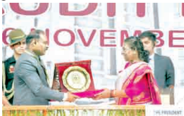
President Droupadi Murmu with Comptroller and Auditor General (CAG) of India Girish Chandra Murmu during the 3rd Audit Diwas at CAG headquarters, in New Delhi, Thursday, Nov. 16, 2023.

"Today our countrymen want to move forward rapidly towards building a developed India by the year 2047. All important institutions and communities of