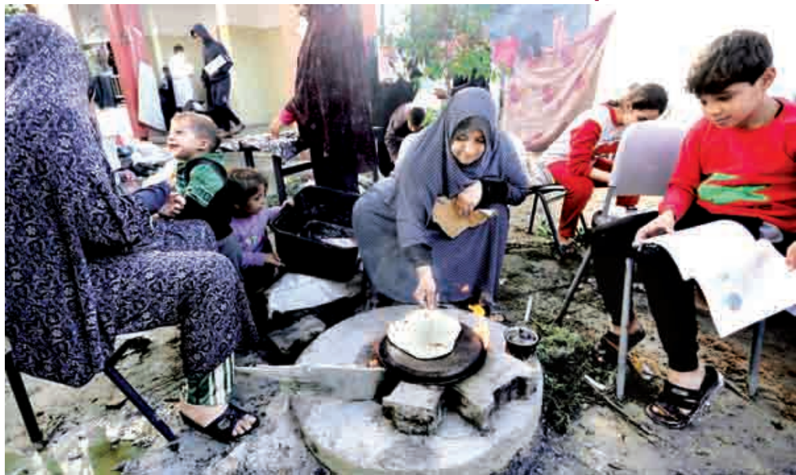
A Palestinian woman bakes bread in Rafah, Gaza Strip, Thursday, Nov. 16.