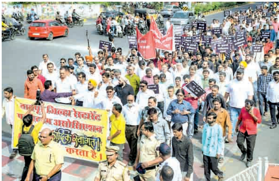
Members of Nagpur District Restaurant Association take part in a march against Maharashtra government demanding VAT removal in 'permit room' restaurants, in Nagpur, Thursday.