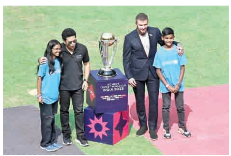
Sachin Tendulkar (2L) and former English football player David Beckham (2R) stand with World Cup trophy at the Wankhede Stadium in Mumbai.

He came, he saw and he left, mesmerised by the electric atmosphere at the Wankhede Stadium, where Rohit Sharma and his men crushed New Zealand to enter the World Cup final. Football great David Beckham watched the iconic Virat Kohli smash a record-breaking 50th ODI century and Mohammed Shami take seven wickets to break the Blackcaps' resistance. He was the toast of the crowd when he entered the hallowed ground accompanied by Sachin Tendulkar and cheered by thousands of spectators in the stands. "Electric, passionate, incredible," is how Beckham described the atmosphere at the Wankhede, which left him unable to decide whether football or cricket fans were louder. "You know what? I would always say, football fans. But being here today,