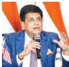
Union Minister for Commerce & Industry Piyush Goyal in a meeting with Chartered Accountants from the San Francisco Chapter of ICAI, in USA.

ing that of running a Ponzi scheme. Troubles for Roy started in November 2010 with Sebi asking two entities of Sahara group not to mobilise funds from equity markets or from issuance of any security to the public while restraining Roy from approaching the public for raising money. Roy was arrested in 2014 on the orders of the Supreme Court after he failed to appear before it in a contempt case arising out of non-refund of more than Rs 20,000 crore to investors by the two companies. He was later granted bail but troubles continued for his various businesses.