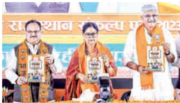
BJP National President J.P. Nadda with Union Minister Gajendra Singh Shekhawat and former Rajasthan chief minister Vasundhara Rajee during the launch of the party's manifesto for the Rajasthan Assembly elections, in Jaipur, Thursday.

Releasing the 'sankalp patra' here, party chief J P Nadda also said that if the BJP forms the government in the state, a Special Investigation Team will be formed to probe paper leaks and other alleged scams in the Congress government. The manifesto said an arrangement to procure wheat at Rs 2,700 per quintal, including bonus above MSP, will be