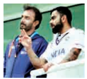
Mumbai, Nov 16 (PTI):