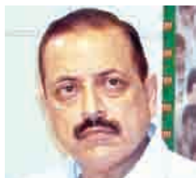
Dr Jitendra Singh

India has set an example for the world on how scientific research can be used for development in every sector, Union minister Dr Jitendra Singh said on Thursday. Speaking at the curtain-raiser event of the India International Science Festival set to take place in Faridabad from January 17-20, Singh said India is the first country to use technology for development in every sector.