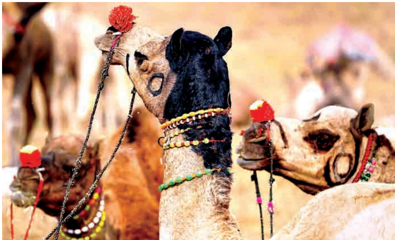
Camels at the Pushkar camel fair in Pushkar, Ajmer, Thursday, Nov. 16. Thousands of livestock traders from the region come to the traditional camel fair where livestock, mainly camels, are traded.