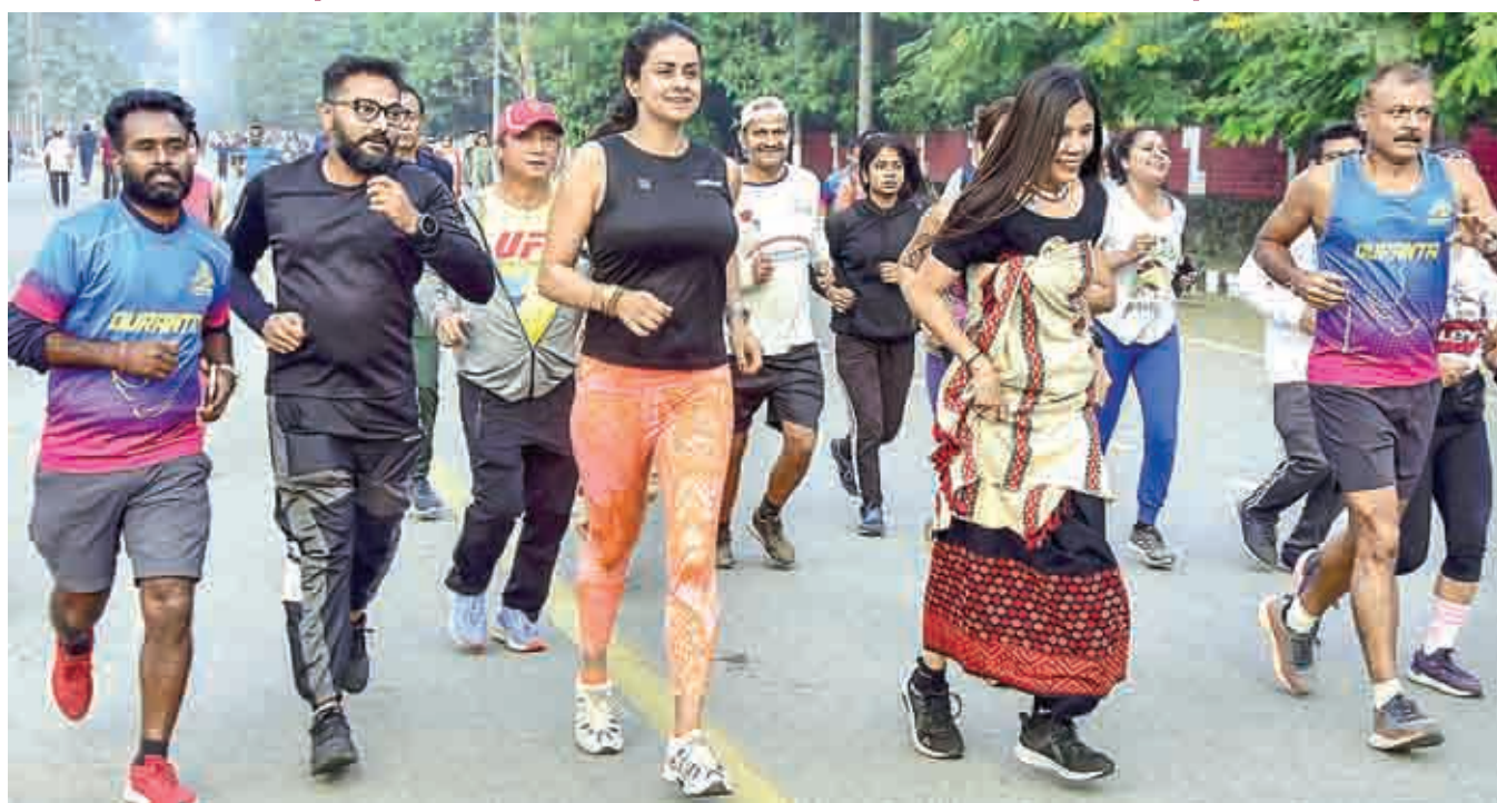
Actor and UN Environment Programme Goodwill Ambassador Gul Panag participates in a promotional run for the Guwahati Half Marathon, at Khanapara in Guwahati, Wednesday, Nov. 8.