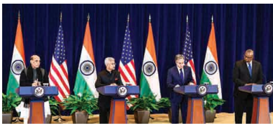
In this Tuesday, April 12, 2022, file photo, Defence Minister Rajnath Singh, External Affairs Minister S. Jaishankar, U.S. Secretary of State Antony Blinken and U.S. Defense Secretary Lloyd Austin (right) at a news conference during the fourth U.S.-India 2+2 Ministerial Dialogue at the State Department, in Washington, USA.

Blinken and Austin will also meet other senior Indian officials to discuss