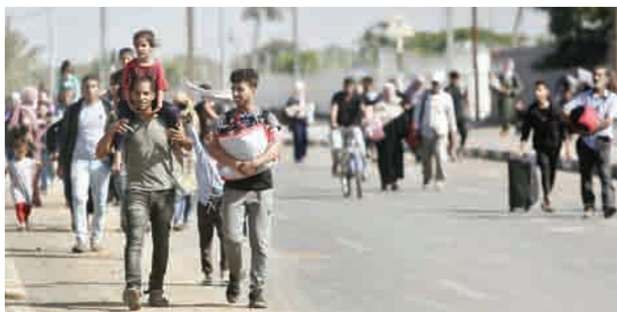
Palestinians flee Gaza City to the southern Gaza Strip on Salah al-Din street in Bureij.

The war triggered by Hamas' October 7 assault inside Israel has entered a second month, with an increasingly dire humanitarian situation inside the besieged Palestinian enclave and no end in sight. Israel has said its war to