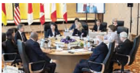
Group of 7 Foreign Ministers meetings at the Iikura Guest House in Tokyo Wednesday, Nov. 8.

The second and final day of the G7 Foreign Minister talks intersects with a flurry of global crises. While the devastating monthlong conflict in Gaza and the hu-