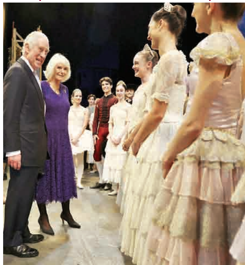
Britain's King Charles III and Queen Camilla meet cast members of the Royal Ballet after their performance of Carlos Acosta's "Don Quixote," at the Royal Opera House in London.