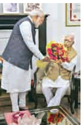
Prime Minister Narendra Modi greets senior BJP leader LK Advani on his birthday, in New Delhi, Wednesday.