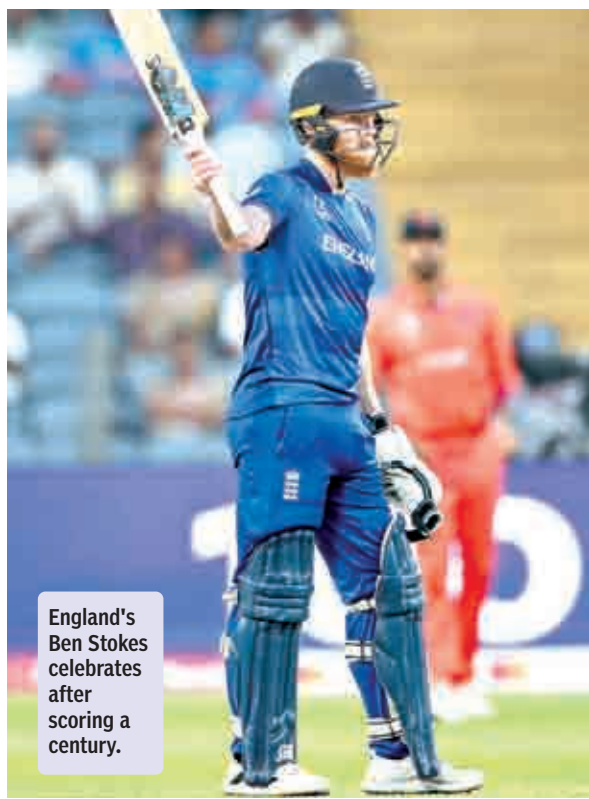
England's Ben Stokes celebrates after scoring a century.

England secured only their second win of the World Cup, beating the Netherlands by 160 runs here on Wednesday. Opting to bat, England posted 339 for 9 and then returned to bowl out the Dutch for 179 runs in 37.2 overs to keep their Championships Trophy qualification hopes alive. England batting finally fired as Ben Stokes slammed a 84-ball 108 and Dawid Malan (87) and Chris Woakes (51) made fifties. In reply, Teja Nidamanuru (41 not out) was the top scorer, while Wesley Barresi (37), Sybrand Engelbrecht (33), Scott Edwards (38) failed to capitalise on the starts. Spin duo of Adil Rashid (3/54) and Moeen Ali (3/42) took three wickets each for the defending champions. Stokes (108 off 83) initially provided the stability in the middle before opening up towards the end, while Malan (87 off 74) got England off to a flier with his breezy knock