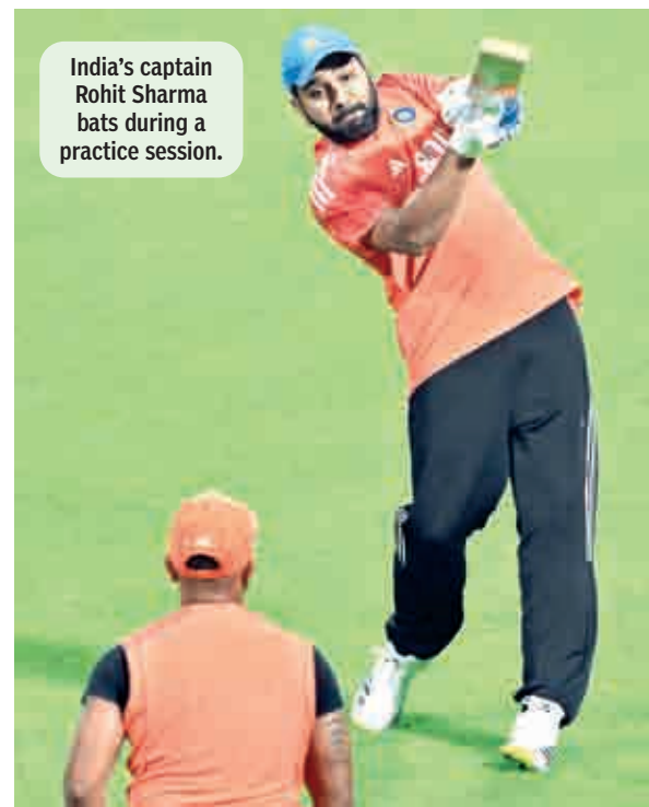
India's captain Rohit Sharma bats during a practice session.

Ishan Kishan slumped to the field with a painful grunt as Jasprit Bumrah's slightly short of length delivery thudded onto his stomach. It took him a few minutes to recover and resume the training here on Wednesday. Shubman Gill was at his best, while clobbering pacers Mohammed Siraj, Shardul Thakur and Prasidh Krishna into the stands. But the Indian opener had to restrain himself once Bumrah tested his skills with an assortment of slower balls and in the channel outside the off-stump. It was an optional net session alright, but the pacer did not drop his intensity even for a moment. The whole 20 minutes Bumrah spent bowling at nets offered a good peek into his operating philosophy in this World Cup. It is not eye-catching like Mohammed Shami, who has hogged all the limelight over the last fortnight owing to his 16-wicket burst over four matches. Shami is an apex predator, zooming in on the stumps and hunting for wickets all the time. Perhaps, no other contemporary bowler hit