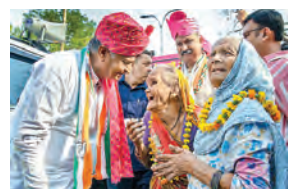
Raj CM Ashok Gehlot takes blessings of elderly voters during the 'Congress Guarantee Yatra' ahead of Assembly polls, in Jaipur, Tuesday.

The "Guarantee Yatra" began after Chief Minister Ashok Gehlot and the party's state in-charge Sukhjinder Singh Randhawa offered prayers at the Moti