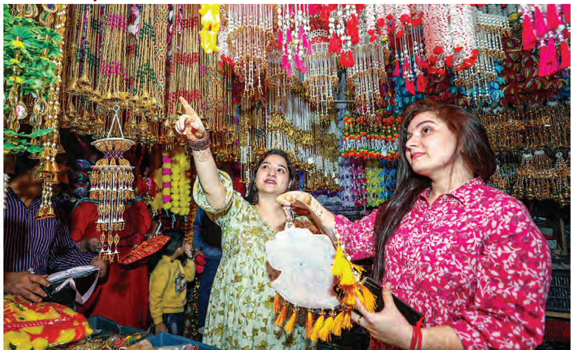
Women shop decorative items for the Diwali festival, in Jammu, Tuesday, Nov. 7.