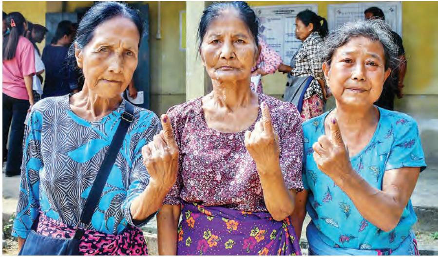
Voters show their fingers marked with indelible ink after casting their votes for Mizoram Assembly elections, in Mamit district, Tuesday.

The powerful church-sponsored election watchdog, Mizoram People's Forum (MPF), stole the limelight as it ensured adherence to all election-related activities of both the voters and political parties during the state polls which ended peacefully on Tuesday. Although the assembly polls were officially conducted by the Election Commission of India (ECI), the MPF was the real force on the ground that ensured the implementation of all poll norms. The MPF was formed by the powerful Presbyterian Church Mizo Synod with the help of other major churches and civil societies on June 21, 2006 as a poll watchdog to strive for