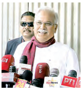
CM Bhupesh Baghel addresses a press conference during the first phase of the state Assembly elections, in Raipur, Tuesday.