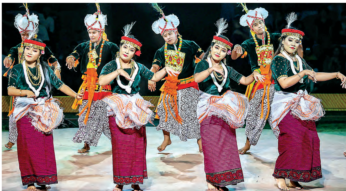
Artists from Manipur perform Lai Haraoba folk dance during 'Lok Rang' at Jawahar Kala Kendra, in Jaipur, Monday night.