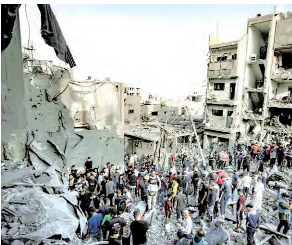
Palestinians look for survivors of the Israeli bombardment of the Gaza Strip in Khan Younis on Tuesday, Nov. 7.

In an interview with ABC News that aired late Monday, Netanyahu expressed openness to "little pauses" in the fighting to facilitate the delivery of aid to Gaza or the release of some of the more than 240 hostages seized by Hamas in its Oct 7 attack into Israel that triggered the war. But he ruled out any general cease-fire without the release of all the