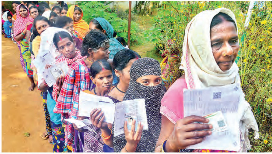
Voters show their identification cards as they wait in a queue to cast their votes for the 1st phase of Chhattisgarh Assembly elections, at a polling station in Jagdalpur, Bastar district, Tuesday.

Of the 20 seats for which polling was held on Tuesday, 12 are reserved for Scheduled Tribes.