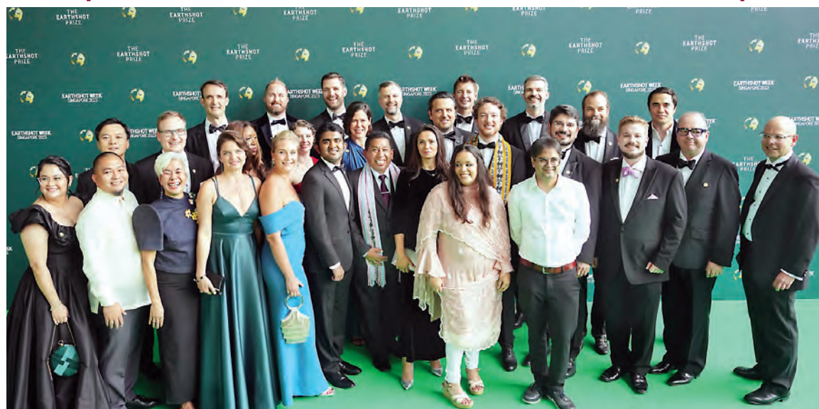
2023 Earthshot prize finalists pose for a picture on green carpet before start of the awards night in Singapore, Tuesday, Nov. 7. The finalists include a U.S. company that found a way to recycle polycotton fabrics; an Indian company producing solar-powered dryers to help farmers combat food waste; a scheme to plant, grow and digitally track trees in Sierra Leone's capital Freetown and an anti-smog movement in Poland.