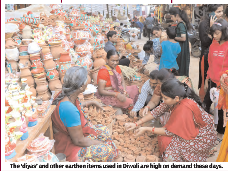
The 'diyas' and other earthen items used in Diwali are high on demand these days.