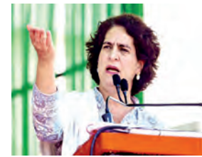
Priyanka Gandhi Vadra

Commissioner Rajiv Kumar that participation of everyone from every region in democratic process will be ensured and sufficient security forces will be deployed to ensure the security during the elections. Amid an encounter with Naxalites in the Chintagufa police station area of Sukma district in which four security personnel were injured, the poll panel described the first phase of assembly polls in the state as "free, fair and largely peaceful".