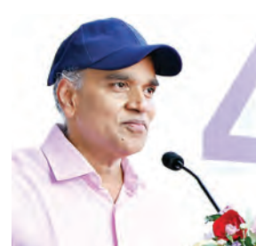
● At Naya Raipur