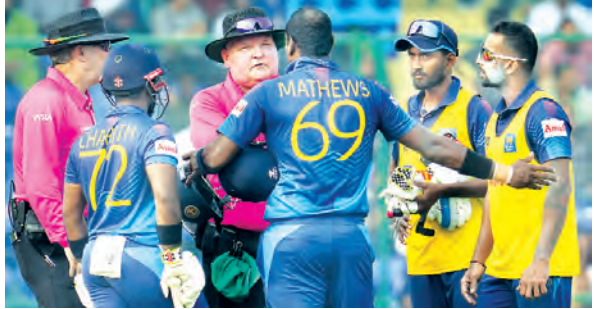
Sri Lankan batter Angelo Mathews talk to umpires as Mathews being given 'timed out' during the ICC Cricket World Cup 2023 match in New Delhi, Monday.

New Delhi, Nov 06 (PTI): Sri Lanka all-rounder Angelo Mathews on Monday became the first international cricketer to be 'timed out' after not being ready to face the ball within two minutes of the fall of a wicket against Bangladesh in a World Cup match here.