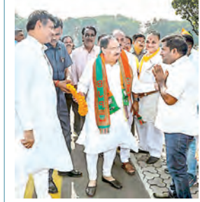
BJP National President JP Nadda being welcomed upon his arrival in Raigarh, Monday.

Jashpur, Nov 06: Ahead of the Chhattisgarh assembly polls, Bharatiya Janata Party president JP Nadda on Monday accused the Congress of indulging in corruption, loot and dynastic politics. Addressing a rally in Pathalgaon constituency of Jashpur district in Chhattisgarh, he claimed the Bhupesh Baghel-led Congress government in the state was a