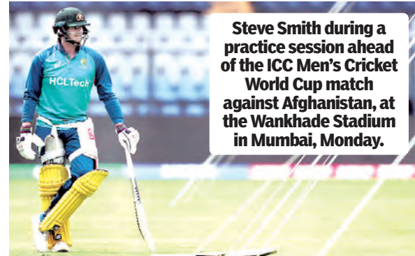
Steve Smith during a practice session ahead of the ICC Men's Cricket World Cup match against Afghanistan, at the Wankhede Stadium in Mumbai, Monday.

Steve Smith on Monday hoped Australia are peaking at the right time given they have five wins on the trot in the World Cup and are on the cusp of joining India and South Africa as the third team in the semifinals. While India are set to finish at the top of the points table, South Africa are currently placed second having qualified for the final four. Australia can join the two teams if they win their upcoming clash against Afghanistan, to be played here on Tuesday. "You do want to be peaking at the right time in the end, but obviously you need to do enough to make the semifinals. I think that would be the beauty of it if we were able to get there," Smith