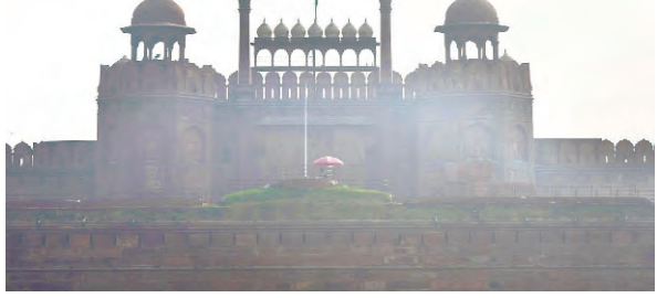
A bird flies over the Red Fort amid smog, in New Delhi, Monday.

New Delhi, Nov 06 (PTI): First implemented in 2016 by the AAP dispensation in Delhi, this will be the fourth time the odd-even car rationing scheme will be enforced in the city in view of the rising pollution levels, even as studies and experts have mixed views on its efficacy. Delhi Environment Minister Gopal Rai announced on Monday that the odd-even car rationing scheme will be enforced in