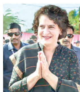
Congress General Secretary Priyanka Gandhi Vadra arrives for a public rally.

Attacking the Centre, Gandhi alleged public sector firms were being given to industrialists free of cost, be it BHEL (power sector major Bharat