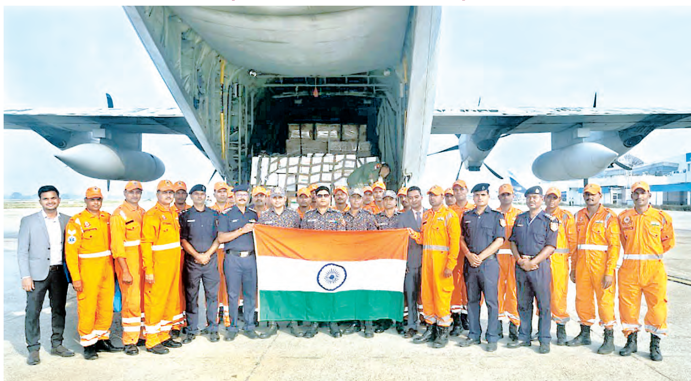
Security personnel dispatch relief material to earthquake-hit Nepal.