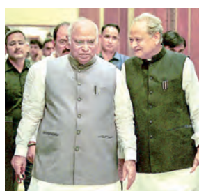
Rajasthan CM Ashok Gehlot with party chief Mallikarjun Kharge upon the latter's arrival in the state ahead of the State Assembly elections, in Jodhpur, Monday.

His attack came days after the prime minister announced the extension of the free ration scheme for five years. Kharge accused the Modi gov-