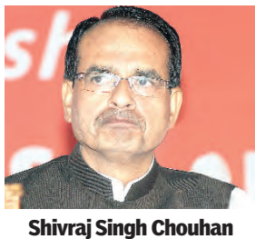
Shivraj Singh Chouhan

"I want to ask Priyanka ji that SP and Aam Aadmi Party (AAP) which are parts of the INDIA alliance are fighting against each other in Madhya Pradesh assembly polls. It is like friendship in Delhi