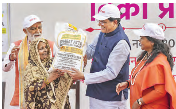
Union Minister for Consumer Affairs, Food and Public Distribution Piyush Goyal with Ministers of State hands over a packet to a beneficiary at the launch of 'Sale of Bharat Atta' at Kartavya Path, India Gate, in New Delhi, Monday.

In February, the government had carried out a pilot sale of 18,000 tonnes of 'Bharat Atta' at Rs 29.50 per kilogram through these cooperatives in few outlets as part of the Price Stabilisation Fund scheme. Flagging off 100 mobile vans of 'Bharat