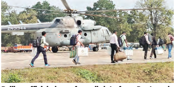
Polling officials leave for poll duty from Dantewada ahead of the first phase of voting for Chhattisgarh Assembly elections, on Monday.

tween 8am and 5pm in Khairagarh, Dongargarh, Rajnandgaon, Dongargaon, Khujji, Pandariya and Kawardha Bastar, Jagdalpur and Chitrakot, the officials added.