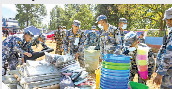
Policemen pack relief material to distribute among earthquake survivors in Jajarkot District, northwestern Nepal, Monday.

Kathmandu, Nov 6 (PTI) Nepal on Monday revised the death toll from the 6.4 earthquake magnitude that hit western parts of the country to 153 from 157, citing duplication of some names.