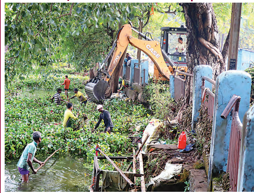
The municipal authorities are cleaning Water Hyacinth from a pond and left the entire debris of it by the road-side near, posing problems to passerby.