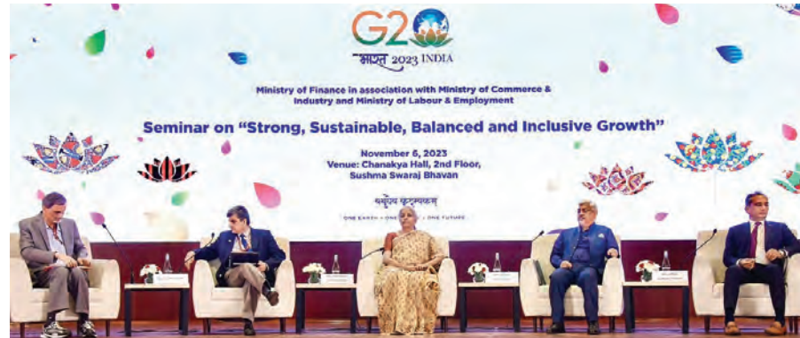
Union Finance Minister Nirmala Sitharaman during a seminar on 'Strong, Sustainable, Balanced and Inclusive Growth' organised under the aegis of G20 India Presidency, in New Delhi, Monday.