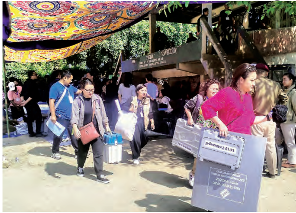
Polling officials with EVMs and other election material leave for poll duty ahead of Mizoram Assembly elections, in Aizawl, Monday.

He said the 510-km-long international border with Myanmar and 318-km boundary with