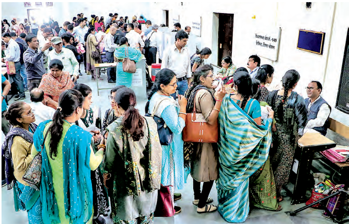
MP government employees on poll duty wait in a queue to cast their votes for the State Assembly elections, in Bhopal, Monday.