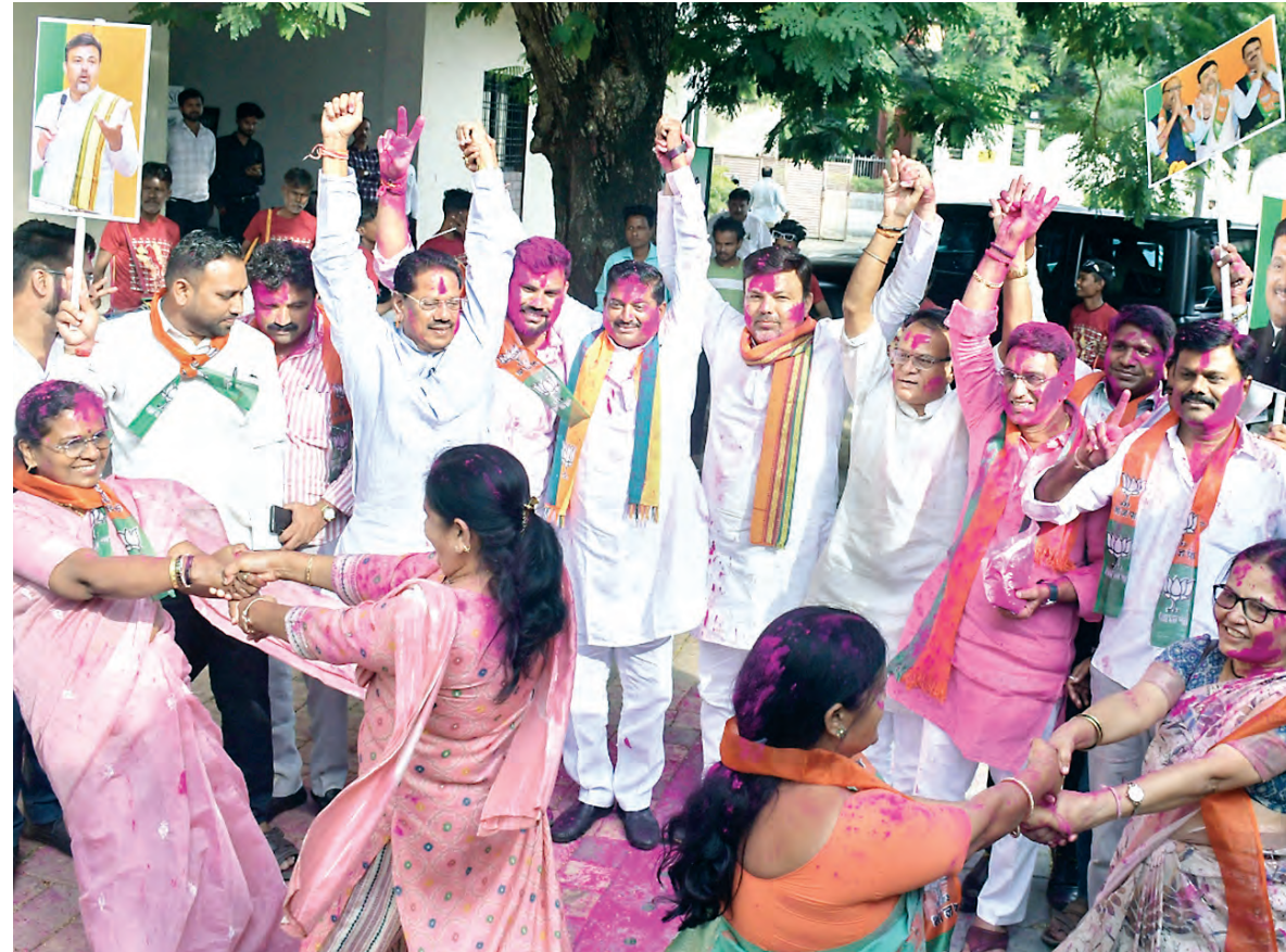
A BJP candidate with supporters celebrate his win in the Gram Panchayat elections, in Nagpur district of Maharashtra, Monday.