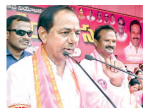
CM K. Chandrashekar Rao addresses the Praja Ashirvada Sabha at Makthal in Narayanpet district of Telangana, Monday.

At a rally here, the BRS chief requested the people to vote for his party's candidate, and told the peo-