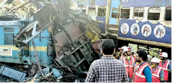
NDRF personnel carry out rescue and restoration work.

New Delhi, Oct 30 (PTI): A preliminary railway probe into the Sunday night accident in Andhra Pradesh has held the driver and the assistant driver of Rayagada Passenger train responsible for the collision as it passed two defective auto signals vio-