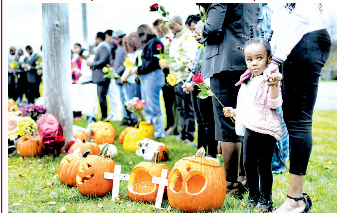
Members of the New Apostolic Church pray at a makeshift memorial outside a bowling alley, the site of one of this week's mass shootings, in Lewiston, Maine. A gunman killed multiple people at the bowling alley and a bar in Lewiston on Wednesday.