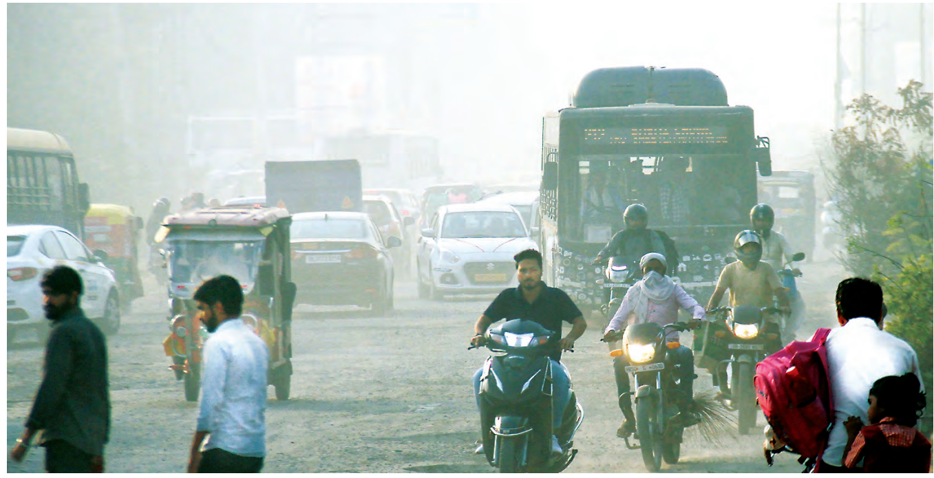
Commuters amid low visibility due to smog, in Gurugram, Monday, Oct. 30.