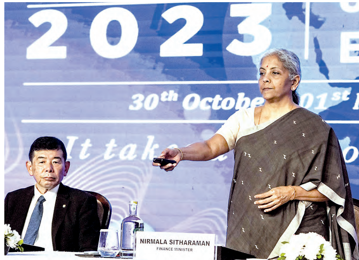
Union Finance Minister Nirmala Sitharaman during the inaugural session of the Global Conference on Cooperation in Enforcement Matters 2023 organised by the Directorate of Revenue Intelligence, in New Delhi, Monday, Oct. 30.