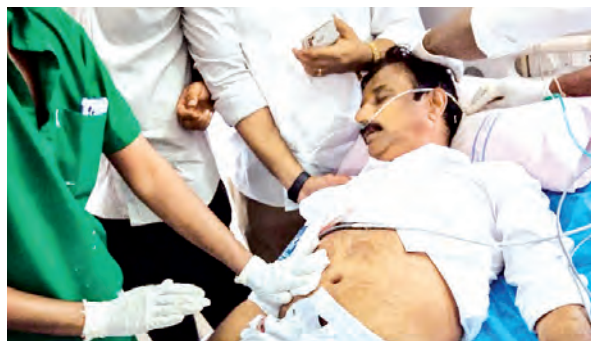
BRS MP and party candidate Kotha Prabhakar Reddy undergoes treatment.

Prabhakar Reddy, who is an MP from Medak Lok Sabha constituency, suffered injuries in his stomach and was shifted to a hospital in Hyderabad after initially being rushed to a hospital in Gajwel of Siddipet district. His condition is