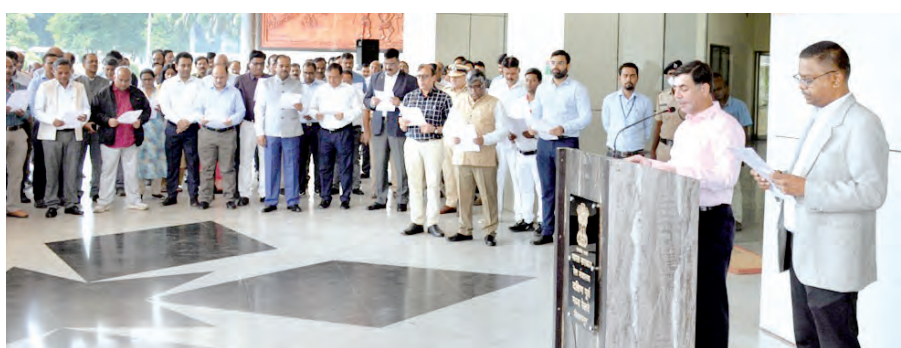
Bilaspur, Oct 30:

The South East Central Railway initiated the 'Vigilance Awareness Week' to enhance transparency in railway operations and raise awareness among railway consumers. Running from October 30th to November 5th, the week was inaugurated with a swearing-in