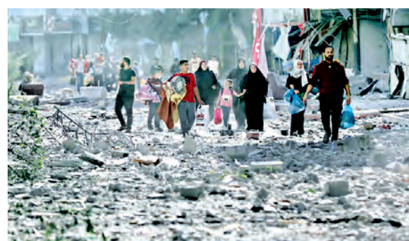
Palestinians leave their homes following Israeli bombardment on Gaza City, Monday, Oct. 30.

When asked whether forces had positioned on the road, Israeli military spokesman Rear Adm. Daniel Hagari said "we expanded our operations" but would not comment on specific deployments.