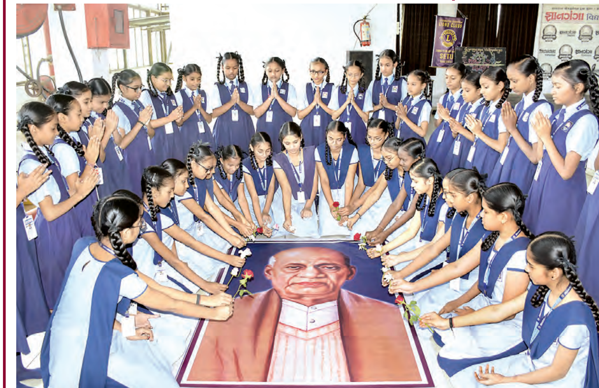
School students pay homage to Sardar Vallabhbhai Patel, a day before his birth anniversary, in Surat, Monday.