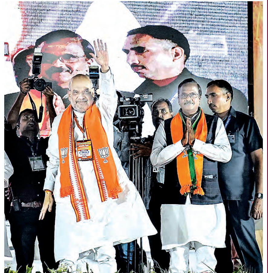
Union Home Minister Amit Shah accompanied by Madhya Pradesh BJP president VD Sharma during a public meeting ahead of the assembly elections, in Ujjain.