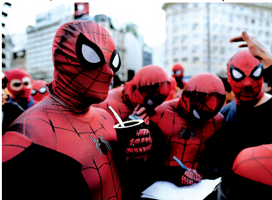
A person dressed as Spider-Man holds a "mate", used to drink herbal tea, at the Obelisk in Buenos Aires, Argentina. People gathered aiming to set a record for the largest assembling of individuals dressed as the comic book.