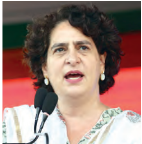
AICC General Secretary Priyanka Gandhi Vadra addresses a public meeting in Bilaspur

Congress leader Priyanka Gandhi Vadra on Monday promised a slew of measures, including waiving of loans of Self-Help Groups, subsidised cooking gas cylinders under a new scheme, and free treatment to victims of road accidents if her party retains power in Chhattisgarh.