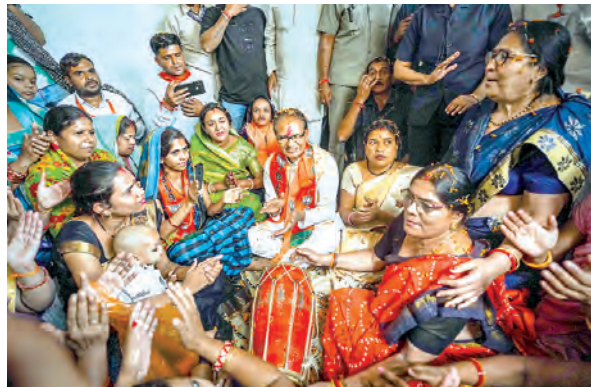
MP CM Shivraj Singh Chouhan during his election campaign for Assembly polls in Seoni in Narmadapuram district, Monday.

Before filing his nomination papers in the presence of wife Sadhna, the chief minister performed puja of his ancestral deity in his native Jait village, prayed at Salkanpur Devi