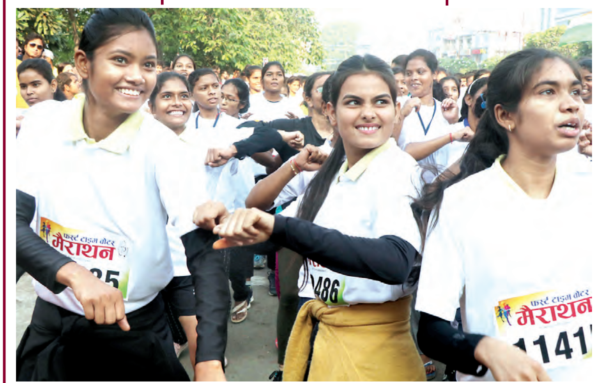
Participants in the first time voters marathon to increase awareness about voting on Monday.