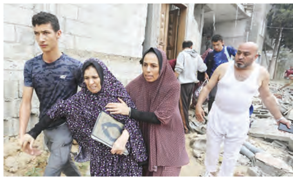
Palestinians evacuate a building destroyed in the Israeli bombardment of the Gaza Strip in Rafah on Sunday, Oct. 29.

The ministry released detailed records last week showing the names, ages and ID numbers of most of the deaths it has recorded, saying some bodies have