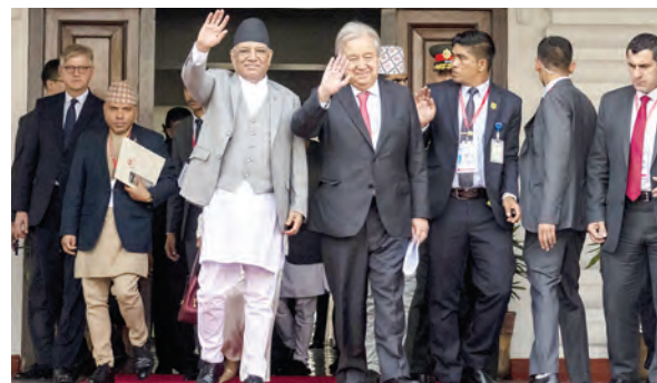
Nepalese Prime Minister Pushpa Kamal Dahal, center left and UN Secretary-General António Guterres, center, right, wave to media after their meeting at Prime Minister's office in Kathmandu, Nepal, Sunday, Oct. 29.

Addressing the media after meeting Prime Minister Prachanda, the UN chief pledged the world body's support to Nepal to develop a process that meets international standards, the Supreme Court's rulings, and the needs of victims and to put it into practice, My Republica newspaper re-