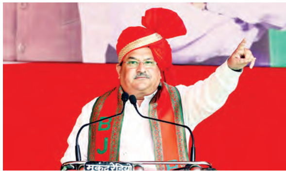
BJP national president JP Nadda addresses a public meeting at Thekkadih of Dongargarh assembly constituency, in Rajnandgaon district, Sunday.

He said people will have to decide whether they want to choose a government which serves itself or the one which serves the masses. Targeting the Bhupesh Baghel government in Chhattisgarh over "corruption", Nadda said,