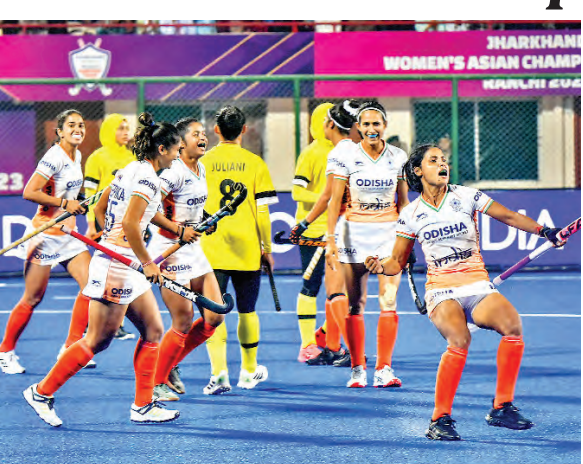
Players of India (white) and Malaysia in action during the Asian Championship Trophy match at Marang Gomke Jaipal Singh Astroturf Hockey Stadium, in Ranchi.