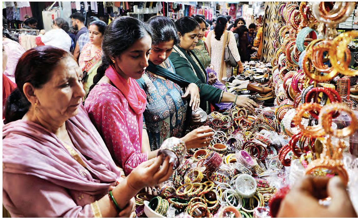
Women shop at a market ahead of the 'Karva Chauth' festival, in Jammu, Sunday.