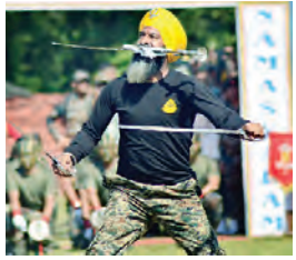
Army personnel show their skill at the Ex-Servicemen Rally organised by DAO Division of Army, in Dibrugarh, Sunday.