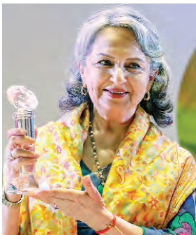
Veteran actor Sharmila Tagore after she was conferred with the Jamia Millia Islamia (JMI) University's highest award 'Imtiaz-e-Jamia' during the 103rd foundation day function of the university in Delhi, Sunday.