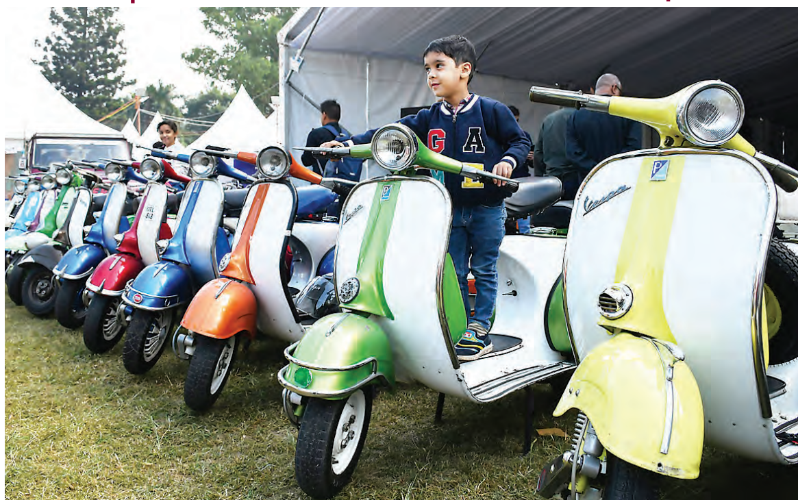
Vintage scooters participate in the Virasat Art & Heritage festival in Dehradun, Sunday, Oct. 29.