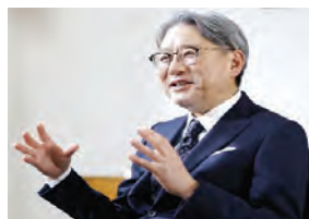
Honda Motor President and CEO Toshihiro Mibe.

Japanese auto major Honda Motor Co Ltd will continue to invest in India, a key market for its future growth strategy while also accelerating electrification of vehicles in line with its global plans to achieve carbon neutrality by 2050, according to top company officials.