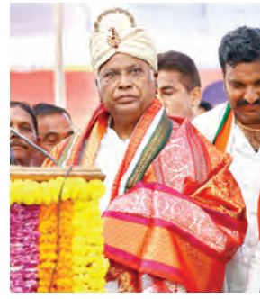
Congress president Mallikarjun Kharge during a public meeting in Sangareddy, Telangana, Sunday.