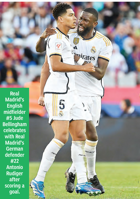
Real Madrid's English midfielder #5 Jude Bellingham celebrates with Real Madrid's German defender #22 Antonio Rudiger after scoring a goal.

Bellingham continued his superb scoring form since joining Madrid this summer with 13 goals in as many games overall and a Spanish league-leading 10 goals after 11 rounds. He has blossomed into a clinical finisher since moving to Spain's capital. In all of last season he had 14 goals for former club Borussia Dortmund in Germany. Some space well outside