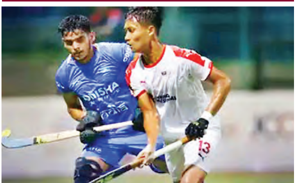
Sultan of Johor Cup Hockey