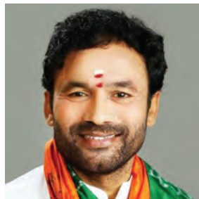
G Kishan Reddy

Recently at a poll rally in Telangana, Union Home Minister Amit Shah had said that the BJP would choose a leader from the Backward Class as chief minister in the state if the