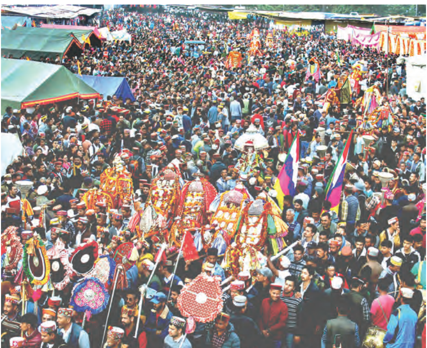
Devotees carry deites in palanquins during the International Dussehra festival, in Kullu, Sunday.