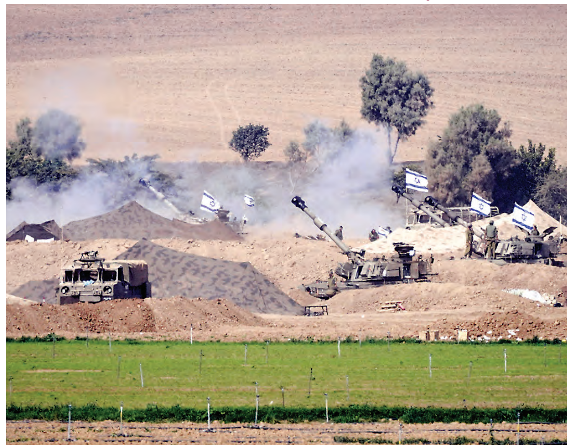
An Israeli mobile artillery unit is seen in a position near the Israel-Gaza border, Israel. Israel expanded its ground operation in Gaza with infantry and armored vehicles backed by "massive" strikes from the air and sea, including the bombing of Hamas tunnels, a key target in its campaign to crush the territory's ruling group after its bloody incursion in Israel three weeks ago.