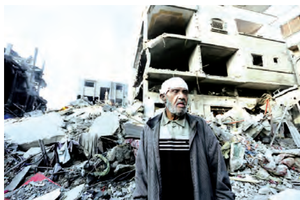
A Palestinian stands outside the building destroyed in the Israeli bombardment of the Gaza Strip in Rafah, Wednesday, Oct 25.

The soaring death toll from the bombardment is unprecedented in the decades-long Israeli-Palestinian conflict. It augurs an even greater loss of life in Gaza once Israeli forces backed by tanks and artillery launch an expect-