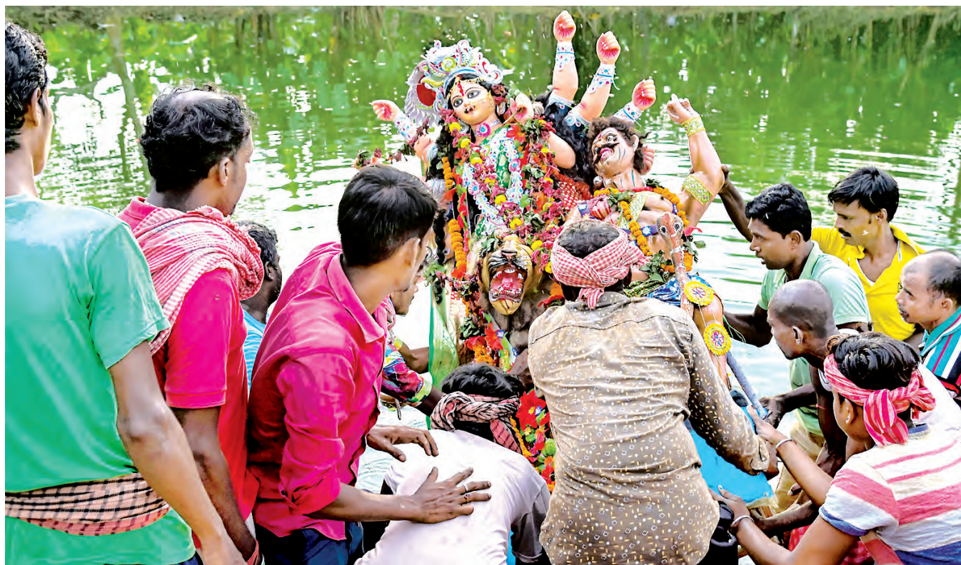
Devotees immerse an idol of goddess Durga during 'Visarjan' in the Hooghly river, in Nadia, Wednesday, Oct. 25.