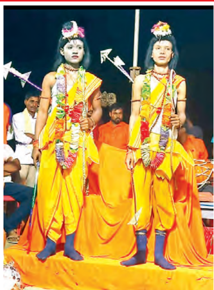
Jamwant, and the monkey army

Guests and villagers alike joined in the pious rituals, offering prayers and performing archana to Lord Rama, Lakshmana, Mata Sita, Hanuman Ji,