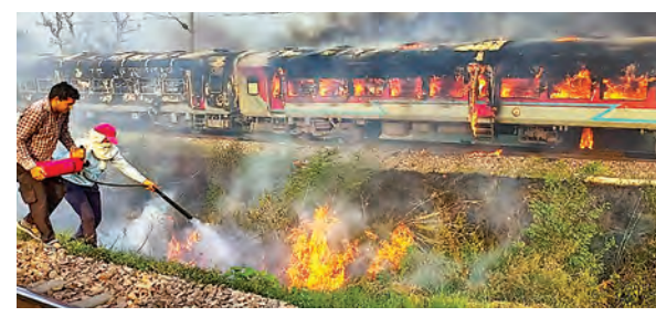
Coaches of the Patalkot Express after a fire broke out, near Bhandai railway station in Agra, Wednesday.