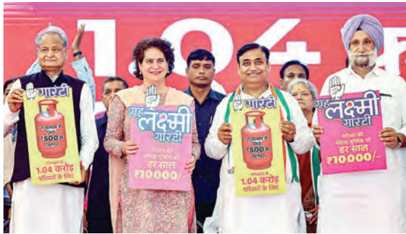
Rajasthan CM Ashok Gehlot with Congress leaders Priyanka Gandhi Vadra, Sukhjinder Singh Randhawa and others during a public meeting ahead of the upcoming state Assembly election, in Jhunjhunu district, Wednesday.

The ERCP is an ambitious project that will help