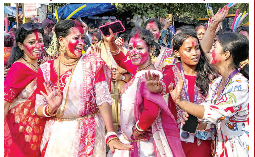
Devotees dance during immersion of the idol of Goddess Durga on the bank of the Ganga river at the end of Durga Puja festival, in Kolkata, Wednesday.