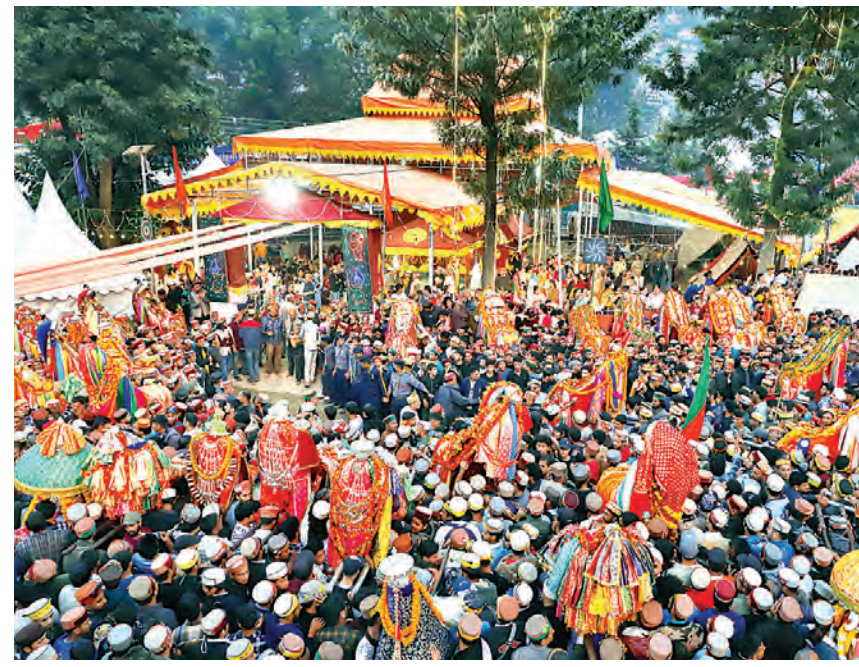
Devotees during the week-long International Kullu Dussehra festival, at Dhalpur ground in Kullu district, Wednesday.