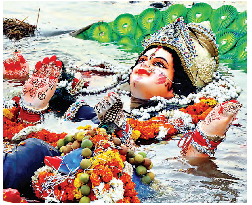
The immersion of idols of Goddess Durga by the devotees continued here on the third day in the special tank near Kharun.