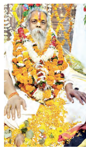
joined the Janvara program in Tikrapara before making his way to Shivreenarayan.