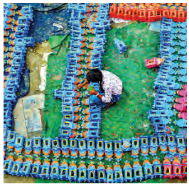
A potter paints earthen lamps ahead of Diwali, in Jalandhar, Wednesday.