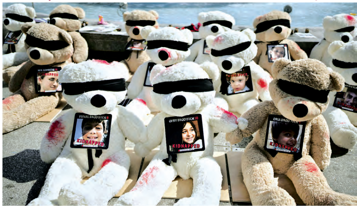
An installation of blindfolded giant teddy bears adorned with photos of Israelis held captive in Gaza, is seen in a central square in Tel Aviv, Israel, Wednesday, Oct. 25. The installation is meant to draw attention to over 200 people who were abducted by Hamas militants during a bloody and unprecedented Oct. 7 cross-border attack.