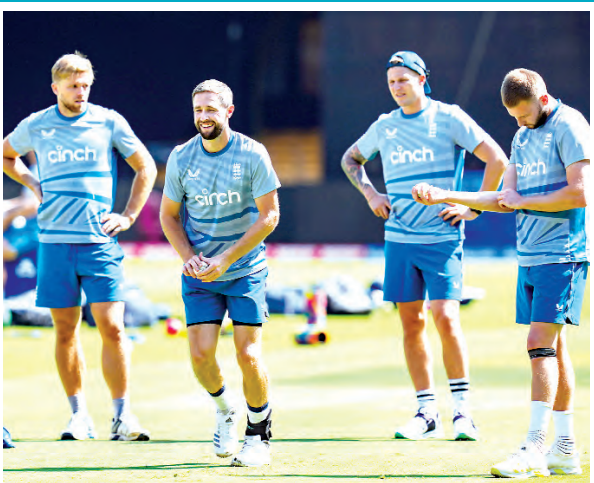
England's Chris Woakes, Gus Atkinson and others during a practice session.

As England's tumultuous World Cup campaign continues to be marred by batting and bowling inconsistencies, they find themselves in a crucial showdown against Sri Lanka, with both teams desperately seeking redemption. The defending champions have amassed a mere two points from four matches, a tally identical to that of their Sri Lankan counterparts. They currently languish in ninth place on the tournament table. For England, this encounter represents a chance, and perhaps their final one, to steer their campaign away from treacherous waters. A victory here may not propel them significantly up the rankings, but it could provide the much-needed motivation to face formidable opponents like India