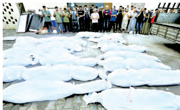
Palestinians pray by the bodies of people killed in the Israeli bombardment of the Gaza Strip in front of the morgue in Deir Al-Balah.

"India is deeply concerned at the deteriorating security situation and large-scale loss of civilian lives in the ongoing conflict. The mounting humanitarian crisis is equal-