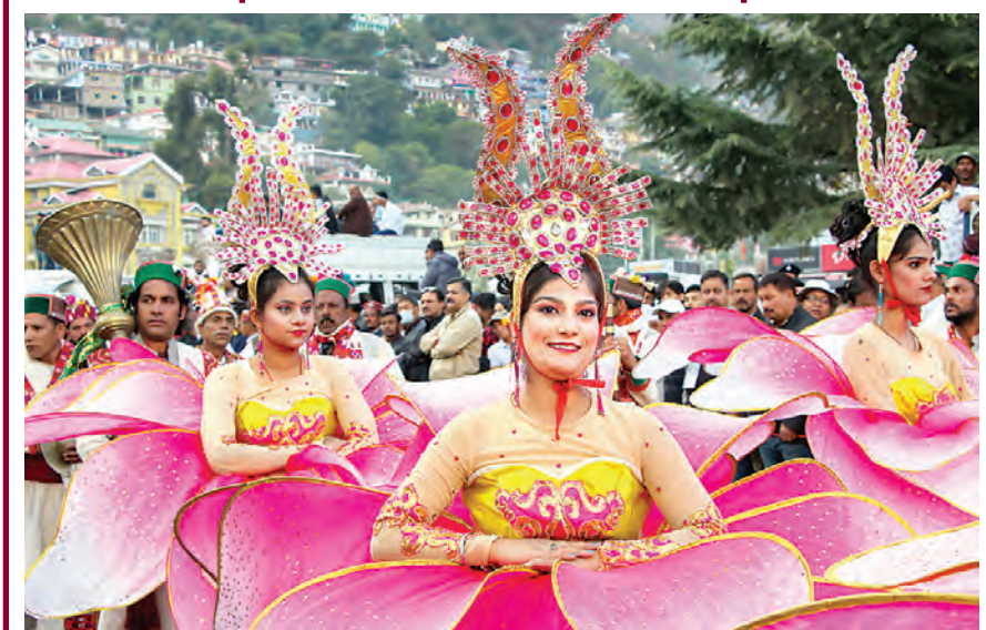
Artists take part in a cultural parade during the week-long International Kullu Dussehra festival, in Kullu district, Wednesday.