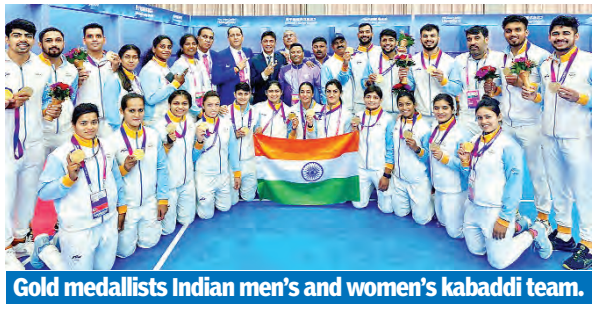
Gold medalists Indian men's and women's kabaddi team.

Indian athletes touched the magical figure of 107 medals at the Asian Games with their blood, sweat and toil over the last fortnight to give the country an early Diwali gift, and a promise of a best-ever harvest at the 2024 Paris Olympics. With India concluding its engagements at the continental showpiece on Saturday as no athlete from the country is in the fray in a couple of events scheduled on the final day of competition on Sunday, the tally of 107 will remain etched in the collective memory of the nation until the athletes decide to reset it in Aichi-Nagoya, Japan in 2026. India's final tally in Hangzhou stood at 28 gold,