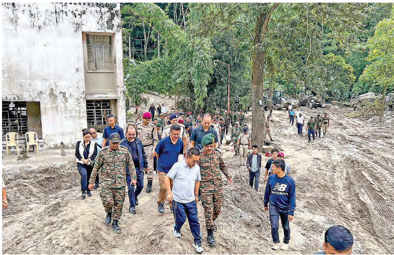
Sikkim Chief Minister Prem Singh Tamang inspects damages after a cloudburst triggered flood in Sikkim, on Friday, Oct. 6.