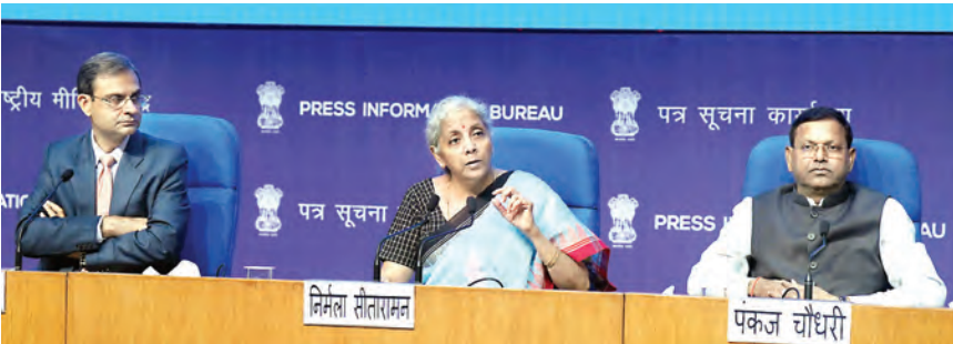
Finance Minister Nirmala Sitharaman with Union MoS for Finance Pankaj Chaudhary and Revenue Secretary Sanjay Malhotra during a media briefing after the 52nd Goods and Services Tax (GST) Council Meeting, in New Delhi, Saturday, Oct. 7.