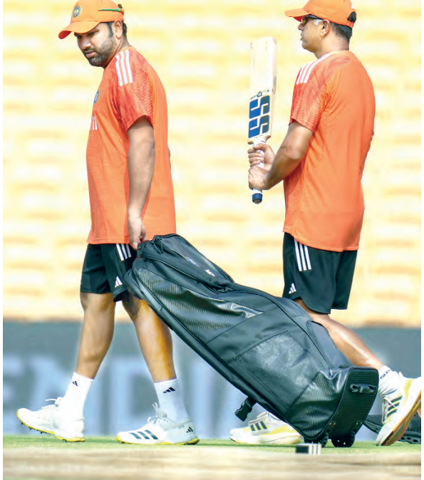
India's coach Rahul Dravid and captain Rohit Sharma during a practice session ahead of the ICC Men's Cricket World Cup match against Australia, at the MA Chidambaram Stadium, in Chennai, Saturday, Oct. 7.

After 12 seasons, Kohli is standing at the cusp of where Tendulkar stood in 2011. The only difference