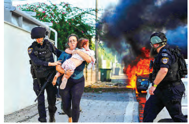
airstrikes in Gaza and has clashed with gunmen at the border fence around the coastal territory.

Jerusalem, Oct 07 (AP): The Palestinian Health Ministry in Gaza says at least 198 people have been killed and at least 1,610 wounded in the territory in Israel's retaliation after a wide-ranging Hamas assault into Israel. The toll came as Israel has carried out a number of