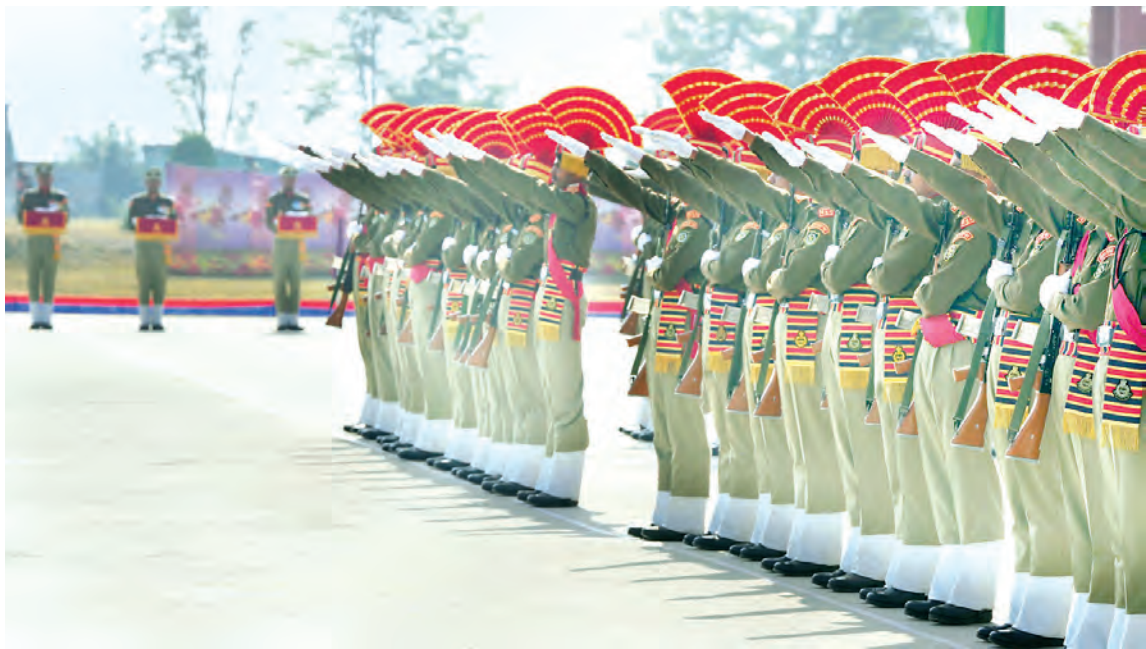
Cadets during Passing Out Parade at Subsidiary Training Centre (STC), BSF, Humhama, on the outskirts of Srinagar, Saturday.