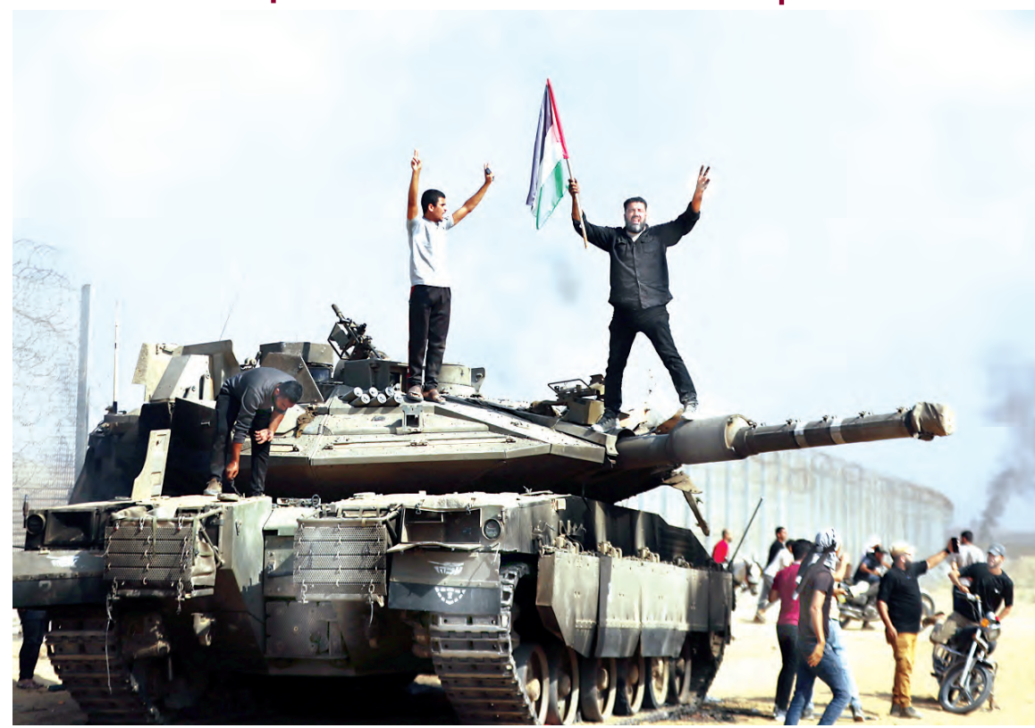
Palestinians wave their national flag and celebrate by a destroyed Israeli tank at the Gaza Strip fence east of Khan Younis southern Saturday, Oct. 7. The militant Hamas rulers of the Gaza Strip carried out an unprecedented, multi-front attack on Israel at daybreak Saturday, firing thousands of rockets as dozens of Hamas fighters infiltrated the heavily fortified border in several locations by air, land, and sea and catching the country off-guard on a major holiday.