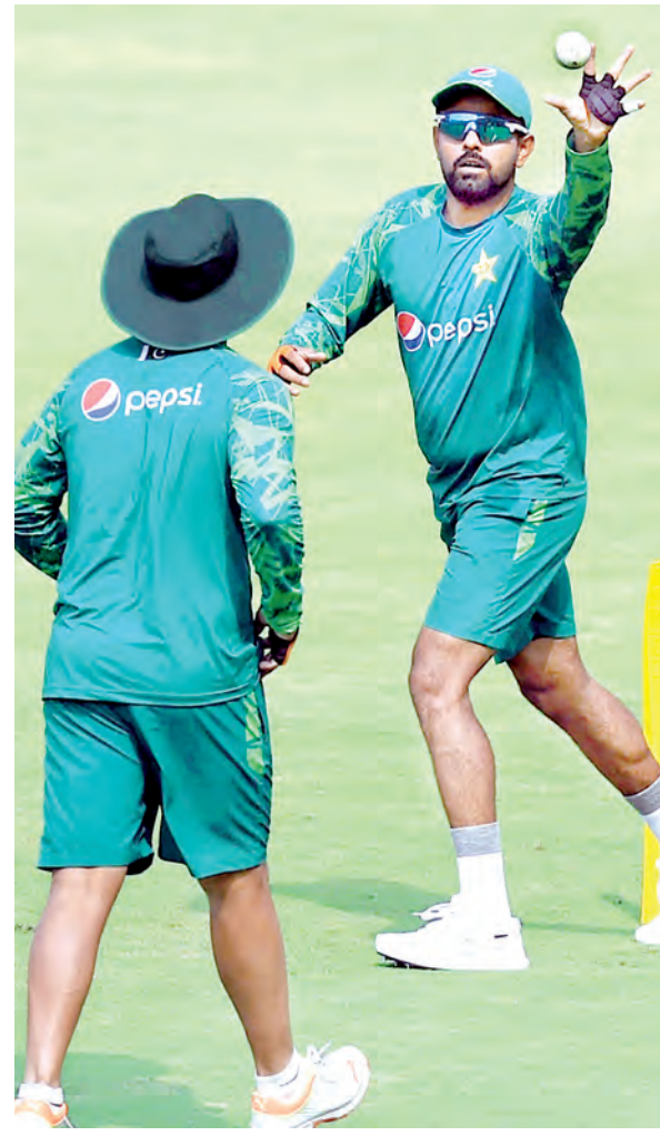
Pakistan's captain Babar Azam attends a practice session on the eve of their 2023 ICC men's cricket World Cup one-day international (ODI) match against Netherlands at the Rajiv Gandhi International Stadium in Hyderabad on October 5.

In terms of bowling, Pakistan's bowlers have