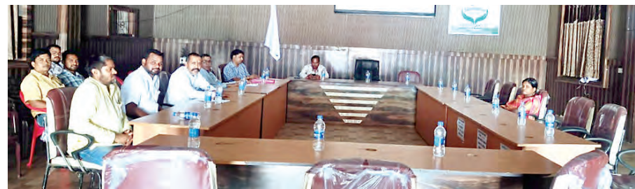
Kurud, Oct 05:

The meeting of Nagar Panchayat Council which has been scheduled on 30th September was reportedly cancelled due to the dispute between the President and Vice President, and disagreement of councillors on various subjects and allegations of setting of tender from contractors by CMO, Engineer.