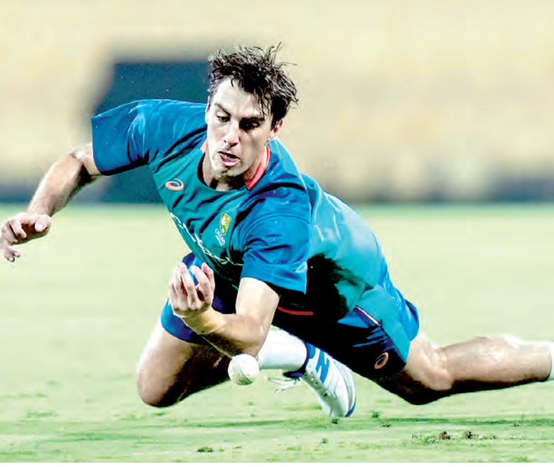
Cummins is counting on the aggressive opening batsman, David Warner, and the key player, Glenn Maxwell, to lead the team to success

The skipper acknowledged the team's confidence, especially after their win in the third ODI, which featured a lineup close to their strongest XI. Australia has historically performed well in ODIs in India, further boosting their confidence.