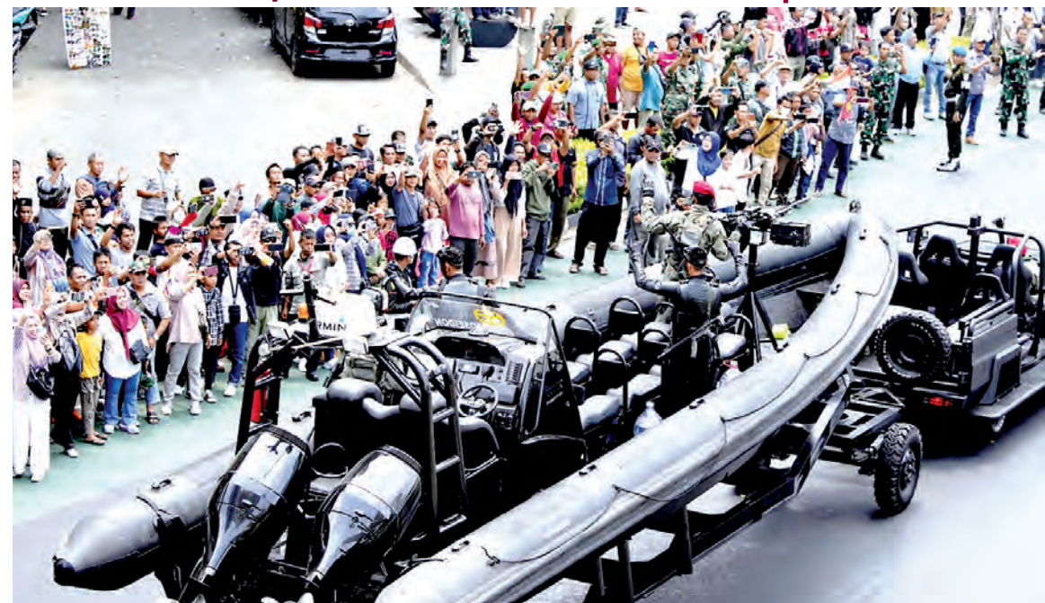
Indonesian soldiers parade, marking the 78th anniversary of the Indonesian Armed Forces at the main business district in Jakarta, Indonesia, Thursday, Oct. 5.