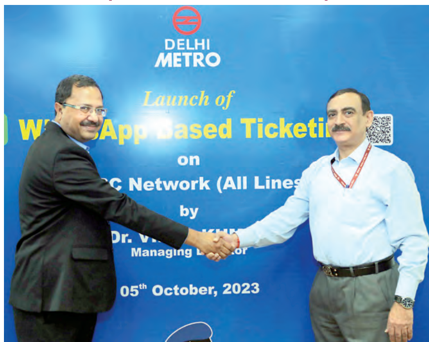
Officials during the announcement of the expansion of its innovative WhatsApp-based ticketing system to all lines by Delhi Metro Rail Corporation (DMRC), in New Delhi, Thursday, Oct. 5.