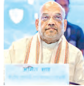
Union Home Minister Amit Shah during the '3rd Anti-Terror Conference' hosted by the National Investigation Agency (NIA), in New Delhi, Thursday.

The home minister said tough decisions taken by the Narendra Modi government have yielded very good results in handling challenges posed by cryptocurrencies, hawala, terror-funding, organised crime syndicates and narco-terror links. Still a lot more is to be done, he said inaugurating the two-day anti-terror conference organised by the National Investigation Agency (NIA). "All anti-terror agencies will have to adopt such a ruthless approach that new terrorist organisations cannot be formed," he said. Shah said there is a need to not only combat terrorism but also dismantle its entire ecosystem, and for this "we must work with the spirit of the whole of government and