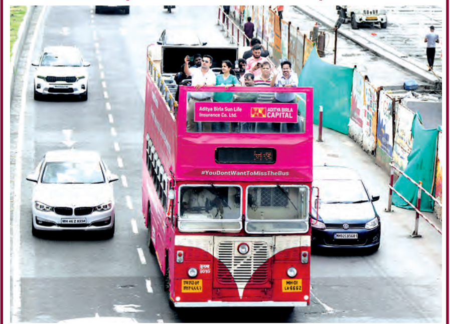
People commute by a BEST open deck bus which is retiring after completion of 15 years in Mumbai, Thursday.