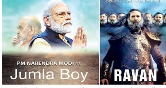
A combination of posters shows PM Narendra Modi and HM Amit Shah as 'Jumla Boy' (L) and Congress leader Rahul Gandhi as 'Ravana'.

The poster came out a day after the Congress posted on X a picture of Prime Minister Narendra Modi with the caption "The Biggest Liar" and another calling him a "Jumla Boy", who was "Going to hit the election rally soon". In a sharp retort, the BJP on its official handle on X shared a poster of Gandhi with several heads with the title "Bharat Khatre Mein Hai - A Congress party production. Directed by George Soros". "The new age Ravan is here. He is Evil. Anti Dharma. Anti Ram. His aim is to destroy Bharat."