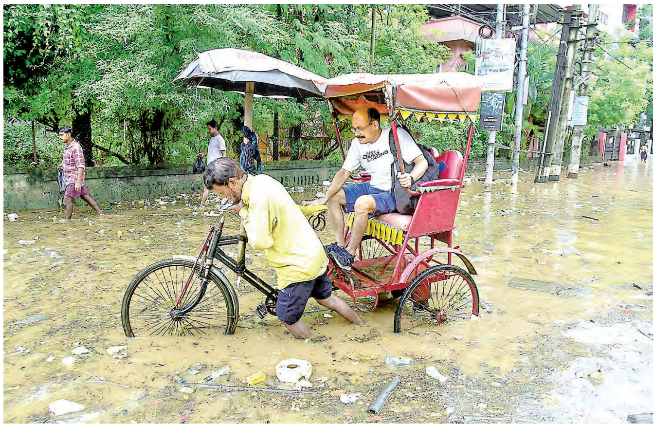
A rickshaw puller wades through a waterlogged street of Anil Nagar after heavy rains, in Guwahati, Thursday, Oct. 5.