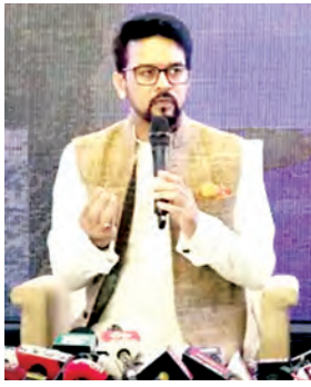
Union minister Anurag Thakur speaking to media.

Talking to reporters at the Swami Vivekananda airport in Chhattisgarh capital Raipur, Thakur targeted the Aam Aadmi Party (AAP) led by Delhi Chief Minister Arvind Kejriwal, claiming that those who were elected to power by