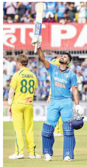
Shreyas Iyer celebrates after scoring a century.

struggled with cramps towards the end of his innings, continued to find boundaries after resumption. They went on to complete the century, Iyer's third in ODIs, while Gill's sixth in the format.