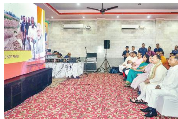
BJP president JP Nadda and other BJP members listen to Prime Minister Narendra Modi during his 'Man Ki Baat' programme, in New Delhi, Sunday.

Prime Minister Narendra Modi asserted on Sunday that the India-Middle East-Europe corridor will become a basis of world trade for the coming hundreds of years and history will remember that it was envisioned in India. In his monthly Mann ki Baat broadcast, Modi recalled the "Silk route", an ancient trade corridor used by India when it was a prosperous and great trading power, and said the country made the suggestion of the India-Middle East-Europe economic corridor at the recent G20 Summit. "This corridor is going to become the basis of world trade for hundreds of years to come, and history will always remember that this corridor was initiated on Indian soil," he