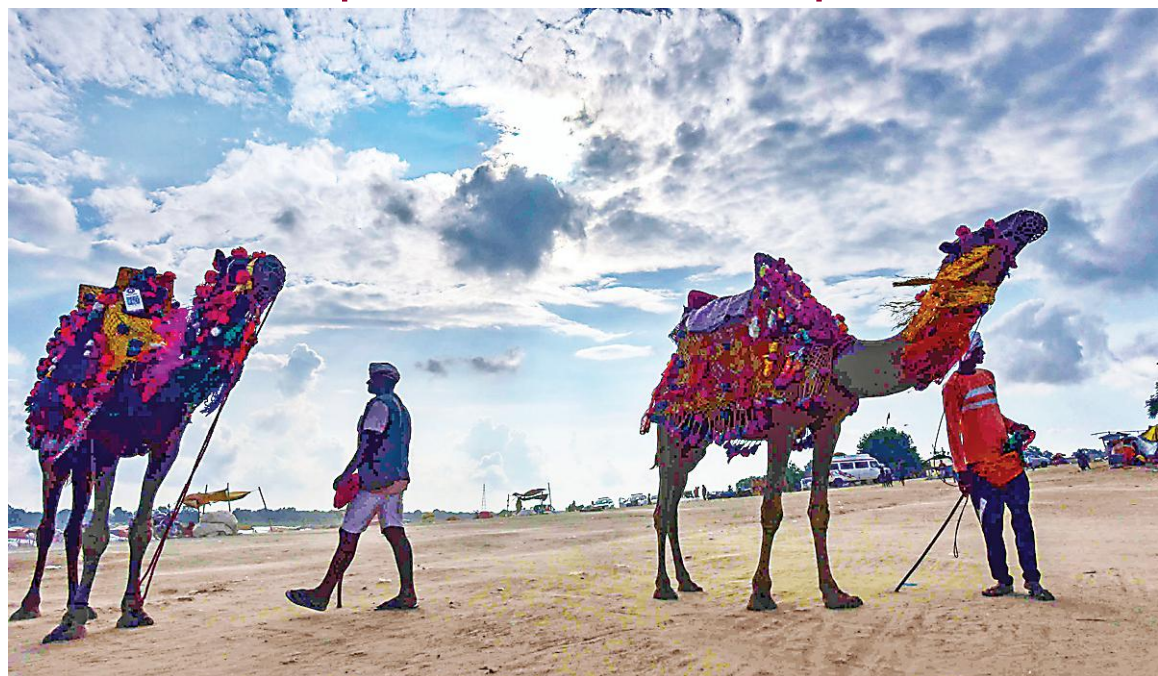
A man offering camel ride waits for visitors at the Sangam, during a cloudy day, in Prayagraj, Sunday.