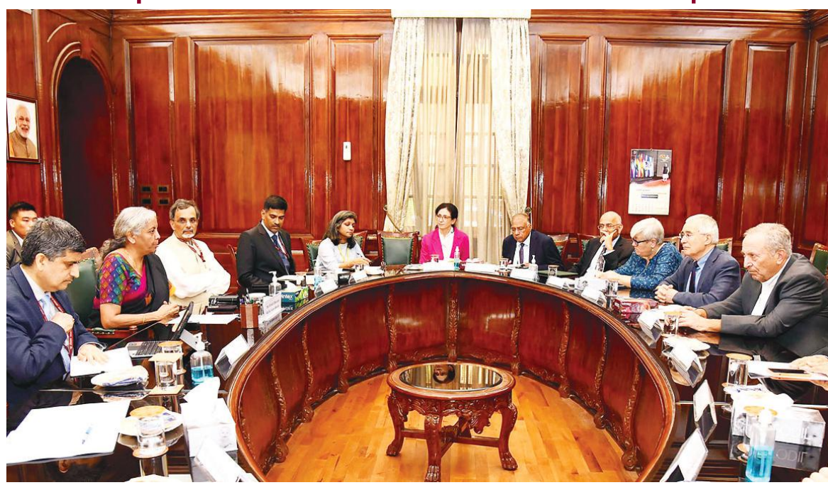
Union Minister for Finance and Corporate Affairs Nirmala Sitharaman chairs a meeting with Independent Expert Group, in New Delhi.