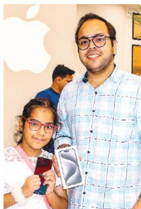
A customer poses for photos with his new Apple iPhone at Select City Walk mall, at Saket in New Delhi.

"Apple has plans to increase production in India to over USD 40 billion in the next 4-5 years. It has crossed USD 7 billion in the last fiscal," the official said. An email query sent to Apple did not elicit any reply. Apple manufacturers' iPhones in India and has plans to start manufacturing AirPods from next year. The officer said