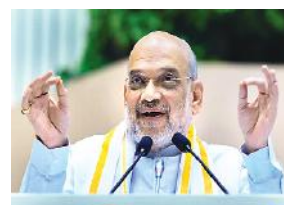
Union Home Minister Amit Shah addresses the concluding session of the 'International Lawyers' Conference 2023 organised by the Bar Council of India, in New Delhi, Sunday.

Addressing the International Lawyers' Conference organised by the Bar Council of India here, Shah also said the approach of the three bills is also to provide justice rather than mete out punishment. He appealed to all lawyers in the country to provide their suggestions to the Bharatiya Nyaya Sanhita (BNS-2023), Bharatiya Nagarik Suraksha Sanhita (BNSS-2023) and the Bharatiya