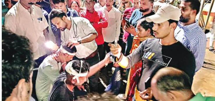
Passengers, injured by robbers in Sambalpur-Jammu Tawi Express, being treated, in Jharkhand's Latehar, Sunday.

Two passengers, who received bullet wounds, are admitted in