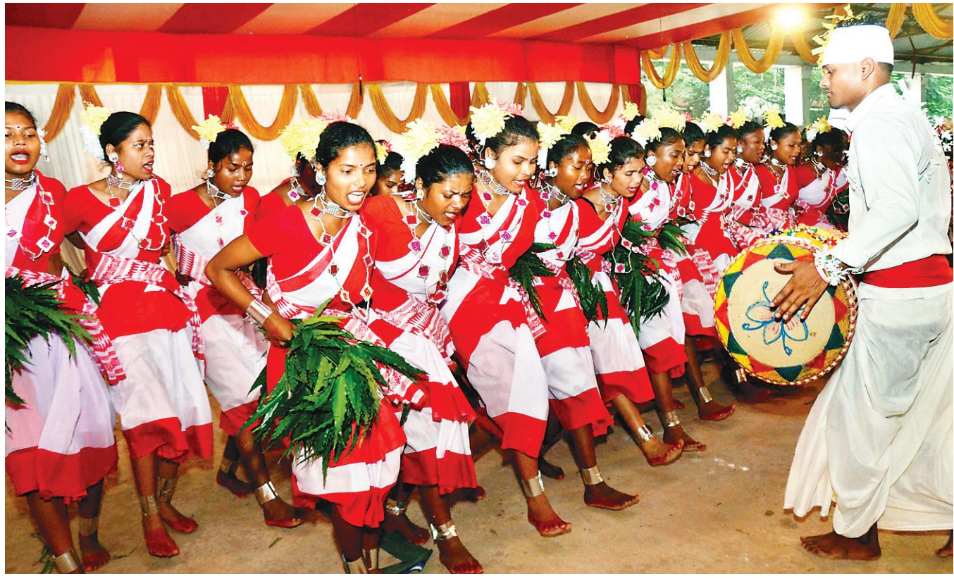
Tribal youth perform a cultural programme on the eve of Karma, a harvest festival, in Ranchi, Sunday.