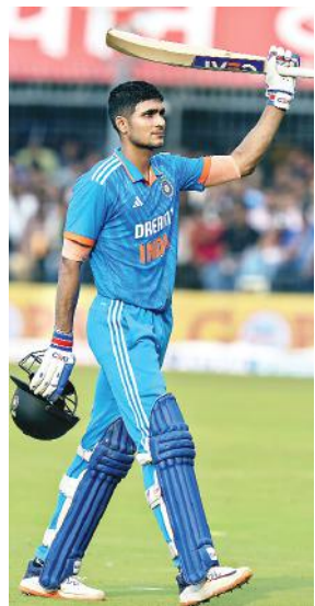
Shubman Gill celebrates after scoring a century.

The Holkar Stadium tends to produce high-scoring games and Sunday's game proved no exception. Both Gill and Iyer, who