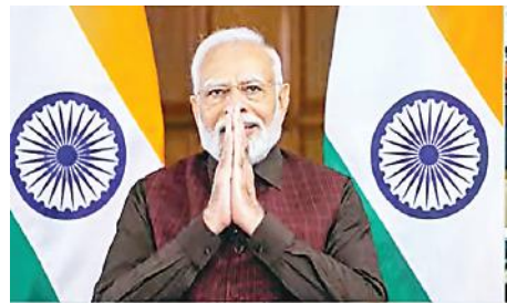
PM Modi virtually flags off nine Vande Bharat Express trains via video conferencing, in New Delhi, Sunday.

Flagging off the Vande Bharat Express trains via video conferencing, Modi also slammed the previous governments for not paying