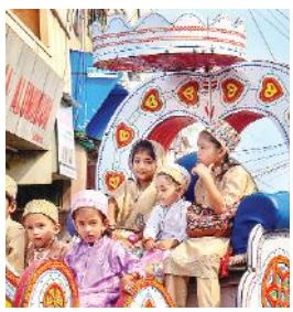
Children of Dawoodi Bohra community participate in a religious procession on the occasion of Eid-e-Milad-un-Nabi, in Bhopal, Sunday.