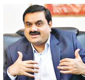
blend of solar and wind power.

Last week, Total announced it will hold a 50 per cent stake in the new joint venture firm where Adani Green Energy Ltd (AGEL) will hold the rest. The joint venture will hold a portfolio of 1,050 MW, including 300 MW of already operational capacity, 500 MW under construction and 250 MW under-development assets with a