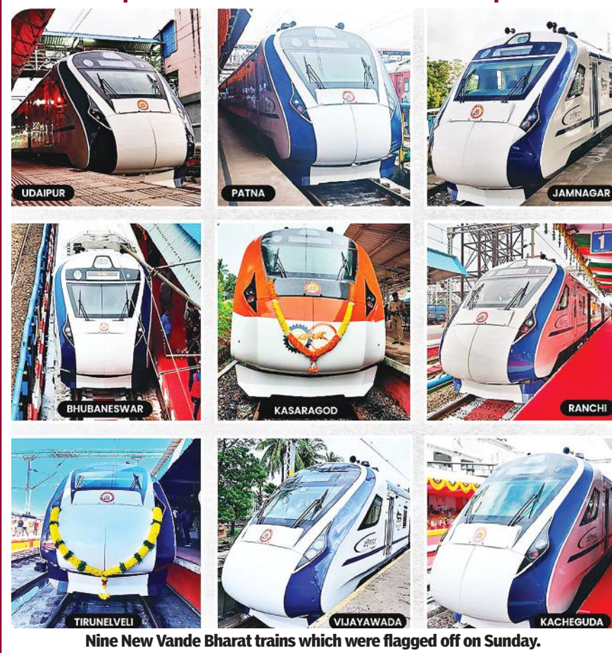
Nine New Vande Bharat trains which were flagged off on Sunday.