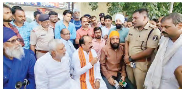
Kin of murdered youth and Sikh Samaj demand justice

Bhilai, Sep 17: After the murder of a 35-year-old youth, kin of the deceased and the members of Sikh Samaj are staging dharna at Khursipar Police Station for the last two days. They are demanding speedy trial and stern punishment for the accused and proper compensation for the bereaved family. BJP State President, local BJP MP, former VS Speaker and other senior leaders of BJP reached the