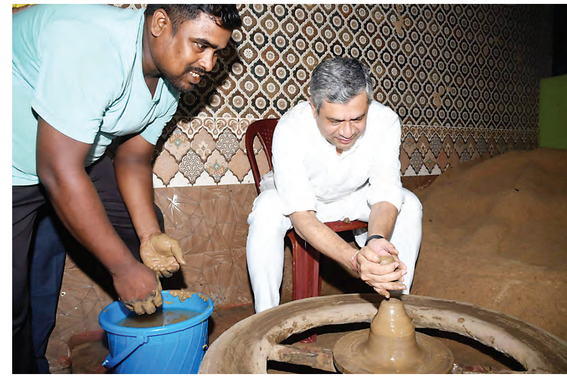
Union Railways Minister Ashwini Vaishnav tries his hands in pottery during a meeting with local artists, in Bhubaneswar, Sunday.