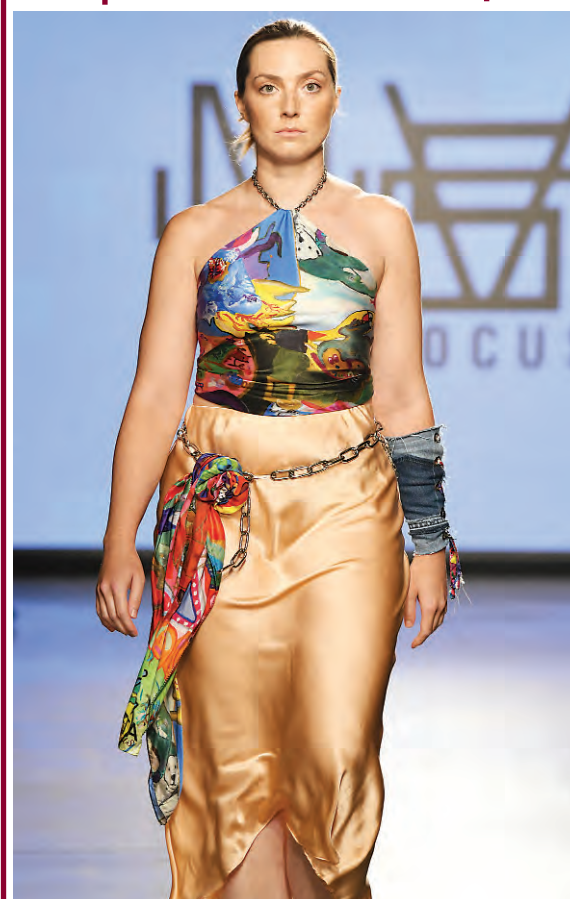
A model walks the runway during the Meta Vocus fashion show at the Global Fashion Collective II during New York Fashion Week - September 2023.