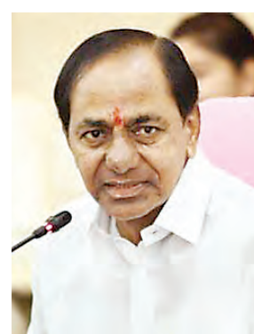
K Chandrasekhar Rao

After becoming a part of India, Telangana continued as state of Hyderabad from 1948 to