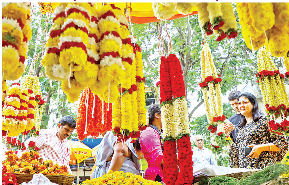
People purchase flowers and garlands ahead of Ganesh Chaturthi festival, in Bengaluru, Sunday.