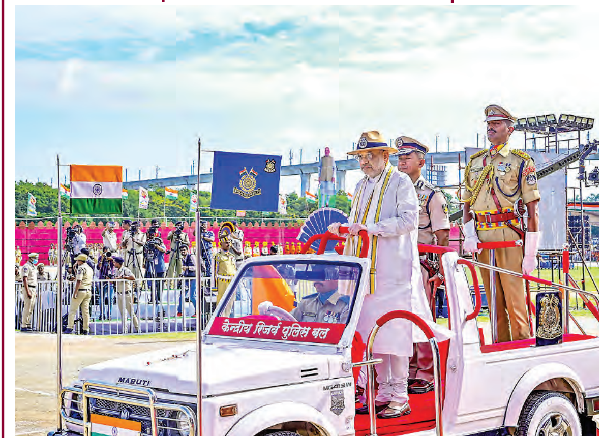
Union Home Minister Amit Shah inspects the parade during Hyderabad Liberation Day celebrations at Parade Ground, in Secunderabad, Sunday.