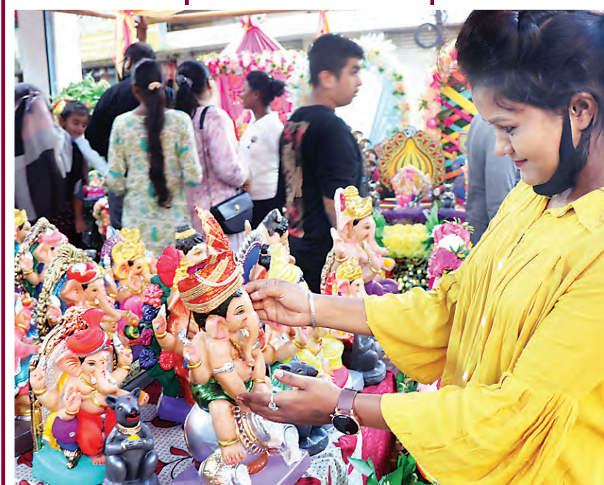
Devotees are selecting best of the idols in the market for the ten-day Ganesh Chaturthi festival beginning tomorrow.