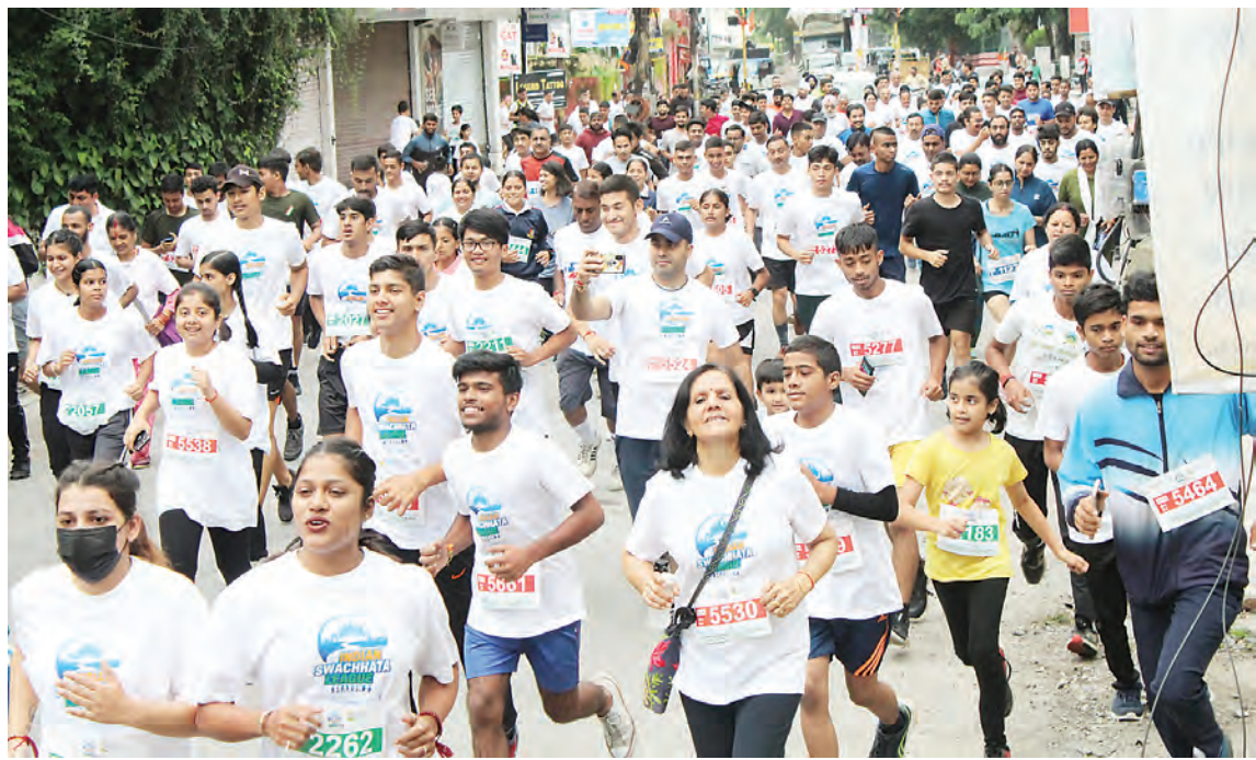
People take part in 'Swachhata League Marathon', in Dehradun, Sunday.