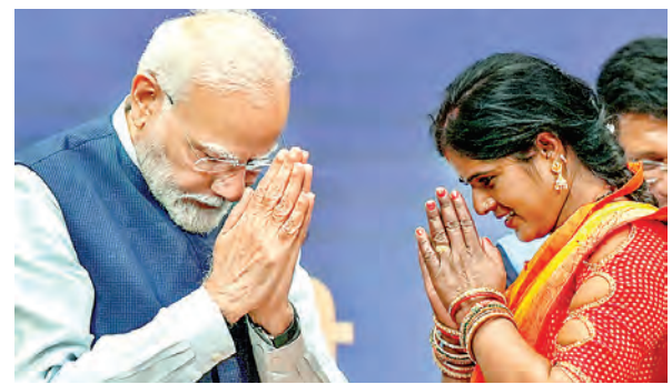
PM Modi during the inauguration of India International Convention and Expo Centre (IICC), in New Delhi, Sunday.

New Delhi, Sep 17 (PTI): Prime Minister Narendra Modi on Sunday launched Rs 13,000-crore PM Vishwakarma Yojana (scheme) for traditional artisans and craftsmen, and inaugurated the Rs 5,400-crore first phase of state-of-the-art India International Convention