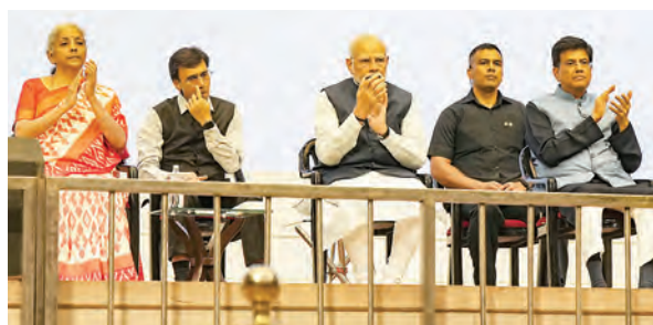
Prime Minister Narendra Modi with Union Ministers Nirmala Sitharaman, Piyush Goyal and Narayan Rane during the inauguration of India International Convention and Expo Centre (IICC), in New Delhi, Sunday.