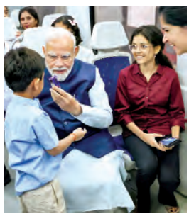
PM Modi travels via metro on his way to inaugurate IICC, in New Delhi, Sunday.