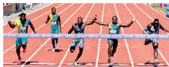
Christian Coleman of the United States (2nd-R) edges out Noah Lyles (C) in the Men's 100m competition at Hayward Field in Eugene, Oregon.

Eugene (US), Sep 17 (AP): American Christian Coleman edged world champion and fellow countryman Noah Lyles in the 100 meters at the season-ending Prefontaine Classic.