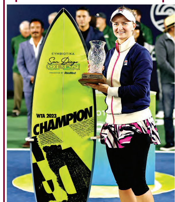
Barbora Krejčíková of the Czech Republic poses with the winners trophy and surfboard after defeating Sofia Kenin of the United States in the Finals Match of the Cymbiotika San Diego Open at Barnes Tennis Center on in San Diego, California.