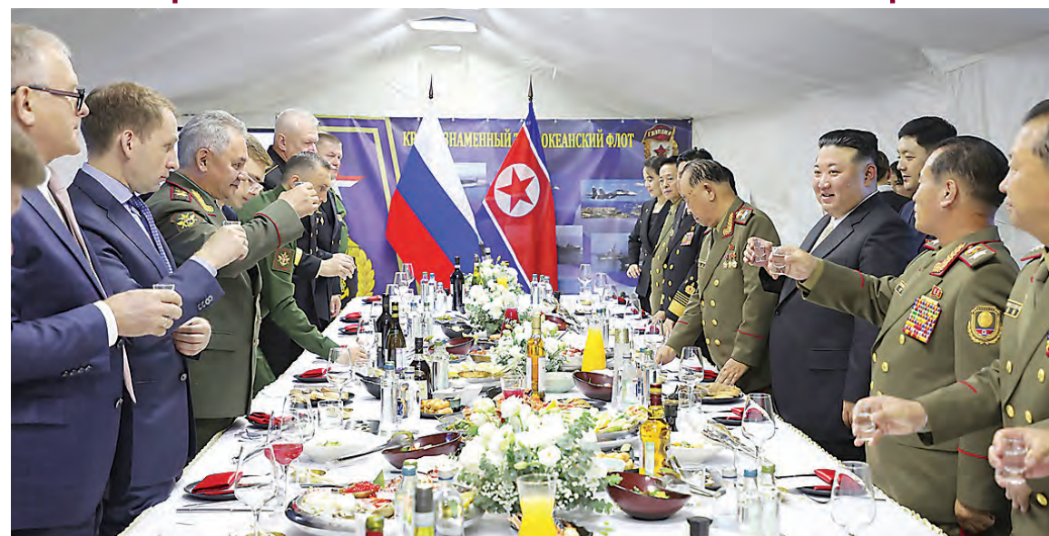
In this photo provided by the North Korean government, North Korean leader Kim Jong Un, third right, toasts with Russian Defense Minister Sergei Shoigu, third left, during his visit to the Russian Pacific fleet in Vladivostok, the Russian Far East. Independent journalists were not given access to cover the event depicted in this image distributed by the North Korean government. The content of this image is as provided and cannot be independently verified. Korean language watermark on image as provided by source reads: "KCNA" which is the abbreviation for Korean Central News Agency.