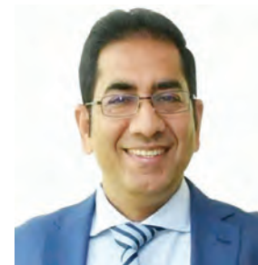
Dabur CEO Mohit Malhotra

Currently, Dabur's 75 per cent revenue comes from the domestic business. Its domestic business is concentrated in eight