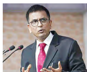
CJI Dhananjay Chandrachud

when they respect judges and judges get respect when they respect lawyers, and the mutual respect takes place when there is realisation that both are part of the same wheel of justice, he said.