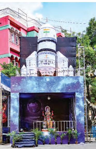
A 'pandal' themed on 'Chandrayaan-3' is made for the 'Ganesh Chaturthi' festival, in Kolkata, Sunday.

The committee has been organising Ganesh festi-