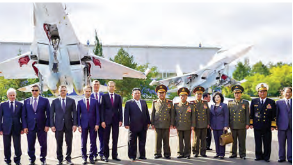
North Korean leader Kim Jong Un, center, poses for a photo after visiting Russian aircraft plant that builds fighter jets in Komsomolsk-on-Amur, about 6,200 kilometers (3,900 miles) east of Moscow, Russia.