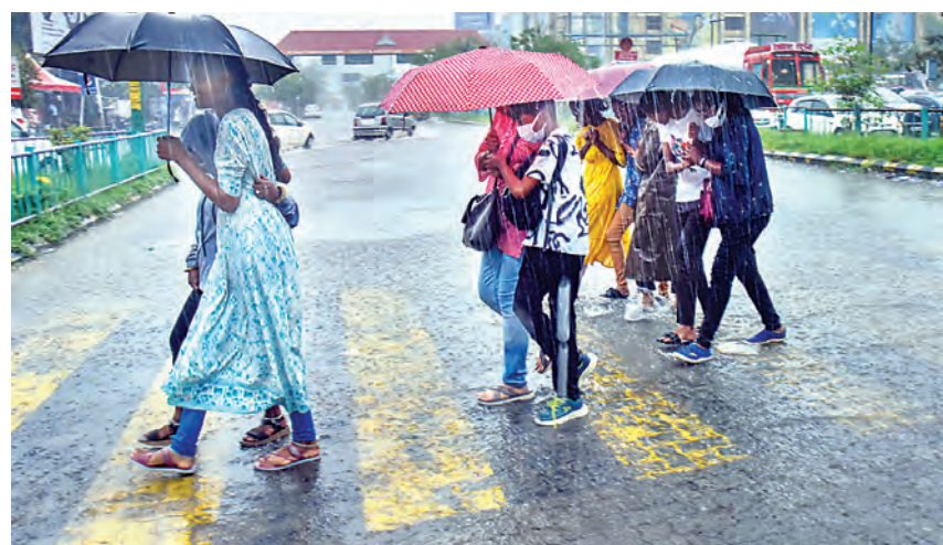
Pedestrians during rainfall, in Kochi, Friday. The India Meteorological Department (IMD) forecasted heavy rainfall and lightning in isolated parts of the state and issued a yellow alert in 11 districts excluding Thiruvananthapuram, Kollam and Pathanamthitta.