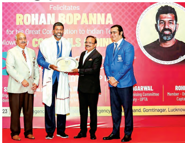
Indian tennis player Rohan Bopanna, who is set to end his Davis Cup career on Sunday, being felicitated by the AITA for his career, in Lucknow.

For Bopanna, Davis Cup was more than just another tournament for the current generation of players; it was a platform for representing one's country,