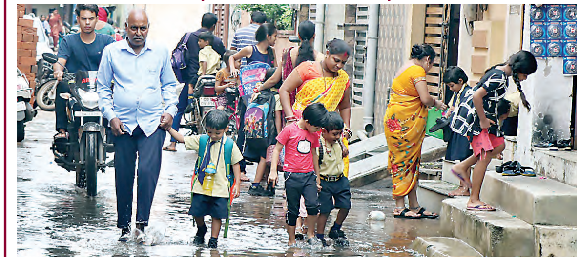
Many low lying areas of the capital city were inundated with knee-deep water even a day after heavy rains and people faced lots of problems in moving from one place to another.