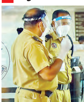
Health workers and security personnel control entry at an emergency ward at the medical college amid an outbreak of Nipah virus in Kerala, in Kozhikode, Friday.

and relevant provisions under the Kerala Police Act among others have been invoked. The accused was summoned to the police station, served notice and let off, police said. Section 505 (1) of the IPC deals with the offence of creating rumours which are likely to cause, fear or alarm to the public. According to the complaint, the accused had in a social media post claimed that Nipah virus, which has so far claimed two lives and has infected four others in the state, was a "narrative" created by pharma companies. The state government and the police had earlier warned the public not to spread fake news about the Nipah outbreak. A 39-year-old man has tested positive for the Nipah virus today taking the number of active cases in the state to four.