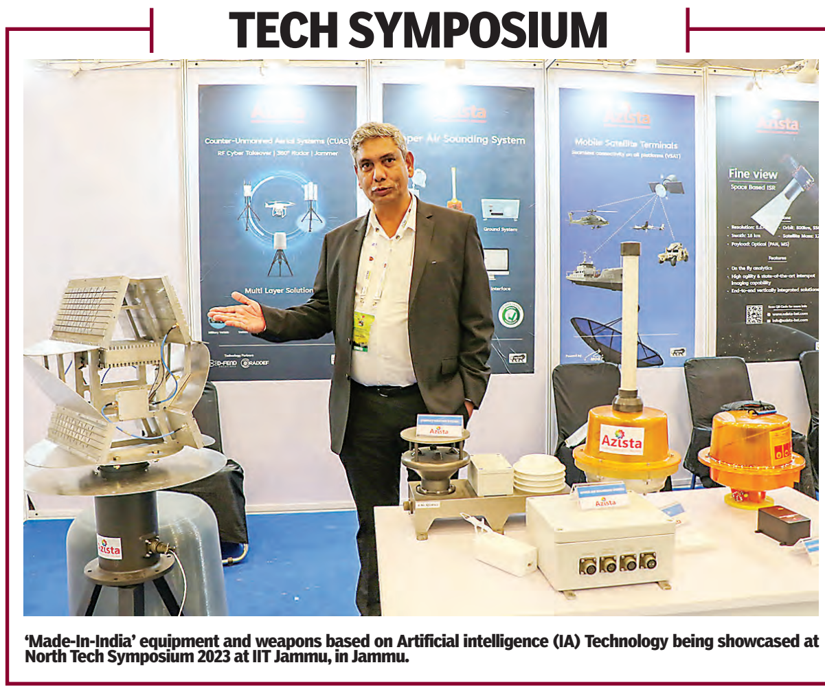
'Made-In-India' equipment and weapons based on Artificial intelligence (IA) Technology being showcased at North Tech Symposium 2023 at IIT Jammu, in Jammu.

German luxury car maker Mercedes-Benz India on Friday announced the extension of its electric vehicle charging network to the customers of other brands as it looks to accelerate faster adoption of electric vehicles in the country. The carmaker also launched the top-end EQE 500 4MATIC electric SUV at an introductory price of Rs 1.39 crore (all India ex-showroom) and a new 'Customer Experience Centre' at Chakan, in Pune. Mercedes-Benz is also supporting the EV (Electric Vehicle) transition in India by democratising the ultra-fast charging network. All EV customers in India across brands, can now enjoy the luxurious Mercedes-Benz