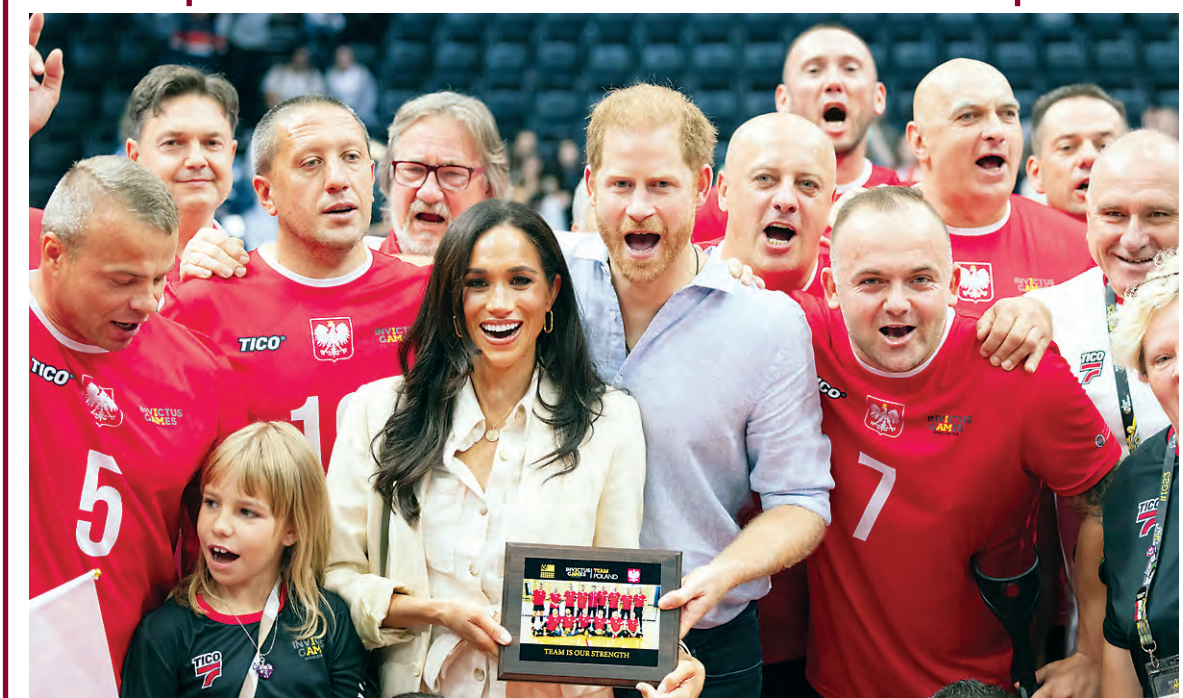
Britain's Prince Harry and his wife Meghan, Duchess of Sussex, pose as they attend the sitting volleyball match between fans from Germany and Poland at the 6th Invictus Games in the Merkur Spiel Arena, in Duesseldorf, Germany, Friday Sept. 15. Prince Harry celebrates his 39th birthday today.