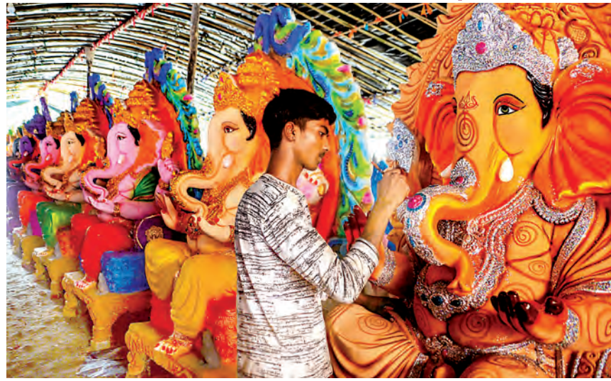
An artist gives final touches to the idols of Lord Ganesha ahead of the festival of Ganesh Chaturthi, in Kanpur, Tuesday.