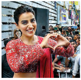
Bhojpur actor Akshara Singh during the inauguration of Akshara's Studio, in Patna, Tuesday.