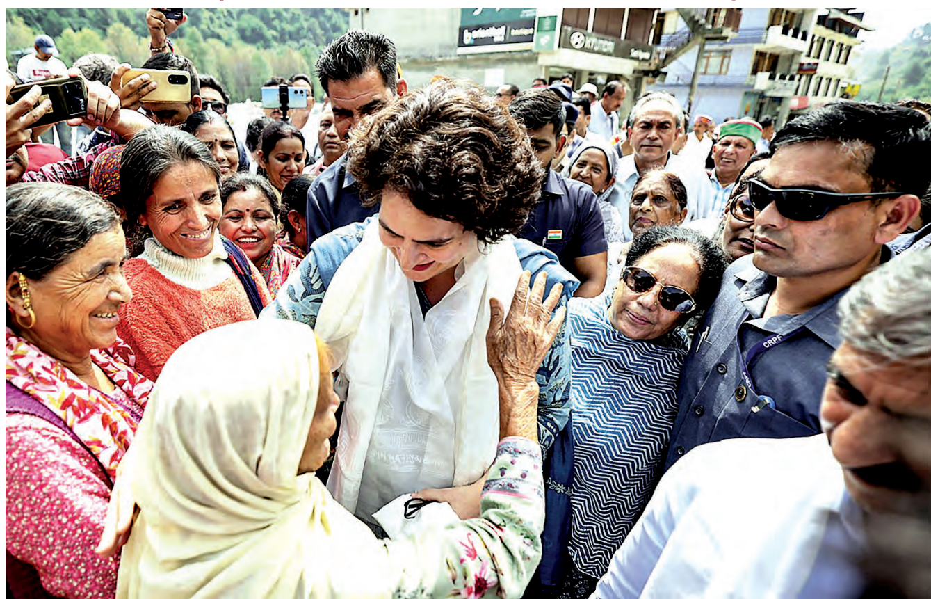
AICC General Secretary Priyanka Gandhi Vadra meets families affected by rainfall-triggered flooding in Manali, Himachal Pradesh, Tuesday, Sept. 12.