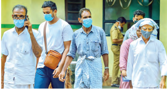
People wear masks at a medical college after the Nipah virus alert, in Kozhikode, Tuesday.

Two "unnatural deaths" following fever were reported from Kozhikode on Monday. Relatives of one of the deceased are also admitted to the ICU, the