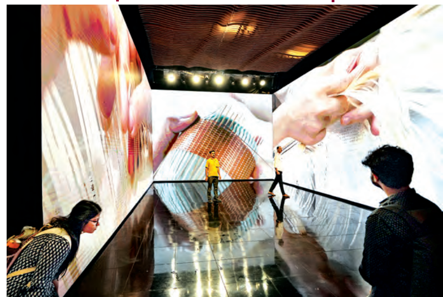
The Immersive zone with a selfie point at 'Culture Corridor: the G20 Digital Museum Exhibition' organised by the Ministry of Culture at Bharat Mandapam, in New Delhi, Tuesday.