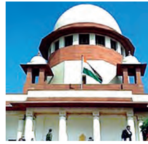
The apex court declined to accept the Centre's fervent request that reference of the petitions to a larger bench be deferred as Parliament is in the process

The Supreme Court on Tuesday referred to a constitution bench of at least five judges a batch of pleas challenging the constitutional validity of the IPC provision on sedition, a month after the Centre introduced in Parliament bills to replace the colonial-era penal statutes IPC, CrPC and the Evidence Act, proposing among other things the repeal of the sedition law.