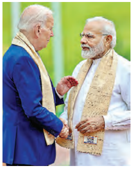
PM Modi with US President Joe Biden at Mahatma Gandhi's memorial Rajghat on the final day of the G20 Summit, in New Delhi, Sunday.