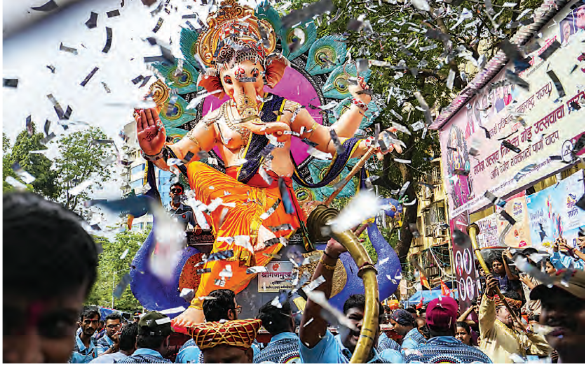
Devotees carry an idol of Lord Ganesha to a pandal ahead of the Ganesh Chaturthi festival, in Mumbai, Sunday.