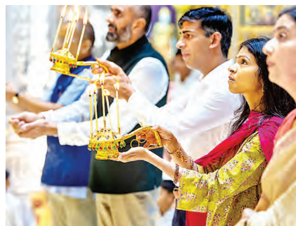
UK PM Rishi Sunak with wife Akshata Murthy offers prayers at the Akshardham Temple in New Delhi, Sunday morning.

They reached the temple dedicated to Swaminarayan, believed to be an incarnation of Lord Vishnu, early morning and walked barefoot from the reception area to the main temple complex — a distance of about 150 metres. Sunak, who was dressed in a crisp white shirt and navy blue trousers, and his wife, who paired a beige kurta with a bright pink dupatta and loose pants, were accorded a traditional welcome at the temple. Sunak and his