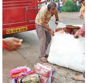
In the Pushparaj Bus coming from Bilaspur to Kota,

a total of 161 pieces of sarees were found in abandoned condition and it is estimated to cost around Rs 1.68 lakh. The sarees were packed in a polythene bag and kept atop the cabin. This collection too seems to be in view of forthcoming VS polls.