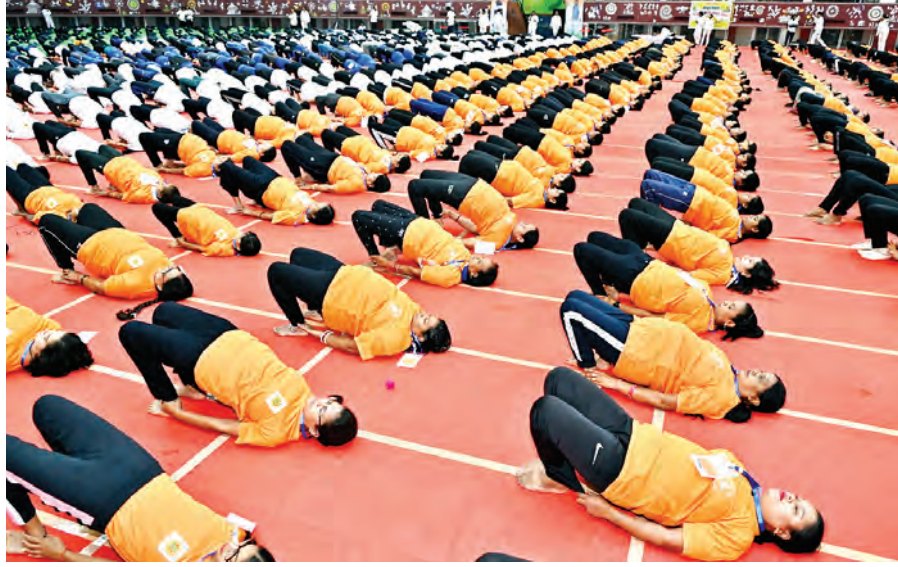
Central Chronicle News

Raipur, Sep 10: Chhattisgarh has registered its name in golden letters in the Golden Book of World Records for the performance of 'Setubandha Asana' with more than 2000 yoga practitioners from all over the