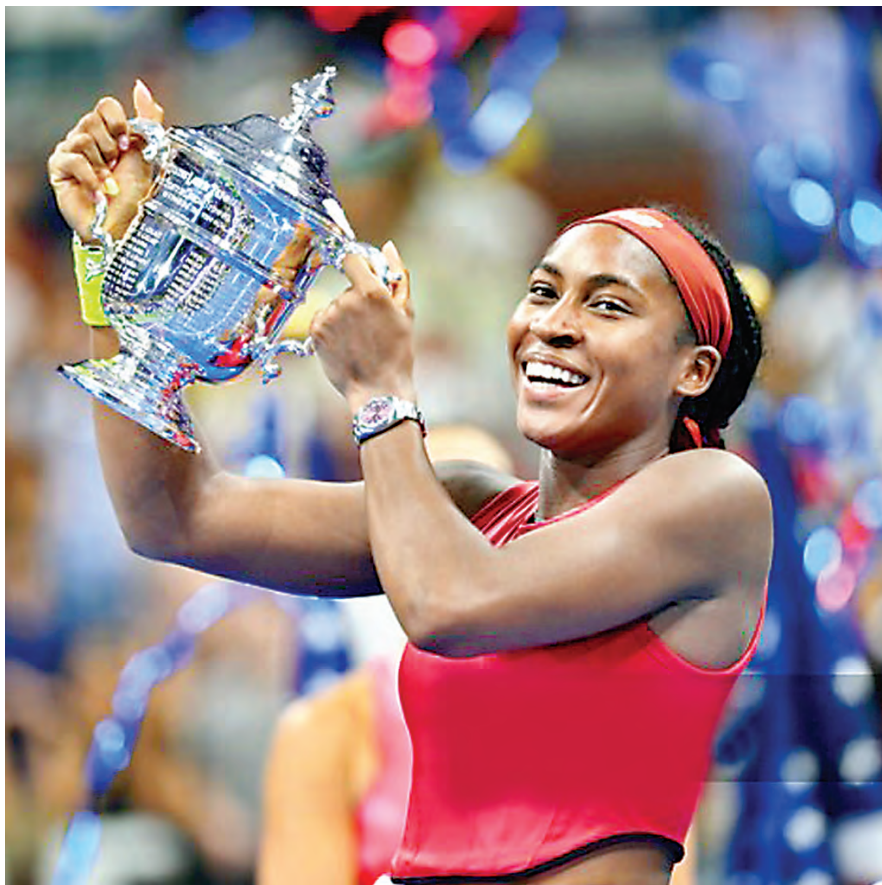
the final at Arthur Ashe Stadium, delighting a raucous crowd that backed her from start to finish.

As a pro athlete from a young age, as someone of whom greatness has been expected by some and doubted by others, Gauff has always taken it all in and kept moving forward, trying to learn from each setback. And now, at a tournament she used to visit as a kid to see her idols, Serena and Venus Williams, Gauff is a Grand Slam champion herself and a certified star. Setting aside a so-so start Saturday, Gauff surged to a 2-6, 6-3, 6-2 victory over the soon-to-be No. 1 Aryna Sabalenka in