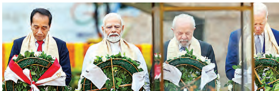
PM Modi, US President Joe Biden, Brazil's President Luiz Inacio Lula da Silva and Indonesian President Joko Widodo pay homage at Mahatma Gandhi's memorial Rajghat on the final day of the G20 Summit, in New Delhi, Sunday.

He welcomed the dignitaries with an 'angvas-tram' or stole having in the background an image of Gandhi's Sabarmati Ashram in Gujarat, which was his home from 1917 to 1930 and served as one of the main centres of India's