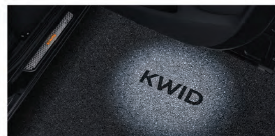
puddle lamp ^

for a test drive, call on 1800 315 4444. select variants available in CSD. special offers for defence personnel, government, PSU and corporate employees. for bulk enquiries, contact corpsales@renault.com for further details, connect on www.renault.co.in