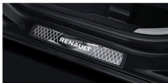
illuminated scuff plate ^