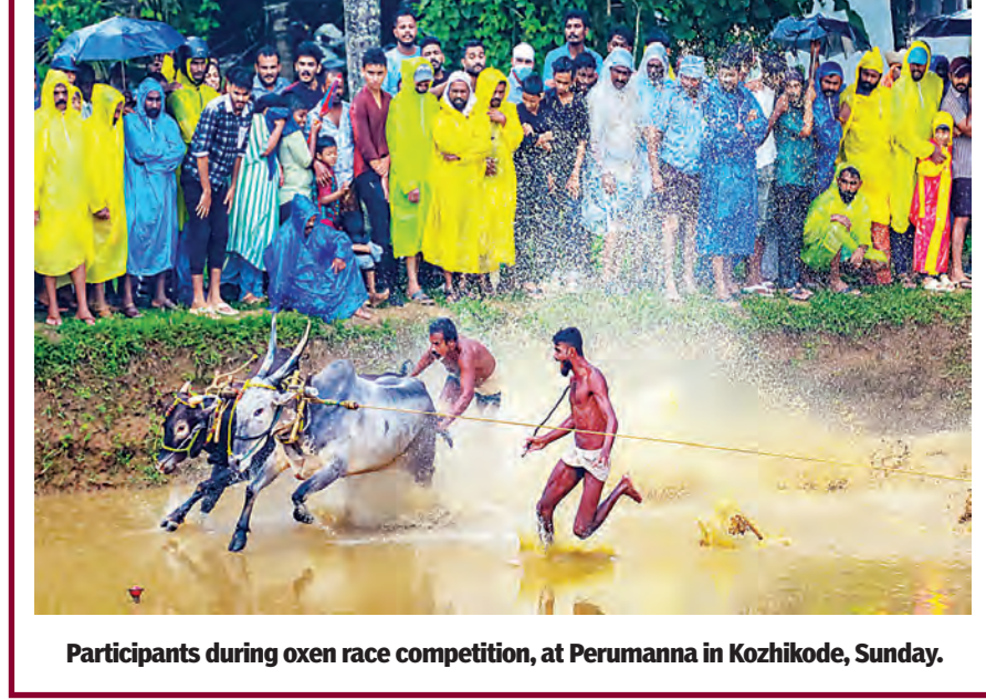
Participants during oxen race competition, at Perumanna in Kozhikode, Sunday.