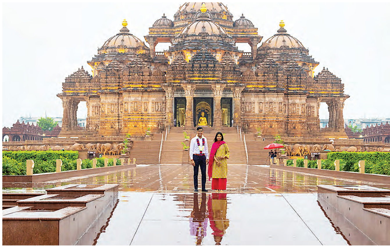
UK Prime Minister Rishi Sunak with wife Akshata Murthy visits the Akshardham Temple in New Delhi, Sunday morning, Sept. 10. Sunak is in Delhi for the G20 Summit.