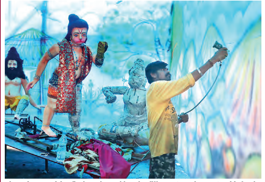
The artists are giving final touch to tableau by different Ganeshotsav Samitis for the 10-day Ganesh Chaturthi festival in the coming days.