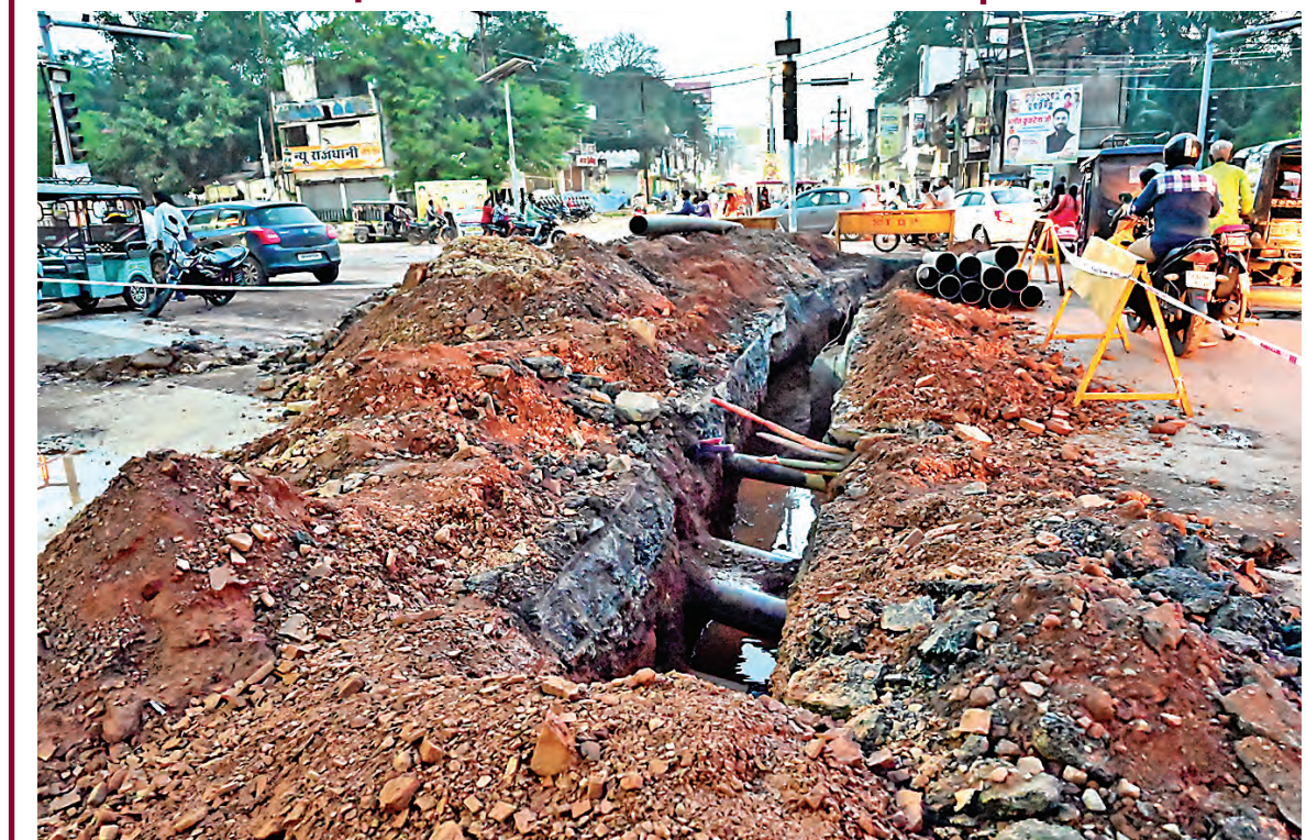
The digging of roads for laying of cables and pipelines continues in different parts of capital city and it is posing lots of inconvenience to vehicle riders and people.