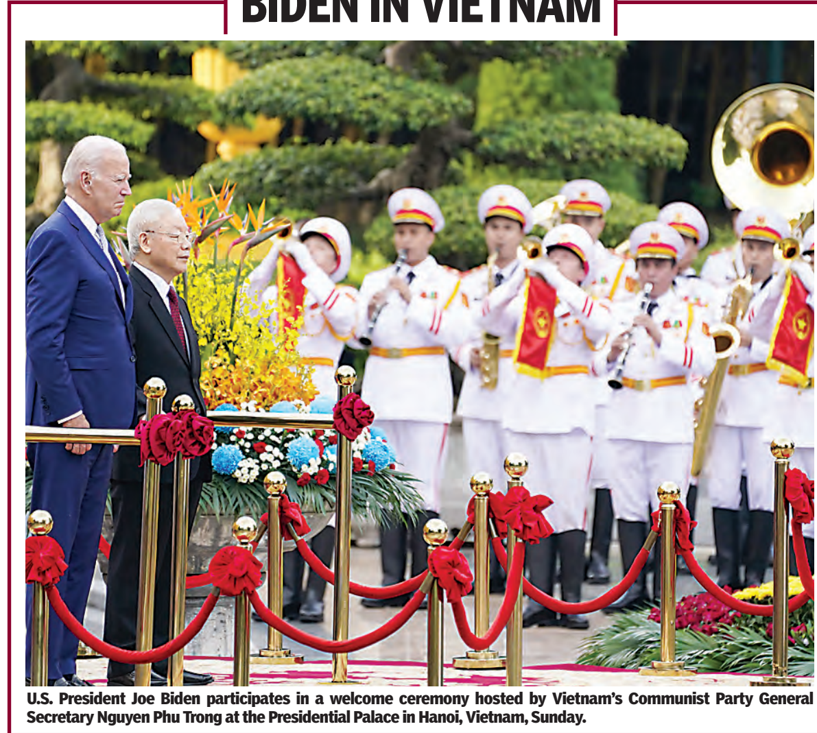
U.S. President Joe Biden participates in a welcome ceremony hosted by Vietnam's Communist Party General Secretary Nguyen Phu Trong at the Presidential Palace in Hanoi, Vietnam, Sunday.

The activist group, which helps organize humanitarian assistance,