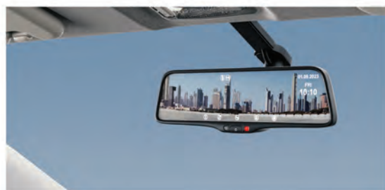
smart mirror monitor with 24.5 cm display ^

benefits up to ₹65 000* on the Renault range