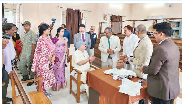
Quick execution of warrants can reduce court case pendency: Bhaduri

Compoundable criminal cases and matters of civil, family, motor accident claims were placed in the National Lok Adalat and were resolved on the basis of mutual reconciliation and agreement. Apart from this,