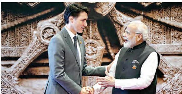
PM Modi with Canada Prime Minister Justin Trudeau.

In his talks with Trudeau on the sidelines of the G20 Summit, Modi also mentioned that a relationship based on "mutual respect and trust" is essential for