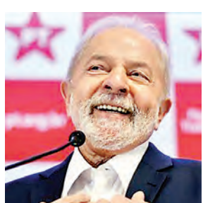
Luiz Inacio Lula da Silva

operation instead of conflict," he said soon after Prime Minister Narendra Modi handed over the G20 presidency to him. The next summit will be held in Rio de Janeiro in