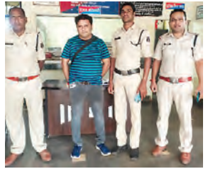
In the action by Kota police, a pick-up was stopped in Bilaspur and on conducting checking, cash of

Cash of Rs 2.50 lakh recovered from pick-up