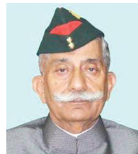
Lt Governor Mishra