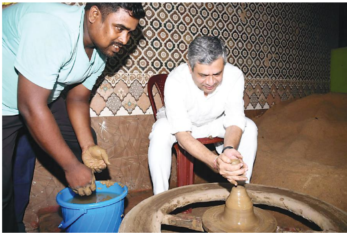
Union Railways Minister Ashwini Vaishnaw tries his hands in pottery during a meeting with local artists, in Bhubaneswar, Sunday.