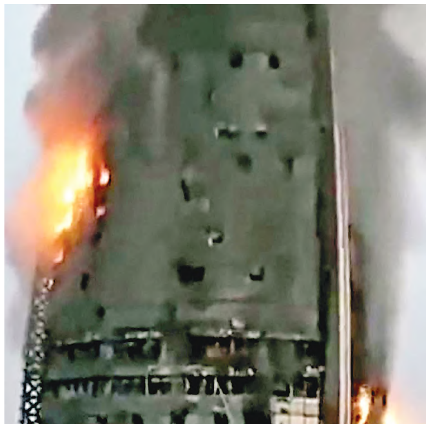
A grab from a UGC video posted on the X platform (formerly Twitter), reportedly shows a raging fire inside the Greater Nile Petroleum Oil Company Tower in Khartoum. Battles between the regular army and the paramilitary Rapid Support Forces, which intensified on September 17, had set fire to several key buildings in central Khartoum.