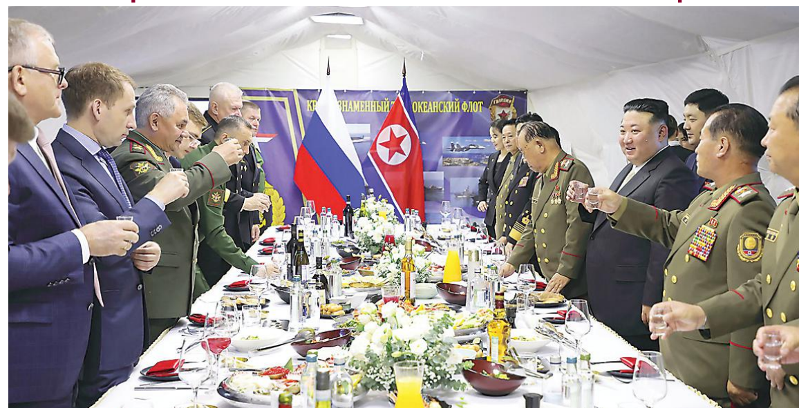
In this photo provided by the North Korean government, North Korean leader Kim Jong Un, third right, toasts with Russian Defense Minister Sergei Shoigu, third left, during his visit to the Russian Pacific fleet in Vladivostok, the Russian Far East. Independent journalists were not given access to cover the event depicted in this image distributed by the North Korean government. The content of this image is as provided and cannot be independently verified. Korean language watermark on image as provided by source reads: "KCNA" which is the abbreviation for Korean Central News Agency.