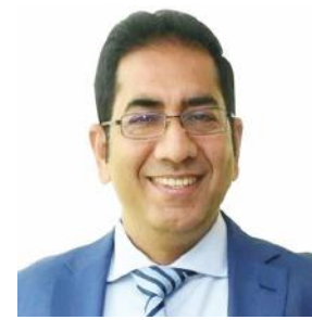
Dabur CEO Mohit Malhotra

Currently, Dabur's 75 per cent revenue comes from the domestic business. Its domestic business is concentrated in eight