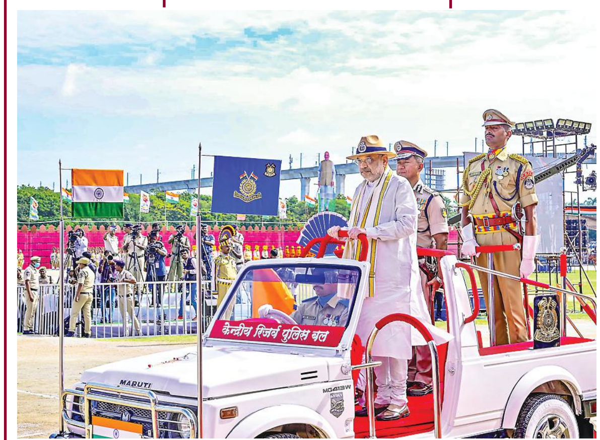
Union Home Minister Amit Shah inspects the parade during Hyderabad Liberation Day celebrations at Parade Ground, in Secunderabad, Sunday.