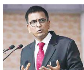
CJI Dhananjay Chandrachud

when they respect judges and judges get respect when they respect lawyers, and the mutual respect takes place when there is realisation that both are part of the same wheel of justice, he said.