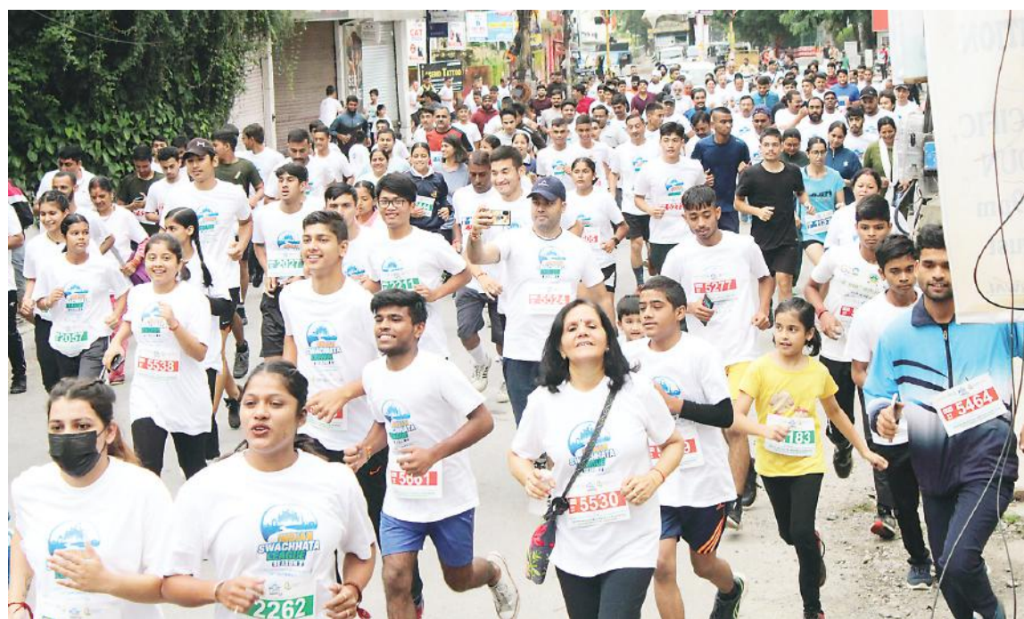
People take part in 'Swachhata League Marathon', in Dehradun, Sunday.