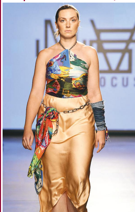
A model walks the runway during the Meta Vocus fashion show at the Global Fashion Collective II during New York Fashion Week - September 2023.