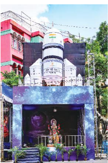
A 'pandal' themed on 'Chandrayaan-3' is made for the 'Ganesh Chaturthi' festival, in Kolkata, Sunday.

The committee has been organising Ganesh festival for the last 14 years and is known to be the oldest in