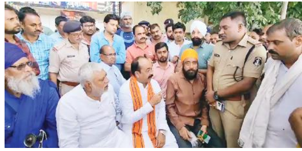
● Kin of murdered youth and Sikh Samaj demand justice

Bhilai, Sep 17: After the murder of a 35-year-old youth, kin of the deceased and the members of Sikh Samaj are staging dharna at Khursipar Police Station for the last two days. They are demanding speedy trial and stern punishment for the accused and proper compensation for the bereaved family. BJP State President, local BJP MP, former VS Speaker and other senior leaders of BJP reached the