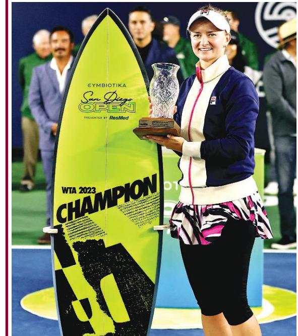
Barbora Krejčíková of the Czech Republic poses with the winners trophy and surfboard after defeating Sofia Kenin of the United States in the Finals Match of the Cymbiotika San Diego Open at Barnes Tennis Center on in San Diego, California.