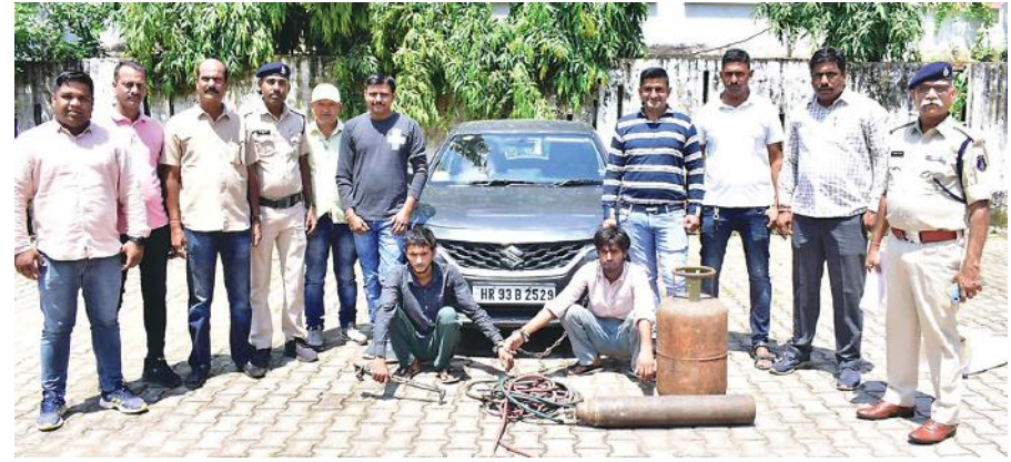
● Two arrested; two absconding

Bhilai, Sep 17: With the arrest of two ruffians from Haryana, Durg Police claimed to have solved three incidents of ATM Kiosk robbery which occurred on the intervening night of August 28 at Borsi and Hudco. The masked accused had used gas cutters to break the ATM Machines and steal cash. After stealing cash, the accused set the kiosks on fire at all the three spots. Rs 21,54,500/- was stolen from the ATM situated at Housing Board Shopping Complex in Borsi while Rs 48,47,300/- was stolen from two ATMs situated in Hudco Colony. The accused had robbed a total amount of Rs 70,01,800/- in a single night. FIRs were lodged at Padmanabhpur and Bhilai Nagar Police Stations under sections 457, 380, 427, 436 of IPC and sections 03, 04 of Prevention of Damage to Public Property Act.