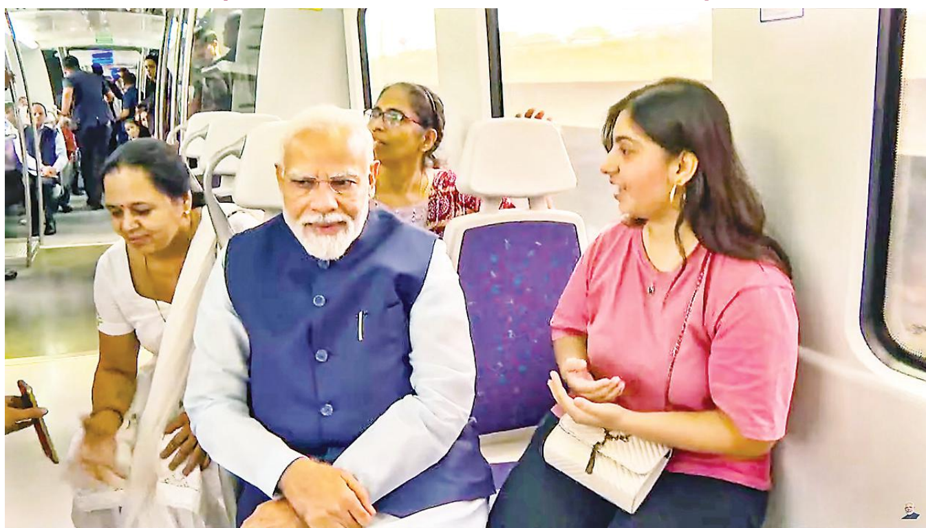
Prime Minister Narendra Modi travels via metro on his way to inaugurate India International Convention and Expo Centre (IICC), in New Delhi, Sunday, Sept. 17.