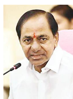
K Chandrasekhar Rao

After becoming a part of India, Telangana continued as state of Hyderabad from 1948 to