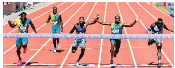
Christian Coleman of the United States (2nd-R) edges out Noah Lyles (C) in the Men's 100m competition at Hayward Field in Eugene, Oregon.

Eugene (US), Sep 17 (AP): American Christian Coleman edged world champion and fellow countryman Noah Lyles in the 100 meters at the season-ending Prefontaine Classic.