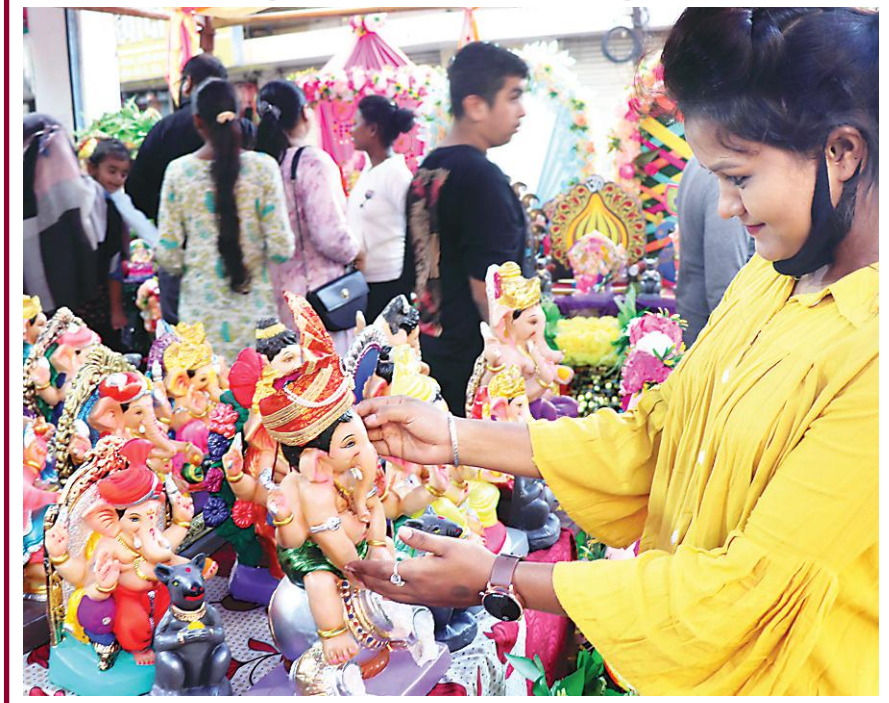
Devotees are selecting best of the idols in the market for the ten-day Ganesh Chaturthi festival beginning tomorrow.