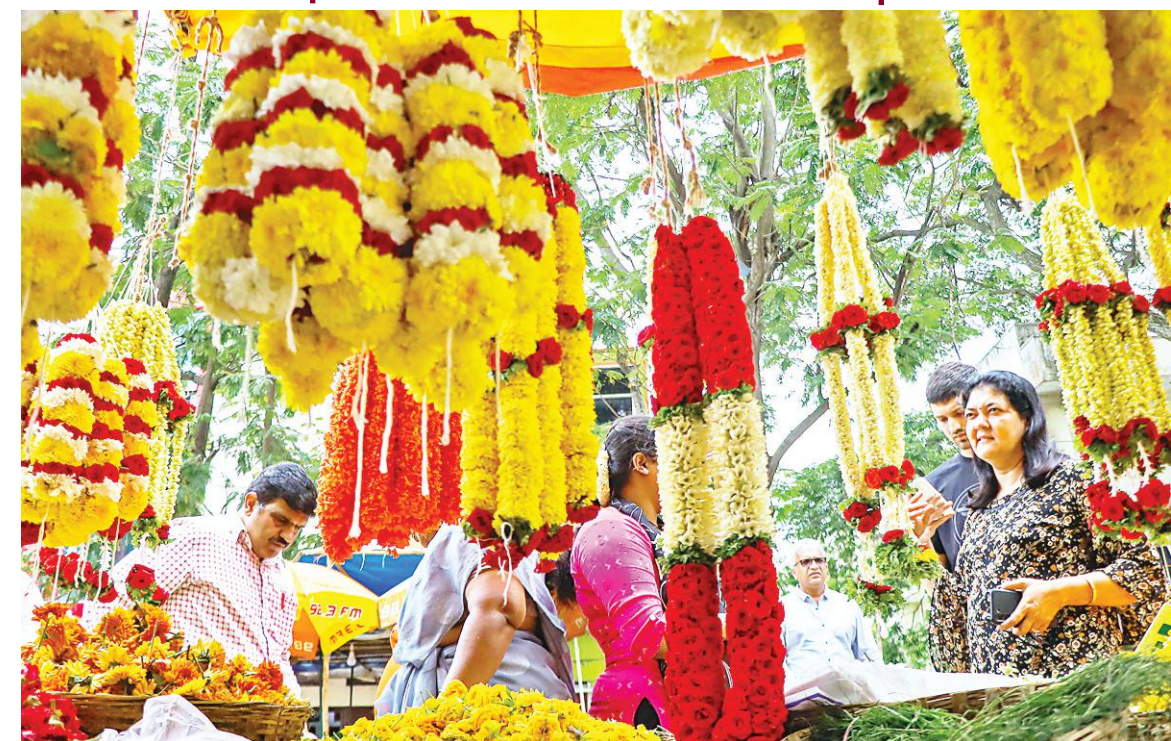
People purchase flowers and garlands ahead of Ganesh Chaturthi festival, in Bengaluru, Sunday.