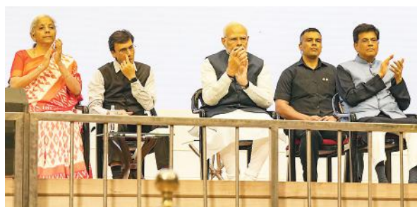
Prime Minister Narendra Modi with Union Ministers Nirmala Sitharaman, Piyush Goyal and Narayan Rane during the inauguration of India International Convention and Expo Centre (IICC), in New Delhi, Sunday.