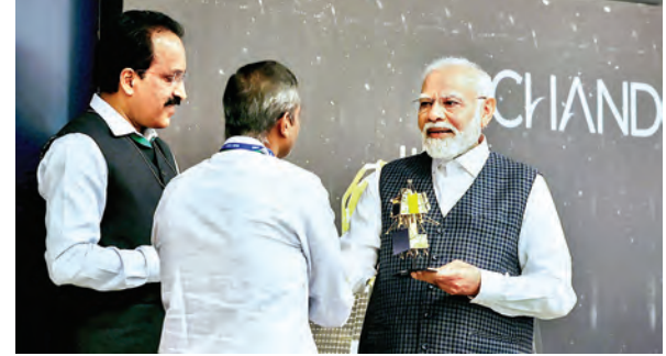
PM Narendra Modi at success of Chandrayaan-3 Mission, at ISRO Telemetry Tracking and Command Network (ISTRAC) in Bengaluru, Saturday.

Modi flew down to Bengaluru this morning from the Greek capital of Athens to interact with ISRO scientists on the successful lunar mission and announced the decision to name the spot where the lander 'Vikram' touched down as "Shiv Shakti point." "Termining the success of Chandrayaan-3 mission as an 'extraordinary moment' in the history of India's space programme, Modi, who turned emotional, said the