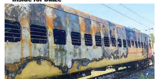
'Deeply pained by tragic loss of lives'

Officials blame cylinder "illegally" taken inside for blaze