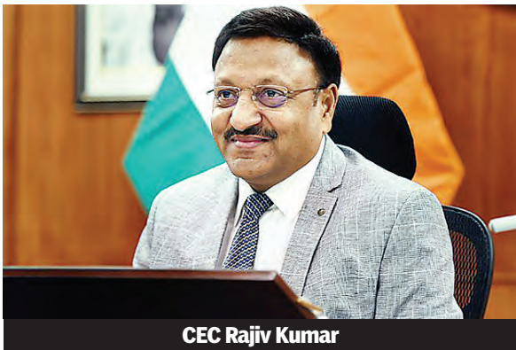
CEC Rajiv Kumar

Chief Election Commissioner Rajiv Kumar on Saturday said persons above 80 years of age and those with more than 40 per cent disability will be able to cast their votes from home through postal ballots in the upcoming Assembly elections in Chhattisgarh.