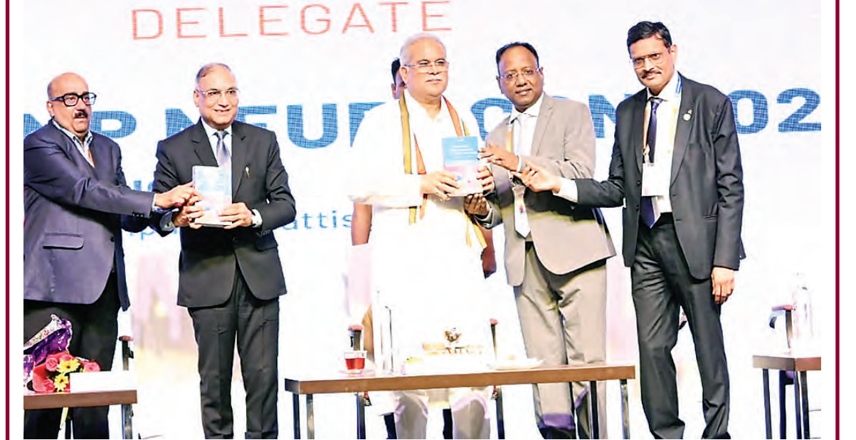
Chief Minister Bhupesh Baghel attended 21st CGMP Neurocon 23, organised at a private hotel in Raipur today.