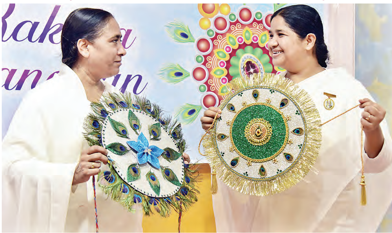
Brahma Kumaris show big size special 'rakhi' during the celebrations of 'Raksha Bandhan', in Bikaner, Saturday, Aug. 26.