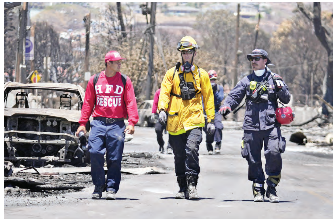
Members of a search-and-rescue team walk along a street, Saturday, Aug. 12, 2023, in Lahaina, Hawaii, following heavy damage caused by wildfire.