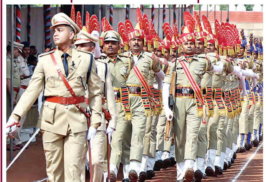
Full dress rehearsal was held at the Police Parade ground for the final Independence Day parade to be held on Tuesday.