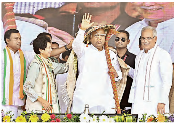
Congress President Mallikarjun Kharge with Chief Minister Bhupesh Baghel and others during the 'Bharose Ka Sammelan' programme, in Janjgir-Champa district, Sunday.

He criticised Prime Minister Narendra Modi for "not answering questions" asked by Rahul