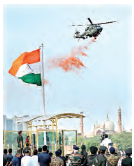
IAF's helicopters shower flower petals as the national flag is being unfurled at the rampart of the Red Fort, during full dress rehearsal for the celebrations of 77th Independence Day, in New Delhi, Sunday.