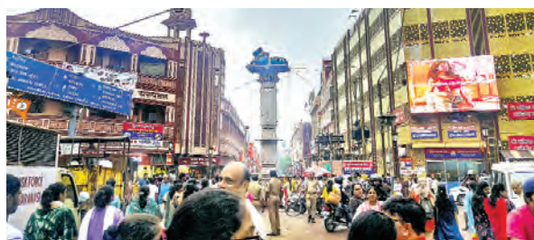
Crowd at Godowlia Chauraha, in Varanasi. Varanasi may be "older than history", but is currently transitioning - tradition and modernness in tow - into one of the centre-pieces of the central government's promotion of religious tourism.

L. A Nandi statue faces the Kashi Vishwanath temple at the centre of Varanasi's Godowlia crossing, continuing the centuries-old tradition of the guardian deity pointing in the direction of Lord Shiva's abode. Just behind, a massive screen plays a call to buy advertising space. Benares, as the city was once known, is "older than history, older than tradition, older even than leg-