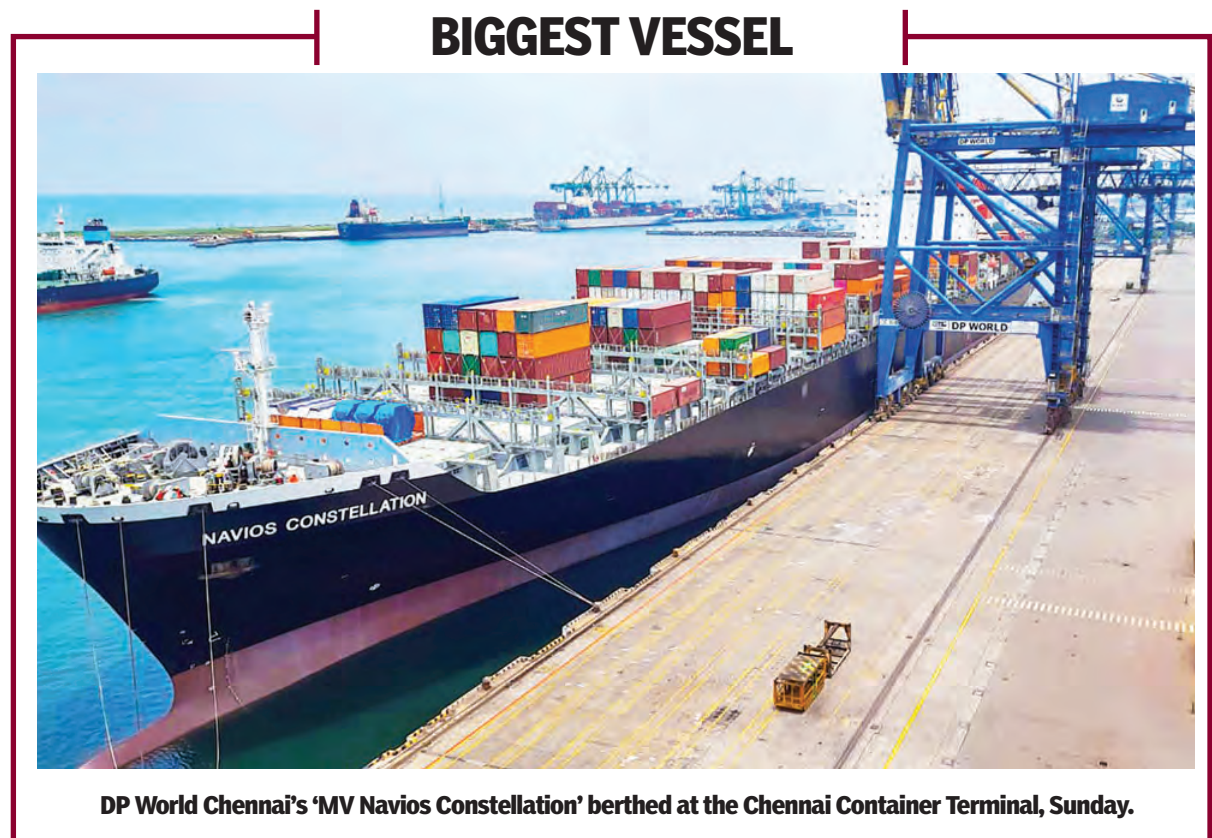
DP World Chennai's 'MV Navios Constellation' berthed at the Chennai Container Terminal, Sunday.

The company plans to raise up to Rs. 153.05 crore from the public issue at the higher price band of Rs. 166 per share. The minimum lot size for the application is 90 shares and multiple thereof.