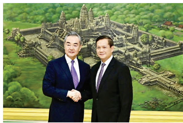
Cambodian Prime Minister Hun Sen's son, right, shakes hands with Chinese Foreign Minister Wang Yi, left, during a meeting in Peace Palace in Phnom Penh, Cambodia, Sunday, Aug. 13. China's foreign minister visited Cambodia over the weekend to reaffirm his country's commitment to the southeast Asian country after its incumbent prime minister handed off the job to his son following a one-sided election last month, officials said.