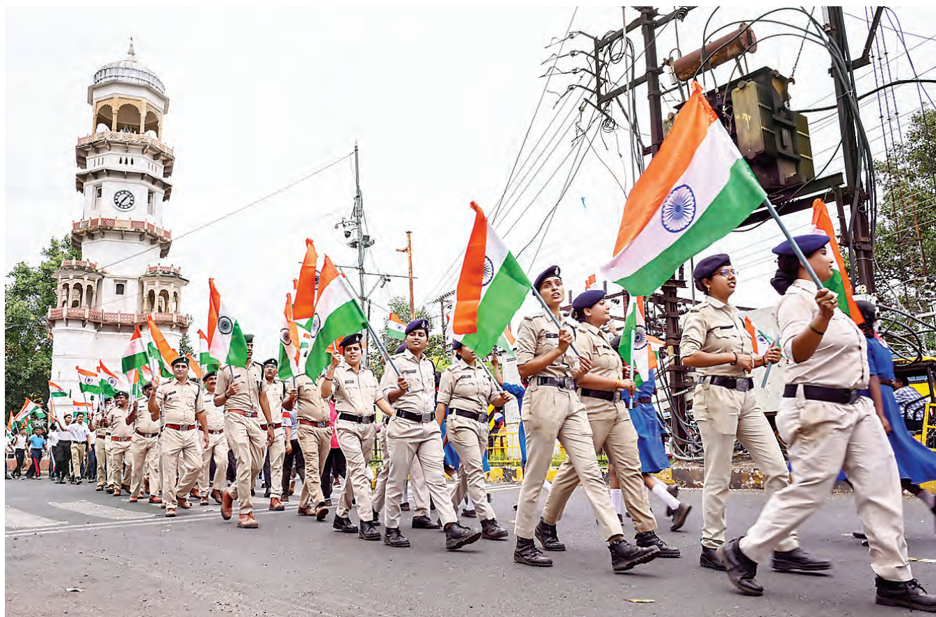
Police personnel take part in a 'Tiranga Rally' ahead of Independence Day, in Jabalpur, Sunday, Aug. 13.