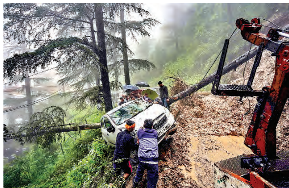
People pull a vehicle to a safer place after a landslide following heavy rainfall, in Shimla, Sunday.

A total of 452 roads, including a maximum of 236 in Mandi, 59 in Shimla and 40 in Bilaspur district are now closed for vehicular traffic, according to the state emergency operation centre. Three vehicles parked on the roadside were damaged following a landslide at Dudhli in the suburbs of Shimla city. A landslide also occurred near St. Edwards School, while uprooted trees