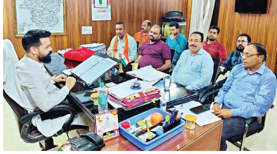
all the polling stations of Assembly Constituency No.-22 Katghora, along with this, a copy of the electoral roll has been provided to all the political parties by the District Election Office Korba.