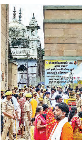
Security personnel stand guard outside the Gyanvapi mosque as a team of the ASI conducts a scientific survey at the mosque complex, in Varanasi, Saturday.