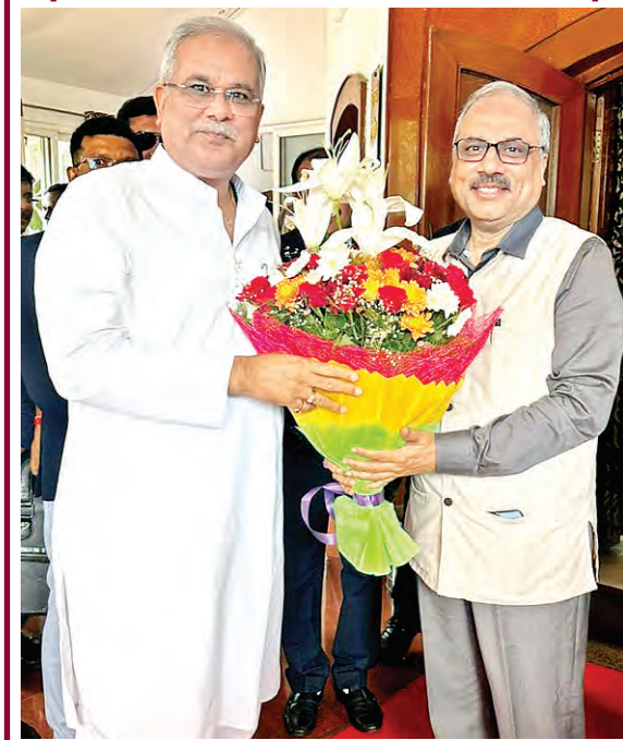
Chief Minister Bhupesh Baghel on Saturday met Chief Justice of Chhattisgarh High Court Ramesh Sinha, at Pahuna in the state capital Raipur.