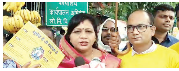
said that since the Congress government came to power in Chhattisgarh, farmers' loans were waived off within an hour.