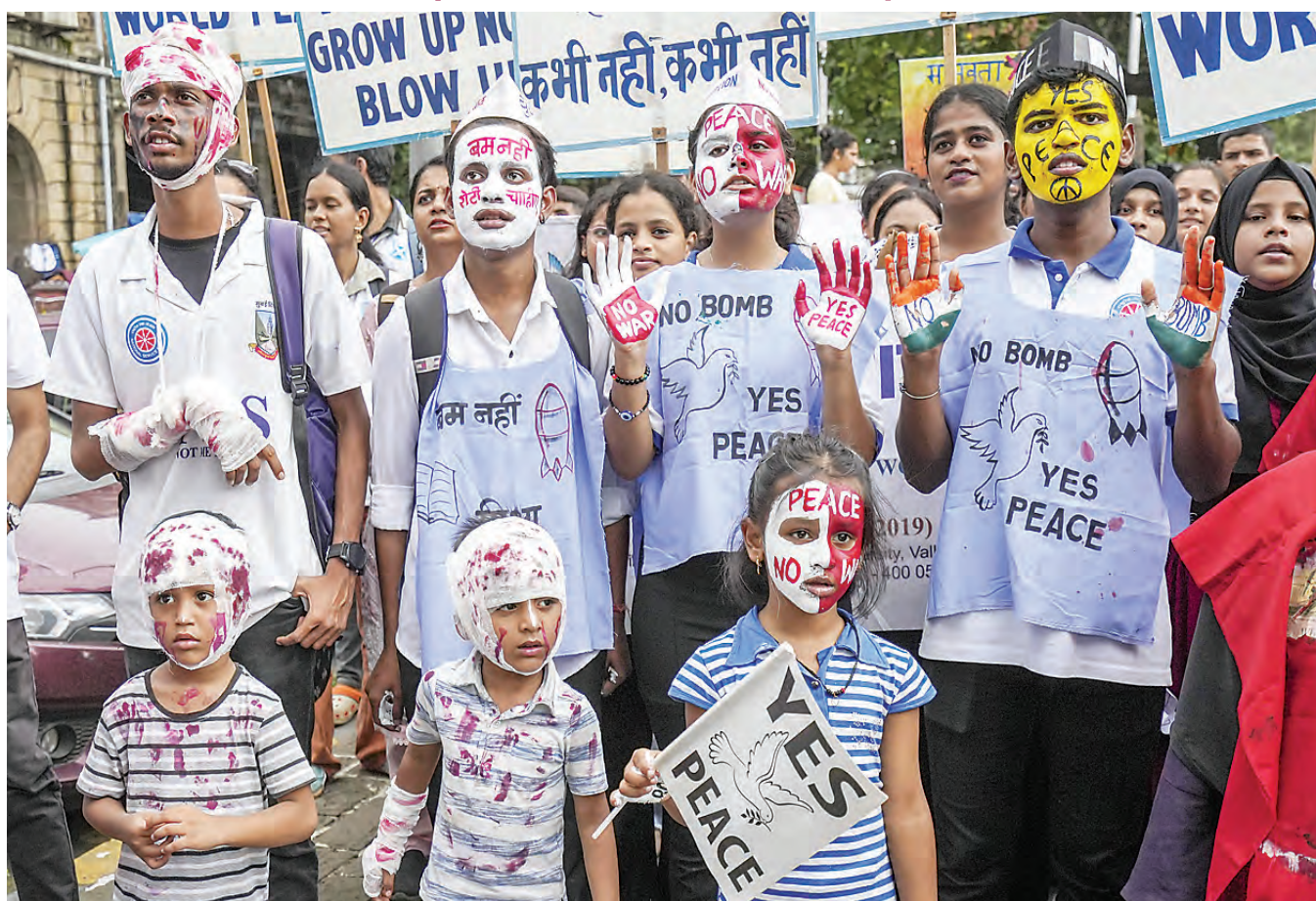
Students with painted faces participate in a peace rally on the eve of Hiroshima Day, in Mumbai, Saturday, Aug. 5. Students and social activists gather to observe the 78th anniversary of the world's first nuclear bombing in Hiroshima on August 6, 1945.