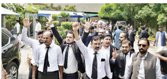
Lawyers and supporters of Pakistan's former Prime Minister Imran Khan chant slogans against the court decision at his residence, in Lahore, Pakistan, Saturday, Aug. 5. Pakistani police on Saturday arrested former Prime Minister Khan at his home in the eastern city of Lahore. It's the second time the popular opposition leader has been detained this year.

was arrested from his Zaman Park residence in Lahore after an Islamabad-based sessions court sentenced him to three years in prison on the charges of hiding the proceeds from the sale of state gifts from the Toshakhana. The Toshakhana is a department under the Cabinet Division that stores gifts given to rulers and government officials by heads of other governments and foreign dignitaries. Khan bought some gifts including a precious watch given to him by the Saudi crown prince and sold the same for profit.