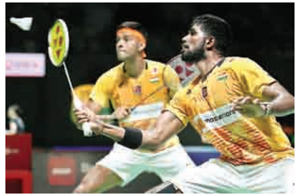
India's Satwiksairaj Rankireddy, right, and Chirag Shetty play against Indonesia's Fajar Alfian and Muhammad Rian Ardianto.

The win enabled Feng to restore parity as far as his head-to-head record against Srikanth is concerned, which stands at 1-