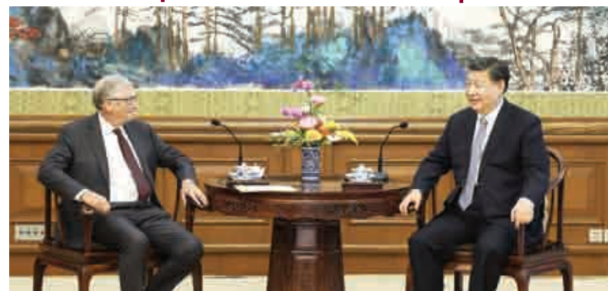
Bill Gates, left, meets with Chinese President Xi Jinping in Beijing, Friday, June 16. Microsoft's co-founder Bill Gates has met with Chinese President Xi Jinping just days after a visit to Beijing by Tesla CEO Elon Musk. The state broadcaster CCTV showed Xi saying he was happy to see Gates, who he called an "old friend," after three years without meeting during the pandemic.