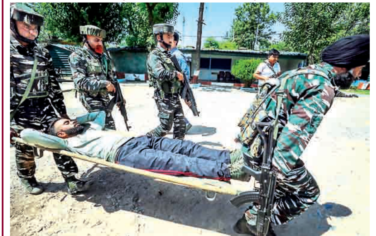
Central Reserve Police Force (CRPF) personnel and Quick Action Team (QAT) special commandos during an Mock Drill exercise ahead of the annual Amarnath Yatra 2023, at a camp in Udhampur district, Friday.