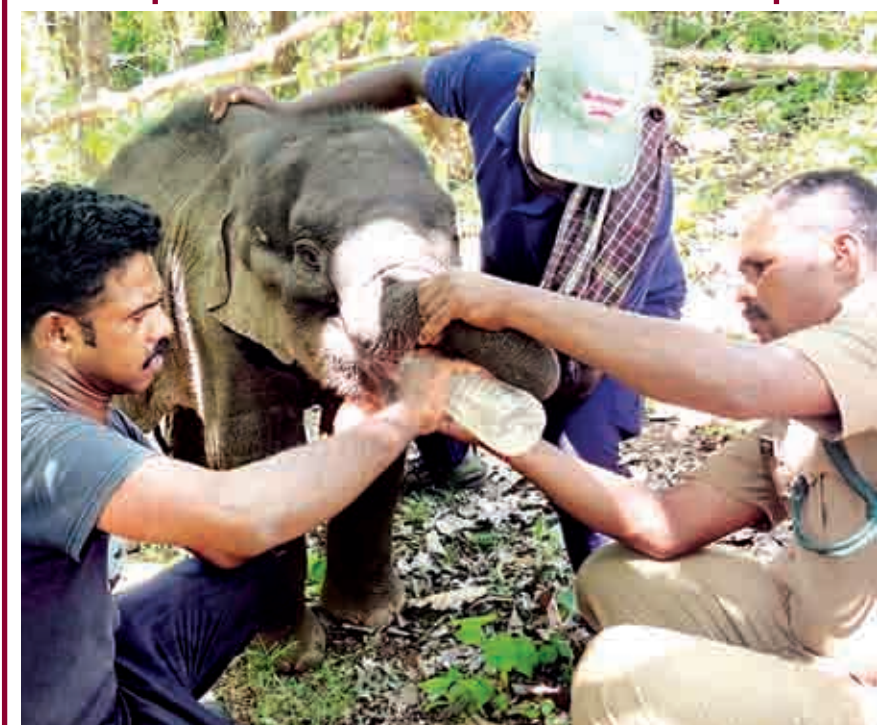
A baby elephant, strayed from the herd, cared by the forest rangers, in Palakkad, Friday.