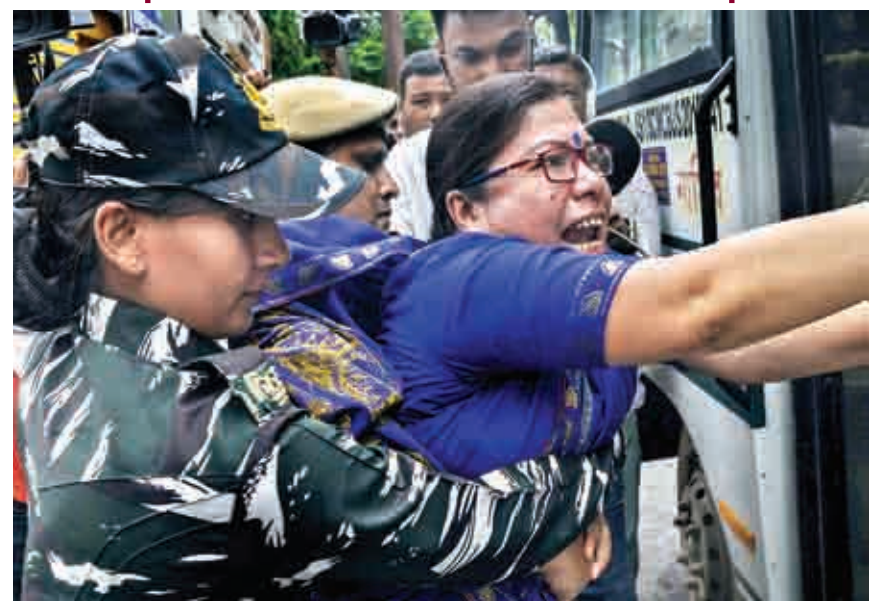
An activist of the Sadou Assam Jyoti Kendra Siksha Karmi Santha being detained during a protest in front of Samagra Shiksha Abhiyan office, in Guwahati, Friday.