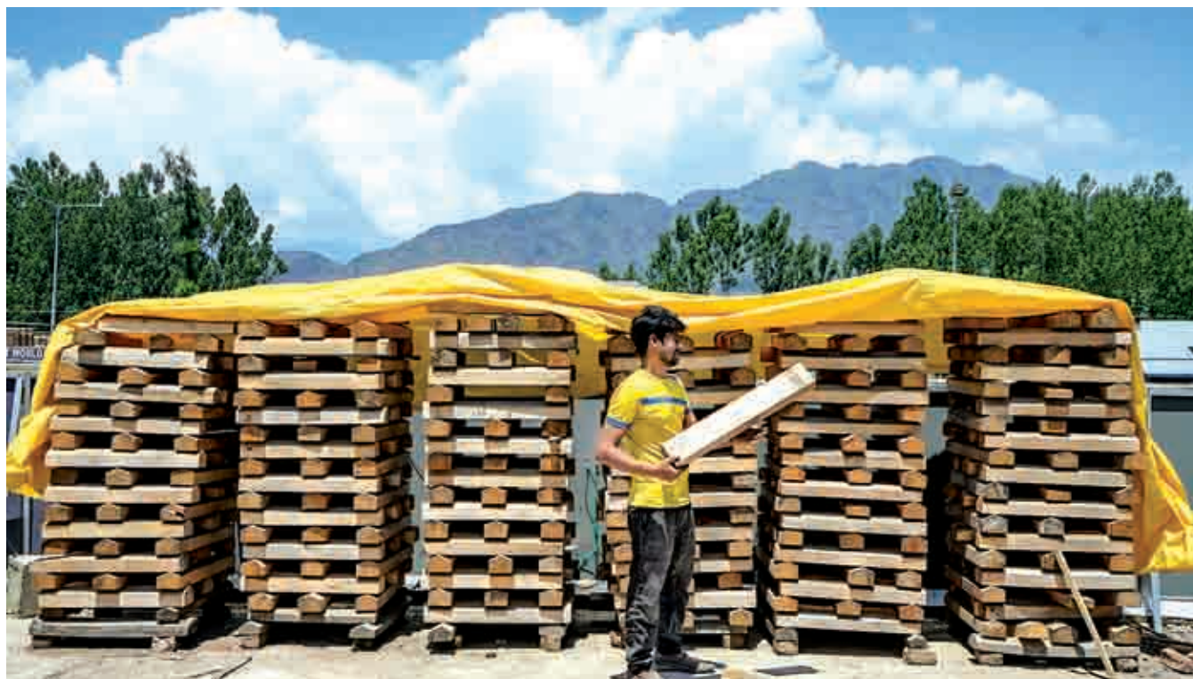
A labourer works in a GR8 cricket bat manufacturing unit, at Sangam in Ananatnag district of South Kashmir, Friday, June 16.