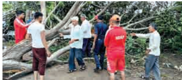
NDRF personnel clear trees uprooted following the landfall of Cyclone Biparjoy, in Gujarat.

Ahmedabad, Jun 16 (PTI): Cyclone Biparjoy has left a trail of destruction in Gujarat's Kutch and Saurashtra regions as some 1,000 villages are still without power with hundreds of electric poles getting damaged, while several coastal villages were flooded due to heavy rains and incoming seawater, officials said on Friday, a day after the storm made landfall. There was no loss of life in the state on account