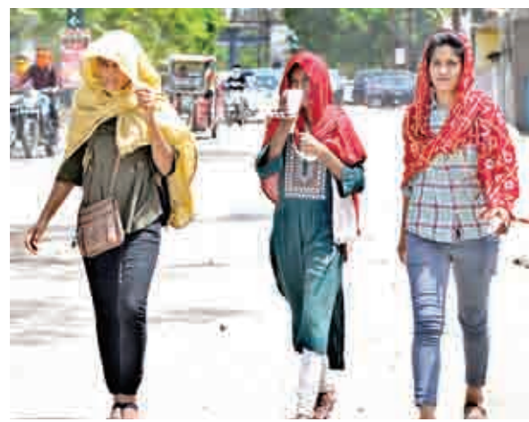
Three women wearing colorful saris walking outdoors in Raipur. The image shows three women in traditional Indian attire, including saris and shawls, walking on a paved area. They appear to be in a public space, possibly a market or a street, during the heat wave.

According to the information received from the Meteorological Department, heat wave conditions will continue in the state till June 19. There is no possibility of respite from the heat for the next three days, although conditions are favorable for the advance of monsoon. It is expected that by June 21, the monsoon will enter Chhattisgarh via Bastar and reach Raipur by June 24.