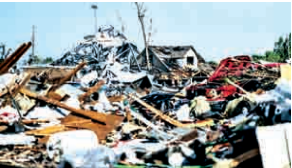
Debris covers a residential area in Perryton, Texas, after a tornado struck the town.