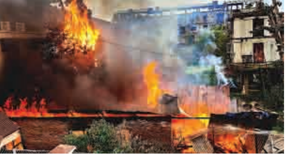
Flames and smoke billows out after an old warehouse owned by a retired bureaucrat set ablaze amid violence in Manipur, at Palace Compound in Imphal East district, Friday.

Imphal, Jun 16 (PTI): A riotous mob clashed with Manipur's Rapid Action Force in Imphal Friday evening after it had torched a warehouse. Police used tear gas shells to disperse the mob as it was believed that it would target other properties. "The riot occurred near the Imphal palace grounds," officials said. Fire personnel and security forces rushed to the site and brought the warehouse fire under control and prevented it from spreading to the neigh-