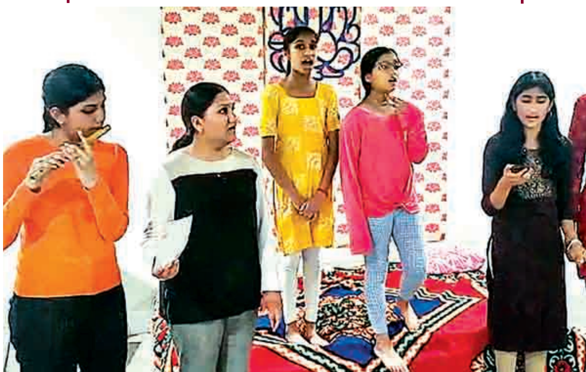
Indian-Americans practice for a cultural extravaganza organised to welcome Prime Minister Narendra Modi during his upcoming visit to the US.