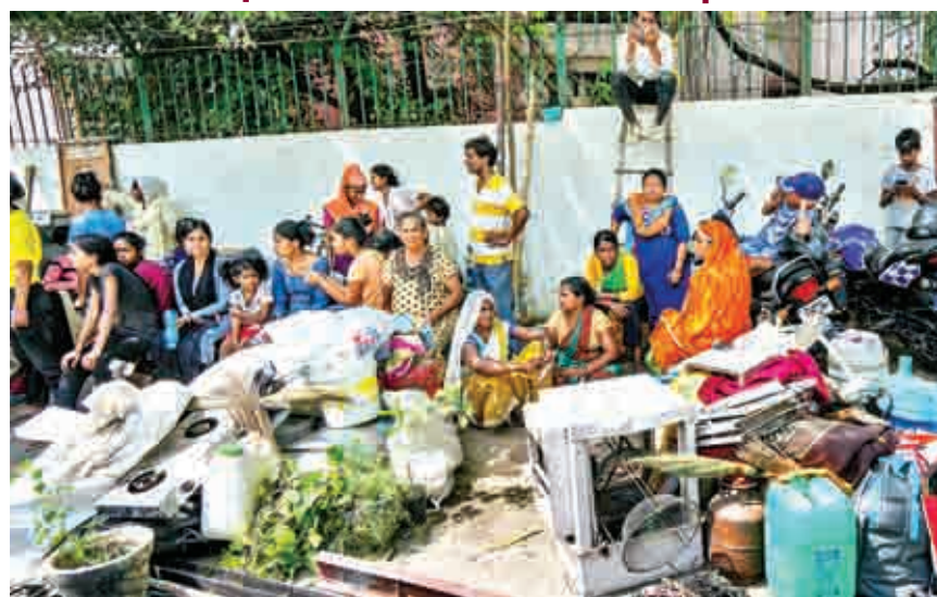
Residents with their belongings during a demolition drive at a slum cluster in Vasant Vihar, in New Delhi, Friday.