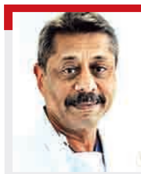
DR. NARESH TREHAN