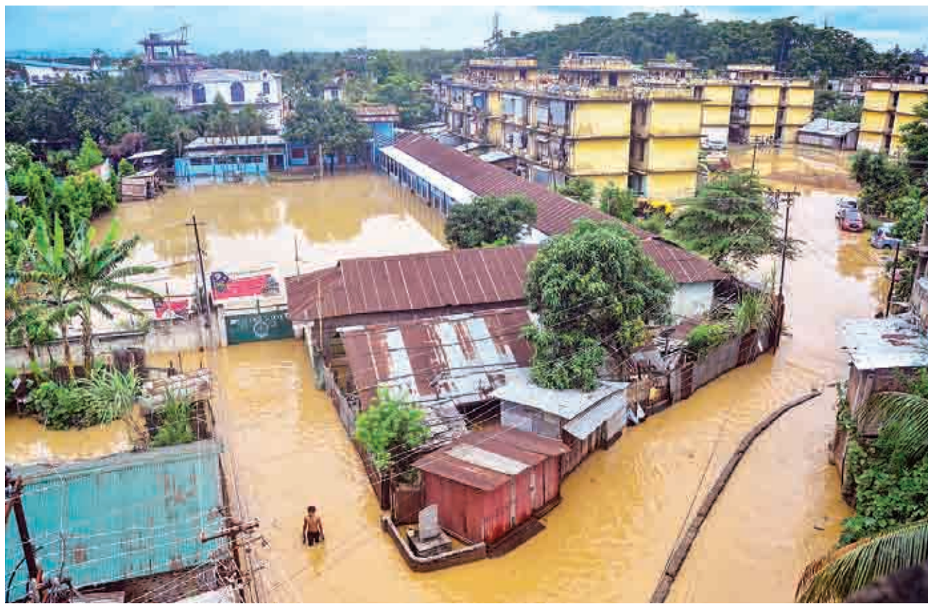
A flooded colony after a heavy rainfall in Dimapur, Nagaland, Sunday, June 11.