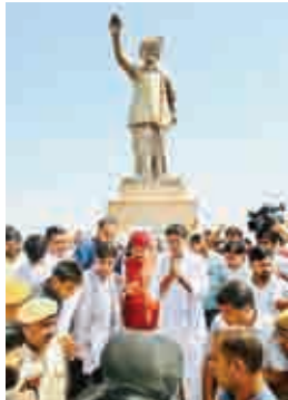
Congress leader Sachin Pilot during 'Sarva Dharma Prarthana Sabha', in Dausa, Sunday.