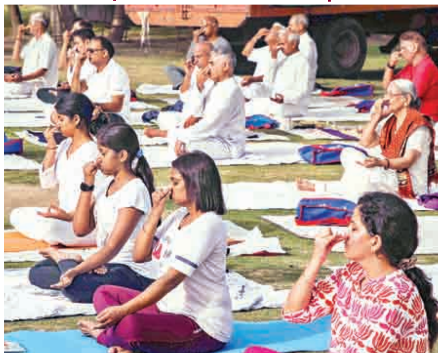
People do yoga at Triphala Park, in Noida, Sunday.