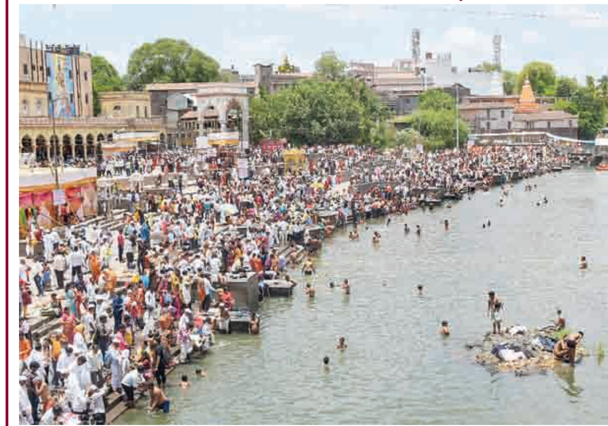
Devotees gather at Indrayani river ghat as annual pilgrimage of warkaris to Pandharpur with palanquin of saint Dnyaneshwar, at Alandi Devachi near Pune, Sunday.

said her personal number is listed at mortuaries, hospitals and police stations, and authorities contact her directly. "In case of an unclaimed body, it is kept for 72 hours after postmortem, and then