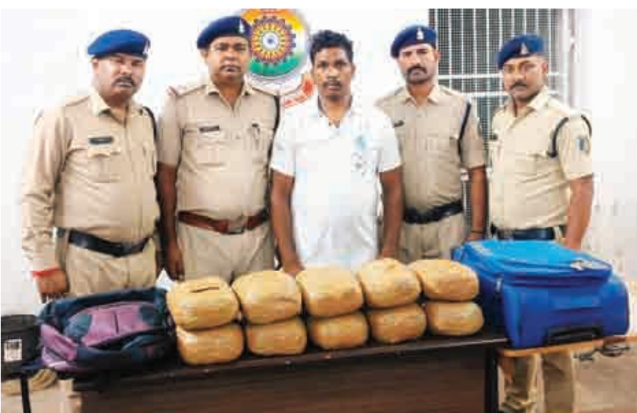
Central Chronicle News

Bhilai, June 11: A resident of Uttar Pradesh has been arrested with a large quantity of cannabis in Vaishali Nagar area of Bhilai. He was smuggling about 10.15 kgs of cannabis on a scooter. The accused has been booked under the provisions mentioned in NDPS Act.