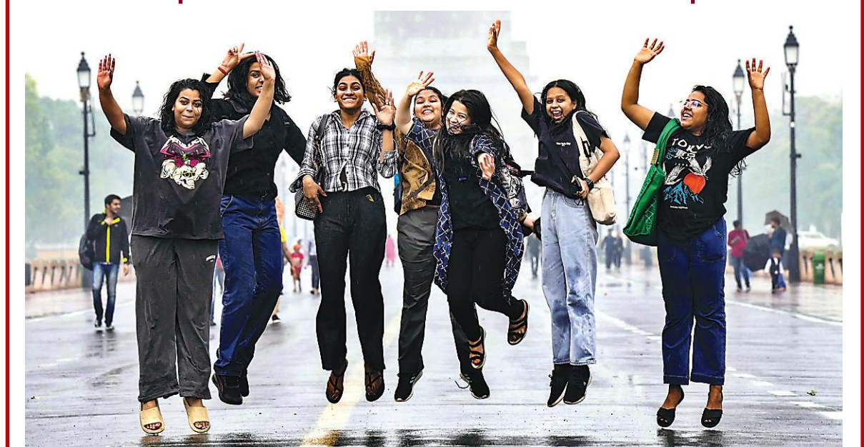
Youngsters visit Kartavya Path amidst rain, in New Delhi, Monday.