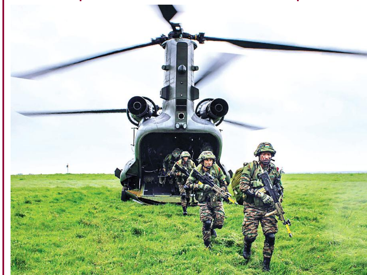
Indian Army personnel during the 7th edition of Indo-UK joint military exercise 'Ajeya Warrior-23', at Salisbury Plains, UK.