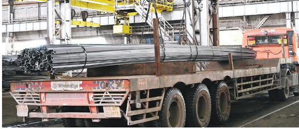
Central Chronicle News

Bhilai, May 01: SAIL-Bhilai Steel Plant's Merchant Mill that rolls out light structurals including TMT Bars, Angles and Channels for various applications has created new day records in production of Angle 75 for two days in a row. The Plant has orders for 15,000 Tonnes of this Angle 75 profile, including orders for about 11,000 Tonnes for direct despatch to customers. On April 27, 2023, Merchant Mill set a new day record by producing 1958 Tonnes