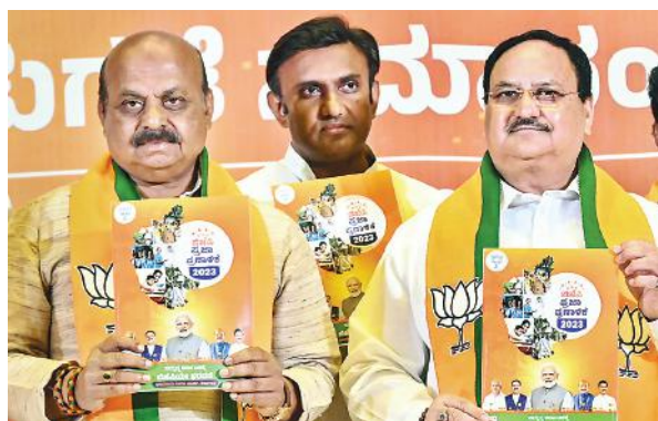
BJP National President JP Nadda with Karnataka Chief Minister Basavaraj Bommai releases the party's manifesto for the upcoming Karnataka Assembly elections, in Bengaluru, Monday.

"The Constitution of India allows us to move in the direction of Uniform Civil Code. 'Justice to all; appeasement to none' is