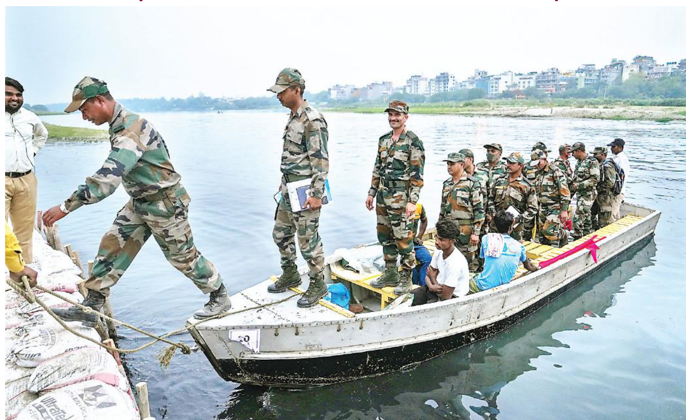
Territorial Army personnel on a boat in the Yamuna river after finishing their duty, in New Delhi. The Army personnel have been tasked to ensure that waste is not thrown into the Yamuna river.