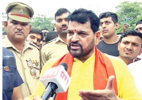
Brij Bhushan Sharan Singh

"All wrestling activity has come to a standstill in the last four months. I say hang me, but don't stop wrestling activity; don't play with the future of children. Allow the cadet nationals to take place, whosoever organises it... be