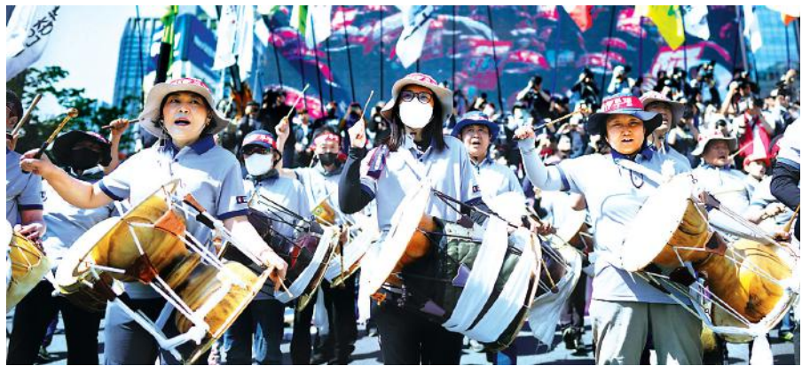
Members of the Korean Confederation of Trade Unions shout slogans during a rally on May Day in Seoul, South Korea, Monday, May 1. A large number of workers and activists in Asian countries are set to mark May Day on Monday with protests calling for higher salaries and better working conditions, among other demands.

In France, unions plan massive demonstrations to protest President