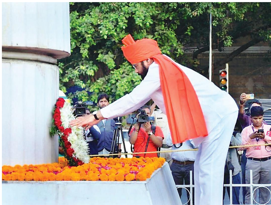
Maharashtra CM Eknath Shinde lays a wreath at Hutatma Chowk to pay tribute to those who sacrificed their lives for the 'Samyukta Maharashtra Movement' on the occasion of 63rd Maharashtra Foundation Day, in Mumbai, Monday.