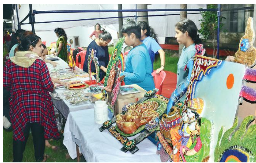
Children learning different art forms in the summer camp organised by one of the institution here on Monday.