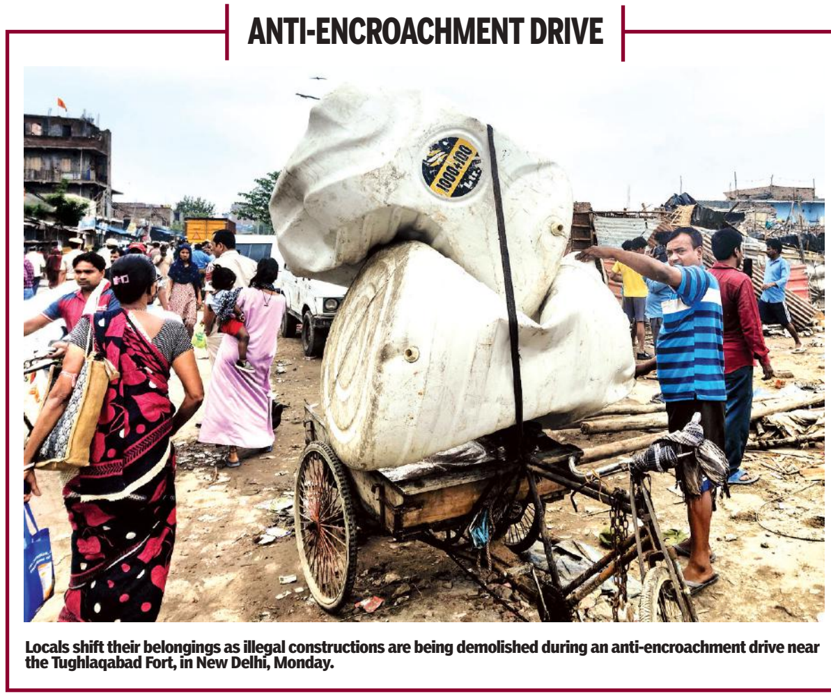
Locals shift their belongings as illegal constructions are being demolished during an anti-encroachment drive near the Tughlaqabad Fort, in New Delhi, Monday.

Several other commuters also shared updates on the traffic situation on Twitter. "Traffic choked under flyover to-