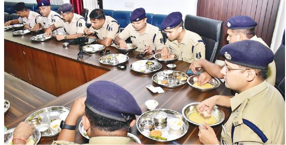
Central Chronicle News

Bhilai, May 01: Responding to the CM's appeal, the Bore Basi Mahotsava was celebrated by the Bhilai Municipal Corporation fraternity on International Workers' Day in honour of the workers and labourers. Events were organised at different places and the main event in Bhilai was organised at Andhra Bhavan, Sector 5.