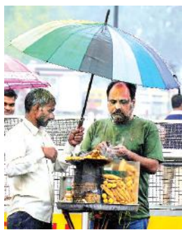
A roadside vendor uses an umbrella to shield himself from rain, in New Delhi, Monday.