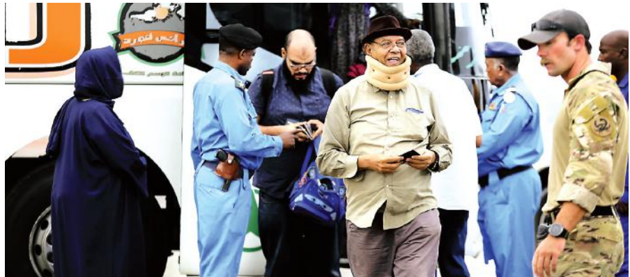
American nationals arrive to be evacuated by U.S. Navy in Port Sudan. Sudan's army and its rival paramilitary say they will extend a humanitarian cease-fire another 72 hours as of midnight. The decision follows international pressure to allow the safe passage of civilians and aid but also comes after days of continued fighting despite the earlier truce.

The talks would initially focus on establishing a "stable and reliable" cease-fire monitored by "national and international" observers, Volker Perthes said. A string of temporary truces over the past week has de-escalated fighting only in some areas, while in others, fierce battles have contin-