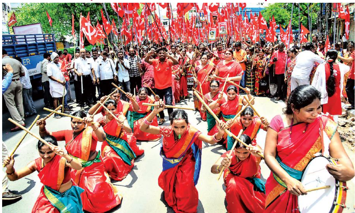
CITU activists participate in a march on the occasion of International Workers' Day, in Hyderabad, Monday.