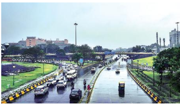
Vehicles ply on a road as clouds hover in the sky during rain, in New Delhi, Monday.

"Traffic is heavy on Aurobindo Marg in the carriageway from IIT towards Adhchini due to waterlogging near Adhchini. Kindly avoid the stretch," the Delhi Traffic Police said in a