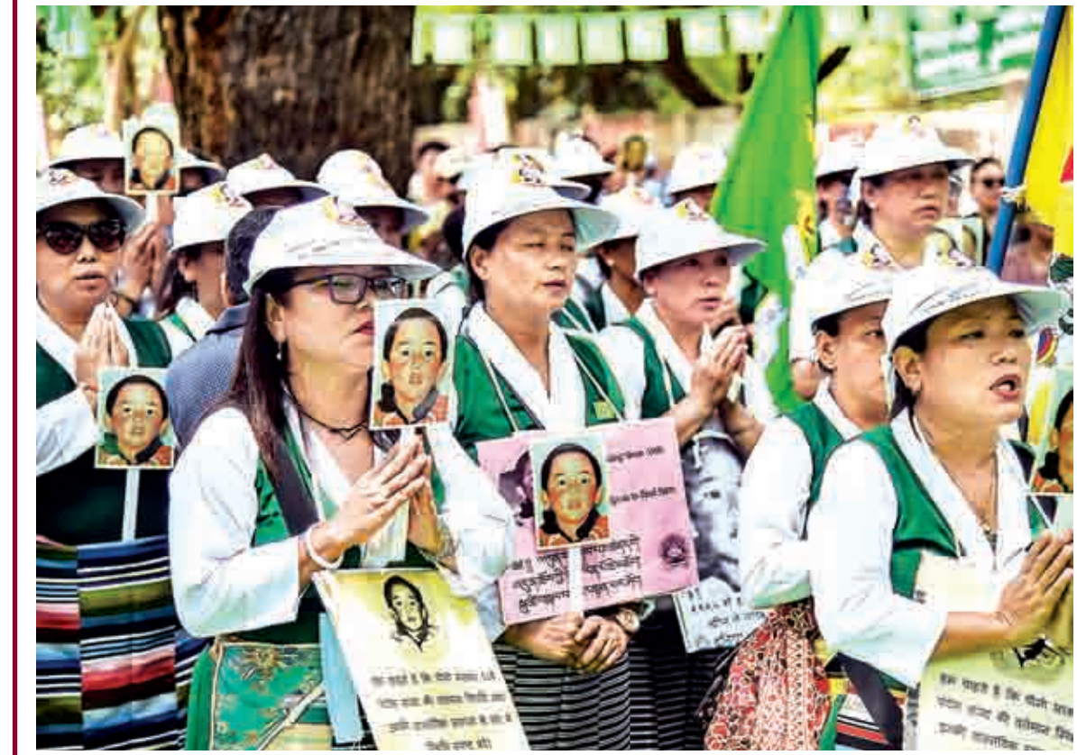
Tibetan Women's Association members stage a protest against Chinese government, at Jantar Mantar in New Delhi, Wednesday.