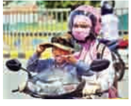
A woman covering her face to protect herself from heat rides her scooter on a hot summer day, in Prayagraj, Wednesday.