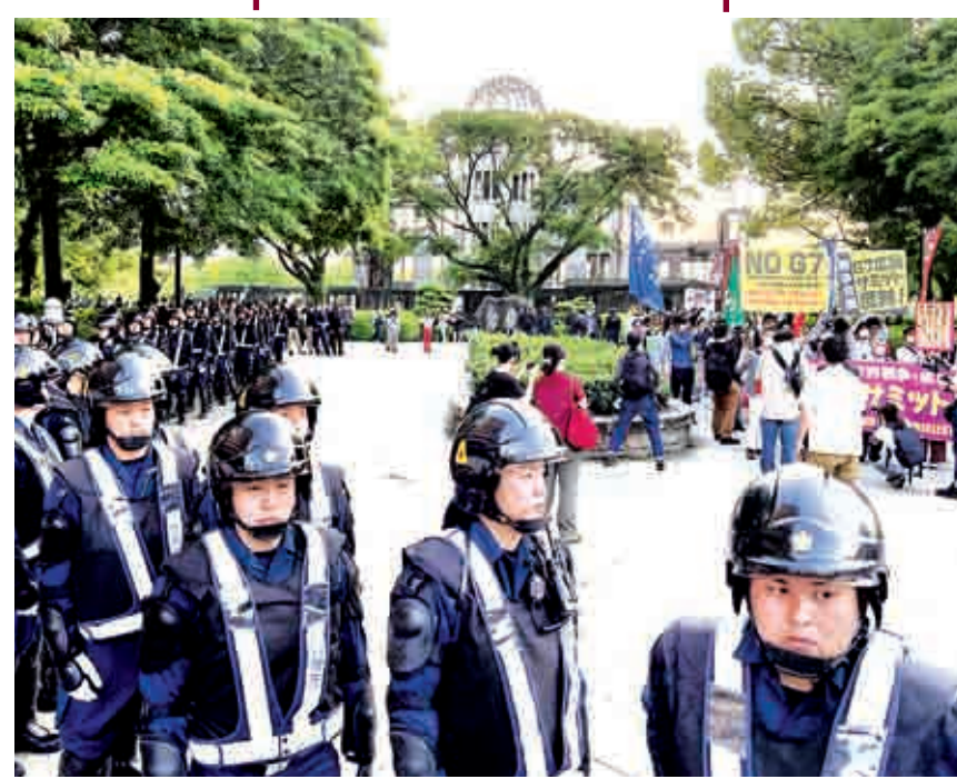
Police outnumber protesters at a rally against the G-7 being held next to the Atomic Bomb Dome war memorial, ahead of the group's meeting in Hiroshima, western Japan, on Wednesday.