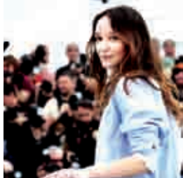
Jury president Anaïs Demoustier poses for photographers at the photo call for the Camera d'or jury at the 76th international film festival, Cannes, southern France, Wednesday.