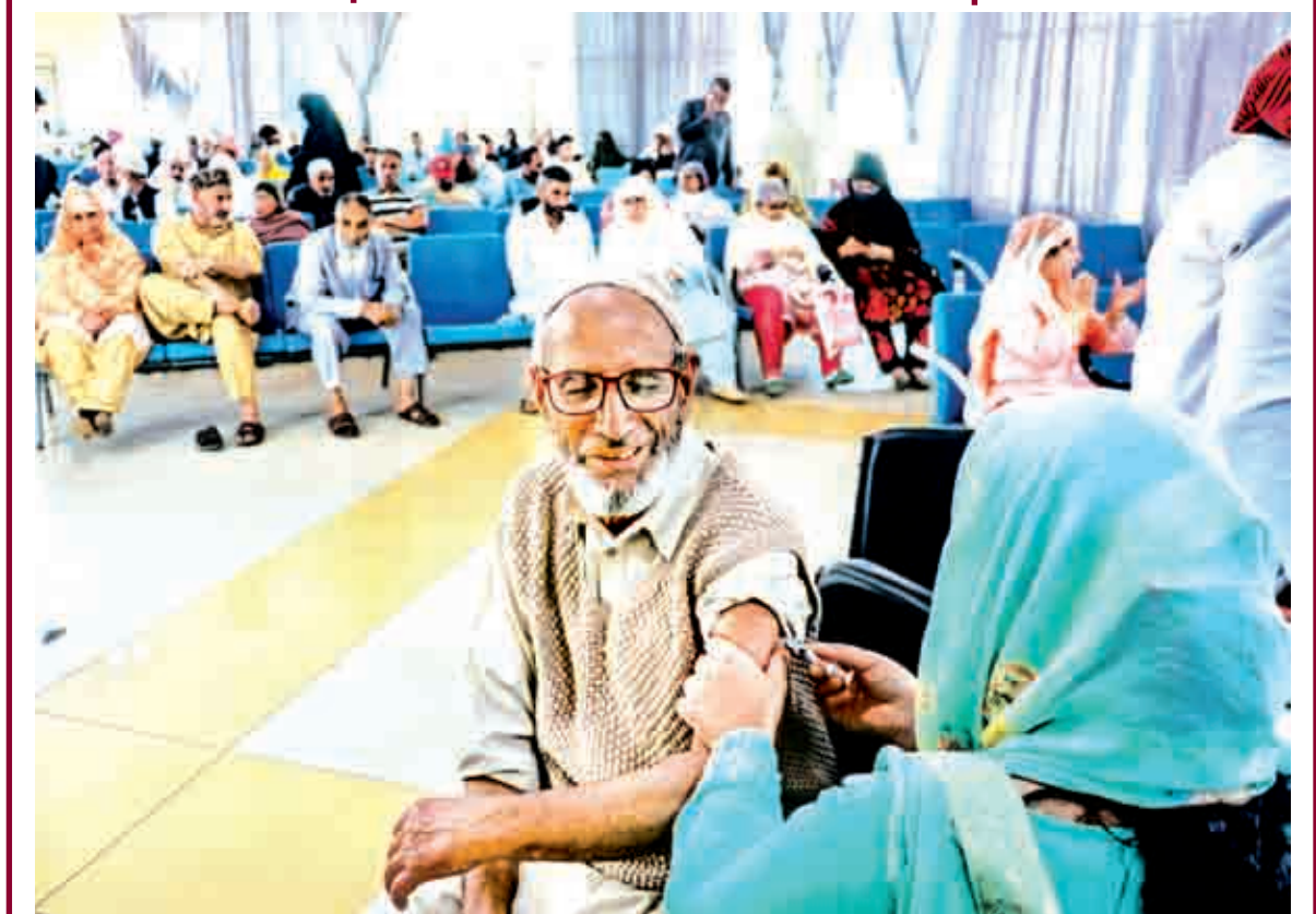
A healthcare worker administers a vaccine to a pilgrim during a special vaccination drive for Hajj-2023 pilgrims, in Srinagar, Wednesday.