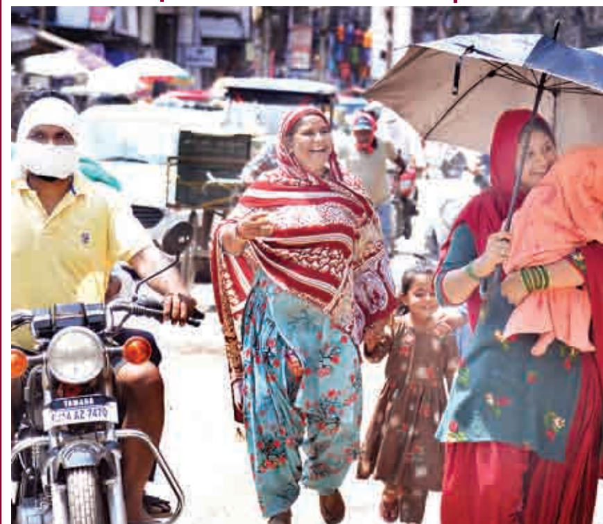
With mercury soaring high each day and dust emitting from road is making people feel uncomfortable and are forced to use masks covering nose and head area to remain safe.