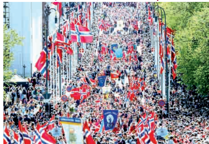
A view of the parade on Karl Johans gate on the occasion of Norway's Constitution Day, near Oslo, Wednesday.