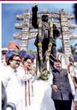
BJP National President JP Nadda with Maharashtra Deputy CM Devendra Fadnis and others after garlanding a statue of BR Ambedkar, at Ghatkopar in Mumbai, Wednesday.