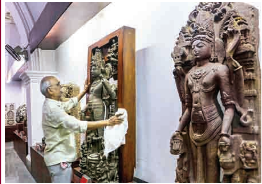
A worker cleans sculptures at the Central Museum Nagpur on the eve of International Museum Day, in Nagpur, Wednesday.