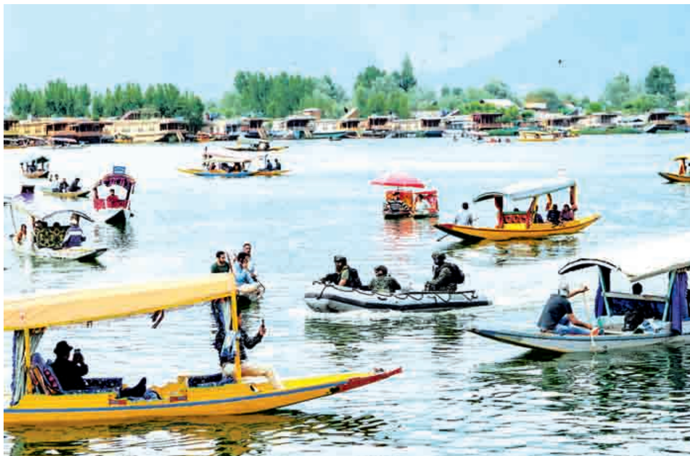
Marine Commandos (MARCOS), the Special Forces unit of the Indian Navy, patrol the Dal Lake, in Srinagar, Wednesday,