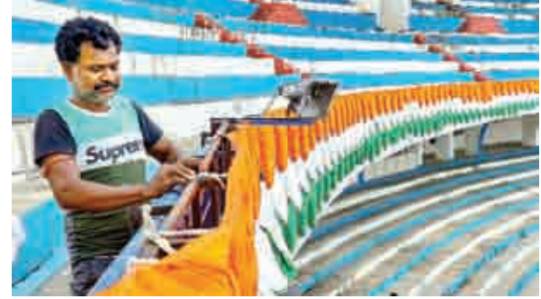
Preparations for the oath-taking ceremony of Karnataka Chief Minister being stopped and arrangements being removed at Sree Kanteerava Stadium, in Bengaluru, Wednesday.

AICC in-charge of state Randeep Surjewala also asserted that Karnataka will have a five-year-long stable government and urged people not to believe in speculation and "fake news" which it alleged was being peddled by the BJP. Siddaramaiah is considered the front-runner among the two while