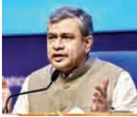
Union Minister Ashwini Vaishnaw briefs the media on cabinet decisions, in New Delhi, Wednesday.

hardware covers laptops, tablets, all-in-one PCs, servers and ultra-small form factor devices. The minister said the scheme is expected to lead to incremental production of Rs 3.35 lakh crore, incremental investment of Rs 2,430 crore and create incremental direct employment for 75,000 people during the scheme period.