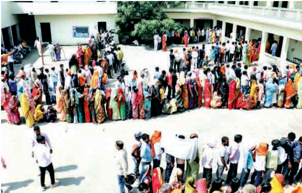
Voters wait in a queue at a polling station to cast their votes for the UP Municipal elections, in Gorakhpur, Thursday.