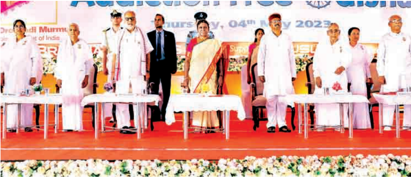
President Droupadi Murmu at the launch of 'Addiction Free Odisha' campaign of Brahma Kumaris Centre at Hatbadra, in Mayurbhanj, Thursday.