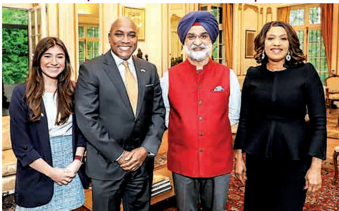
India's Ambassador to the US Taranjit Singh Sandhu with delegates during the launch of Confederation of Indian Industry's (CII) latest edition of 'Indian Roots, American Soil' report, in Washington, USA.