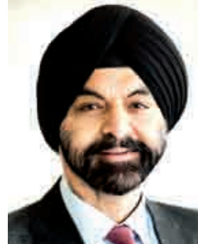
Incoming World Bank President Ajay Banga. Banga, 63, will take over as president on June 2, 2023.