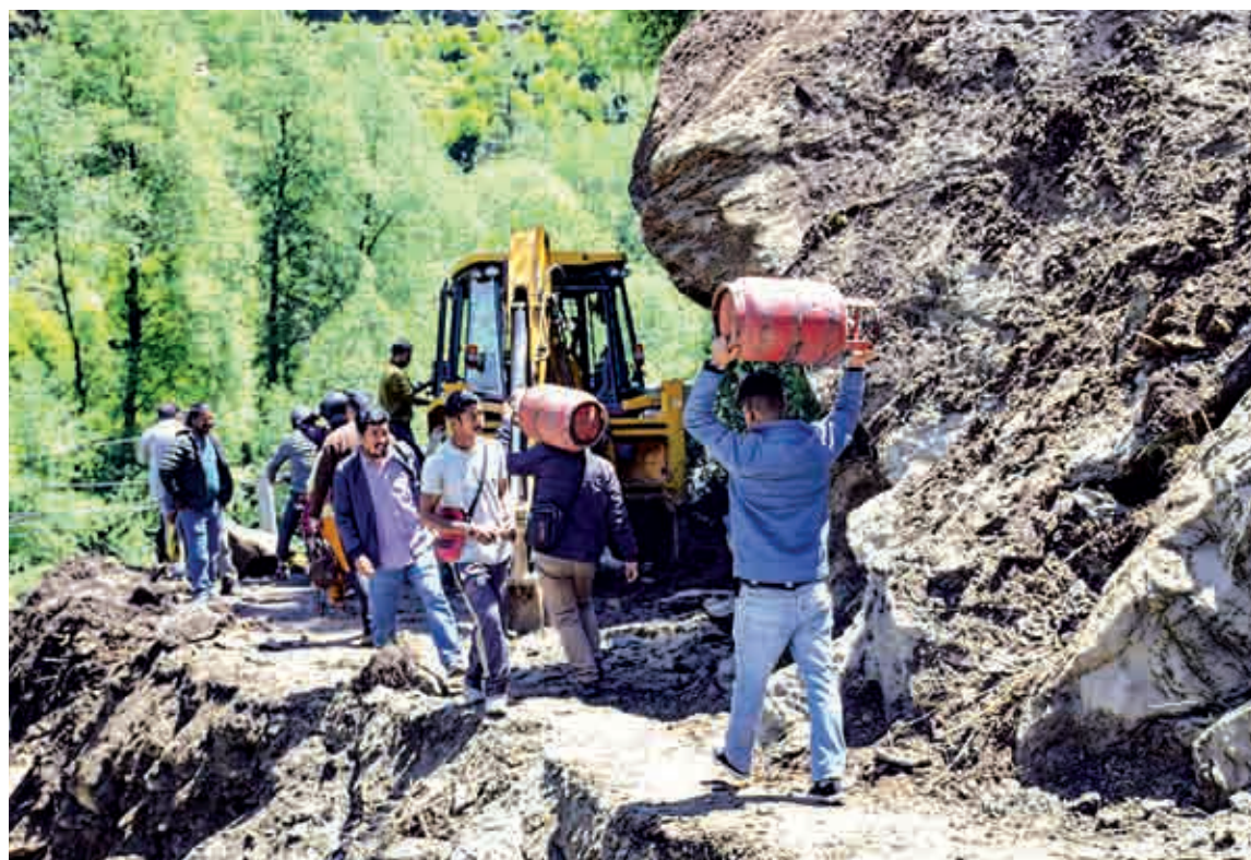
Villagers carrying LPG cylinders walk towards their home as a road connecting 12 panchayats was closed following landslide due to rains, in Lagghati, in Kullu district, Thursday.