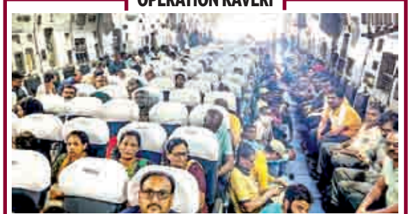
A special flight carrying 23rd batch of evacuees departs from Port Sudan. The IAF C17 aircraft with 192 passengers, including nationals from Nepal is en route to Ahmedabad.