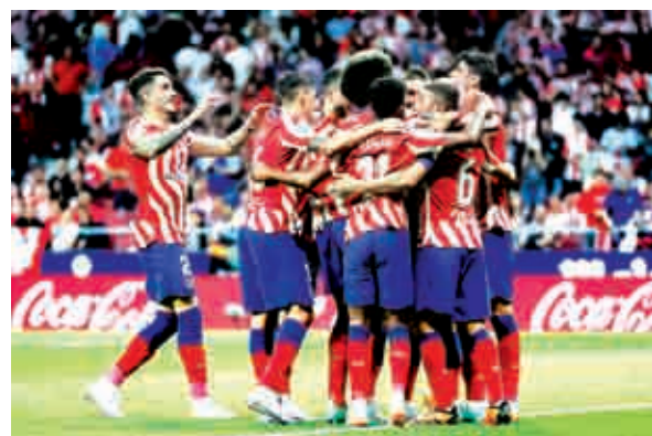
Atletico Madrid's players celebrate their fourth goal scored by Belgian midfielder Yannick Ferreira-Carrasco.

It is the first time this season Atletico moved into second spot in the