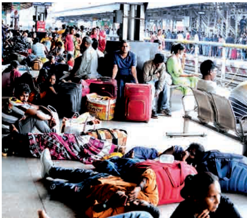
With short-termination and diversion of few trains at Raipur Railway station and many running late, the passengers are left with no option, but to wait.