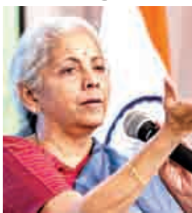
Finance Minister Nirmala Sitharaman addresses the Indian diaspora in Seoul.

During the meeting, Sitharaman also highlighted India's enabling policy framework for e-