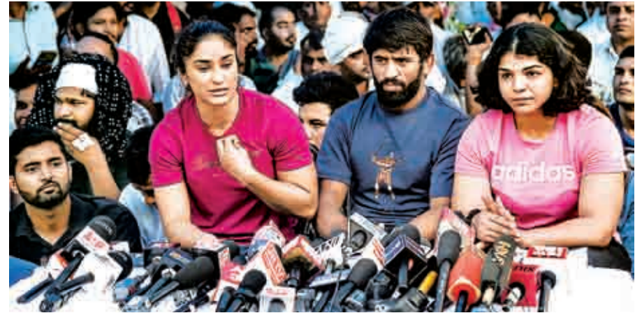
Wrestlers Sakshi Malik, Vinesh Phogat and Bajrang Punia speak with the media during their protest at Jantar Mantar, in New Delhi, Thursday, May 4.

"If this is how the wrestlers will be treated, what will we do with the medals? Rather we will live an ordinary life and return all the medals and awards to the Indian government," Bajrang, an Olympic bronze medalist, told reporters on Thursday morning. Vinesh, Sakshi and Bajrang are all winners of Khel Ratna, country's highest sporting