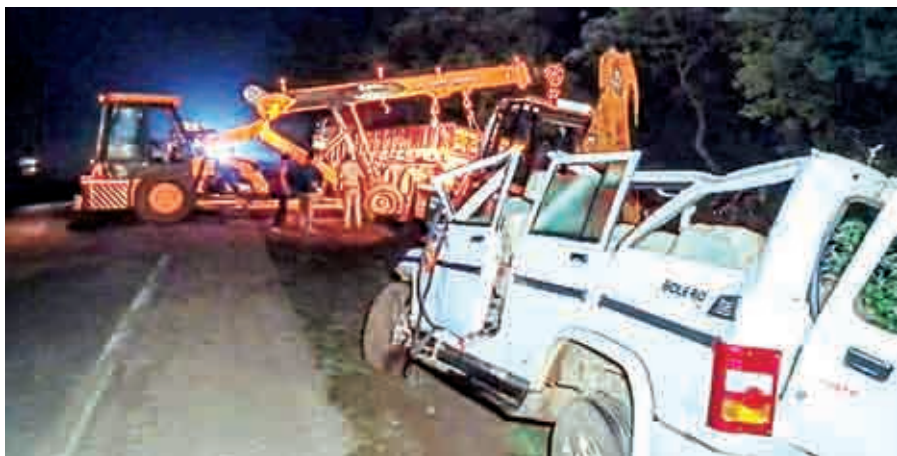
Wreckage of a vehicle after a collision between a truck and a sports utility vehicle (SUV), in Balod district, early Thursday.

Chief Minister Bhupesh Baghel expressed grief over the tragedy and announced an ex-gratia of Rs 4 lakh to the kin of each deceased. The victims, natives of Soram-Bhatgaon village in Dhamtari district, were on their way to a wedding ceremony, police said. "The victims were going to attend a wedding in Markatola village of Kanker district when