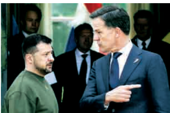
Ukraine's President Volodymyr Zelenskyy, left, meets Dutch Prime Minister Mark Rutte in the Hague, Netherlands, Thursday, May 4.