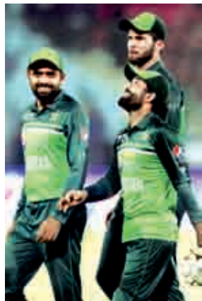
Pakistan's captain Babar Azam (L) and teammates celebrate after winning the third one-day international.

"We knew these wickets would not be the same as Rawalpindi wickets, so it was important to give respect," Imam said after being named player of the