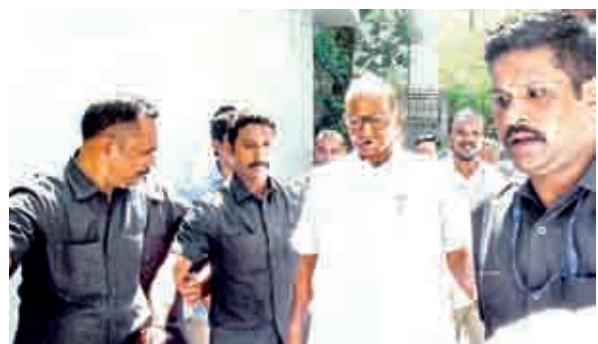
NCP leader Sharad Pawar arrives to interact with party workers and supporters during their 'dharna' urging Pawar to withdraw his resignation from the post of party president, at YB Chavan Centre in Mumbai, Thursday.

Speaking outside the Y B Chavan Centre in the city, where his supporters have been camping to demand his continuation as the party chief, Pawar said he would take a final decision in the next couple of