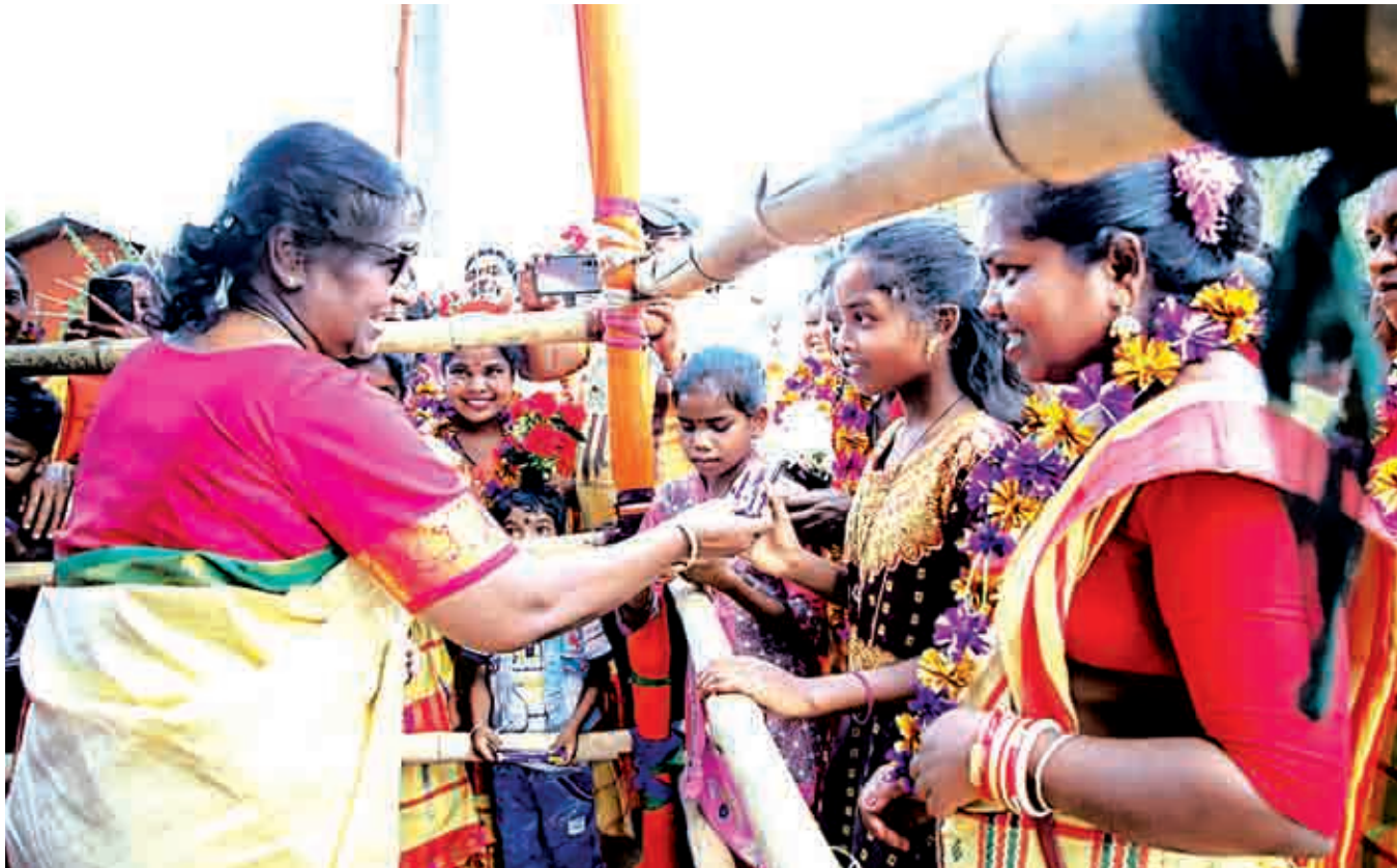
President Droupadi Murmu being welcomed upon her arrival at her hometown, at Rairangpur in Mayurbhanj district, Odisha, Thursday, May 4.