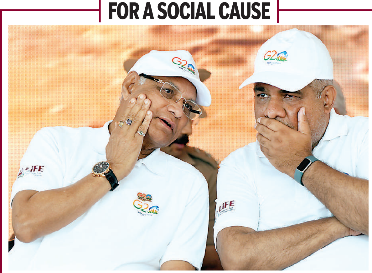
Union Minister of Environment Forest & Climate Change Bhupendra Yadav along with Maharashtra Governor Ramesh Bais during the G20 beach cleanup drive at Juhu beach, in Mumbai, Sunday.