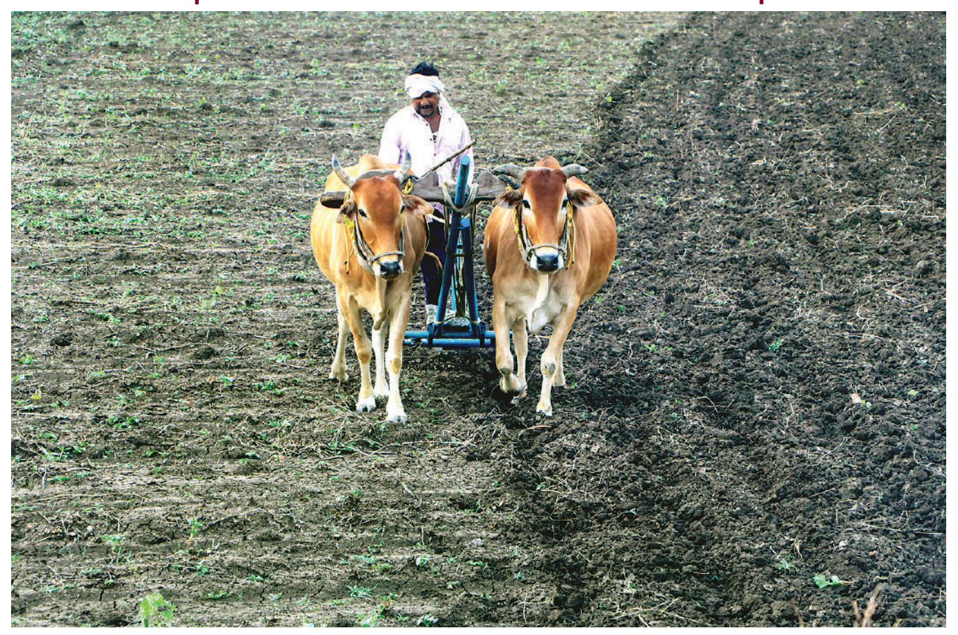
A farmer ploughs his field for cotton plantation at Hingna near Nagpur, Sunday.