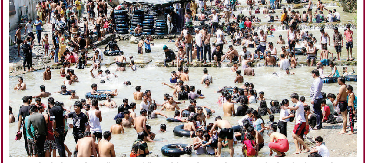
Tourists bathe at Sahastradhara waterfall to cool themselves on a hot summer day, in Dehradun, Sunday.

Jaipur: Three members of a family were killed and as many injured when a speeding car hit them while they were standing on the roadside here on Sunday morning, police said. They had returned from Haridwar after performing the last rites of a family member and were waiting to be picked up by a relative near Doi Ki Dhani in Chaksu tehsil here, they said. "Three peo ple, including a woman and her son, were killed in the accident.