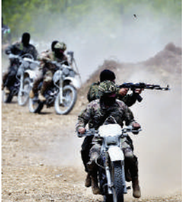
Fighters from Lebanese militant group Hezbollah carry out a training exercise Aaramta village in the Jezzine District, southern Lebanon.