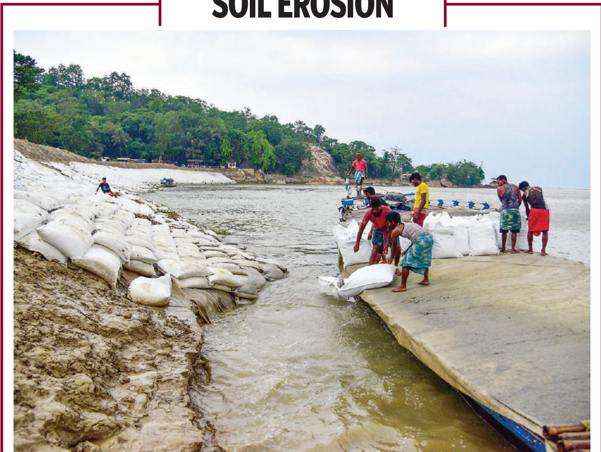
Repair work is underway after heavy soil erosion by the River Brahmaputra, at Mayong village in Morigaon district of Assam, Sunday.

The CBI alleged that the NCB's Mumbai zone received information in October 2021 regarding the consumption and possession of narcotic substances by various individuals on the cruise ship, and some NCB officers conspired to get bribes from the accused in return for letting them off.