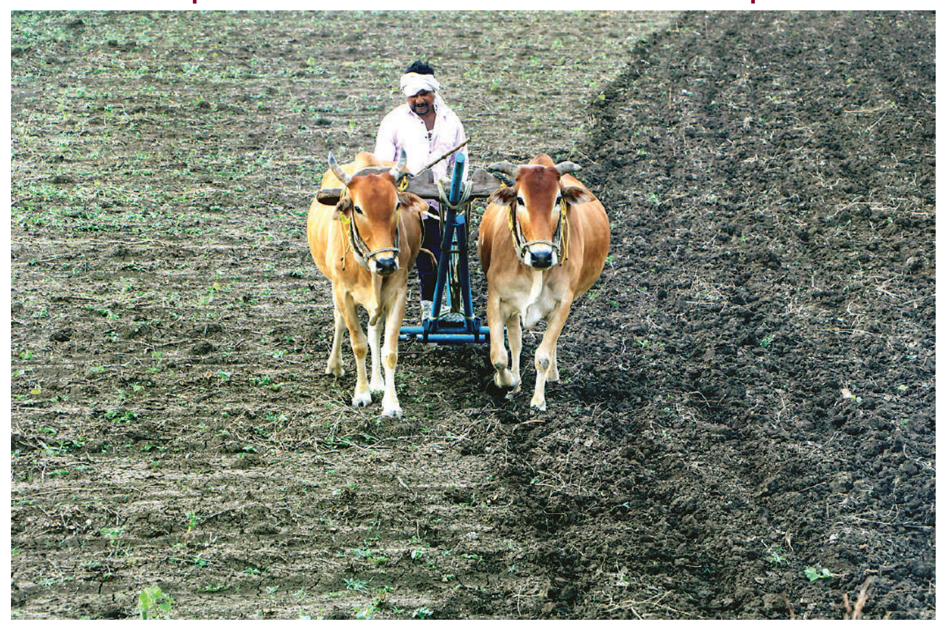
A farmer ploughs his field for cotton plantation at Hingna near Nagpur, Sunday.