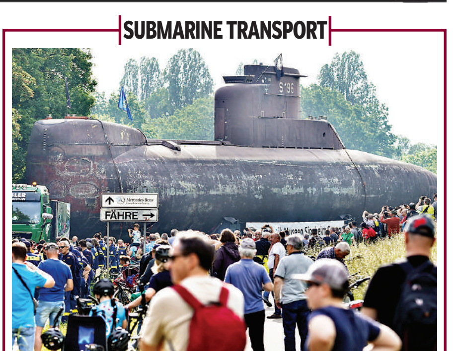
A view of the 48-meter-long U17 submarine being transported by road via a truck to the Speyer Museum of Technology, in Speyer, Germany, Sunday.

On both the opening and closing days of a gathering that included four nucleararmed nations G7 members France, the UK, the United States, and visiting participant India Kishida brought leaders to pay their respects at memorials to the 140,000 people killed by the bomb. They planted a symbolic cherry tree, spoke with a survivor and offered a silent prayer.