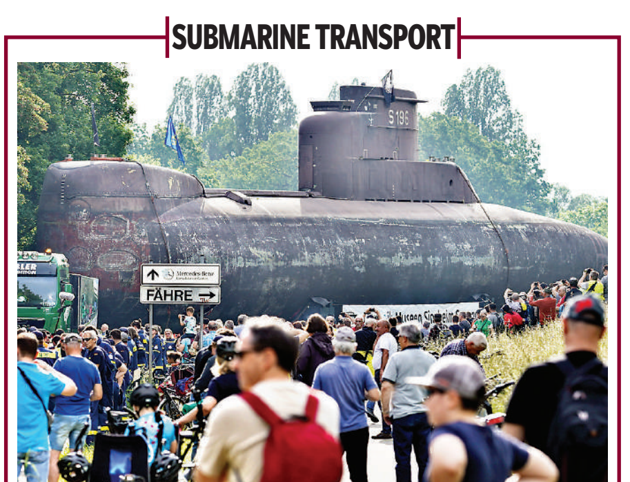
A view of the 48-meter-long U17 submarine being transported by road via a truck to the Speyer Museum of Technology, in Speyer, Germany, Sunday.

On both the opening and closing days of a gathering that included four nucleararmed nations G7 members France, the UK, the United States, and visiting participant India Kishida brought leaders to pay their respects at memorials to the 140,000 people killed by the bomb. They planted a symbolic cherry tree, spoke with a survivor and offered a silent praver.