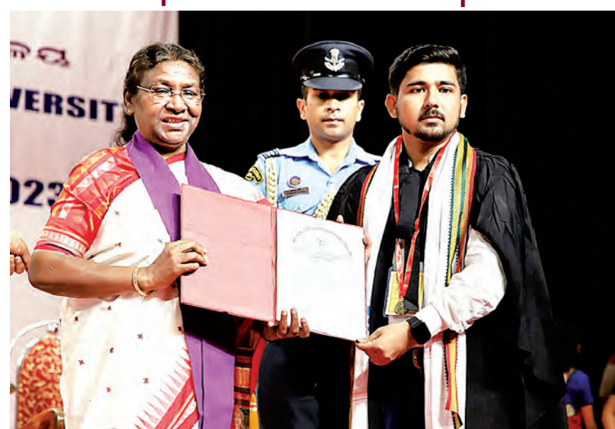
President Droupadi Murmu presents degree to a student during the 12th convocation of Maharaja Sriram Chandra Bhanja Deo University, at Baripada in Mayurbhanj district, Saturday.