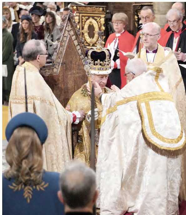
King Charles III sits as he is crowned with St Edward's Crown by The Archbishop of Canterbury the Most Reverend Justin Welby during the coronation ceremony at Westminster Abbey, London, Saturday, May 6.

which are used during the enthroneing were made for the Coronation of King George VI and Queen Elizabeth II in May 1937, another rainy day in Britain.