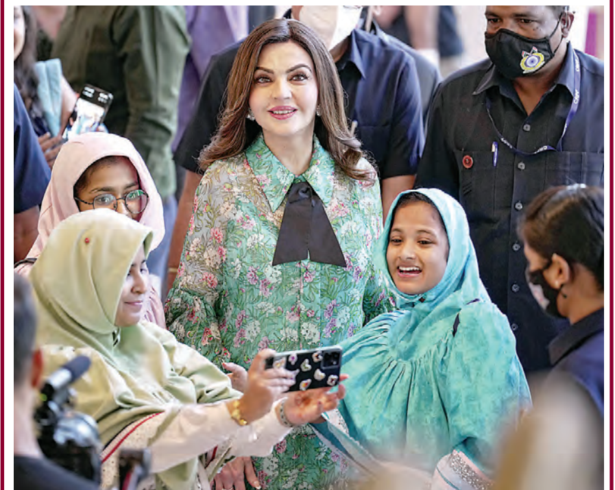
Chairperson and founder of the Reliance Foundation Nita Mukesh Ambani during the inaugural show of "The Sound of Music" at Nita Mukesh Ambani Cultural Centre in Mumbai