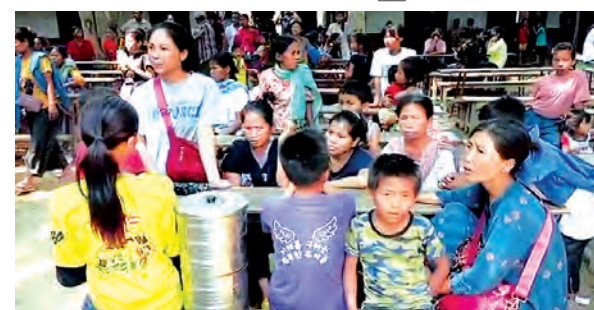
People of violence-hit area of Manipur at a relief camp setup by Assam Government in Cachar district of Assam, Saturday.

However, unofficially sources placed the death toll at over a hundred and the number of injured at nearly 200. Central minister Kiren Rijiju added his voice to the appeals for calm in the northeastern state as well as a dialogue between ethnic communities. "Many lives have been lost and there is damage to