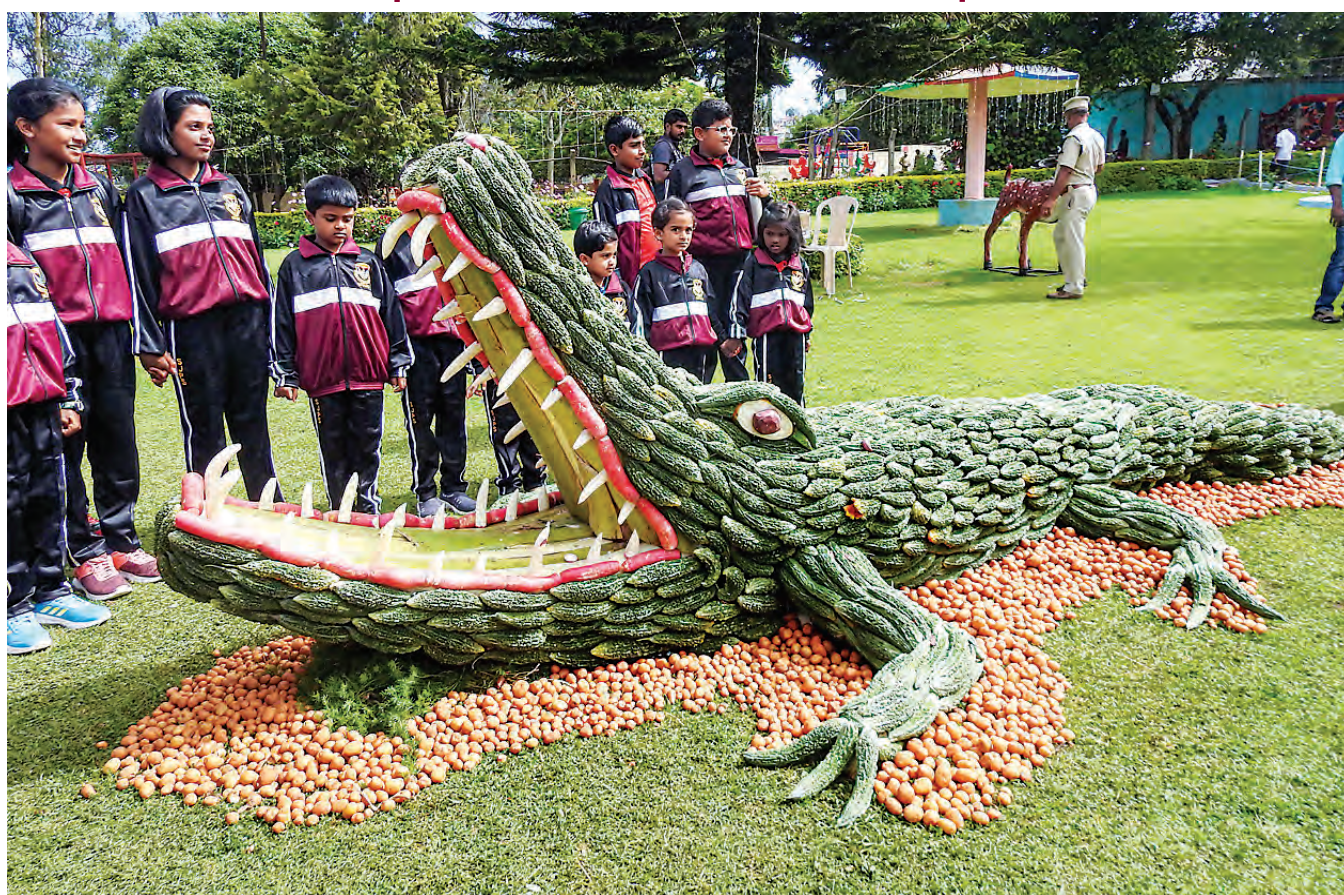
Children look at a display at the 12th Vegetable Show during the annual summer festival at Nehru Park in Kotagiri, in Nilgiris district, Saturday, May 6.