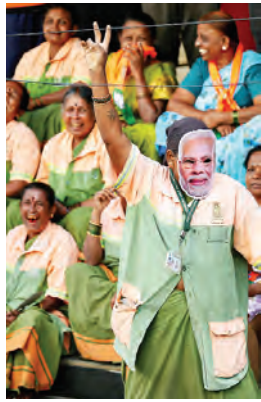
BBMP workers during a road show of PM Narendra Modi ahead of Karnataka Assembly elections, in Bengaluru, Saturday.