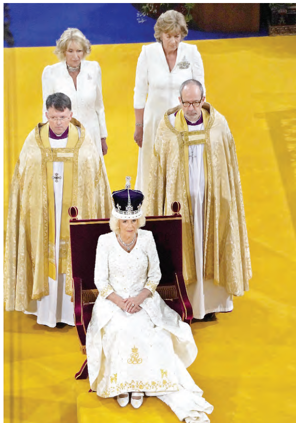
Queen Camilla receives Queen Mary's Crown during her coronation ceremony at Westminster Abbey, in London, Saturday May 6.

Once at the Abbey, the King was greeted by a congregation of around 2,200 made up of heads of state and government, worldwide royalty as well as