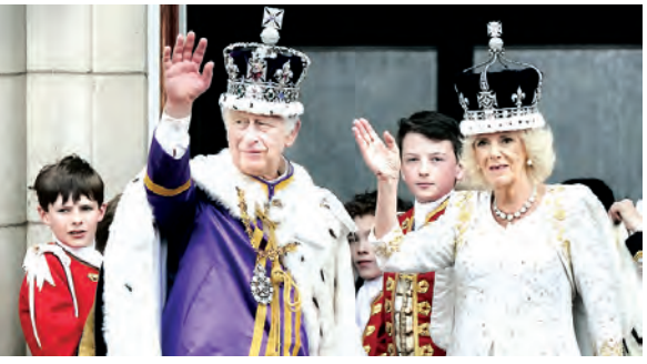
Britain's King Charles III and Queen Camilla wave to the crowds from the balcony of Buckingham Palace after the coronation ceremony in London, Saturday.

The king entered through the great west door of the abbey. He wore a long dark red robe as he slowly proceeded through the church behind his wife, Camilla. He was greeted by a congregation of around