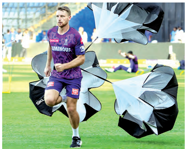
Rajasthan Royals player Jos Buttler during a practice session.

RR have always looked like a dominating side