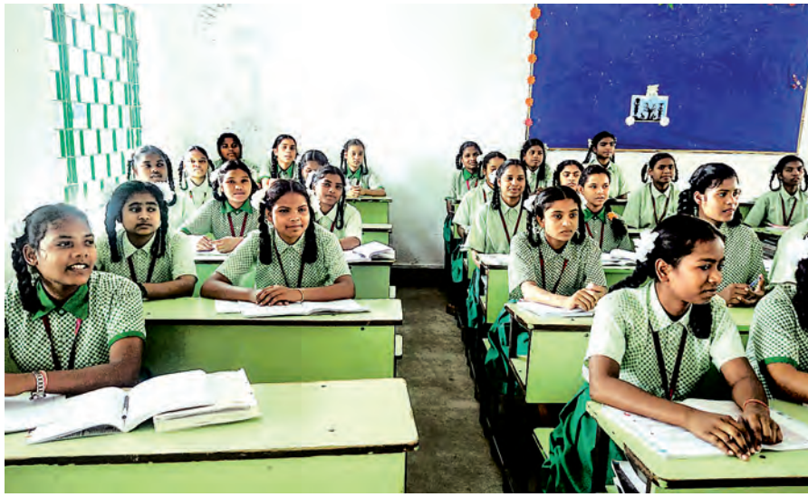
Students attend a class at a Kasturba Gandhi Balika Vidyalaya (KGBV), in Khunti district of Jharkhand.

This orphan tribal girl who once did not know how to speak Hindi has cracked one of the toughest examinations - JEE Mains. She dreams big and aspires for changes in lives of children like her afflicted with acute poverty. "I lost my parents when I was nine. I was admitted to an orphanage and from there I landed in Kasturba Gandhi Balika Vidyalaya (KGBV), Kalamati Khunti in 2015. I came to know of a programme 'Sapno Ki Udaan' which gave wings to my dreams. I studied day and night but could not succeed last year. This