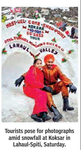
Tourists pose for photographs amid snowfall at Koksar in Lahaul-Spiti, Saturday.