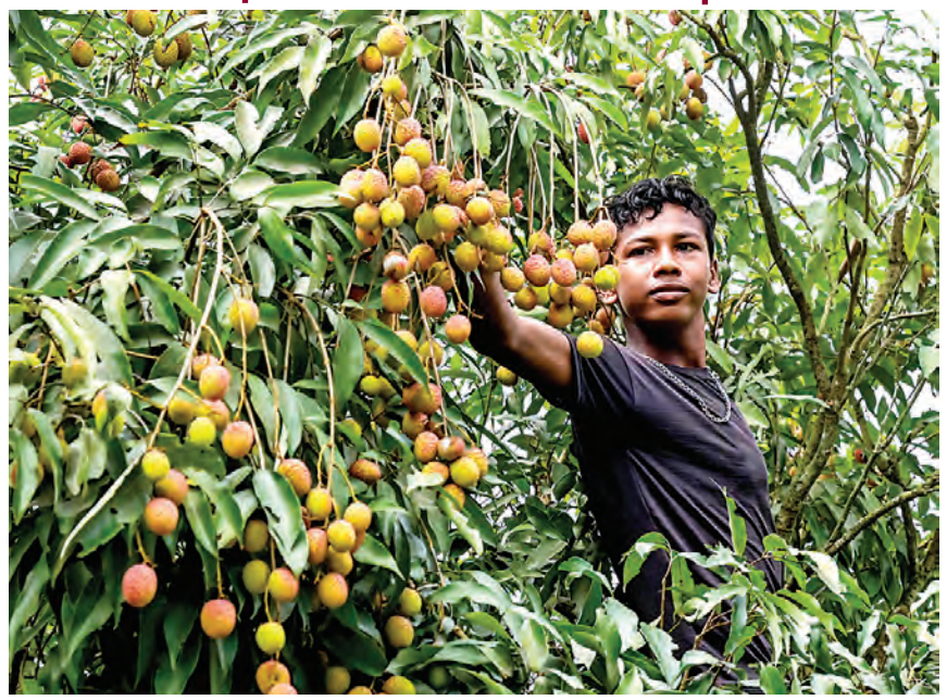
A man plucks litchis from a tree at an orchard in Nadia, Saturday.