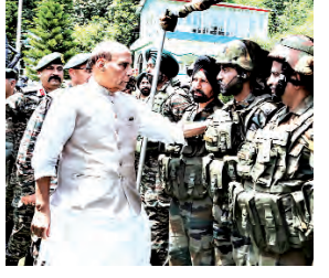
Jammu, May 06

Defence Minister Rajnath Singh on Saturday reviewed the security situation along the borders in Jammu and Kashmir as he visited the district of Rajouri, a day after five elite para commandos of the army were killed during an anti-terrorist operation in the forested Kandi area of the district. Singh condoled the deaths of