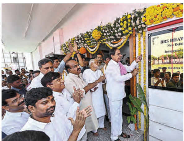
BRS Chief and Telangana Chief Minister K Chandrashekar Rao at the inauguration of the party office BRS Bhawan in Vasant Vihar, in New Delhi.