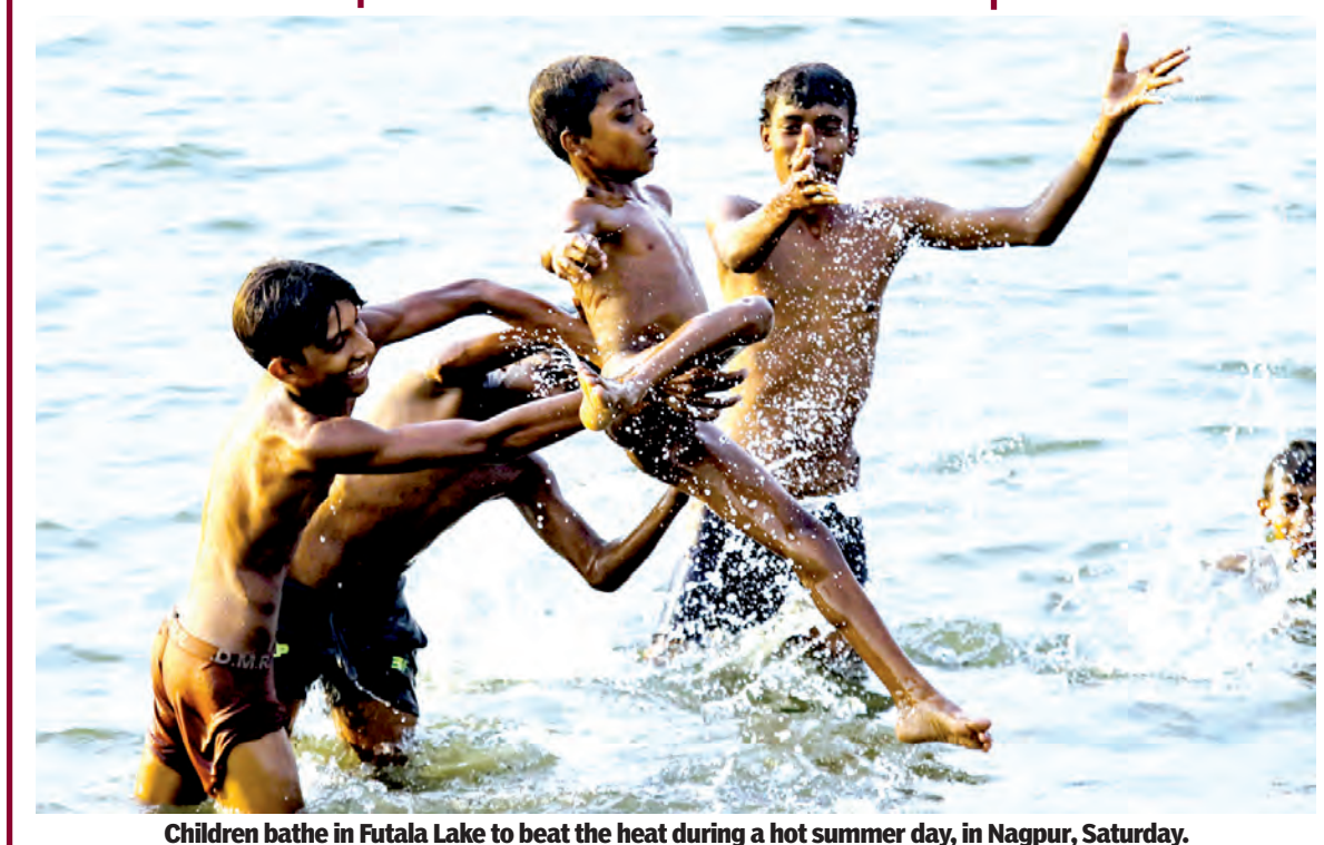
Children bathe in Futala Lake to beat the heat during a hot summer day, in Nagpur, Saturday.