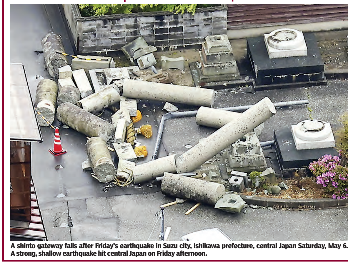
A shinto gateway falls after Friday's earthquake in Suzu city, Ishikawa prefecture, central Japan Saturday, May 6. A strong, shallow earthquake hit central Japan on Friday afternoon.