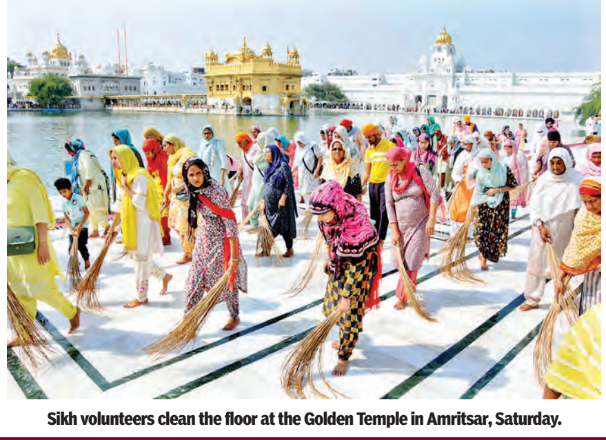
Sikh volunteers clean the floor at the Golden Temple in Amritsar, Saturday.