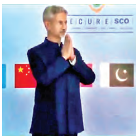
External Affairs Minister S. Jaishankar welcomes leaders for the Shanghai Cooperation Organisation (SCO) Foreign Ministers' Meeting, in Goa, Friday.

The channel of finances for terrorist activities must be blocked without any distinction and terrorism in all its forms, including cross-border terrorism, must be stopped, External Affairs Minister S Jaishankar said on Friday at a conclave of the Shanghai Cooperation Organisation (SCO) here in presence of his Pakistani counterpart Bilawal Bhutto-Zardari.