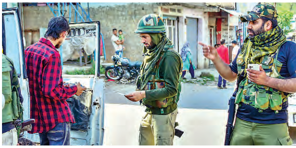
Security personnel near the site of an encounter with terrorists in Kandi area of Rajouri district, Friday.

Rajouri (J-K), May 05 (PTI): Five Army personnel were killed and a major injured on Friday in an explosion triggered by terrorists in the thickly forested Kandi area in Jammu and Kashmir's Rajouri district where an operation is underway to flush out terrorists, officials said.