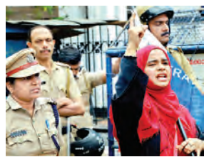
A Fraternity Movement Kerala activist raises slogans during a protest against the film 'The Kerala Story', in Kozhikode, Friday.

Producer to remove controversial 32,000 figure teaser