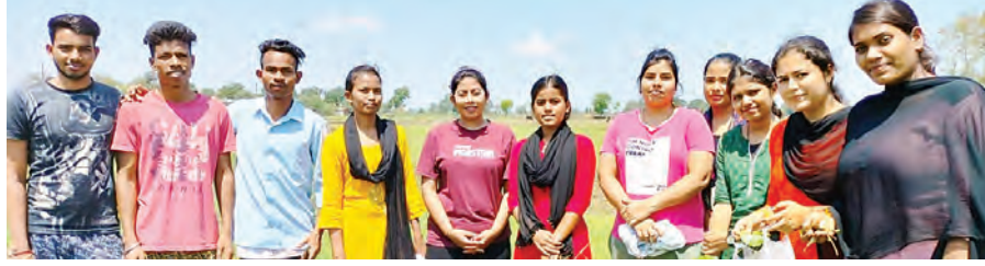
Central Chronicle News

Under Practical course in Fisheries Polytechnic