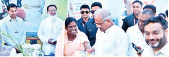
Central Chronicle News

Raipur, May 05: Chief Minister Bhupesh Baghel visited the stalls set up by women's self-help groups who came from different districts to attend the Aabhaar Sammelan of Patel, Kotwar, and Homeguards on Wednesday. This Sammelan also held a training-cum-conference program for office bearers of Gauthan Committees at the Science College Ground in Raipur. The Chief Minister praised the products made by