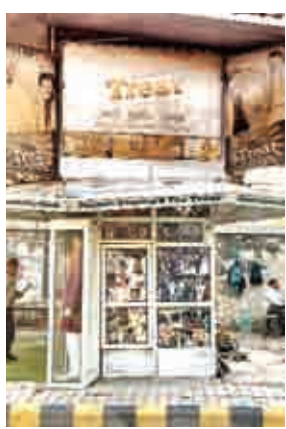
Rajesh Khanna inspired food joint ‘The Treat’, in New Delhi.

There is no escaping Khanna at the small restaurant in Chanakyapuri area that also boasts giant cutouts of the star. And one wax statue too.