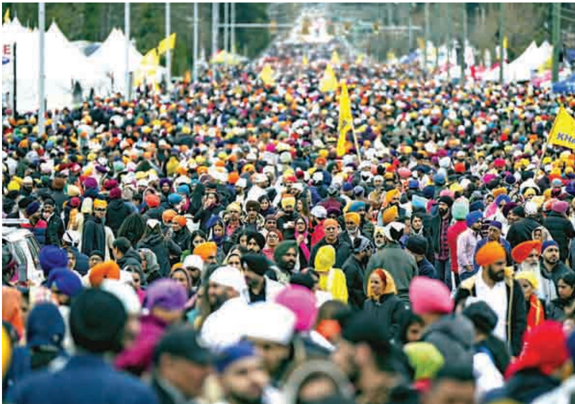
Attendees pack a street during the Vaisakhi parade in Surrey, British Columbia, Sunday.