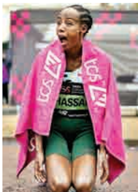
Sifan Hassan of the Netherlands celebrates winning the women's race at the London Marathon in London, Sunday, April 23.

"I don't know what to say right now, I am just grateful. The course felt good, there was a bit of rain around halfway but it was OK. 'I enjoy doing the marathons, it is good preparation for me. I loved it, I am very happy.' In the women's race, Sifan Hassan completed a stunning comeback to win on her