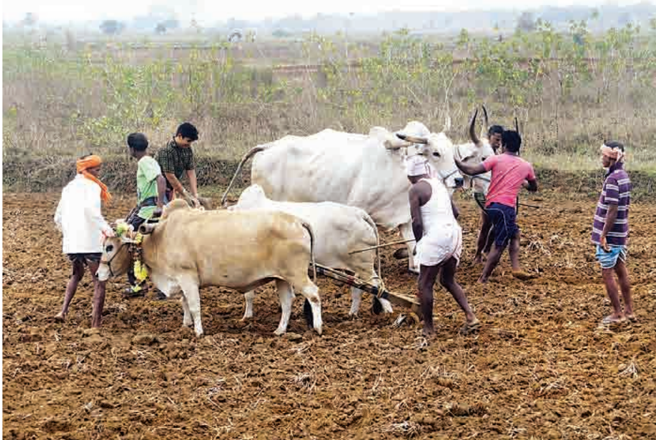
Farmers during the ceremonial act of sowing seeds in a paddy field during agrarian festival rituals of 'Akshaya Tritiya', in Khordha, Sunday, April 23.