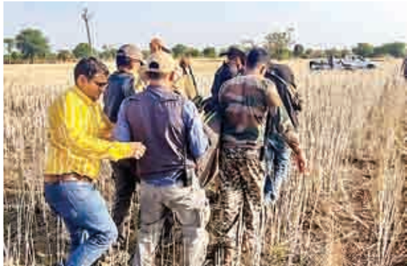
A male cheetah that strayed out of the Kuno National Park last week being brought back to the park.

After being tranquillised at Karera forest in Shivpuri district, cheetah Oban, now renamed as Pavan, was re-