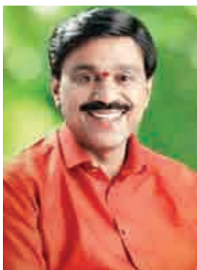
G Janardhana Reddy