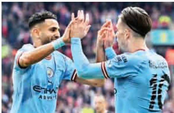
Manchester City's Algerian midfielder Riyad Mahrez (L) celebrates scoring the team's third goal, his hat trick, with Manchester City's English midfielder Jack Grealish.

Nothing has been won yet, but City's near-irresistible form is driving it toward the history books as its three-pronged trophy