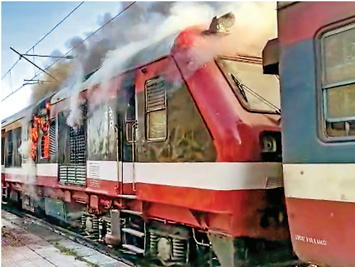
Smoke billows after two coaches of Ratlam-Dr Ambedkar Nagar DEMU train caught fire, in Ratlam district, Sunday.