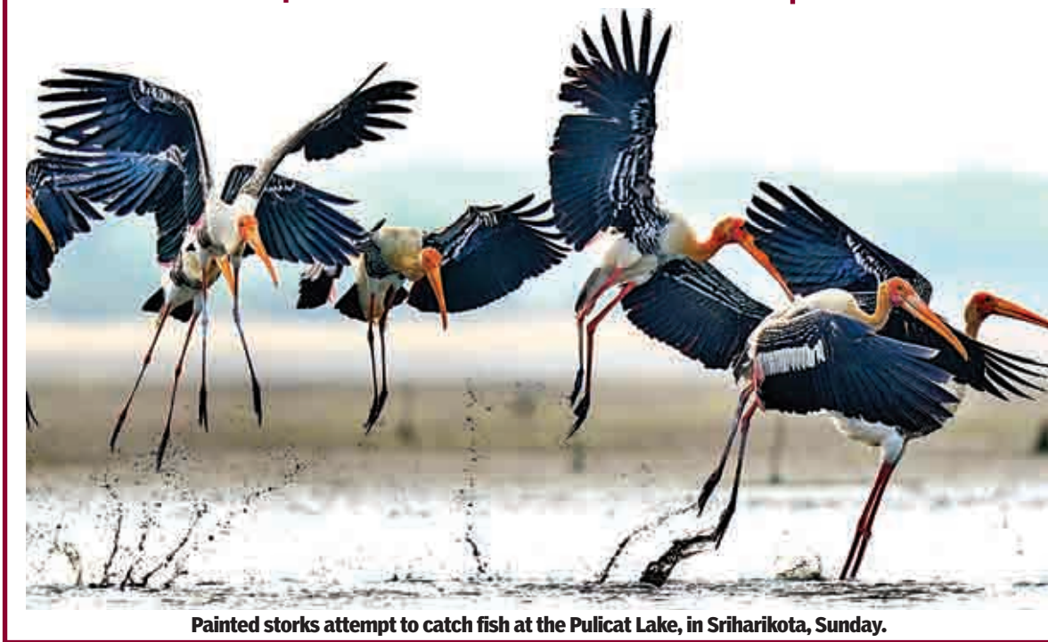
Painted storks attempt to catch fish at the Pulicat Lake, in Sriharikota, Sunday.