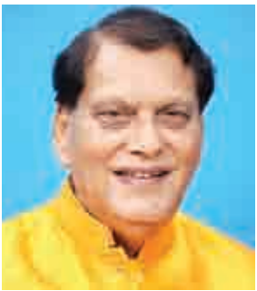
Dr. Bindeshwar Pathak

India was called the 'Golden Bird' (Sone Ki Chidiya) in ancient times because of its wealth and prosperity. However, people disregarded cleanliness. Be it a city or a village, people did not pay attention to cleanliness. They had an unfortunate habit of dumping waste products everywhere at public places. Piles of garbage or filth in public places was a common sight. Besides, people used to defecate in the open as not many houses had toilets. Women faced many challenges as they had to go out for