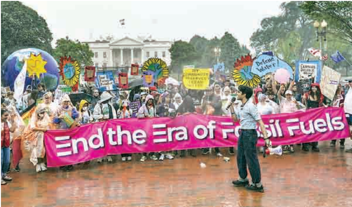
Climate activists hold a rally to protest the use of fossil fuels on Earth Day in the rain in front of the White House, Sunday.