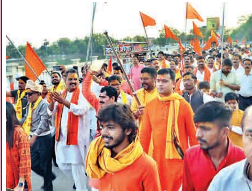
All the different Brahmin organizations in the state took out a massive 'Shobha Yatra' on occasion of Parshuram Jayanti starting from Dharna venue in Budhatalab and passed through main thoroughfares of city.