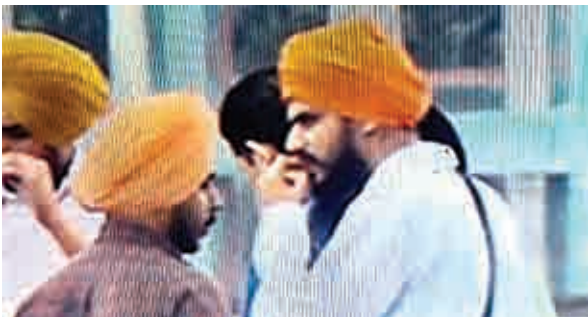
'Waris Punjab De' chief Amritpal Singh being brought to Dibrugarh Central Jail following his arrest from Punjab's Moga, in Dibrugarh, Sunday.

The 29-year-old was detained under the stringent National Security Act and flown to Assam on a special flight to be lodged at the Dibrugarh Central