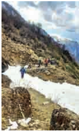
Rescue operation being carried out after almost 14 trekkers trapped following an avalanche, in Bageshwar, Sunday.

■ Shillong: mplementation of the Jal Jeevan Mission in many parts of Meghalaya is facing hurdles due to drying up of water sources in the northeastern state, PHE Minister Marcuise N Marak said on Sunday. Jal Jeevan Mission aims to provide potable water at every doorstep in the country by 2024. "I have received reports that there are Jal Jeevan Mission projects that are already completed by the department but because of drying up of the water sources, there is no water at intake points," the minister told PTI.