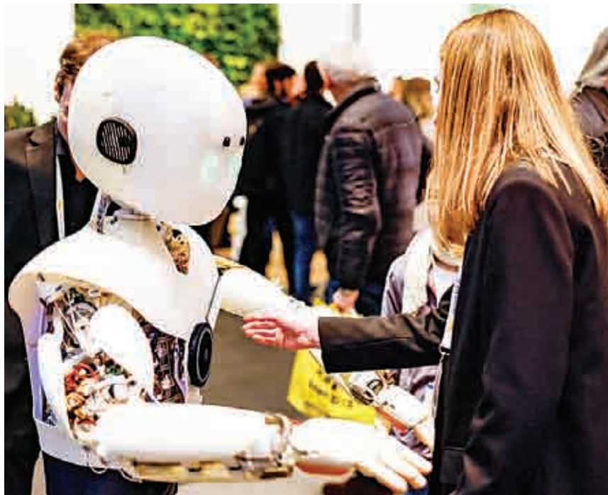
A woman interacts with a robot by Devanthro - The Robody Company in front of a photo box at the HANNOVER MESSE 2023, the Hanover technology fair, in Hanover, Germany. Manufacturers are hoping for the artificial intelligence revolution to reach their factories, envisaging robots being used to repair complex machinery.