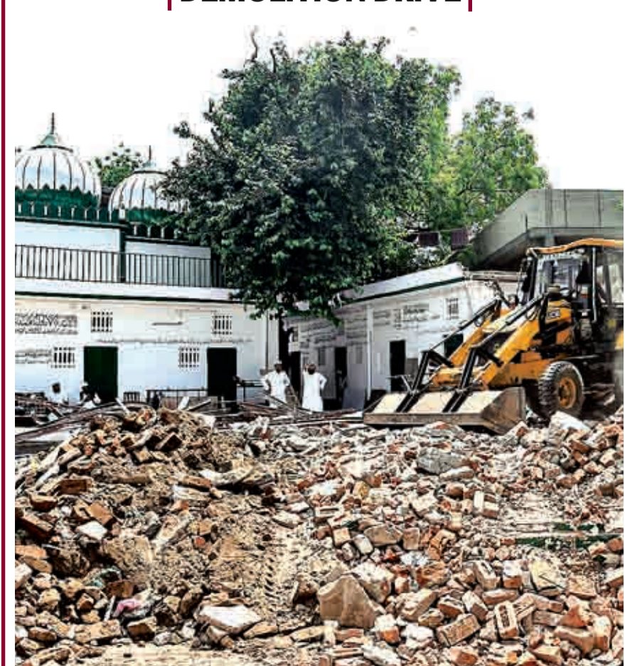
An anti-encroachment drive being carried out in front of Masjid Bengali Market, in New Delhi, Tuesday.