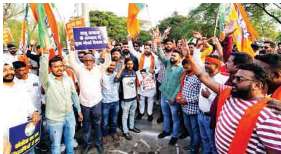
Bhilai, Apr 11: