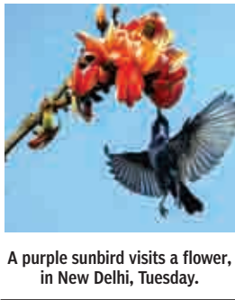
A purple sunbird visits a flower, in New Delhi, Tuesday.