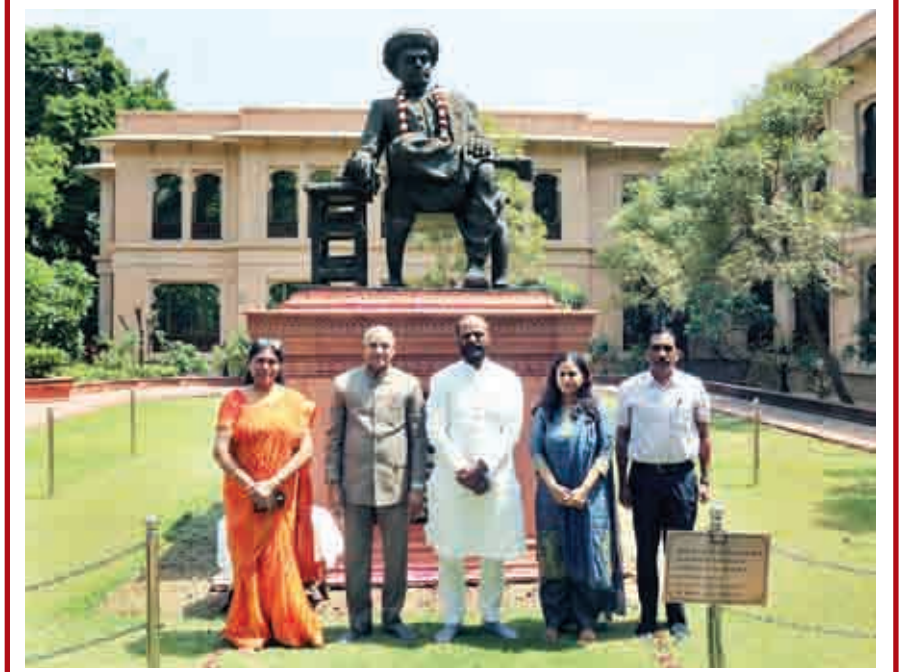
Maharashtra Governor Ramesh Bais offered floral tribute to the statue of Mahatma Jyotiba Phule on the occasion of the Birth Anniversary of the great social reformer at the New Maharashtra Sadan in New Delhi.