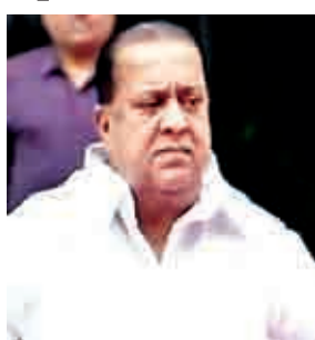
MLA from Kagal Assembly constituency in Kolhapur district, was the rural development minister in the previous Maha Vikas Aghadi (MVA) government. The ED has

He was apprehending arrest by the Enforcement Directorate (ED) under the garb of investigation and recording of statement under the Prevention of Money Laundering Act (PMLA), he had said in the application. Mushrif,