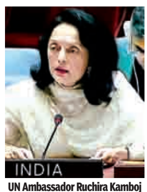
UN Ambassador Ruchira Kamboj

India is facing a "serious challenge" of cross-border supply of illicit weapons using drones, which cannot be possible without active support from State authorities, New Delhi's envoy here said in an apparent reference to Pakistan.