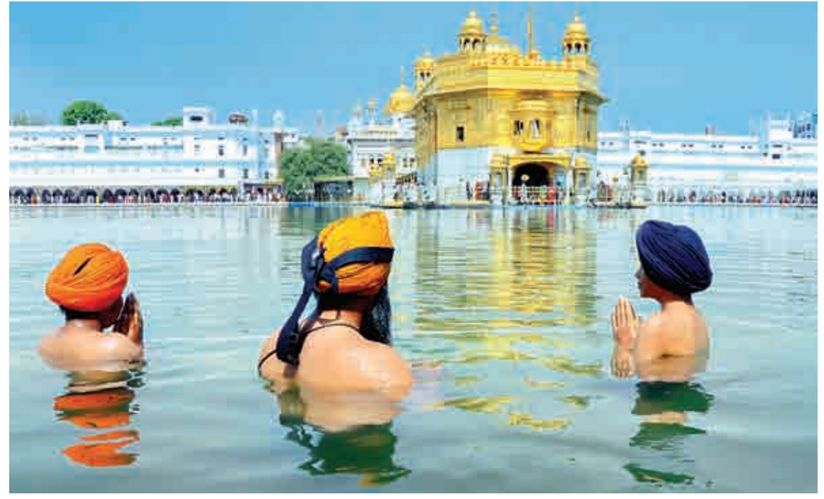
Sikhs takes a dip in the 'holy sarovar' during the birth anniversary celebrations of the ninth Sikh Guru Tegh Bahadur, at Golden Temple in Amritsar, Tuesday.