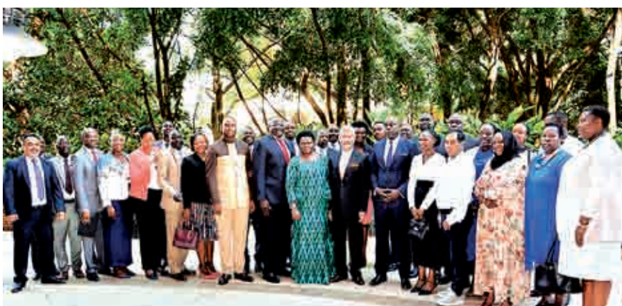
External Affairs Minister S. Jaishankar with the Parliamentary Forum on Indian Affairs, in Kampala, Uganda, Tuesday, April 11.