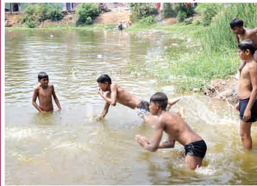
Kids enjoyed a splash in a local pond to beat the heat with start of summer season here on Tuesday.