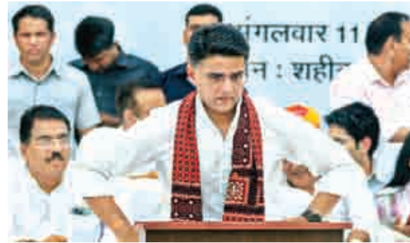
Congress leader Sachin Pilot sits on a hunger strike against the alleged corruption during previous BJP government in Rajasthan, at Shaheed Smarak in Jaipur, Tuesday.

Jaipur, Apr 11 (PTI): As he ended his daylong fast demanding action from his own government over cases of alleged corruption during the BJP term, senior Congress leader Sachin Pilot on Tuesday said his movement against graft will continue. He was speaking to reporters after ending the fast at the Shaheed Smarak here. Pilot sat on the fast