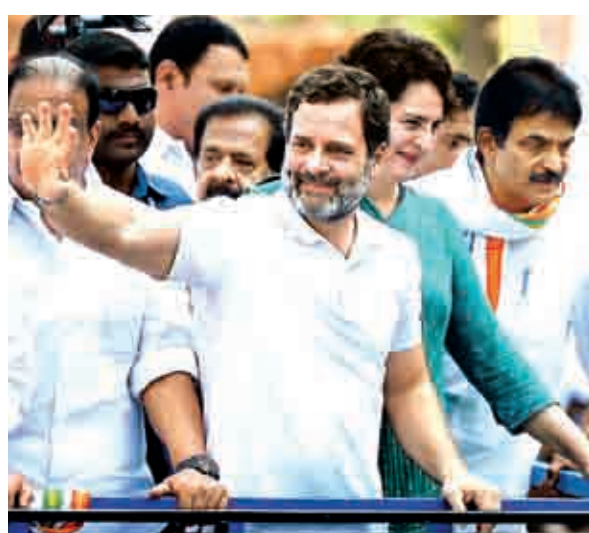
Congress leaders Rahul Gandhi and Priyanka Gandhi during a roadshow in Wayanad, Tuesday.