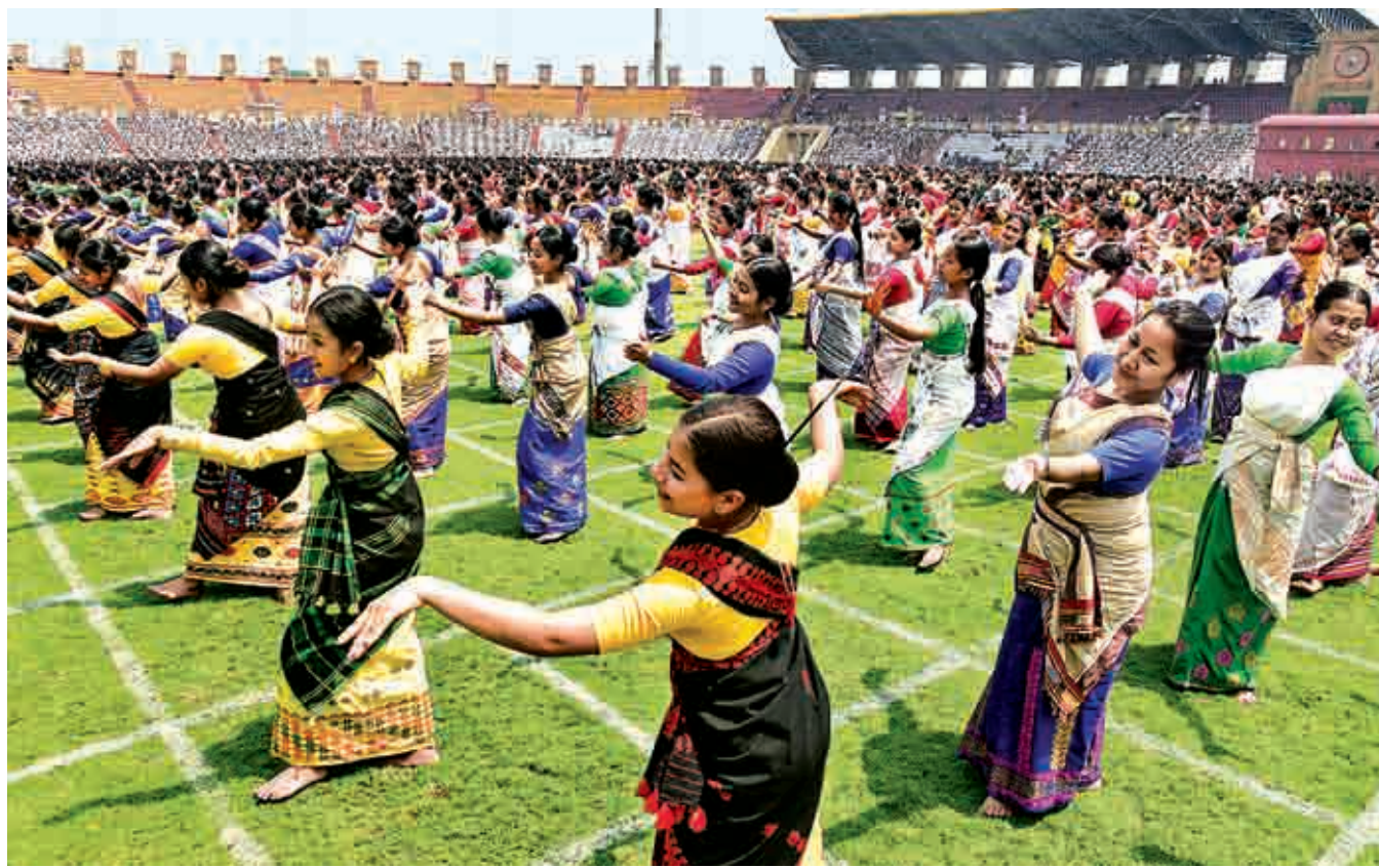
Bihu dancers during rehearsal for the Guinness World Record event, in Guwahati, Tuesday, April 11. Over 11,000 Bihu dancers will perform in an attempt to set a Guinness World Record, during upcoming Rongali Bihu festival celebrations on April 14.