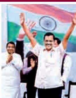
Delhi CM and Aam Aadmi Party (AAP) convener Arvind Kejriwal at an event celebrating the national status of the party granted by ECI, in New Delhi, Tuesday.