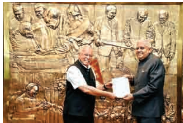
TMC leader Luizinho Faleiro submits his resignation as a member of Rajya Sabha to Chairman of Rajya Sabha Jagdeep Dhankar.

"But at this moment, I am not joining any political party. I have resigned as a Rajya Sabha MP and leave it at that," he said.