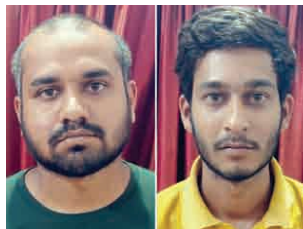
Bhilai, Apr 11:

Acting on a tip off, Police nabbed two ruffians red-handed while accepting bets on satta-patti and IPL matches. The accused were accepting bets beneath a tree near BSNL Square in Sector 2. The accused are identified as