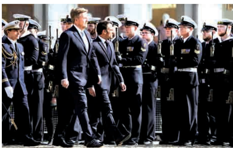
French President Emmanuel Macron, center, and Dutch King Willem-Alexander review the guards outside the royal palace on Dam square in Amsterdam, Netherlands, Tuesday, April 11.

French President Emmanuel Macron is set to deliver a speech outlining his vision for the future of Europe during a two-day state visit to the Netherlands that began Tuesday. The afternoon speech at a theatre in The Hague comes after Macron raised eyebrows with comments on Taiwan after his recent visit to China. "The question we need to answer, as Europeans, is the following: Is it in our interest to accelerate (a crisis) on Taiwan? No," Macron was quoted as saying in an interview published Sunday in French newspaper Les Echos and by Politico Europe. "The worst thing would be to think that we Europeans must become followers on this topic and take our cue from the US agenda and a Chinese overreaction."