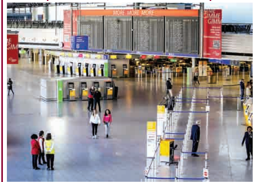
An almost deserted terminal at the airport in Frankfurt, Germany, Monday.