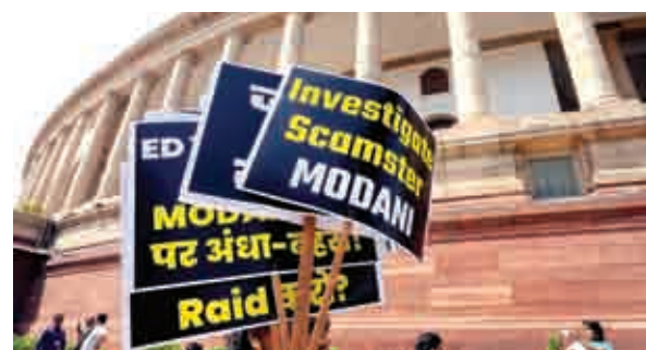
Placards used during a protest by Opposition MPs over the Adani Group issue at Parliament House complex during Budget Session, in New Delhi, Monday.

But instead of TMC's floor leaders, its two MPs were in attendance at both the events. In a meeting called by Congress president Mallikarjun Kharge