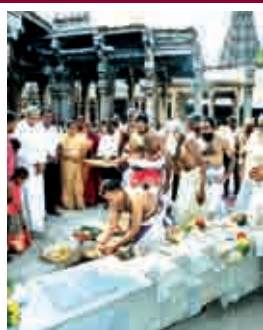
Priests perform rituals before installation of pillars at Veerasantarayar Mandapam of Meenakshi Amman temple, in Madurai, Monday.