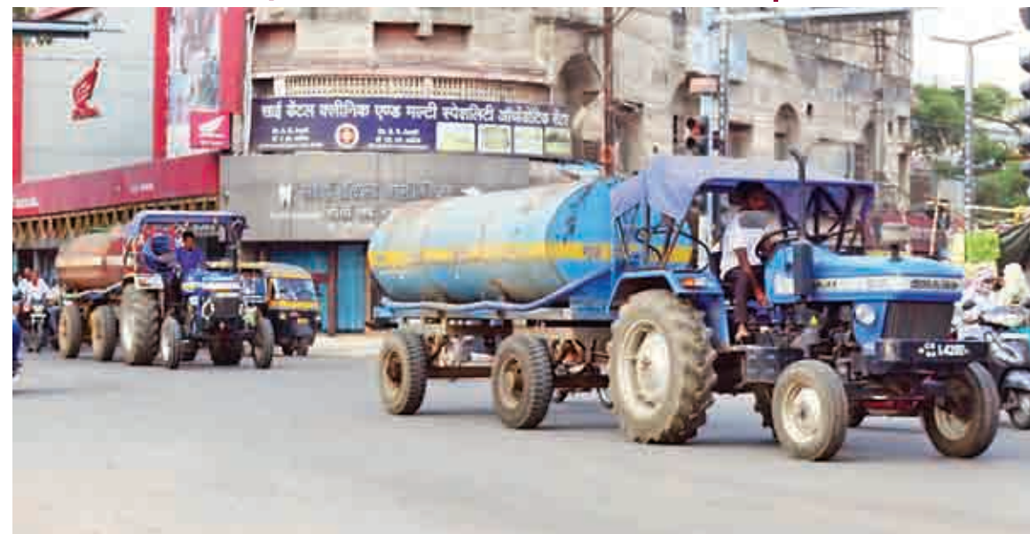
With repair work of the main rising line starting here in the morning, water supply to many localities was done through water tankers here on Monday evening.