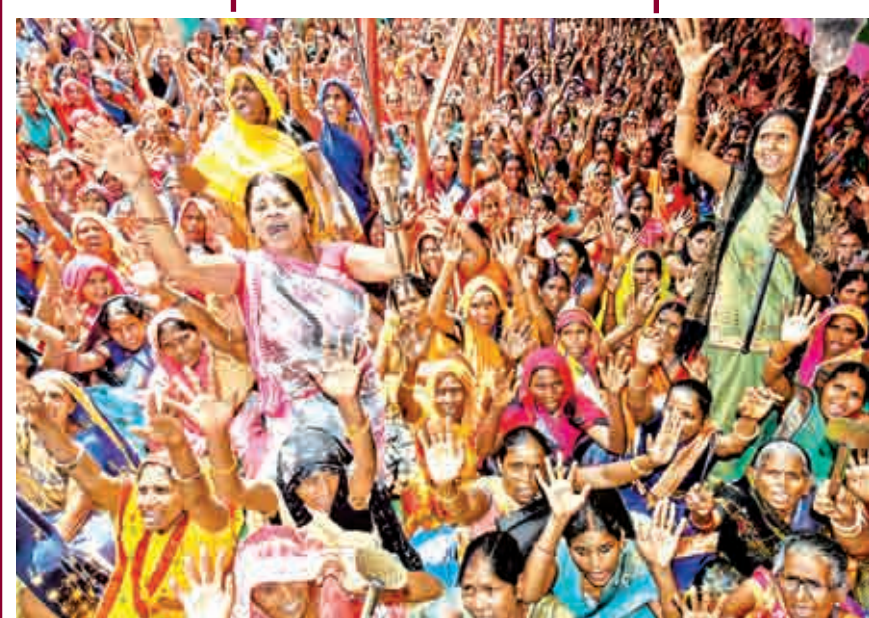
Mid-Day Meal workers raise slogans as during a protest amid the Budget Session of Bihar Assembly, in Patna, Monday.