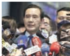
Former Taiwan President Ma Ying-jeou answers to press before leaving for China at Taoyuan International Airport in Taoyuan City, Northern Taiwan, Monday.

Ma's policies brought Taiwan and Beijing to their closest relationship ever, but his exit from office was overshadowed by massive protests against a trade deal with the mainland and his