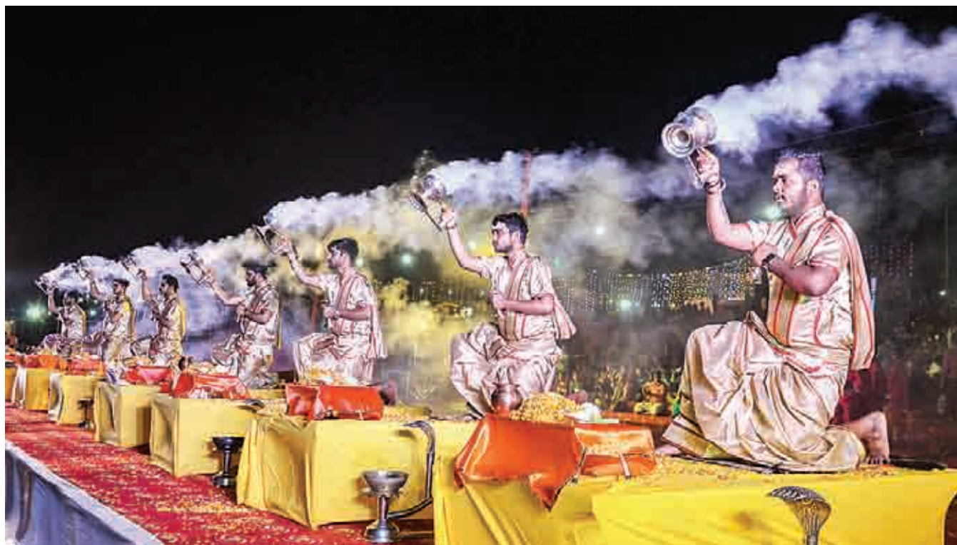
Priests perform 'Ganga aarti' during the 'Chaitra Navratri' festival, at Vindhychal Dham in Mirzapur, Sunday night.