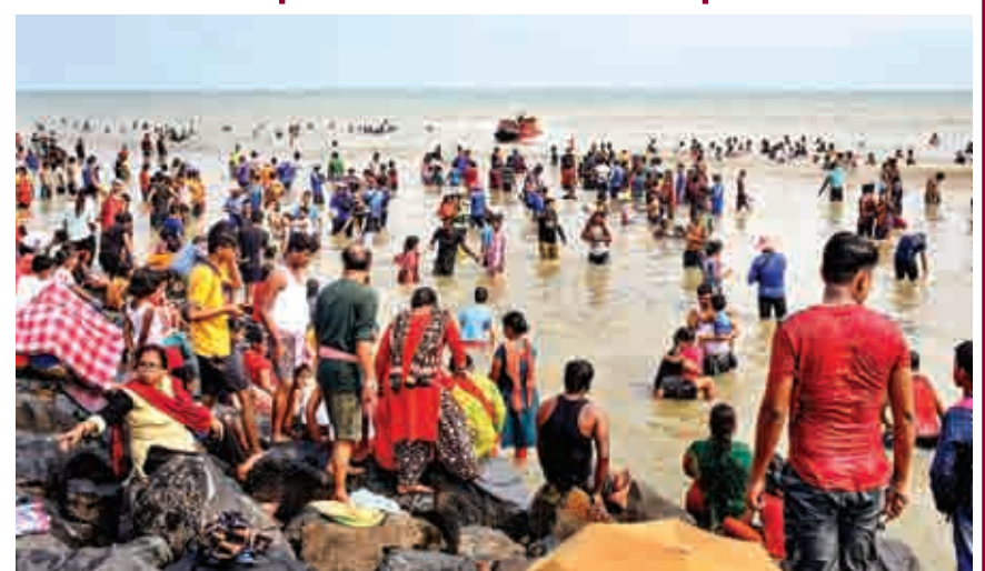
Crowd at Digha beach, in East Midnapore district, Monday.