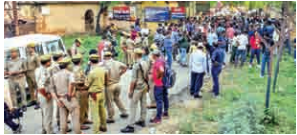
Police personnel stand guard outside Naini Central jail as mafia Atiq Ahmed is being shifted from Sabarmati Central Jail, in Prayagraj, Monday.

Ahmed will be produced before a court on Tuesday, when it is likely to pass an order in a 17-year-old kidnap-