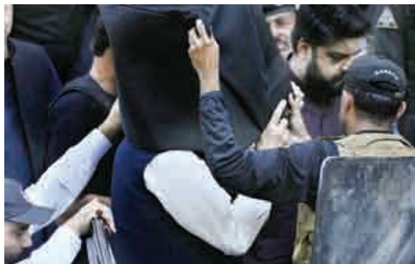
Security personnel with bulletproof shields escort former Prime Minister Imran Khan, center, as he arrives to appear in a court, in Islamabad, Pakistan, Monday.