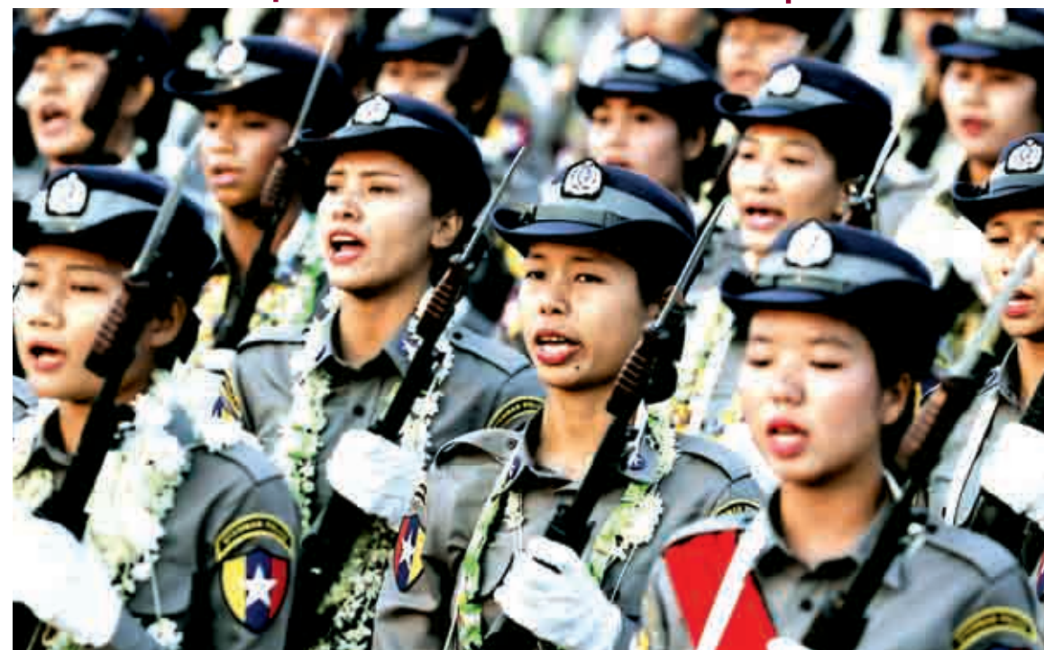
Police officers march during a parade to commemorate Myanmar's 78th Armed Forces Day in Naypyitaw, Myanmar, Monday.