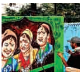
An artist makes paintings depicting the Uttarakhand culture on the walls as part of preparation ahead of the G-20 meeting, in Ramnagar, Monday.