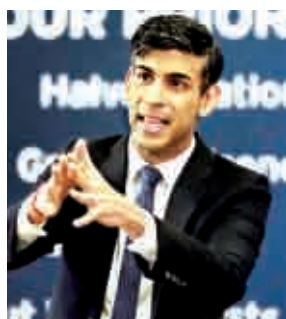
PM Rishi Sunak gestures as he attends a Q&A session during a Connect event at a Boxing Club in Chelmsford, Essex, England, Monday.

Victims of anti-social behaviour from the local community will be given a say in offenders' punishments to ensure justice is "visible and fits the crime". "Anti-social behav-