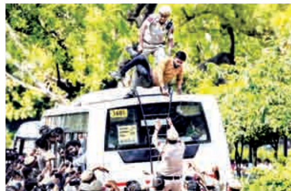
Indian Youth Congress activists being detained during a protest against the disqualification of Congress leader Rahul Gandhi from Lok Sabha, at Jantar Mantar in New Delhi, Monday.

Indian Youth Congress (IYC) activists from across the country gathered at the Jantar Mantar to show solidarity with Gandhi and criticised the central government for “silencing” voices of the democratic opposition. Carrying IYC flags and “Satyameva Jayate” placards, the protesters demanded justice for