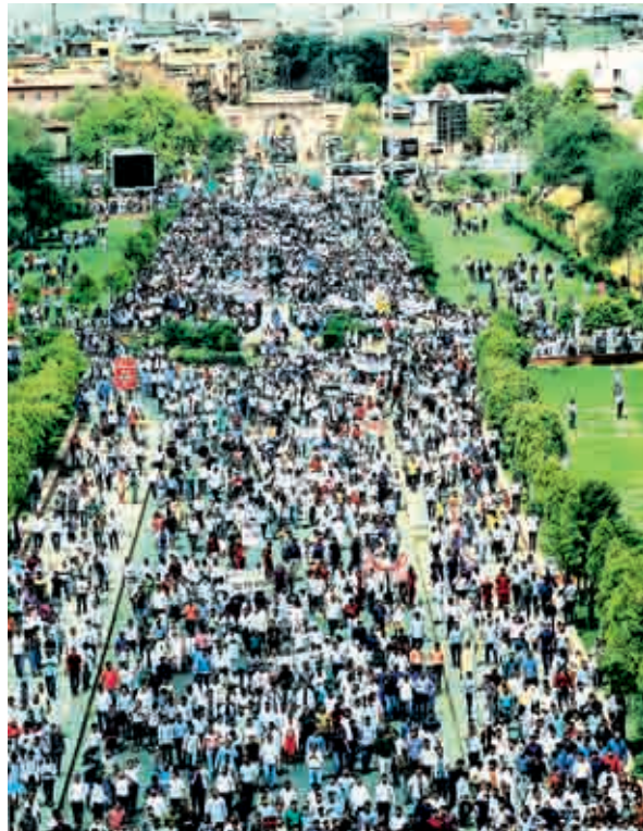
Doctors take out a protest rally against the Rajasthan Right to Health Bill, in Jaipur, Monday.

Medical services in government hospitals were also affected as doctors across the state boycotted work for two hours in solidarity with the protesting