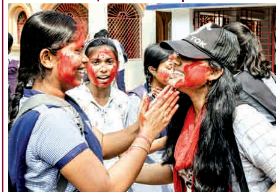
Class XIIth students celebrate on completion of their West Bengal Council of Higher Secondary Education (WBCHSE) exams, in Nadia district, Monday.