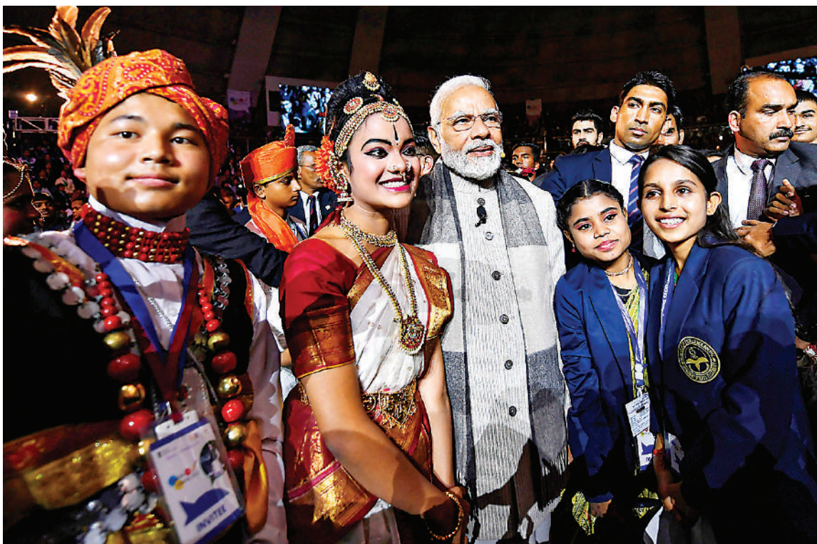
Prime Minister Narendra Modi with students during the 6th edition of 'Pariksha Pe Charcha 2023', at Talkatora Stadium in New Delhi, Friday.