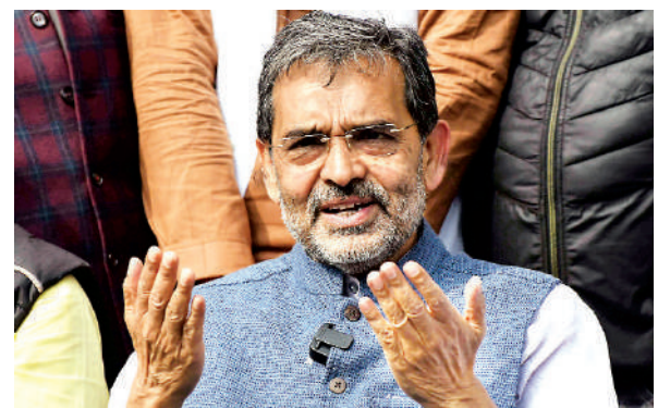
Janta Dal United (JDU) National Parliamentary Board President Upendra Kushwaha addresses a press conference, in Patna, Friday.

"The chief minister has been saying that I have quit the party thrice and come back out of my own wish. I must correct him. I have parted ways and re-