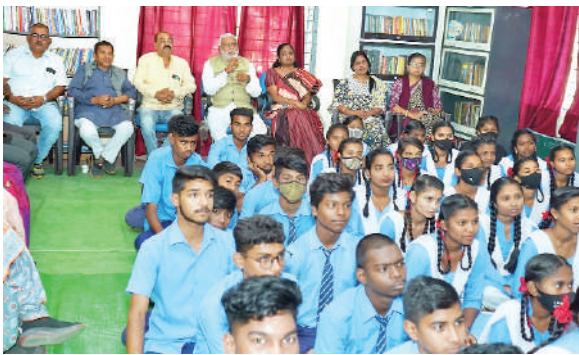
Govt Higher Secondary School, Sec 9

Bhilai, Jan 27: On Friday, Prime Minister Narendra Modi interacted with students and answered their questions related to exam stress and other issues at Talkatora Stadium in Delhi. The students of the district watched the live telecast of this event. The primary and high schools of the district attended this event virtually.