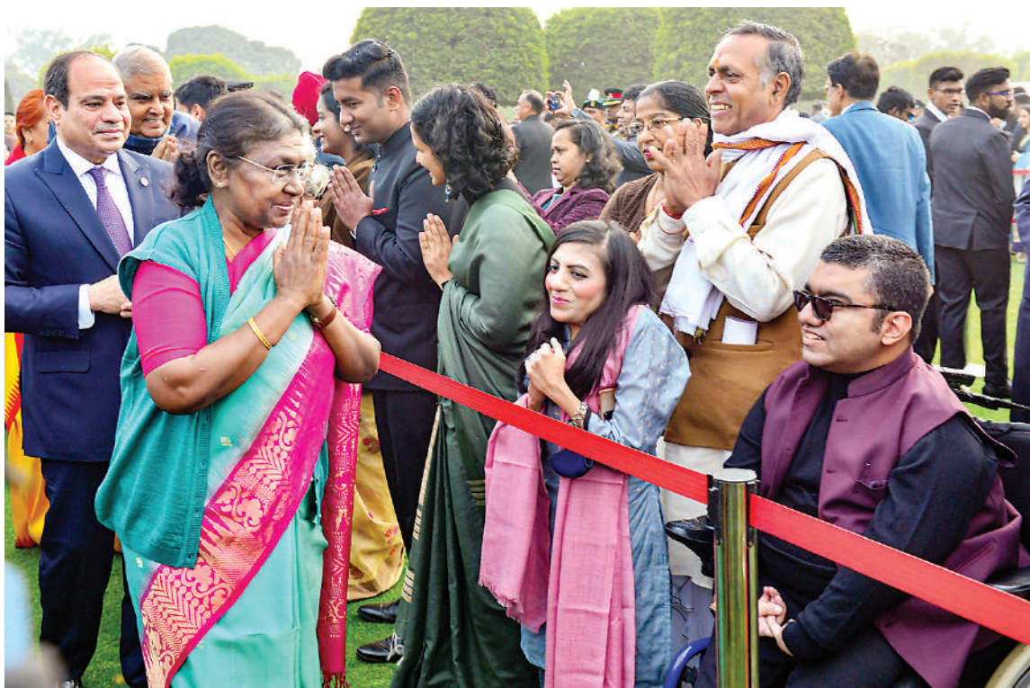
President Droupadi Murmu and Egyptian President Abdel Fattah El-Sisi during the 'At-Home' reception, on the occasion of 74th Republic Day, at the Rashtrapati Bhavan in New Delhi, Thursday.