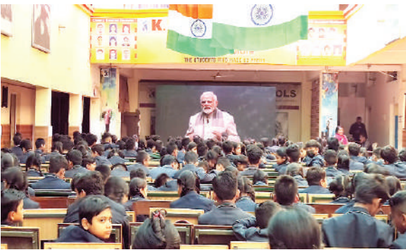
KH Memorial School, Jawahar Nagar

just a way to learn new things and there is a need to learn more. For ill effects of spending more time on electronic gadgets he said there must be a technology free hour everyday and students should spend that time with friends, family, books and pets or at the garden. He dealt with the questions based on success and failure, aspirations, technol-