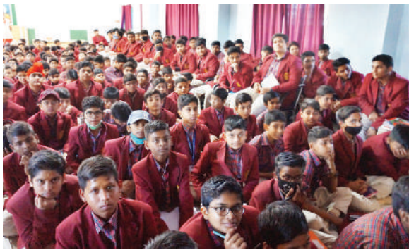
DAV Public School, Hudco