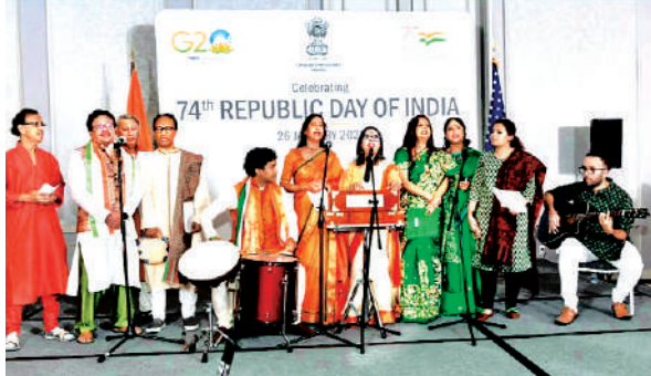
Houston: Combo image of artists' performance during an event organised to celebrate the 74th Republic Day of India, in Houston, USA, Thursday, Jan. 26, 2023.

Consulate Generals of Japan, Mexico and other countries were also present at the power-packed evening, besides over 300 guests from neighbouring states.