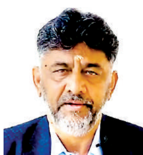
D K Shivakumar

Shivakumar, who is a Vokkaliga, had earlier too called on the Vokkaliga community, which forms a major votebank in the old Mysuru or southern Karnataka region, to strengthen his hands. "I'm standing before you as your son, I'm asking you as a son