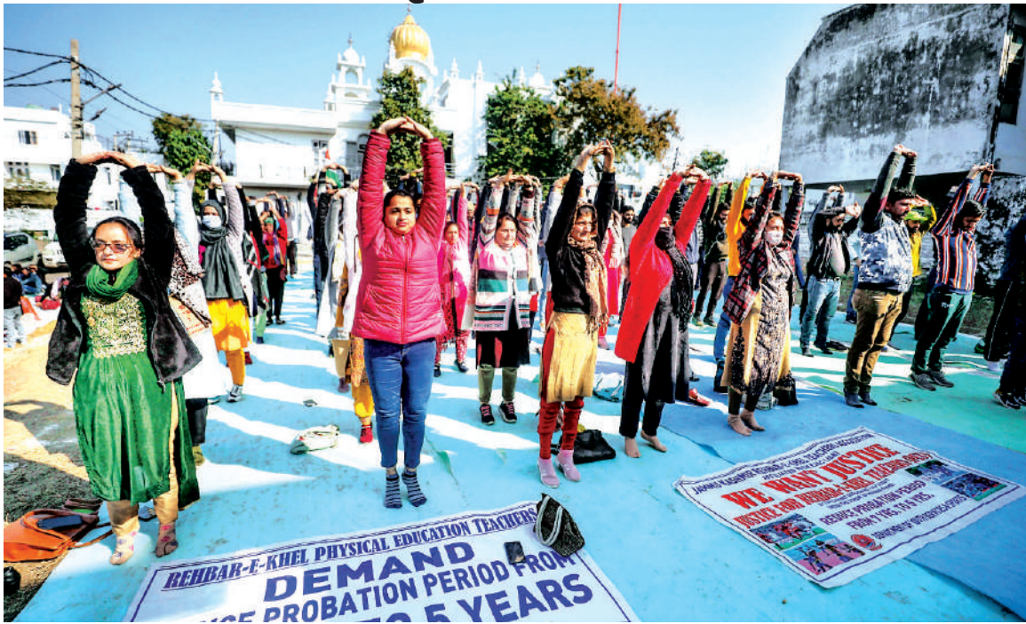
Jammu and Kashmir Rehbar-e-Khel teachers perform yoga during their protest outside Bharatiya Janata Party office, in Jammu, Friday.