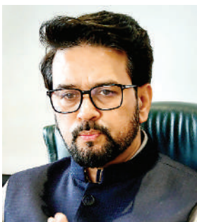
Union Minister of Information & Broadcasting and Youth Affairs & Sports Anurag Singh Thakur addresses the media regarding SCO Film Festival, in Mumbai, Friday.

In the past, actor Akshay Kumar's "Samrat Prithviraj", Aamir Khan's "Laal Singh Chaddha" and Deepika Padukone's "Padmaavat" had faced boycott calls. "If someone has a problem (with a film), then they should talk to the concerned department which will take it up with the producer and director," Thakur said. "But sometimes, just to vitiate the atmosphere, some people comment on something even before knowing about it fully. That causes problems. This should not hap-