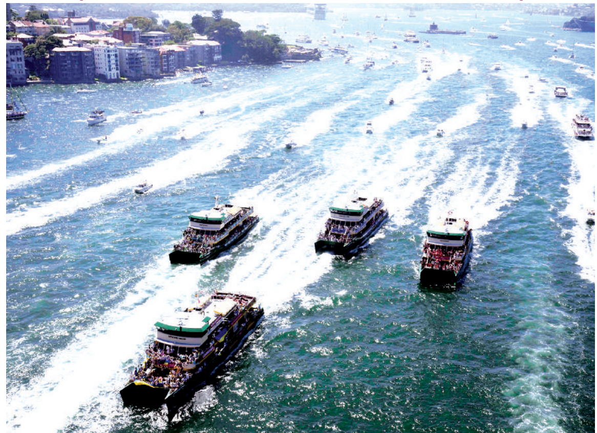
Pleasure craft follows ferries that are having an annual race on Sydney Harbour during Australia Day celebration in Sydney, Thursday, Jan. 26, 2023. Australia marks the anniversary of British colonists settling modern day Sydney in 1788 while Indigenous protesters deride Australia Day as Invasion Day.