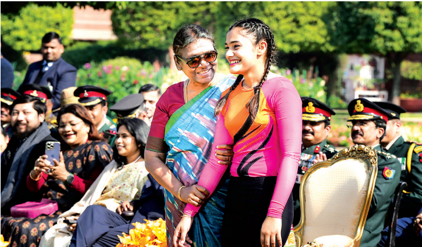
President Droupadi Murmu interacts with an artist who performed at the Republic Day Parade 2023, during a meeting at the Rashtrapati Bhavan, in New Delhi, Friday, Jan. 27.

Central Chronicle welcomes, articles, write ups, comments on different issues for editorial page (800-900 words), Letter to editor for this page. It can be sent by e-mail at: editorcentralchronicle@gmail.com The letters can be edited or rewritten for clarity of thoughts.