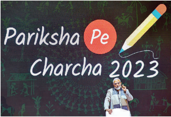
PM Narendra Modi addresses during the 6th edition of 'Pariksha Pe Charcha 2023', at Talkatora Stadium in New Delhi, Friday.

Interacting with students during the sixth edition of "Pariksha Pe Charcha", he also told them it is his "firm conviction" and "article of faith" that criticism is a purification exercise for a robust democracy. Criticism is precondition to a robust democracy, he said but noted that a "vast gulf" exists between criticism and allegations. Replying to a