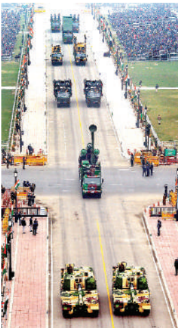
74th Republic Day parade on the Kartavya Path, in New Delhi, Thursday.

■ New Delhi: India on Friday repatriated 17 Pakistani nationals imprisoned in the country, the Pakistan High Commission here said. "Seventeen Pakistani nationals imprisoned in India were repatriated today via Attari-Wagah border after hectic efforts of the Pakistan High Commission, the Pakistan Foreign Ministry and cooperation of the Indian side," the Pakistani mission said on Twitter. "Our efforts will continue to repatriate all Pakistan prisoners from India on completion of their sentences," it said.