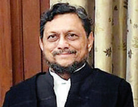
Former CJI Sharad Bobde

Go First had apologised for the incident, that happened on January 9, where-in the passengers who were to board to a Delhi flight were left behind in the passenger coach at the Bangalore airport. The airline had also derostered the staff involved in the incident pending an inquiry.