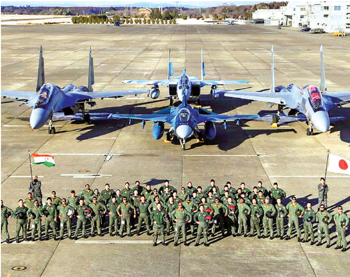
Japan: Personnel of Indian Air Force (IAF) and Japan Air Self Defence Force (JASDF) pose for photos during the inaugural edition of the bilateral air exercise 'Veer Guardian 2023' that concluded on Thursday, Jan. 26 in Japan.