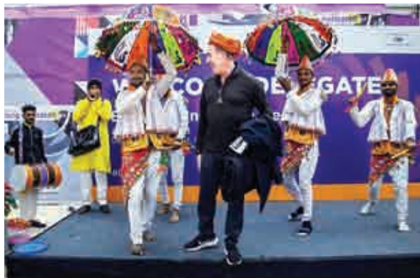
The Business 20 (B20) inception meeting being organised in Gujarat's Gandhinagar city from Sunday as part of India's G20 presidency.

Several policymakers, including Commerce and Industry Minister Piyush Goyal besides business leaders and senior executives representing businesses of the G20 countries are participating in the three-day B20 India inception meeting, which commenced here on Sunday. As India holds the presidency of G20 in 2023, it will host the 18th G20 Summit in September. The Business 20 (B20) is amongst the most prominent official engagement groups in G20, with companies, business associations and multilateral organizations as participants. The G20 or Group of 20 is an intergovernmental