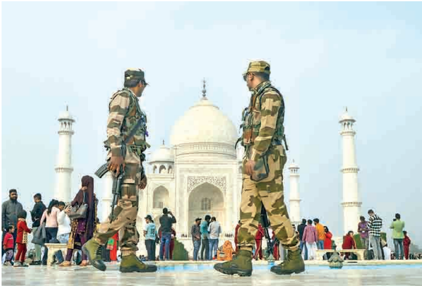
CISF personnel stand guard in view of Republic Day, at Taj Mahal, in Agra, Sunday, Jan. 22.