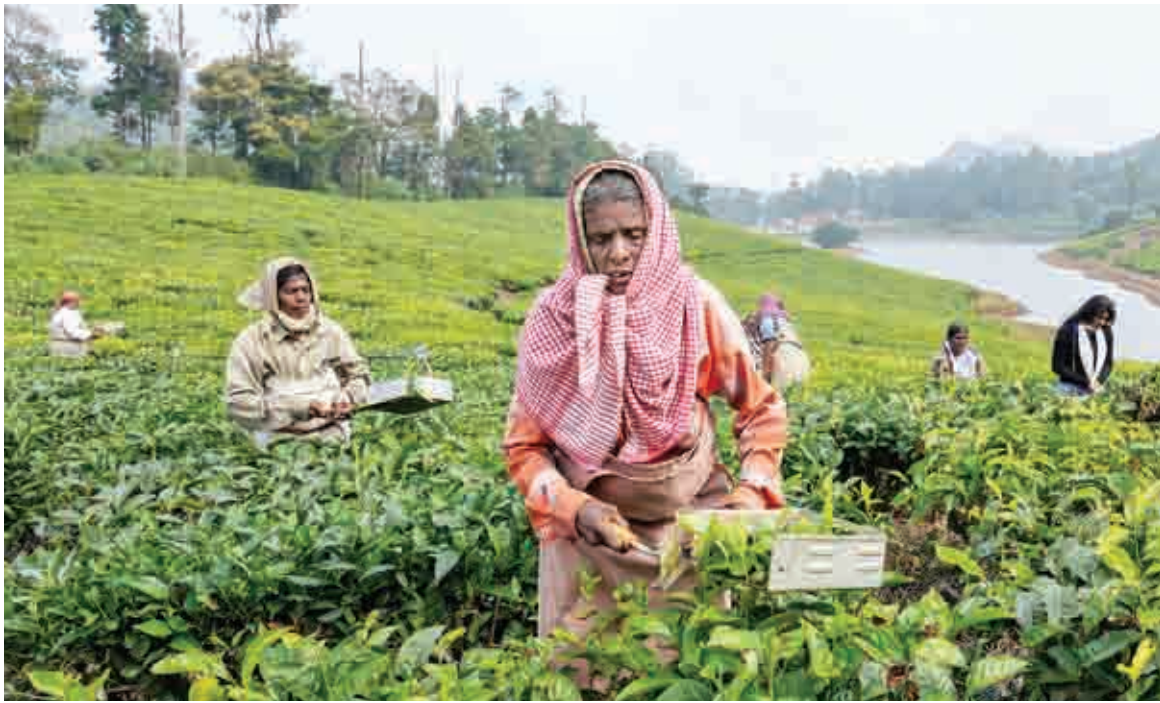
Theni: Farm workers harvest tea leaves at the Megamalai tea estate in Theni district, Tamil Nadu.