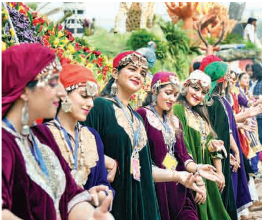
Jammu and Kashmir tableau artists during a press preview, ahead of the Republic Day Parade 2023, in New Delhi, Sunday,