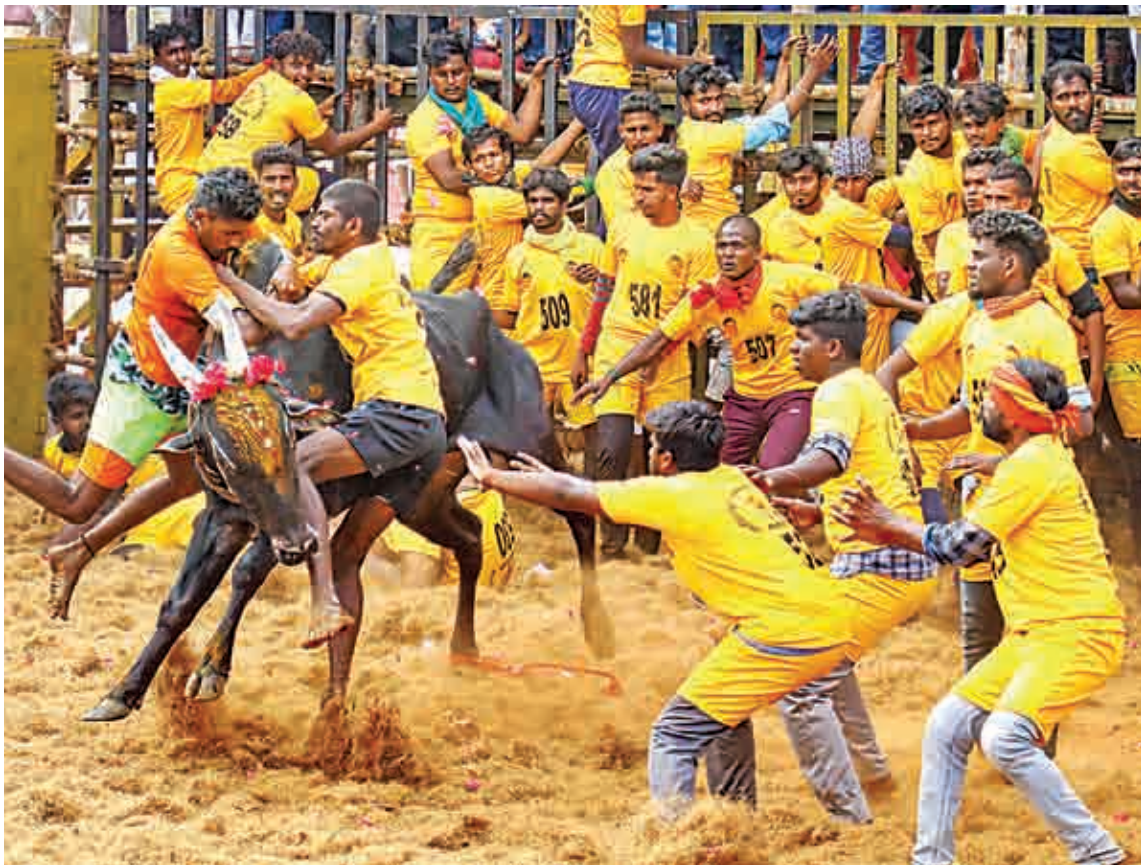
People try to take control of a bull as they participate in the 'Jallikattu' event, in Dharmapuri.