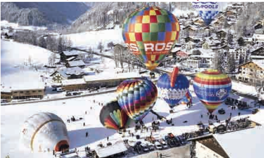
Hot air balloons take off during the 43th International Hot Air Balloon week, in the skiing resort of Chateau-d'Oex, in the Swiss Alps. Postponed twice because of the pandemic, The International Hot Air Balloon Festival of Chateau-d'Oex (VD) returns this year for a 43rd edition. 60 balloons from 15 countries will be taking part in the event between the 21th and the 29th of January in the Swiss mountain resort is famous for ideal flight conditions due to an exceptional microclimate.