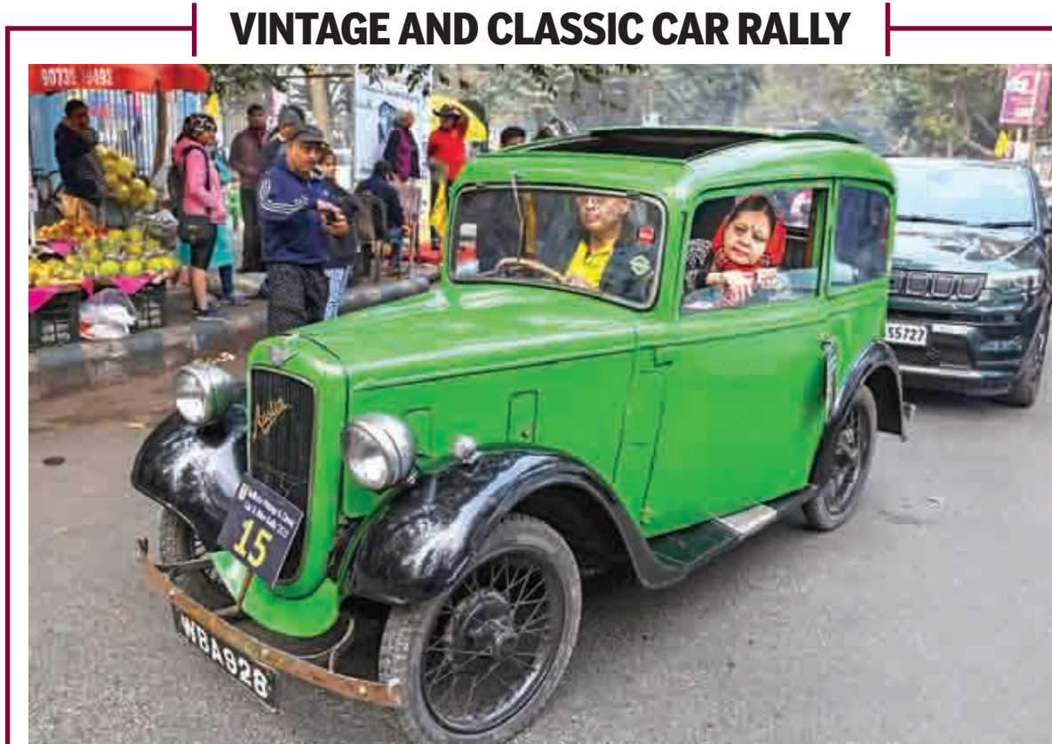
Participants ride their vintage car during Kolkata Vintage and Classic Car Rally 2023, in Kolkata, Sunday, Jan. 22.

While the nation is dependent on imports to meet 85 per cent of its oil needs and 50 per cent of its natural gas requirements,