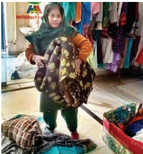
A woman collects warm clothes kept at Anokha Mall for the needy, in Lucknow.