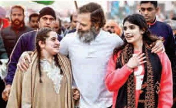
Congress leader Rahul Gandhi with supporters during the party's 'Bharat Jodo Yatra', at Hiranagar in Kathua district, Sunday.

The Bharat Jodo Yatra of the Congress reached Samba in Jammu and Kashmir on Sunday afternoon, after covering 21 kilometres in more than six hours from adjoining Kathua amid heightened security in the wake of twin blasts in Jammu. The Congress said the foot march, being led by party leader Rahul Gandhi, will proceed according to its schedule and reach Jammu on Monday afternoon. "This was the 128th day of the Bharat Jodo Yatra. It started from Hiranagar (in Kathua) at 7 am and reached its destination at Chak Nanak (Samba district) at around 1.15 pm," Congress general secretary Jairam Ramesh told reporters at the camp site. He said the tremendous response the yatra has re-