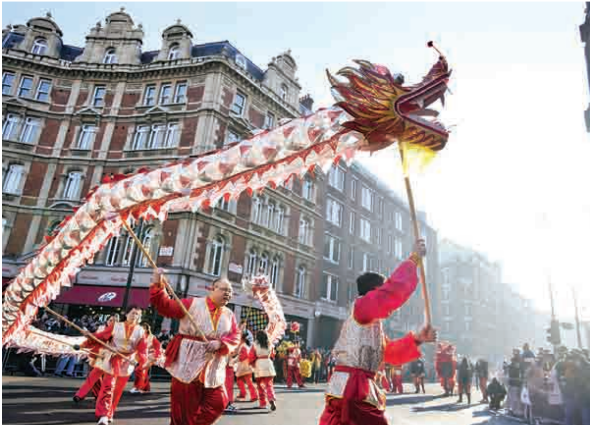
Performers with a dragon costume dance during the Lunar New Year parade in London, Sunday, Jan. 22. The parade is to mark the arrival of the Year of the Rabbit, with thousands of visitors expected to watch the spectacular show and Lion Dances in the capital.