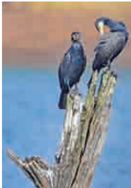
Cormorants perch on a tree trunk at the Thekkady lake in Kerala.