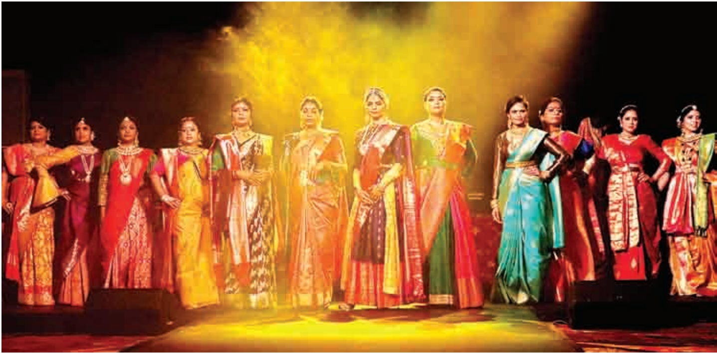
Wives of IAS Officers' walk the ramp in a fashion show during the three-day Madhya Pradesh IAS Officers' Association Service Meet -2023, in Bhopal.