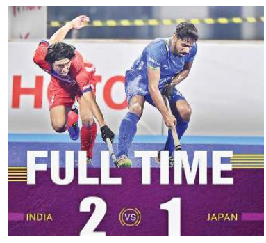
India 2-1 vs Japan