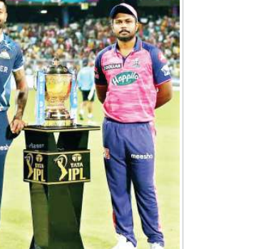
India hockey team members

Five minutes later, India conceded another penalty corner but the Japanese failed to capitalise on the chance. Trailing by a goal, the Japanese mounted relentless pressure on the Indian defence and the Indians deflected a freekick. Lakra-red backline stood firm to keep their lead intact. Just three minutes from the final buzzer, Japan secured a penalty corner but the Indians defended in numbers to register the equaliser. In their next Super 4 stage match on Sunday.