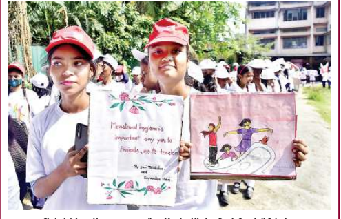
Students take part in an awareness rally on Menstrual Hygiene Day, in Gawahati, Saturday.