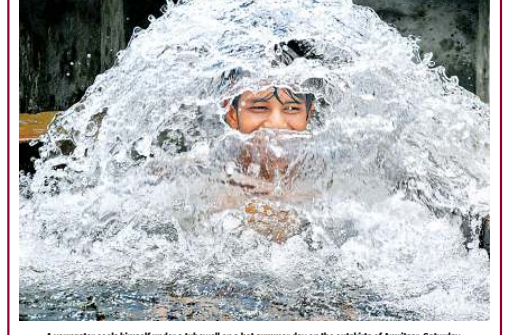
A youngster cools himself under a tubevel on a hot summer day on the outskirts of Amritsar, Saturday.