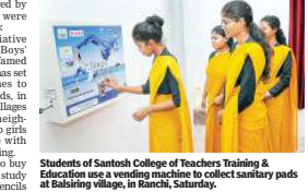
Students of Santosh College of Teachers Training & Education use a vending machine to collect sanitary pads at Balsingh village, in Ranchi, Saturday.